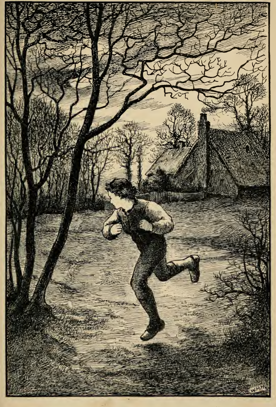
"The Boy darted away for the Abbey." Univ Calif - Digitized by Microsoft Page 92.