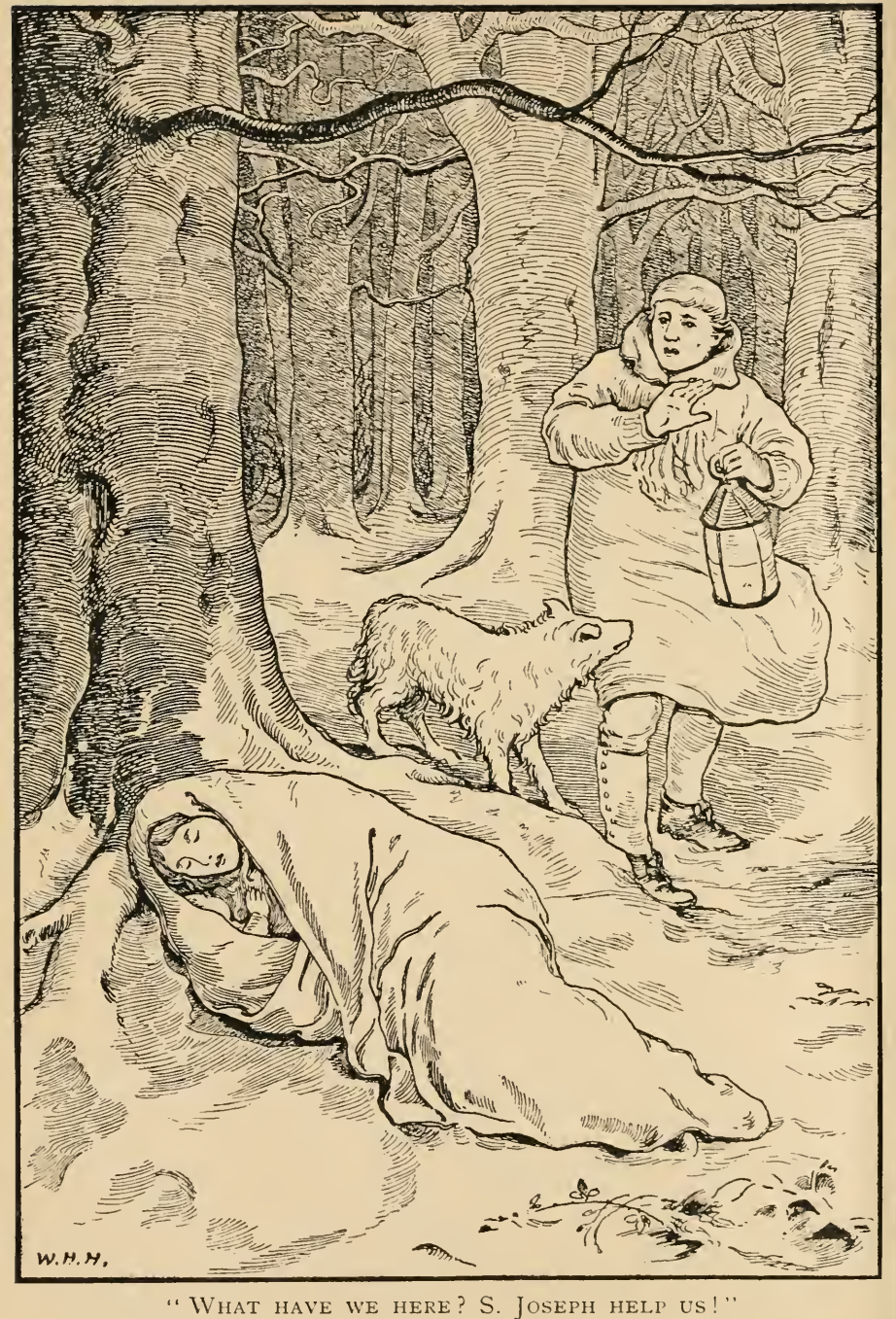
What have we here? S. Joseph help us!" 3.