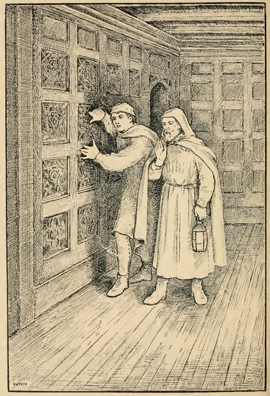
"He pressed the centre of the bud sharply with his thumb." Univ Calif - Digitized by Microsoft Page 239.