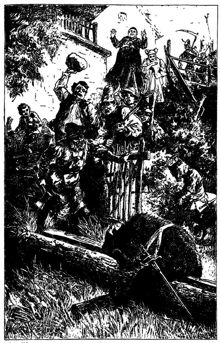
(099. p. 40) BROWN THE BEAR CAUGHT IN THE LOG --- Wagner.