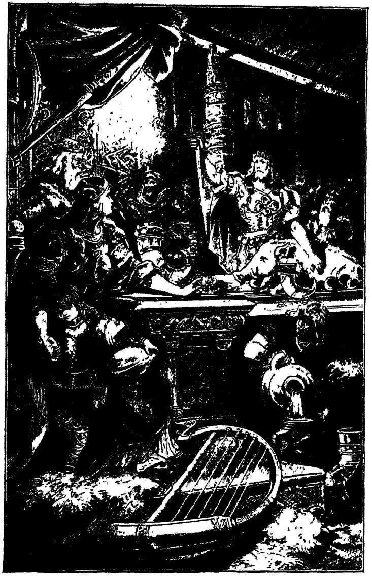
(1992, p. 294) FRITHIOF AT THE COURT OF KING RING -- Kepler.