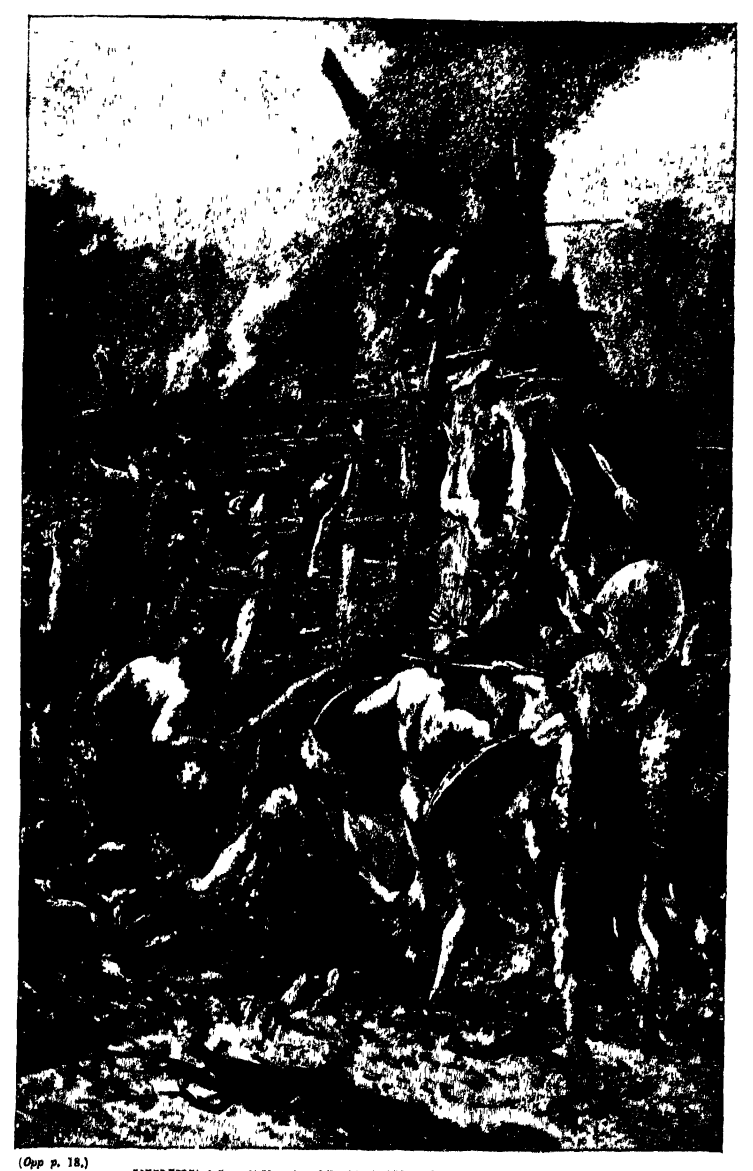
", FUNERAL OF A NORTHERN CHIEF. - Cormon.