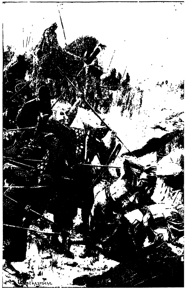
THE CID'S LAST VICTORY - Rochegrosse.