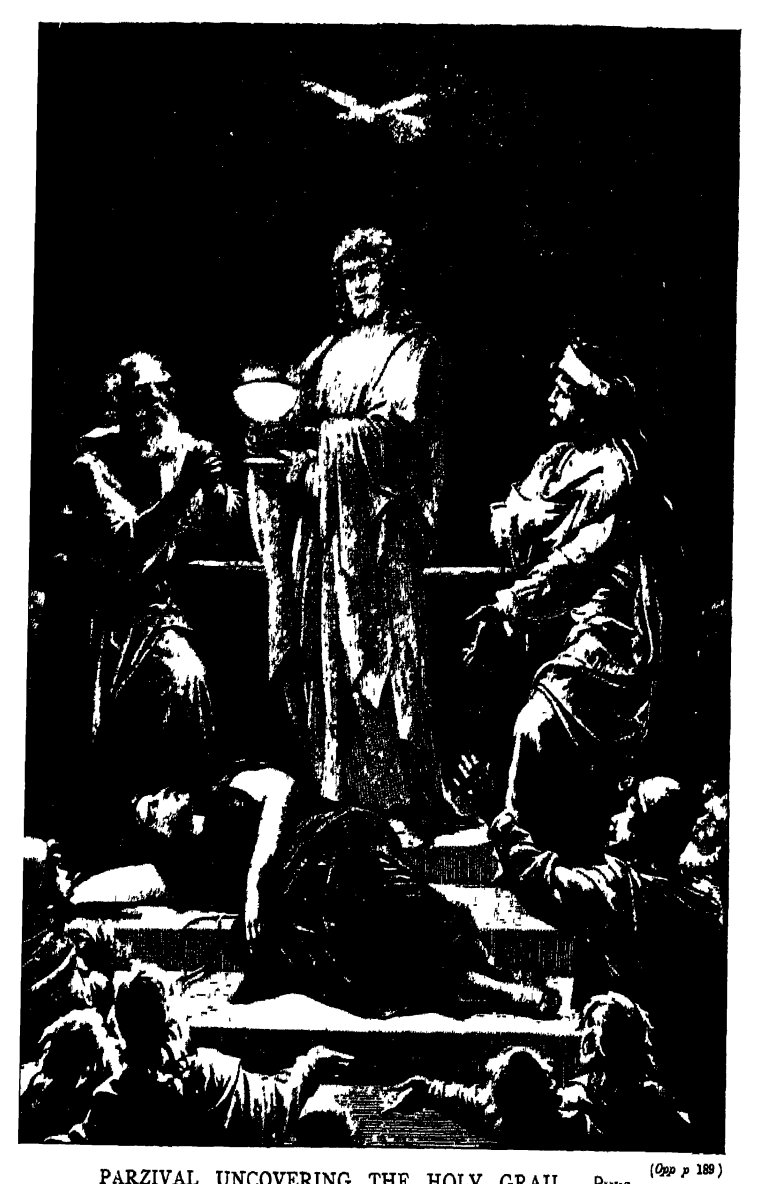
PARZIVAL UNCOVERING THE HOLY GRAIL -- PIXIS