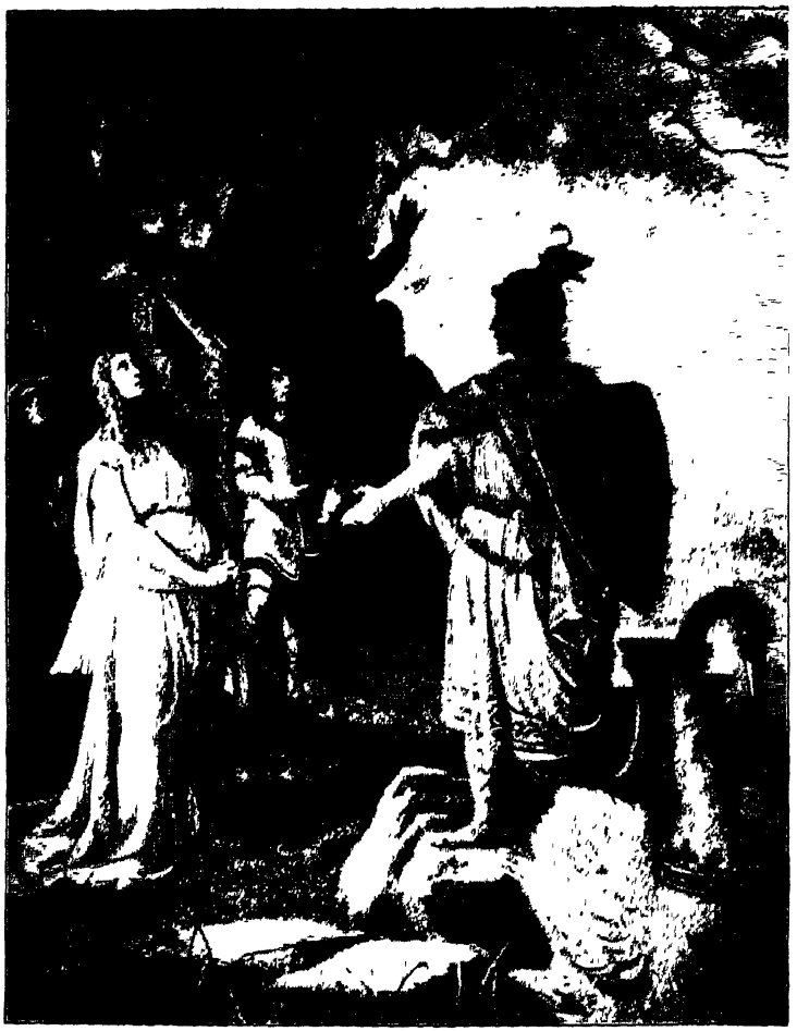
ARRIVAL OF LOHENGRIN. - PINS.