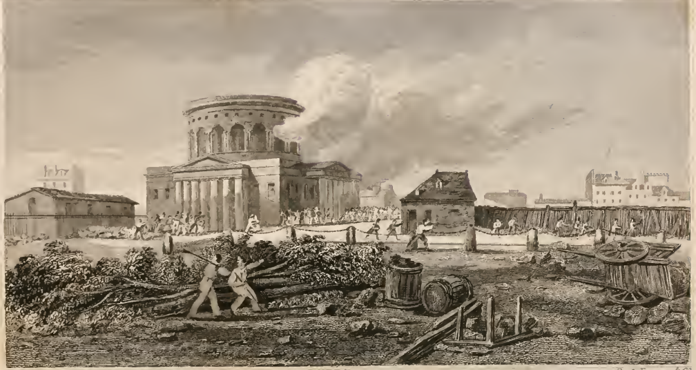
Engraved by BARRIÈRE ST MARTIN, 28. JULY 1836