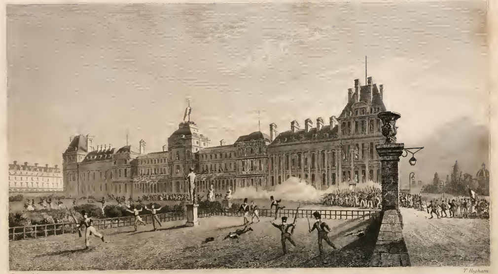
Figure 1 by TULLERIES, - GARDEN FRONT-