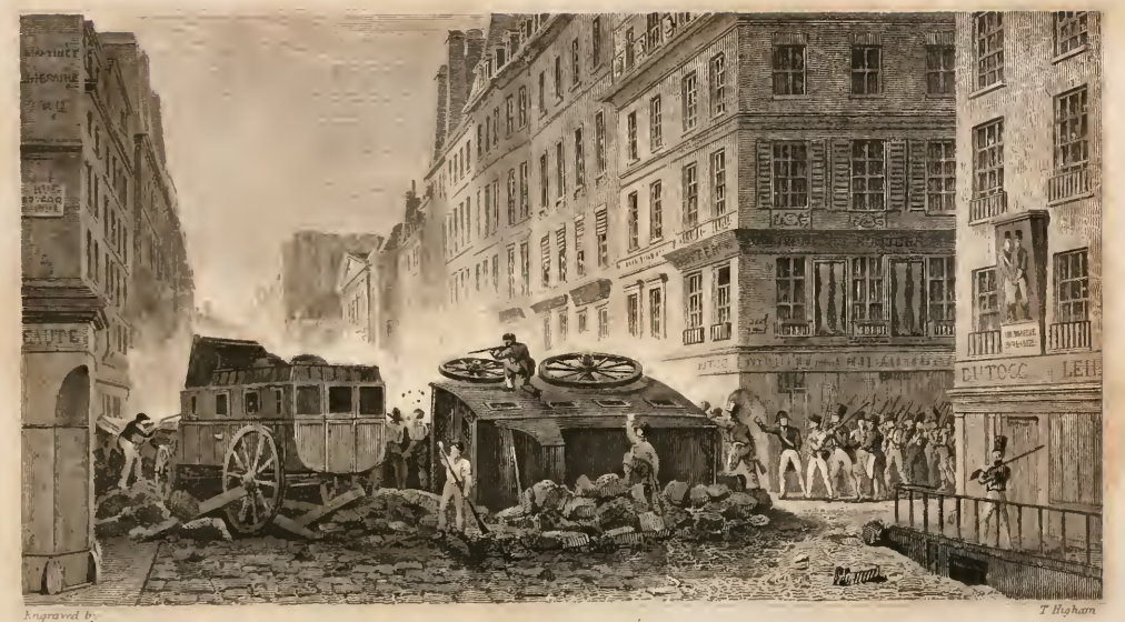
RUE ST HONORE CORNER OF RUE DU COQ