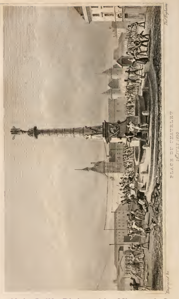
Univ Calif - Digitized by Microsoft ®