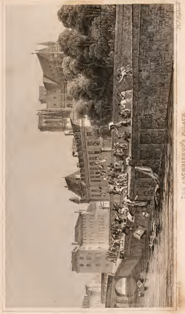
Univ Calif - Digitized by Microsoft ®