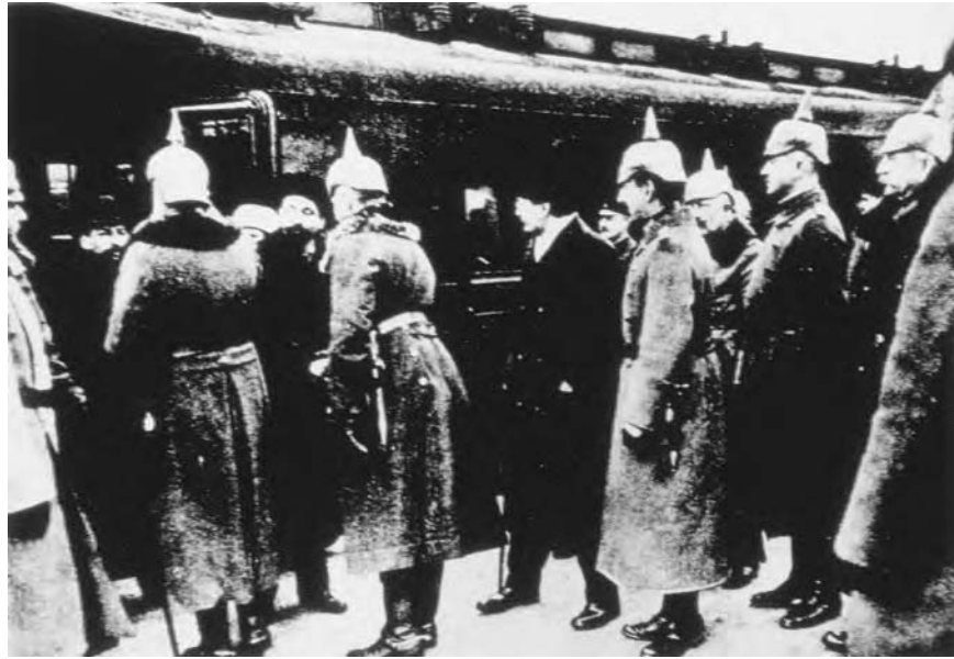
The Soviet delegation arrives at Brest-Litovsk. Lev Trotsky is in the center surrounded by German officers.

day, 28 January (10 February). With representatives of the Central Powers seemingly lulled into believing that Russia was about to capitulate, Trotsky dropped his “bombshell.” He announced that, although Russia declined to sign a formal peace treaty, it considered its state of war with Germany, Austria-Hungary, Bulgaria, and Turkey at an end and was demobilizing its forces. 66