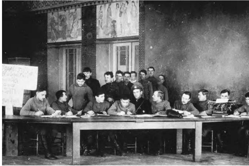
Red Army recruitment center.

off residents [ obivateli ] was interpreted as “cowardly.” This report concluded that “life was proceeding normally—there were no signs of either panic or counterrevolutionary activity.” 42