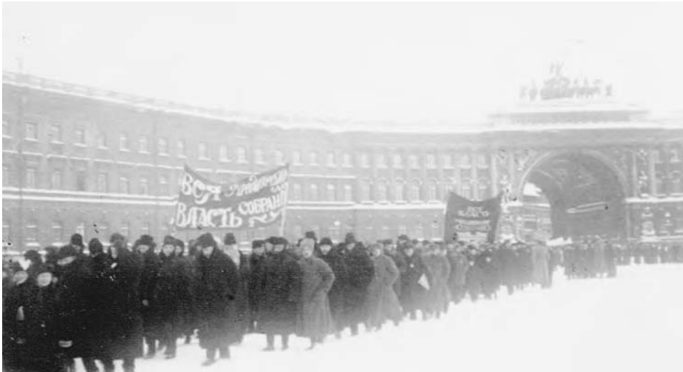
Demonstrators supporting the Constituent Assembly on Palace Square, 5 January 1918.

behind a barricade at the corner of Liteinyi and Shpalernaia, cocked their rifles, and ordered some two hundred demonstrators from the Vyborg district who had just crossed the Neva to turn back. Yet, with scarcely a pause, they fired shots into the air scattering them. Seizing the demonstrators' banners, they ripped them from their sticks and tossed them on bonfires or off the Liteinyi bridge. 6 Count Louis de Robien, the French military attaché, watched as the banners fluttered "on to the glittering, frozen surface of the Neva, like great scarlet butterflies." 7 The leading Futurist writer Victor Shklovskii later saw yardmen ( dvorniki ) using the sticks as broom handles. 8 The demonstrators' conscious retention of such revolutionary symbols as red banners, on the one hand, and the spontaneous, triumphant appropriation of these banners by guardians of Soviet power, on the other, figured prominently in the major clashes in Petrograd on 5 January 1918.