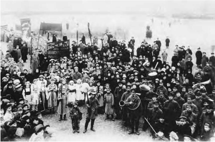
Children of the poor celebrate the first anniversary of the October revolution, 9 November 1918. State Museum of the Political History of Russia, St. Petersburg.