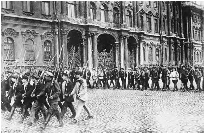
Volodarskii lying in state at the Taurida Palace. State Museum of the Political History of Russia, St. Petersburg.

most workers in neighboring factories and increased the danger of mob violence. 4