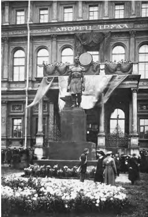
Dedication of monument, “The Metal Worker,” at ceremonial opening of the Palace of Labor, 8 March 1918.

Union Council, was given the floor. Earlier, as the oldest revolutionary present, he had been invited to join the presidium. The festival organizers undoubtedly were wary about what he might say and his remarks were given only passing mention in A Year of Proletarian Revolution . The stenographic account reveals that he was as independent-minded as ever. Rejecting Lunacharskii’s hyperbole, he attempted to moderate what seemed to him to be wildly misplaced optimism regarding the development of revolutions abroad. Declaring that it was necessary to look truth in the eye, even during the celebration of “October,” he insisted that, just as Left Communists had predicted, the capitulation at Brest had delayed eruption of a “real international revolution.” Thanks to Germany’s defeat, the shameful peace had been annulled. However, the triumph of Allied imperialism had created more dangerous conditions than ever. With as much certainty as Lenin, Riazanov took it for granted that the victorious Allies would soon seek to stifle the Russian revolution. For Red Petrograd, there was no alternative to resistance at any price. On the other hand, if “the cradle of the revolution” found the will to defend itself, in tandem with the Austrian and German