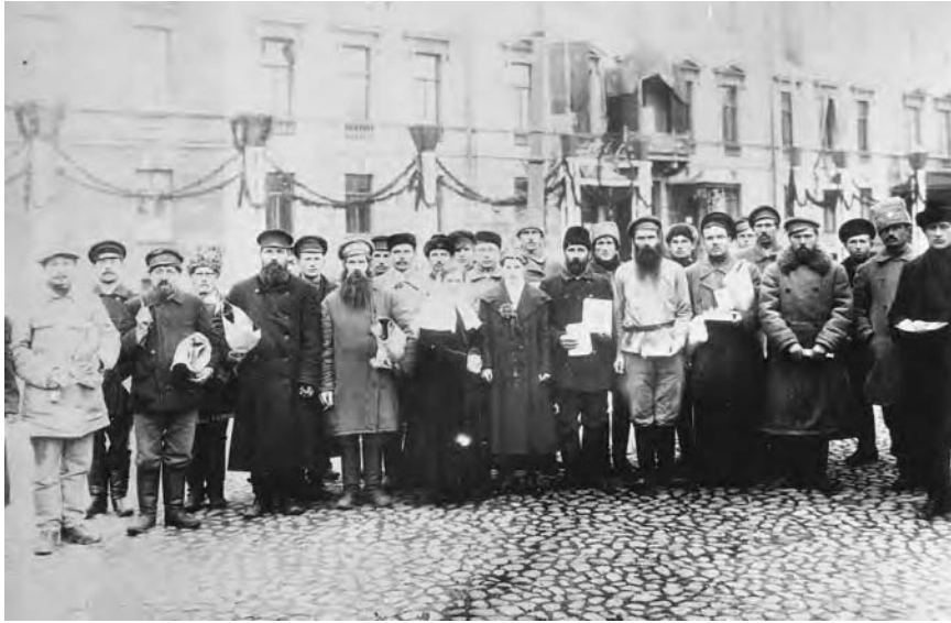
Representatives of Committees of the Village Poor in Petrograd during a celebration of the first anniversary of the October revolution.

of Committees of the Village Poor, even after allowance is made for huge population losses in the preceding year.