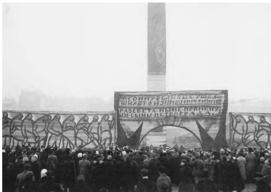
Celebrants at the Field of Mars, 7 November 1918. Krasnyi Petrograd , 1919.

in central Europe, ignored the Bolshevik festival altogether. If one were to judge by A Year of Proletarian Revolution , the turnout on 7 November exceeded all expectations (and the same was also true the next day). Among opponents of Soviet power, an announcement in the Soviet press the evening of 6 November that the Germans had broken relations with the Soviet government, 85 allegedly because it was behind revolutionary eruptions in Germany and had not punished Mirbach's killers, gave rise to rumors that German forces would finally occupy Petrograd and stifle Bolshevism. Along with fear of being attacked by revelers, this prospect seems to have kept such observant anti-Soviet notables as Zinaida Gippius off the streets during the holiday. From her windows on Sergievskaiia Street near the Uritskii (Taurida) Palace, she could see "long red calico rags and a gigantic portrait of a disheveled Marx" hanging on the fence surrounding the palace gardens and could hear the blaring horns of marchers on their way to Smolny but could not see them. 86 Still, there is little reason to doubt the large number of participants, mobilized by a mixture of carrots and sticks, energized by Germany's imminent surrender and the eruption of social revolutions in Central Europe, and bolstered by many thousands of guests from the provinces, military personnel, and peasant-delegates to the Northern Oblast Congress