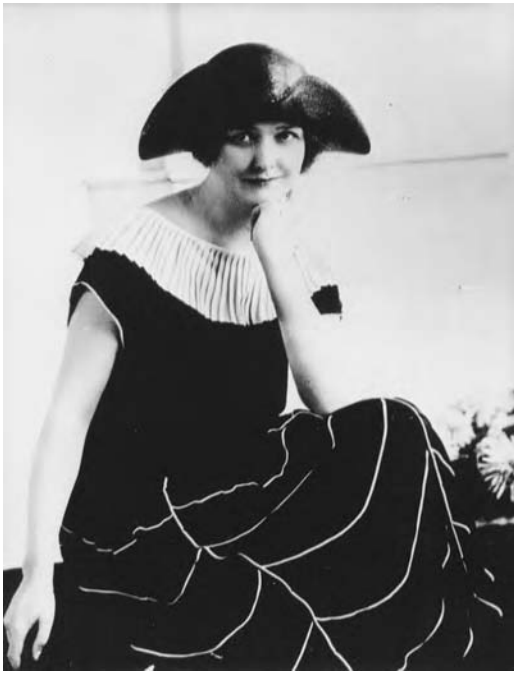
Moura Benckendorff in 1918.