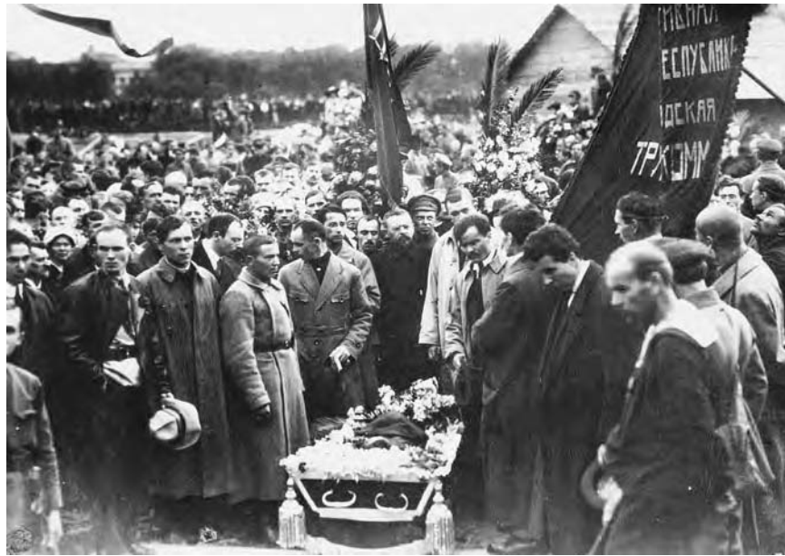
Uritskii's funeral, 1 September 1918. Zinoviev is standing second from right. Molotov is fourth from right wearing a raincoat.