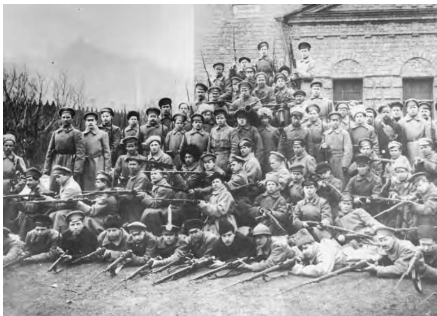
A detachment of worker Red Guards poses for a photograph before departing for the front.

The total number of recorded Red Army recruits in these six districts for the three-day reporting period (23–26 February) was 10,320—not an especially impressive figure given the apparent immediacy of the enemy threat to Petrograd. However, this may not be the whole story. Available evidence suggests that even factory workers willing to fight preferred to enroll in ad hoc partisan detachments organized at their factories or by labor organizations rather than accept the longer-term, more rigorous obligations entailed by Red Army enlistment. 46 Moreover, Red Army recruitment figures did not include new members of Left SR combat squads.