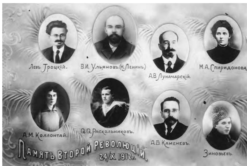
Postcard depicting heroes of the October revolution in Petrograd. Top row: L. D. Trotsky, V. I. Lenin, A. V. Lunacharskii, M. A. Spiridonova; bottom row: A. M. Kollontai, F. F. Ras-kolnikov, L. B. Kamenev, and G. I. Zinoviev.