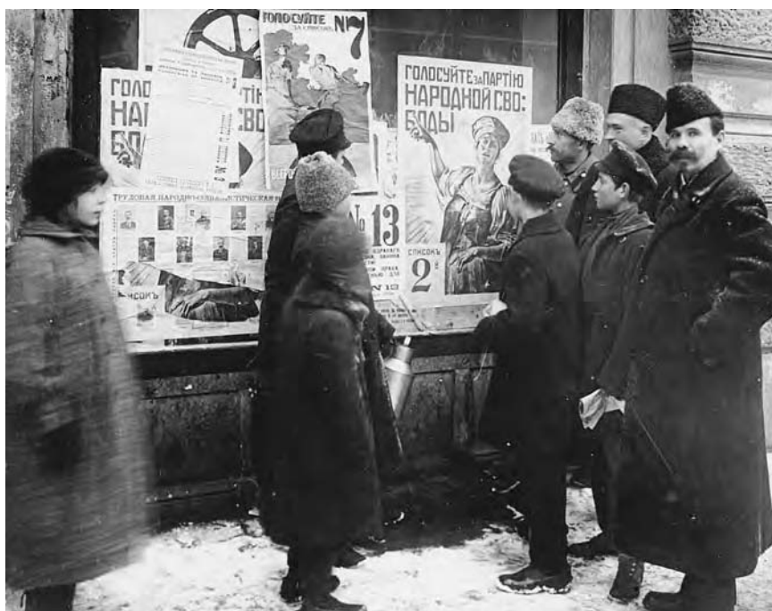
Petrograders examine campaign posters for elections to the Constituent Assembly.

their promises. Moreover, they threatened to disperse the Constituent Assembly if it differed from what they wanted. 40 Nobody should vote for the Kadets because they had shown that they were not revolutionaries, genuine democrats, or even reliable republicans. Instead of an early democratic peace without victors or vanquished, the Kadet ideal was still a victorious end to the war. For them, any system in which things went well for the classes that were privileged and dominant before the revolution was good. 41