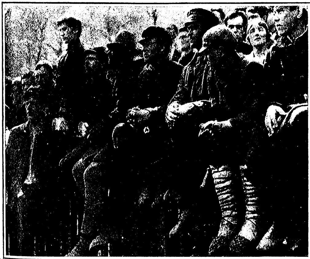
A crowd, mostly of workers, listening to a speech in the Red Square, Moscow, in the Spring of 1927. The young man wearing the lapti (sandals) and the wrappings, something like puttees, around his legs, is a peasant type