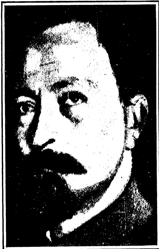
FELIX EDMUNDOVICH DZERZHINSKY Chairman of the Soviet Supreme Economic Council at his death on July 20, 1926, but better known as the head of the Cheka during the greater part of the Soviet régime

ers." He spoke of the pitiless mass Terror. Even the All-Russian Central Executive Committee at its sitting of Sept. 2 gave "a solemn warning to all slavish followers of the Russian and allied bourgeoisie to the effect that for 'every attack on the active leaders of the Soviet Government all counter-revolutionaries will be held responsible.'" The People's Commissary for the Interior, Petrovsky, sent at one time to all Soviets a telegraphic order "concerning hostages." "Laxness and softness must be immediately brought to an end," he wrote, declaring that "mass execution by shooting should be inexorably dealt out" to these hostages. And the All-Russian Cheka Daily , an organ which was to work out methods of struggle for the Extraordinary Commissions, in its first issue said: "Let us abandon all long, fruitless and futile speeches about the Red Terror. The time has come, not by words but by deeds, to carry on the most pitiless, sternly organized mass terror." Taking into account all such official declarations, it becomes absolutely impossible to agree with the Soviet publicist Radek, who wrote in Izvestiya on