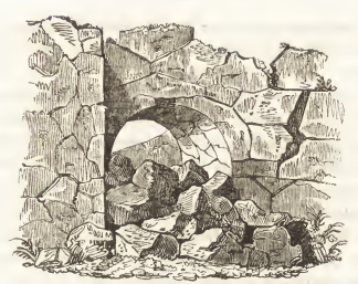
Curious Orecian circular Arch in the Ruins near Camerina.