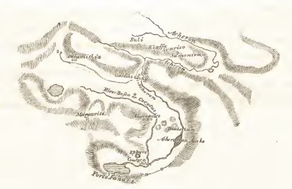
Plain of Paramithia and Course of the Acheron-