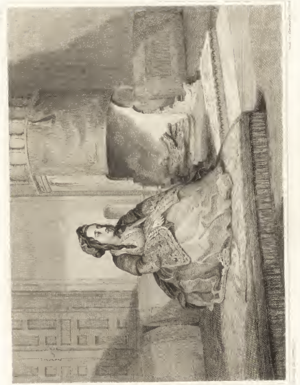
MISTIGIAS OF A GREEK FAMILY SEATED ON THE DIVAN OF THE GYMECKUN