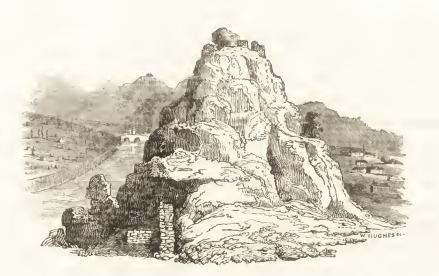
Fortified Rock in the Suburbs of Premiti-Turkish Burial Ground, and Bridge over the Vointee.