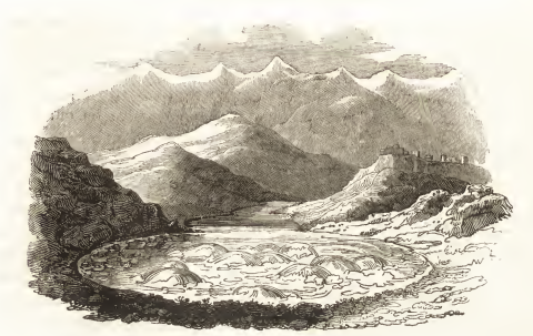
Fountain of Firous and Fort of Schindrisda in the Valley of Argyre-Castra,