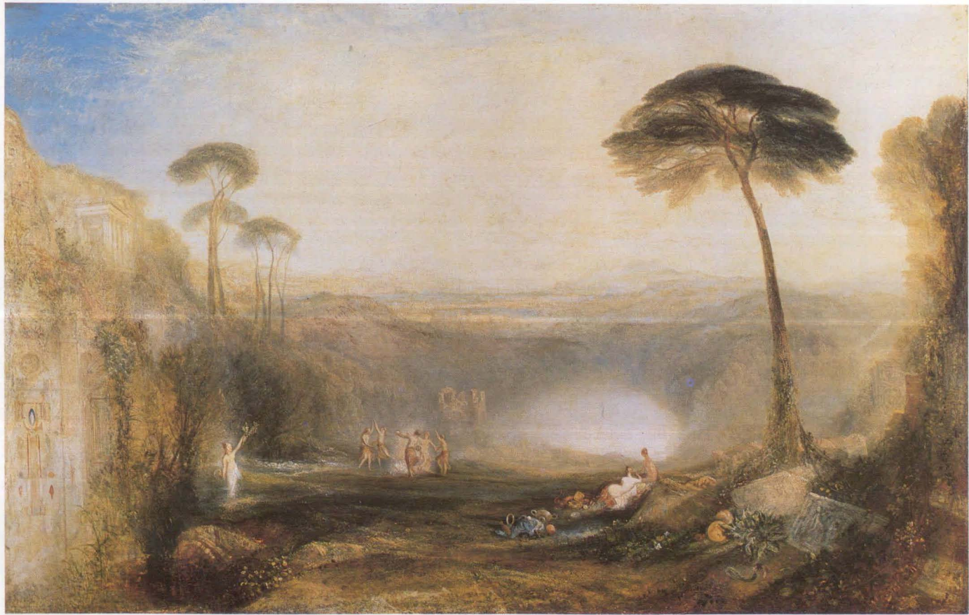
The Golden Bough