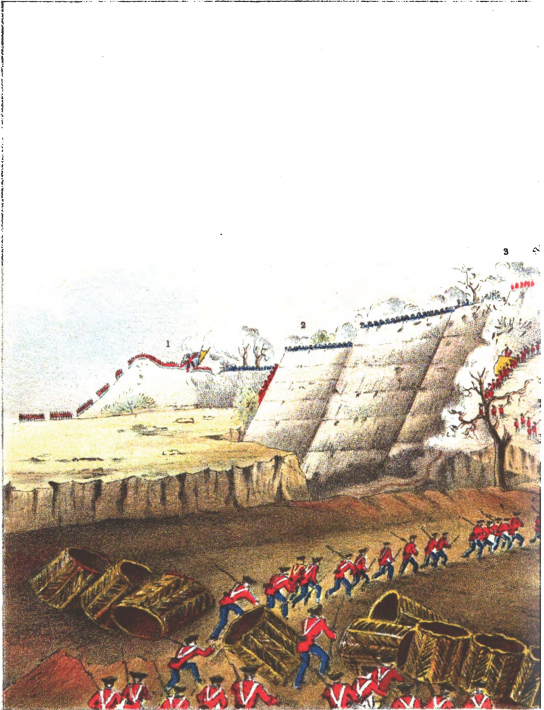
1 Assault on the "long-necked" bastion by General Nicholls' main column.