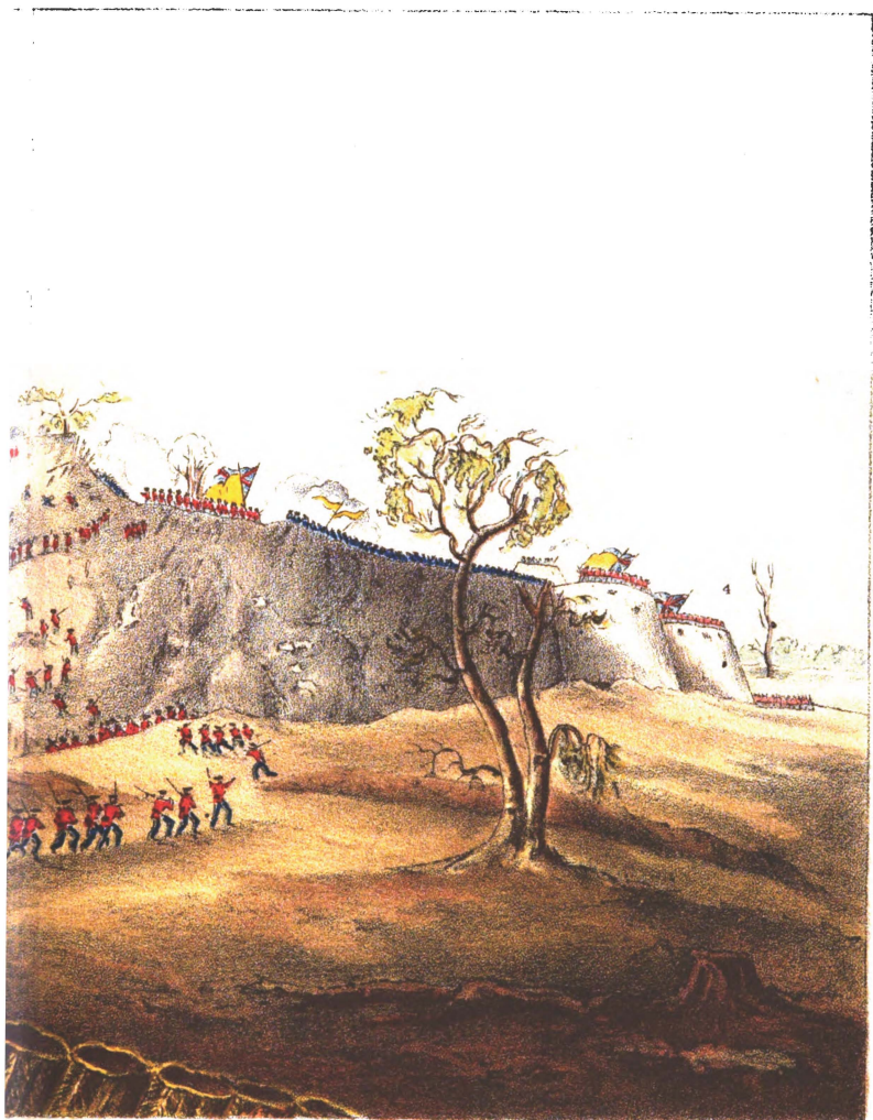
bastion attacked by General Reynell's main column.