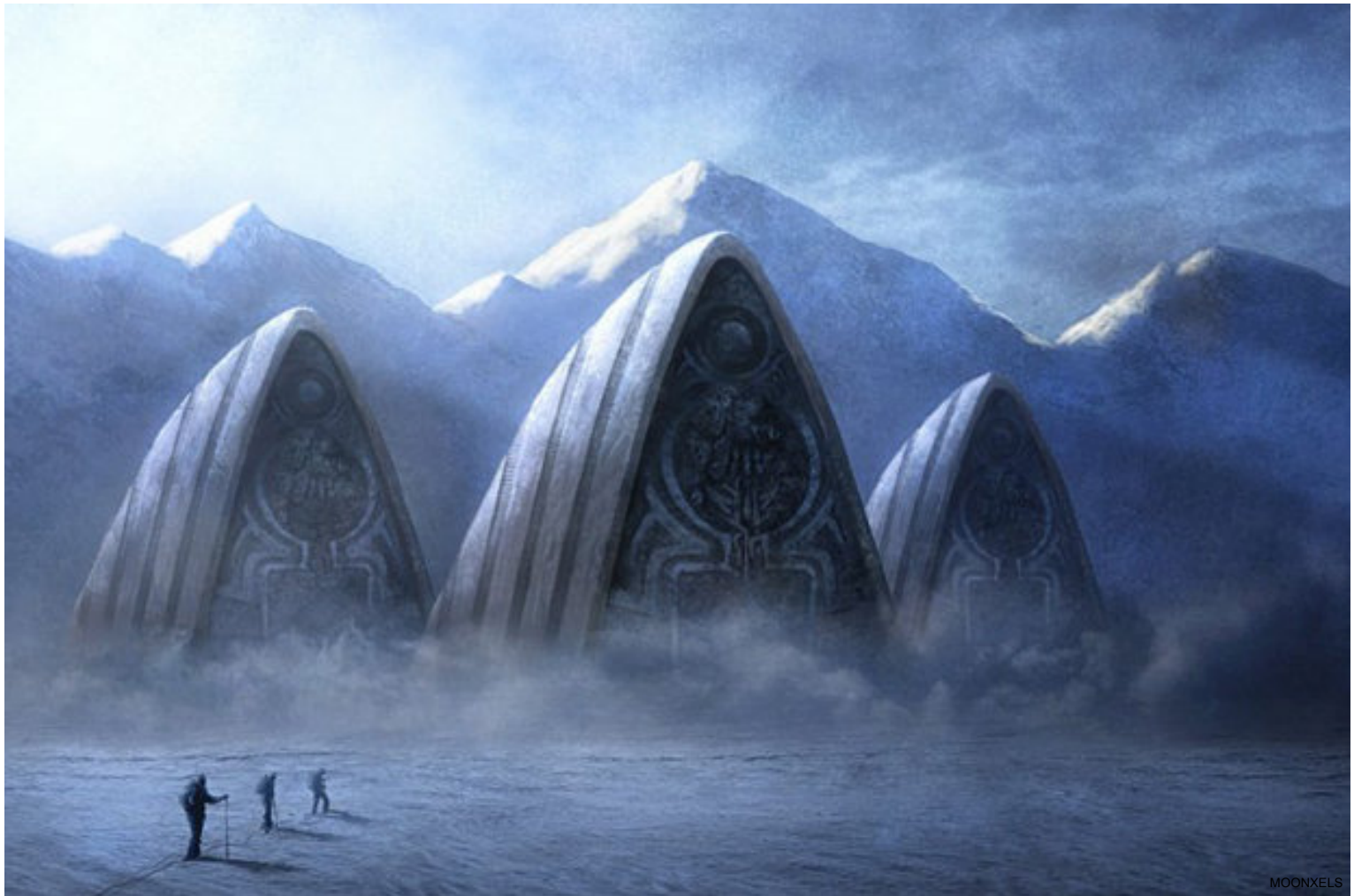
INCREDIBLE: A lost city hidden underneath sheets of ice would be an astounding find