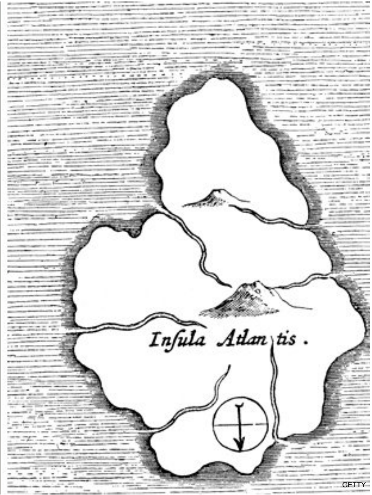
WRITINGS: Ancient Greek philosopher Plato was the first to mention Atlantis in his work