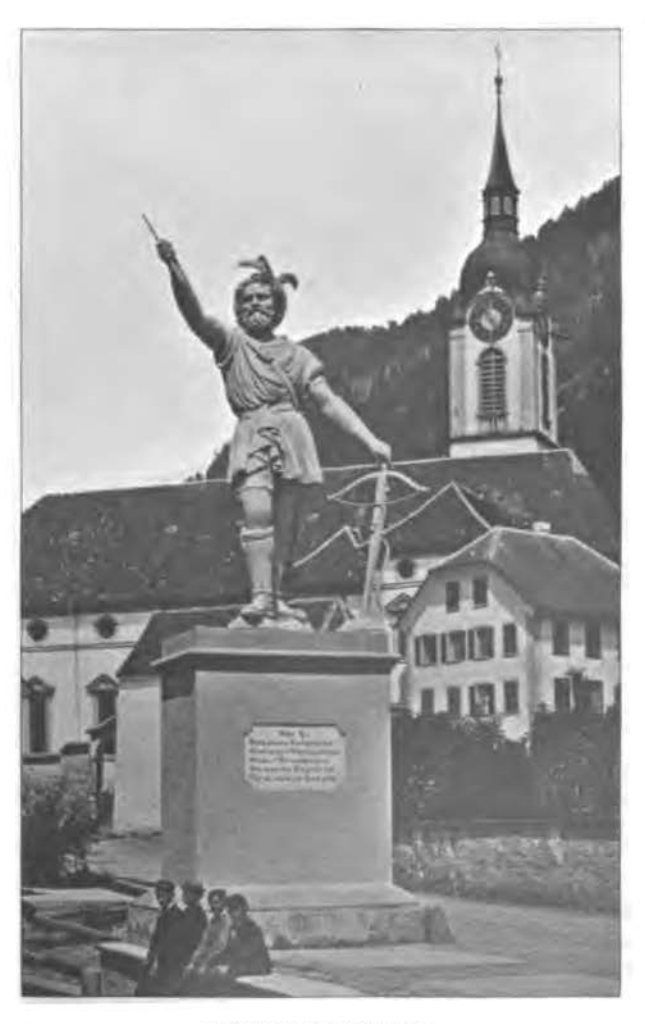
STATUE OF WILLIAM TELL.