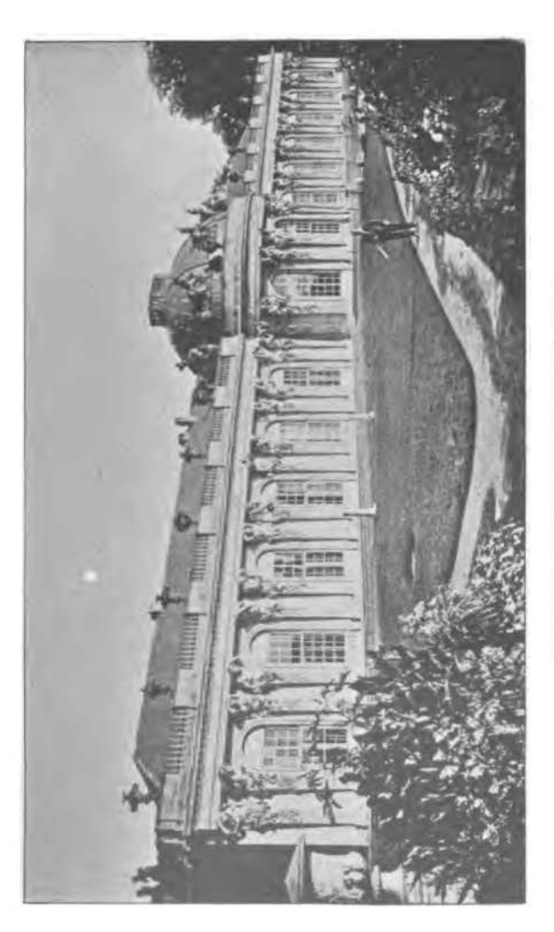
SANS SOUCI, PALACE OF FREDERICK THE GREAT.