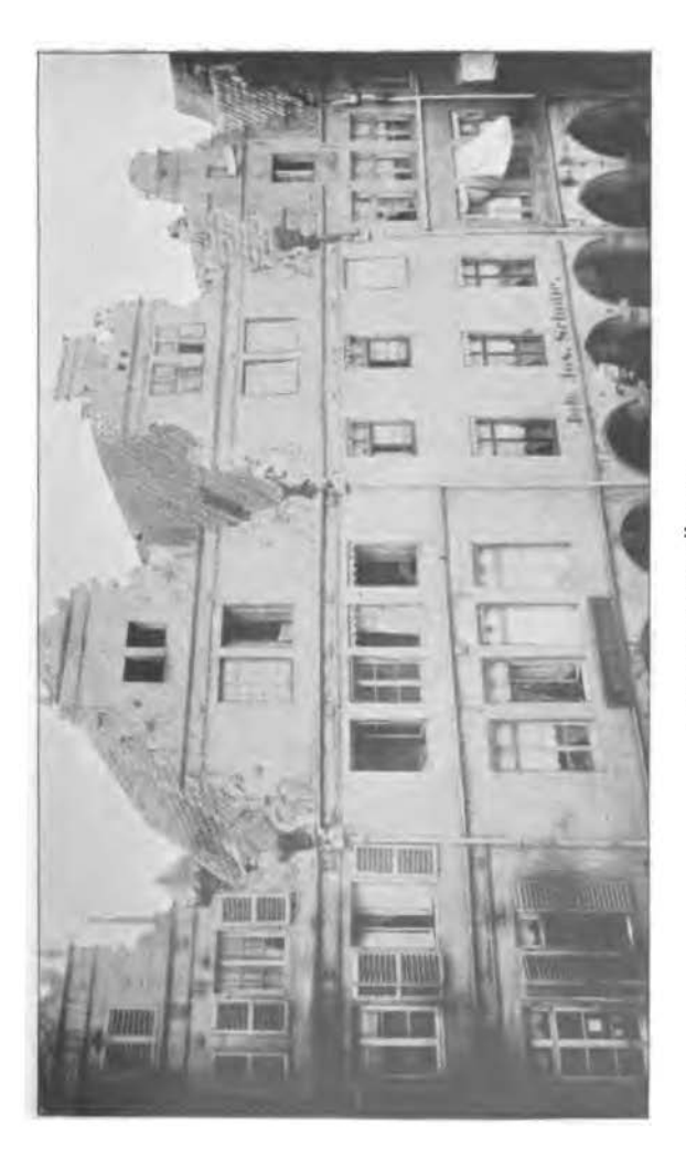
Digitized by Google