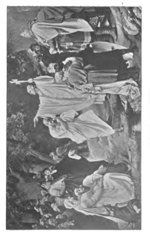
Digitized by Google