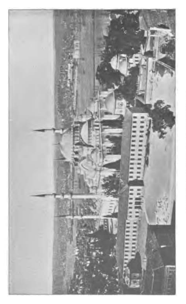
Digitized by Google