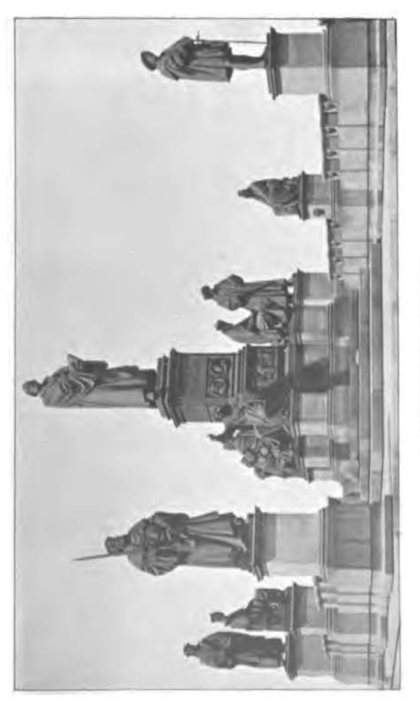
Digitized by Google