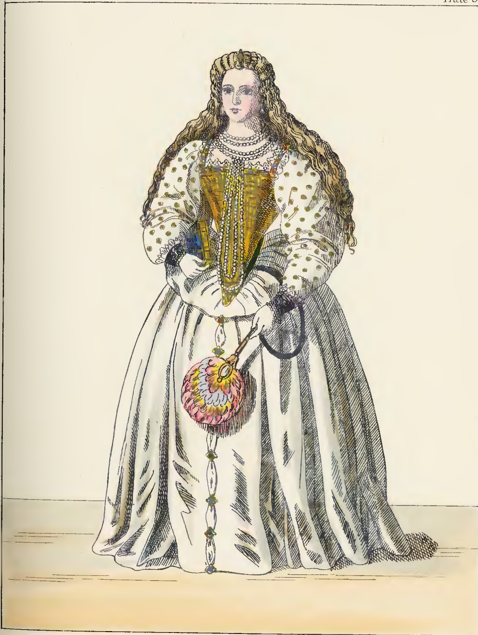
LADY ARABELLA STUART (ENGLAND JAMES.1 ST 1604.)