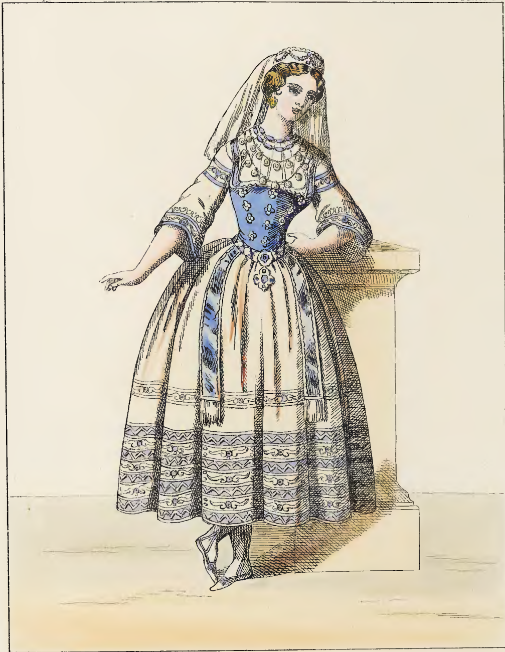
YOUNG LADY OF SWEDEN

Published by TH. LACY, 89, Strand London.