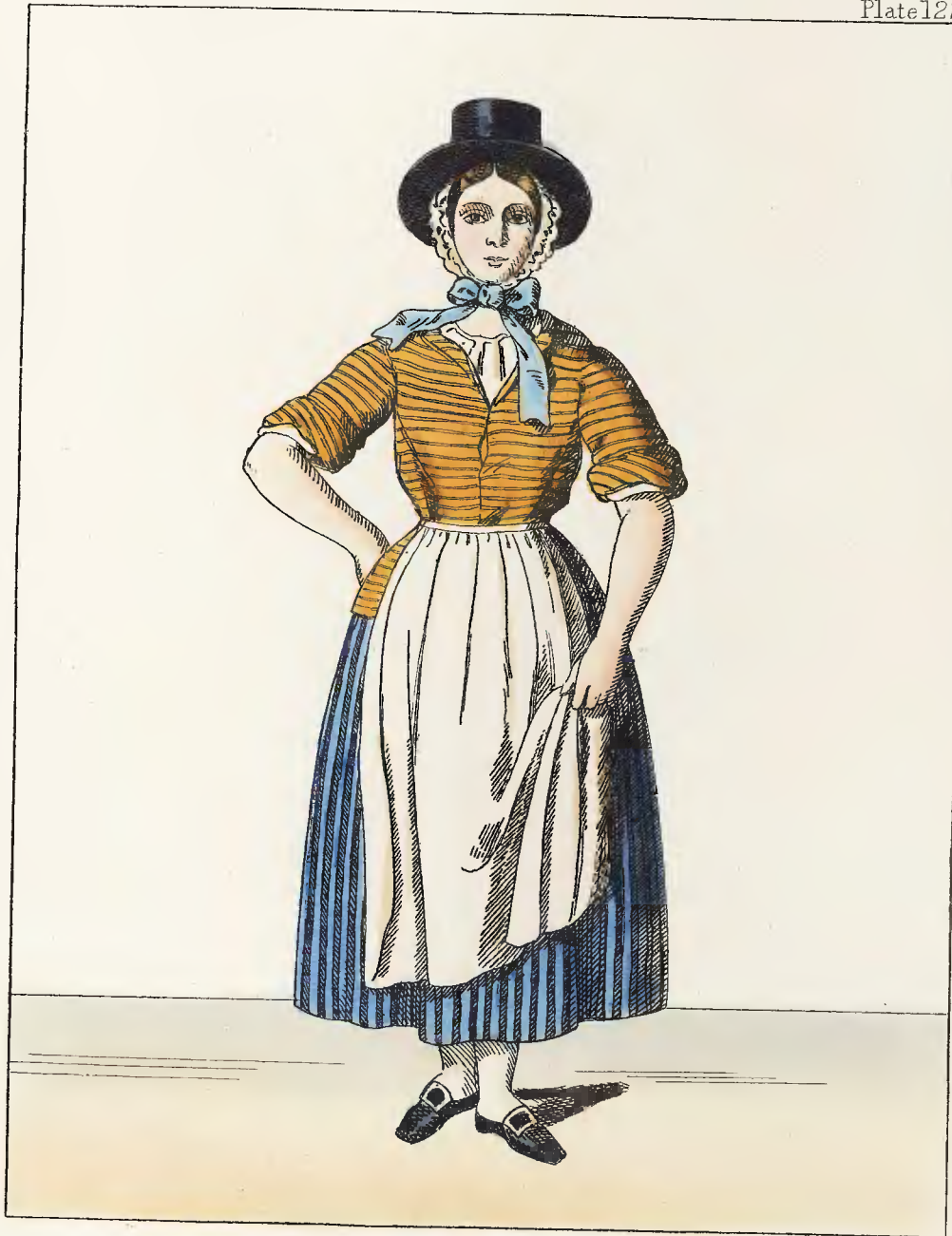
A WELCH GIRL

Published by T. H. LACY 39, Strand, London.