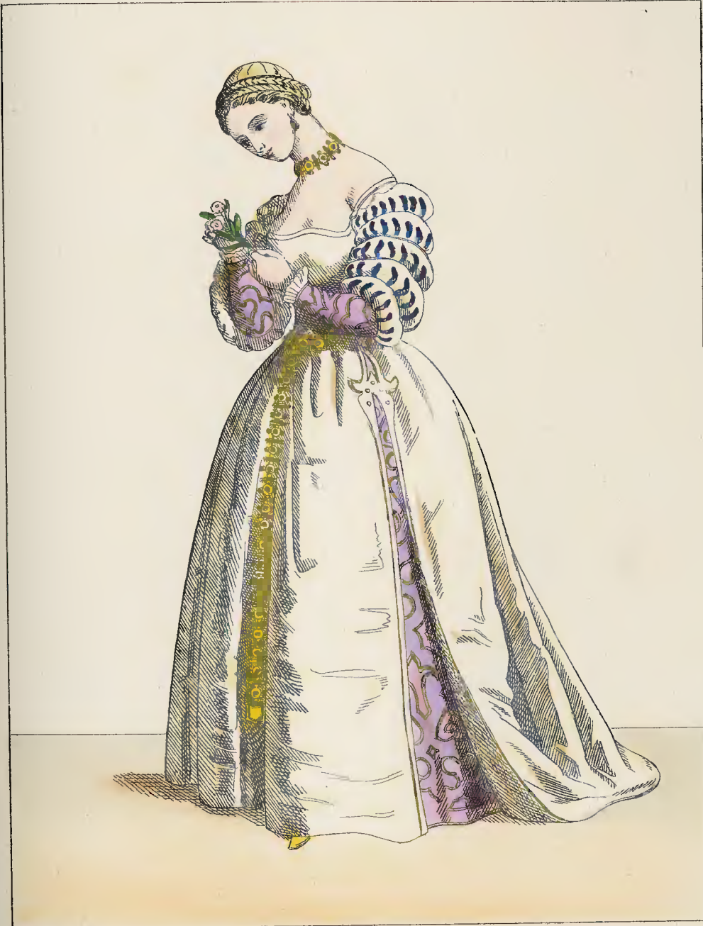
ITALY—LADY OF PADUA—1533.

Published by T.H.LACY 89, Strand, London