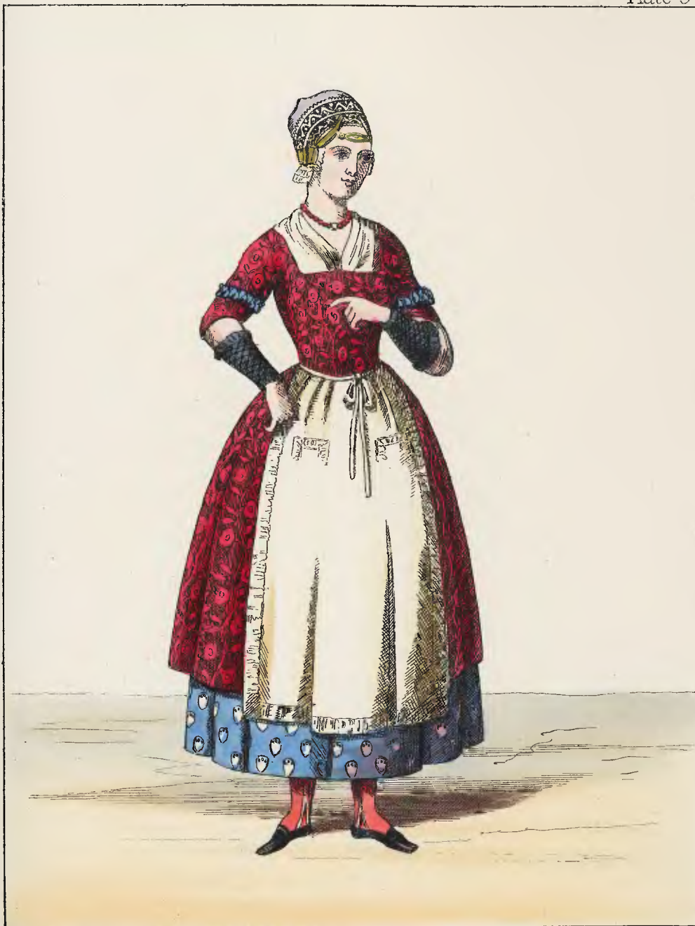
VILLAGE GIRL OF FLANDERS, Period 1820.

Published by T.H. LACY, 89, Strand, London