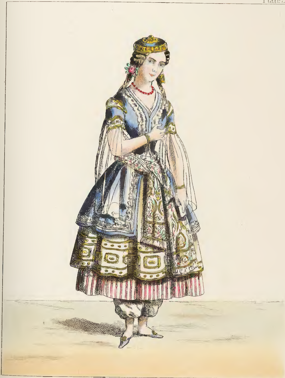
GREEK LADY, (Modern Costume)

Published by T. LACY, 89, Strand, London.