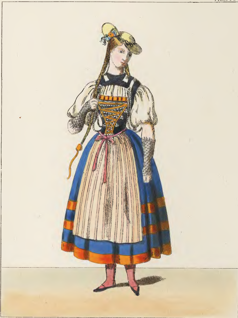
SWISS GIRL OF BERNE.