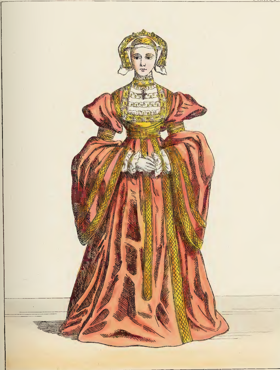
ENGLAND—ANNE OF CLEVES—1540