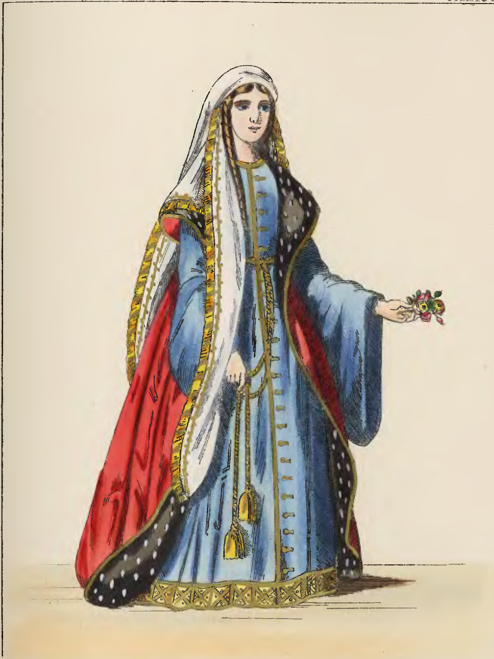
1120 — A LADY OF RANK — Henry 1 st