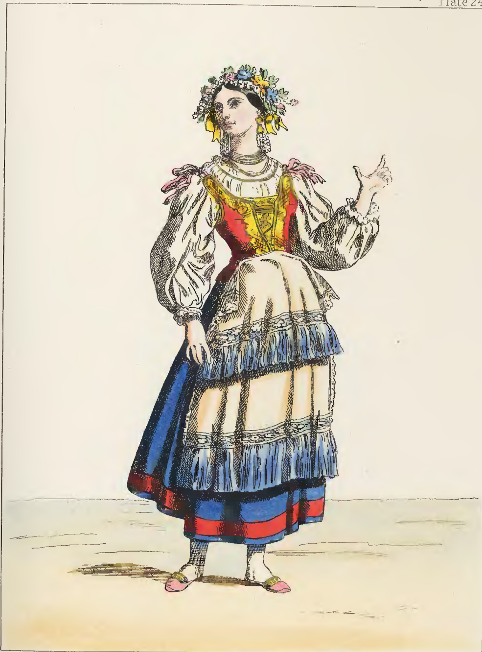
ITALIAN FEMALE (National Costume)

Published by T. LACY, 89, Strand, London.