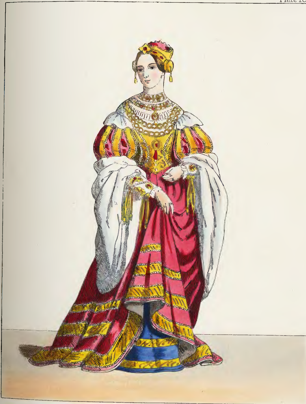
LADY OF RANK—1515,

( England—Henry 7 th —France—Charles 8 th )