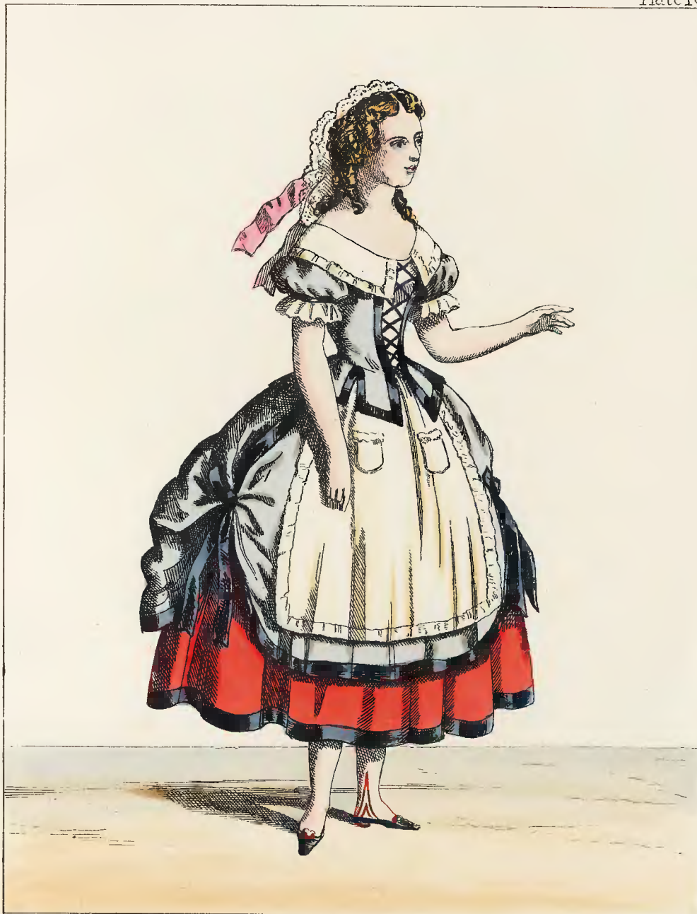
WAITING WOMAN, Period CHARLES 2 nd LOUIS 14 th