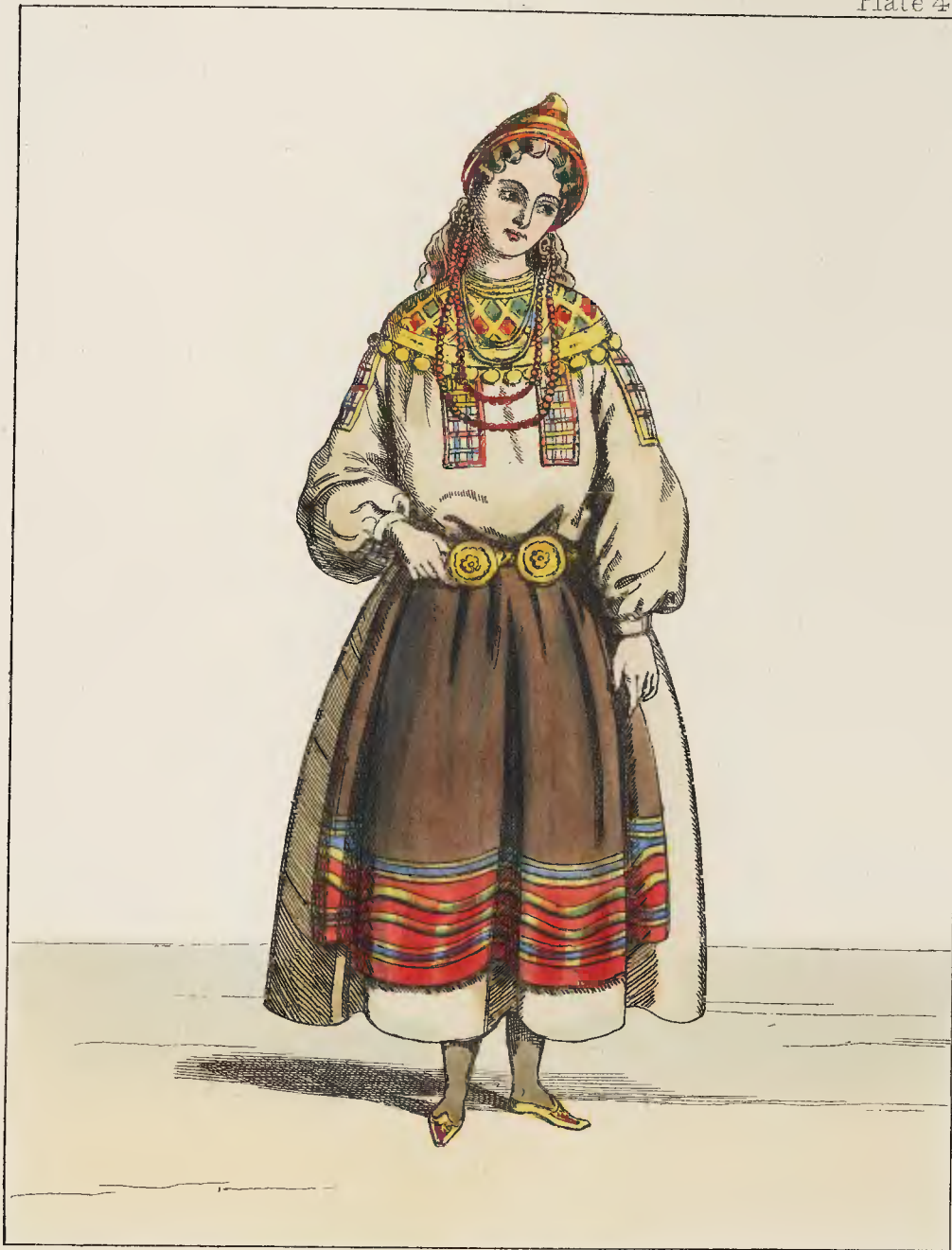
COSSACK GIRL OF THE UKRAINE.

Published by T.H.LACY 89, Strand London.