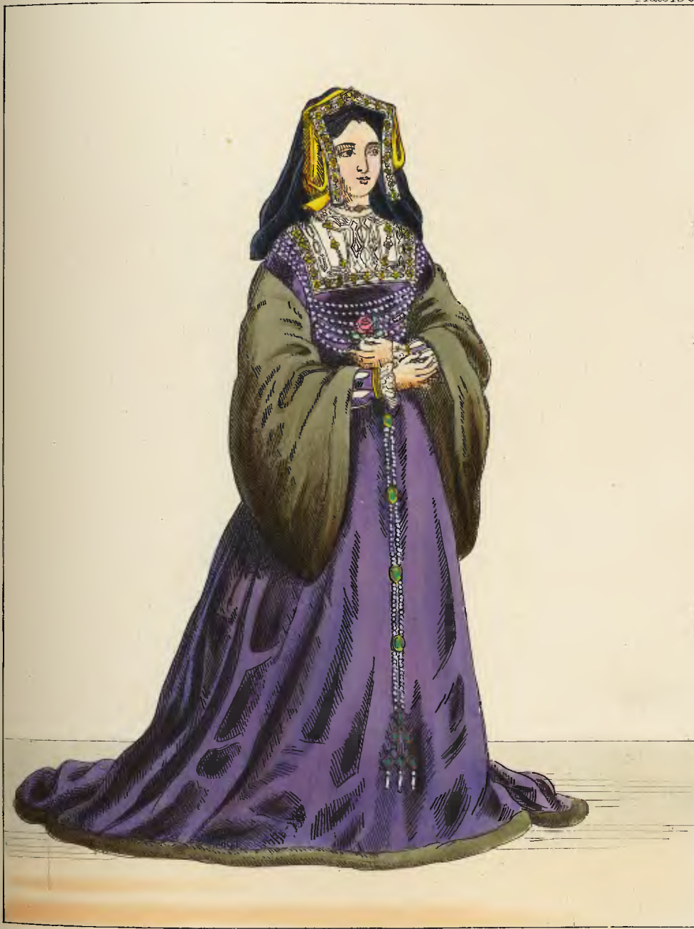
ENGLAND—CATHERINE OF ARRAGON—1532.