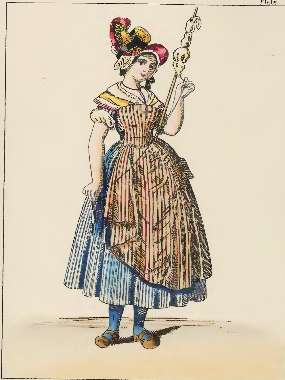
FRANCE—FEMALE OF NEVERS.

Published by T.H.LACY, 89, Strand, London.