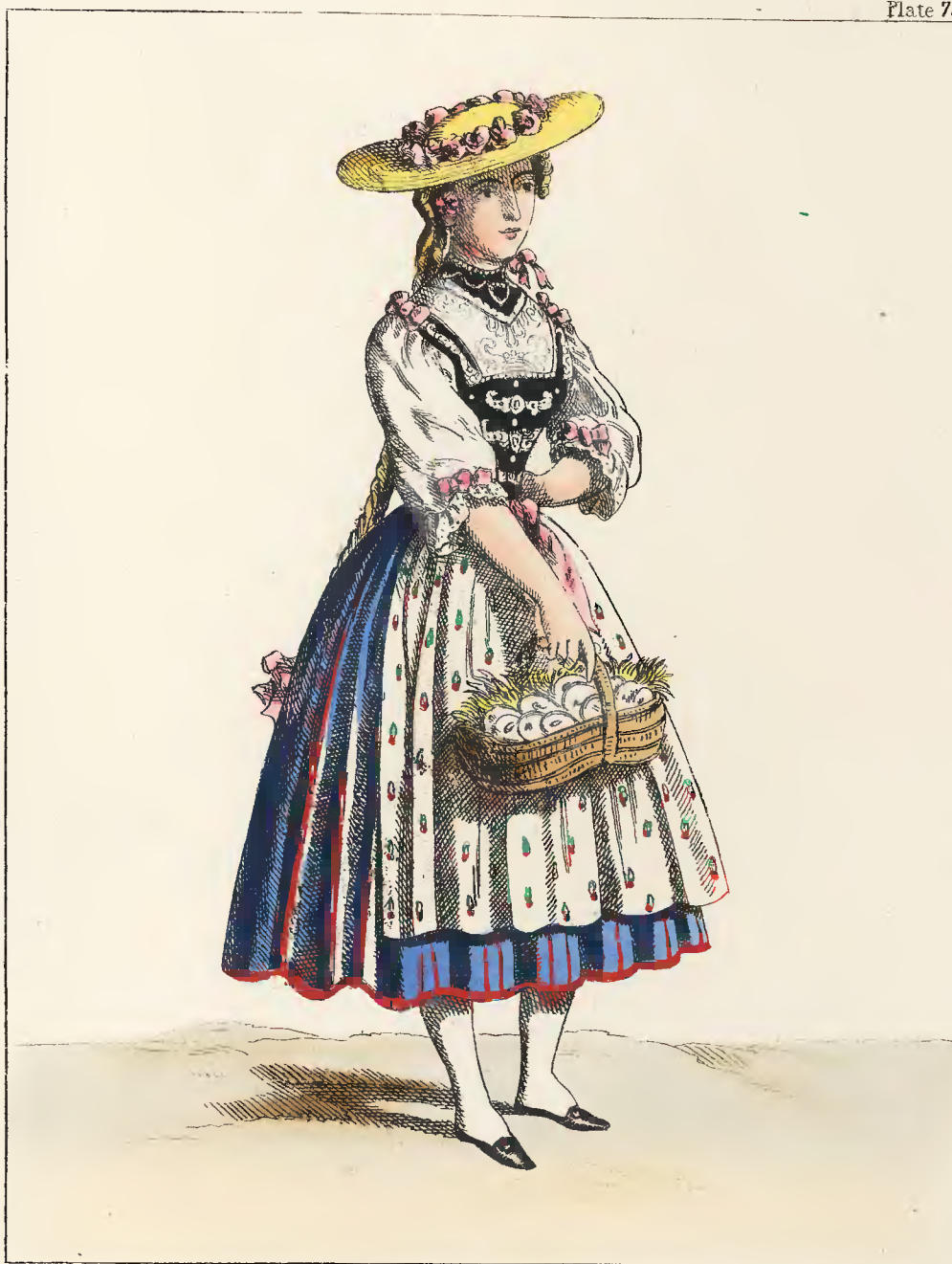
SWITZERLAND—A FEMALE PEASANT