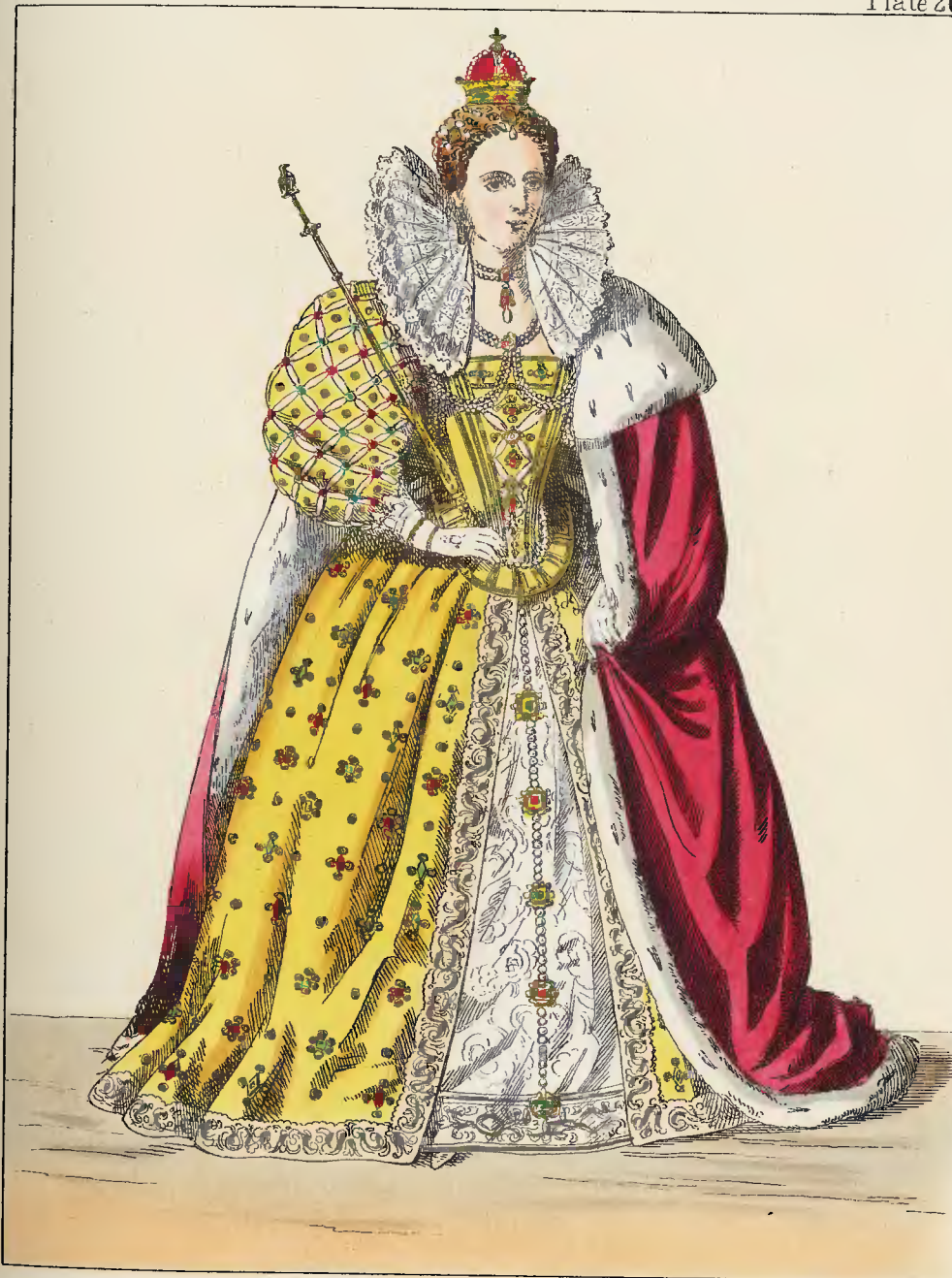
QUEEN ELIZABETH, (Period 1583)

Published by T. LACY, 89, Strand, London.