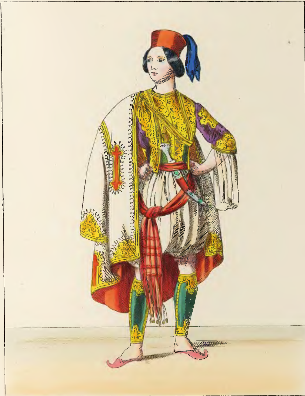
FANCY GREEK COSTUME.

Published by T. LACY, 89, Strand, London.