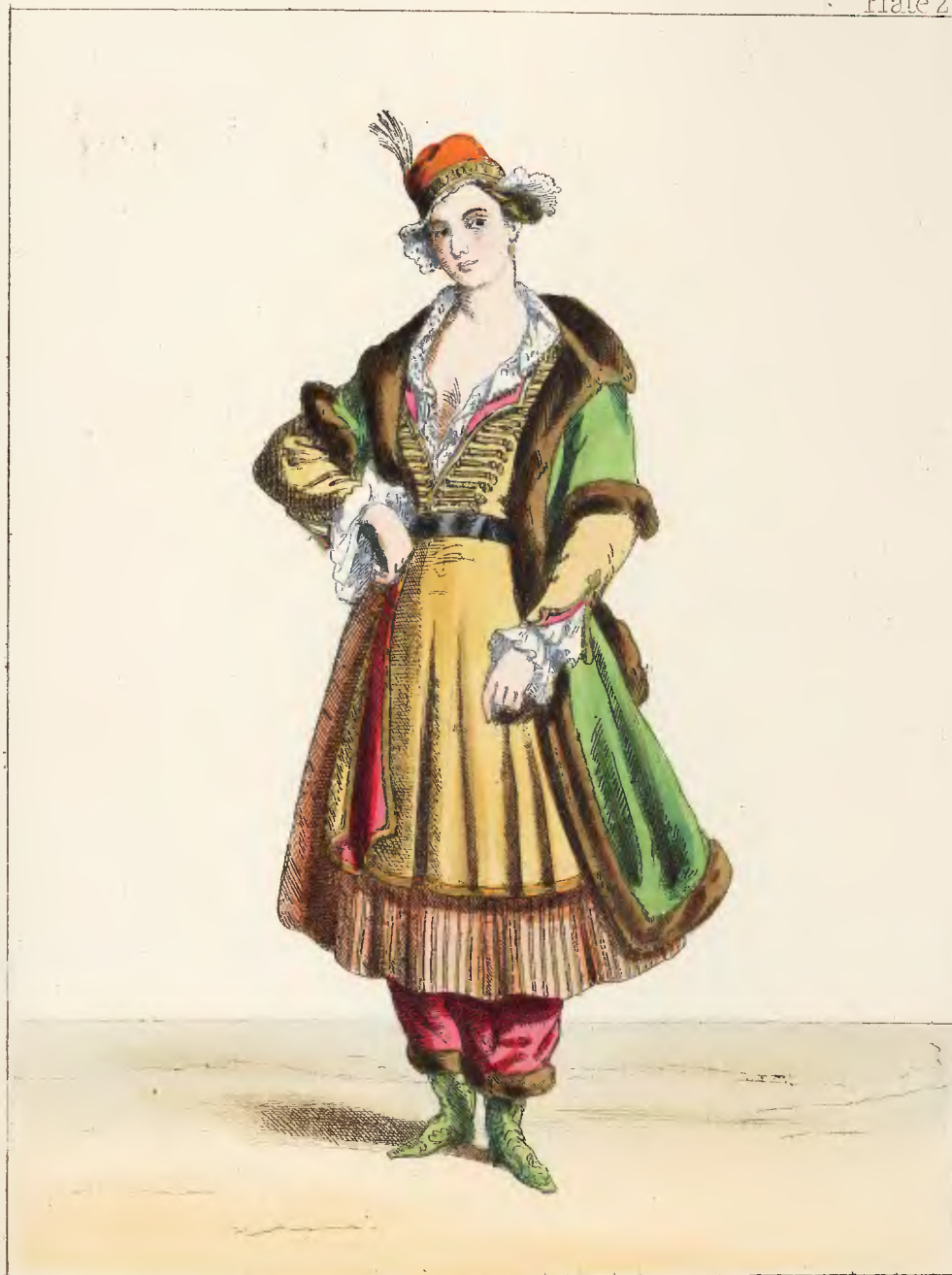
POLISH LADY. (National Costume)

Published by T. LACY, 89, Strand London.