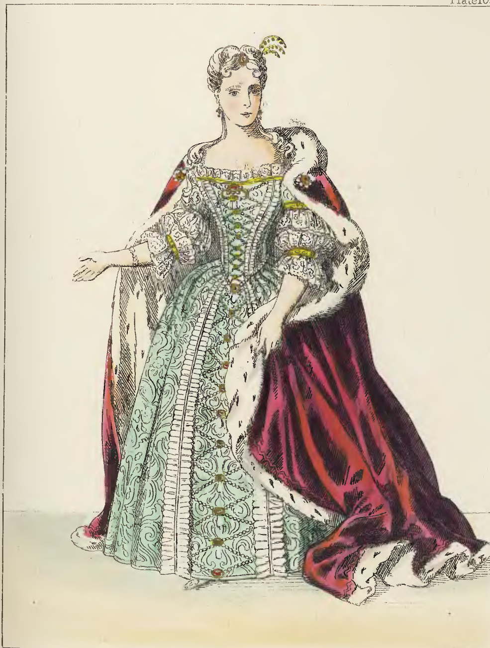
EMPRESS MARIE THÉRÈSE — 1747