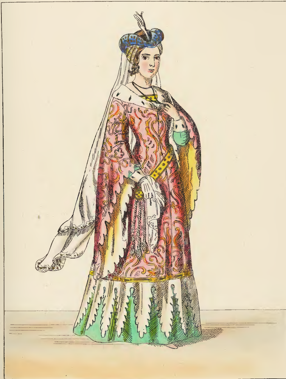
HOLLAND—LADY OF RANK—1380.