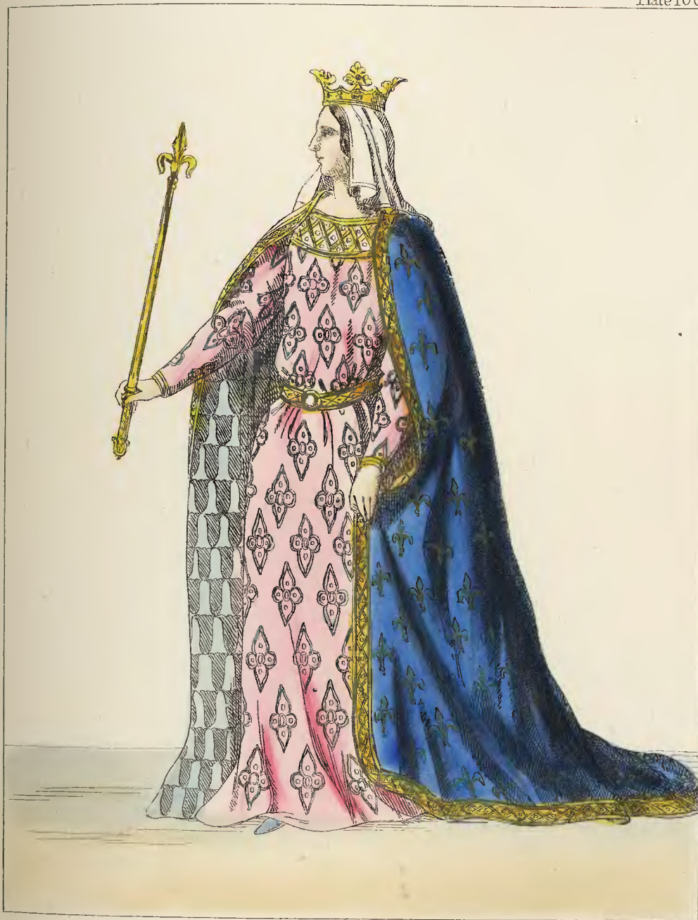
BLANCHE OF CASTILE—1210.

Published by T. H. LACY 89, Strand London.