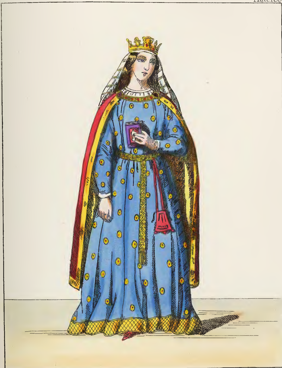
ENGLAND—BERENGARIA QUEEN OF RICHARD 1 st —1195.