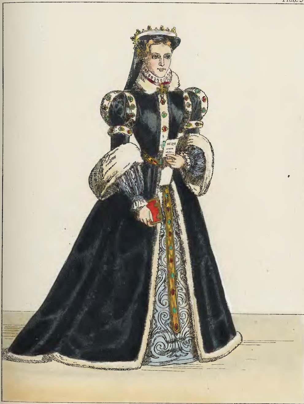
MARY, QUEEN OF ENGLAND—1556.