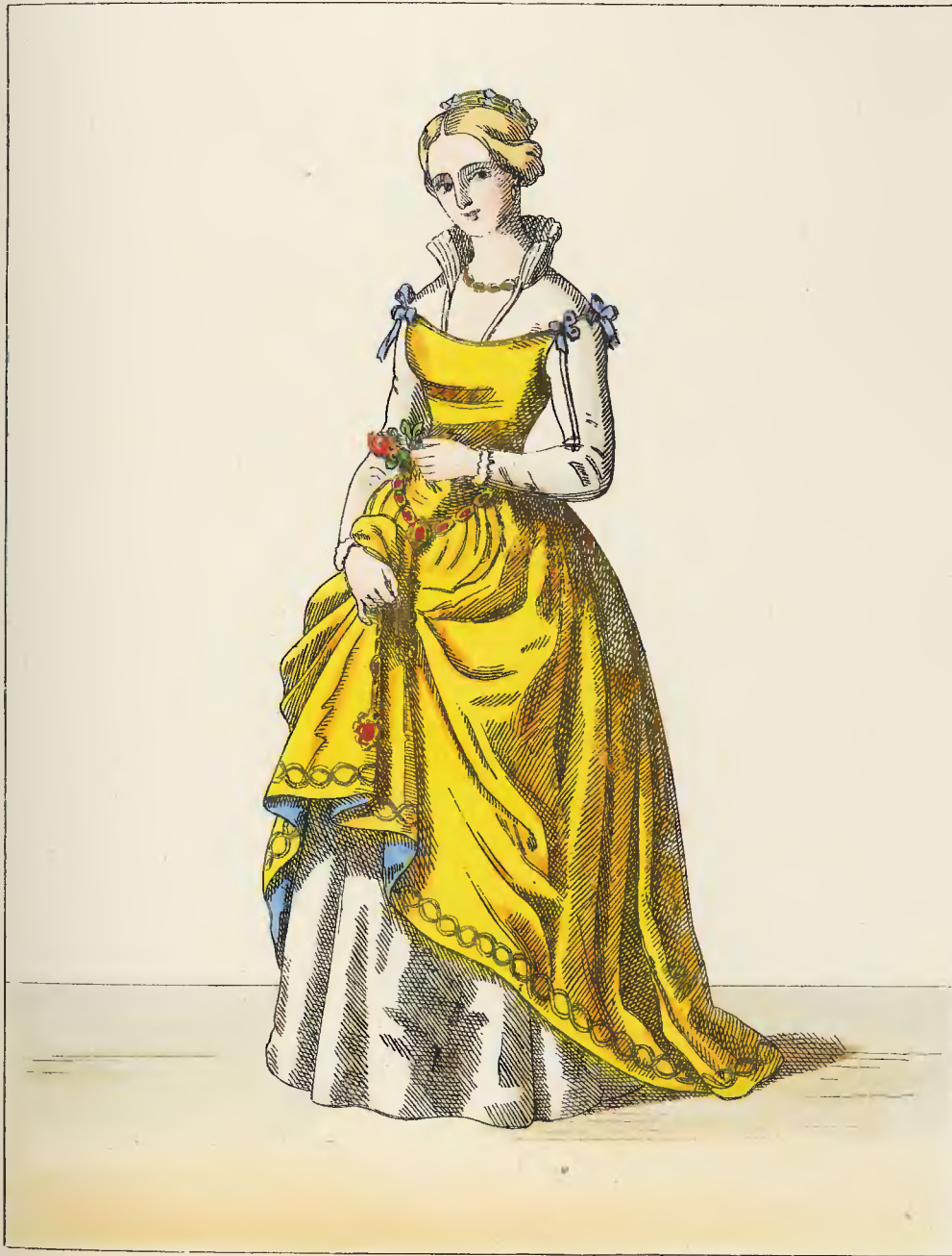
A FLORENTINE LADY— 1530

Published by T.H.LACY, 89, Strand, London.