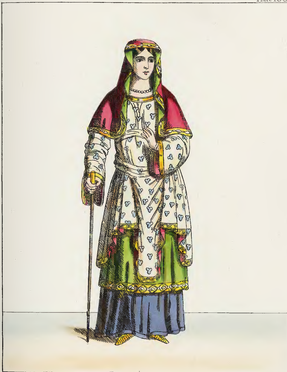
LADY OF RANK—950