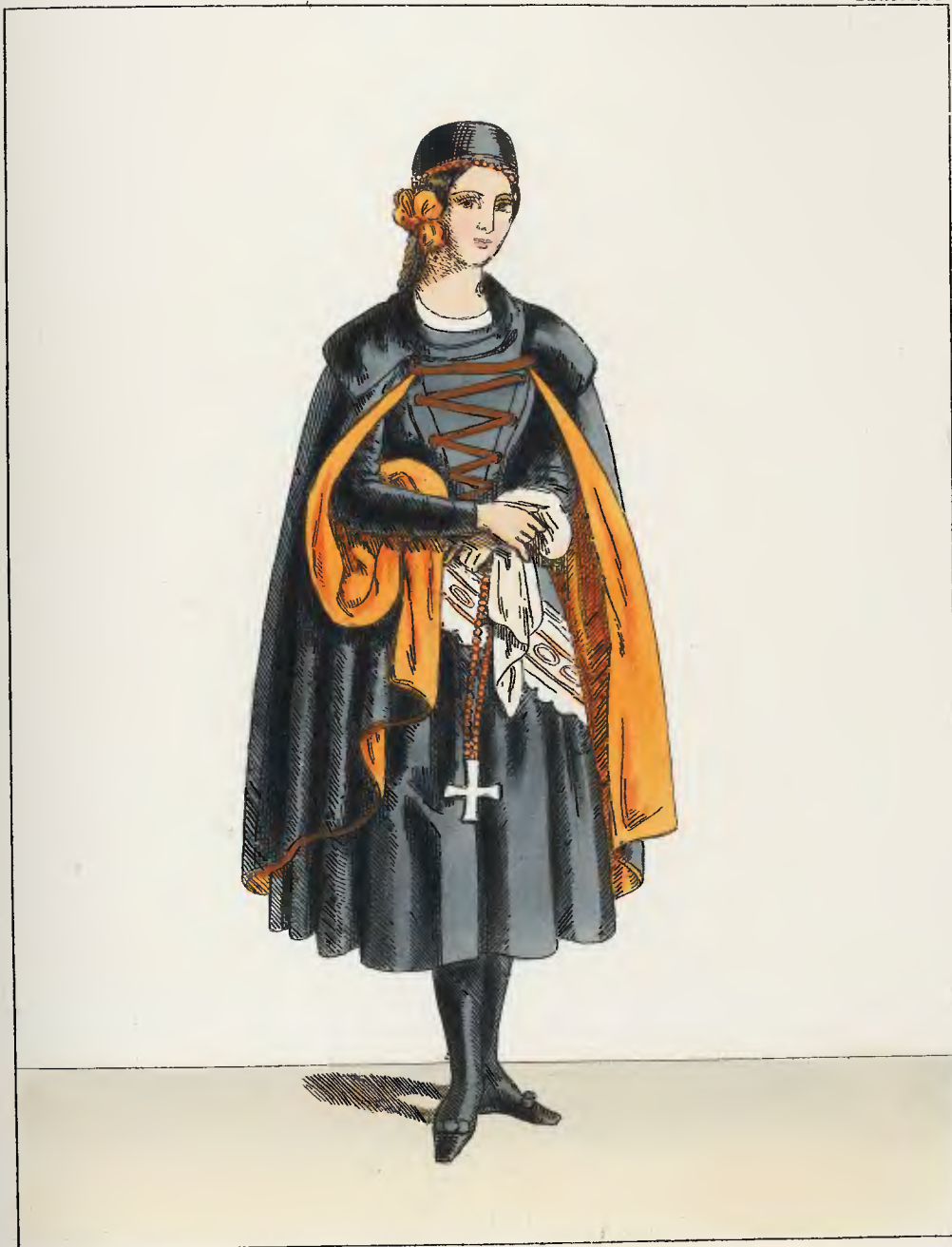
BOHEMIAN PEASANT GIRL.

Published by T.H. LACY, 29, Strand, London