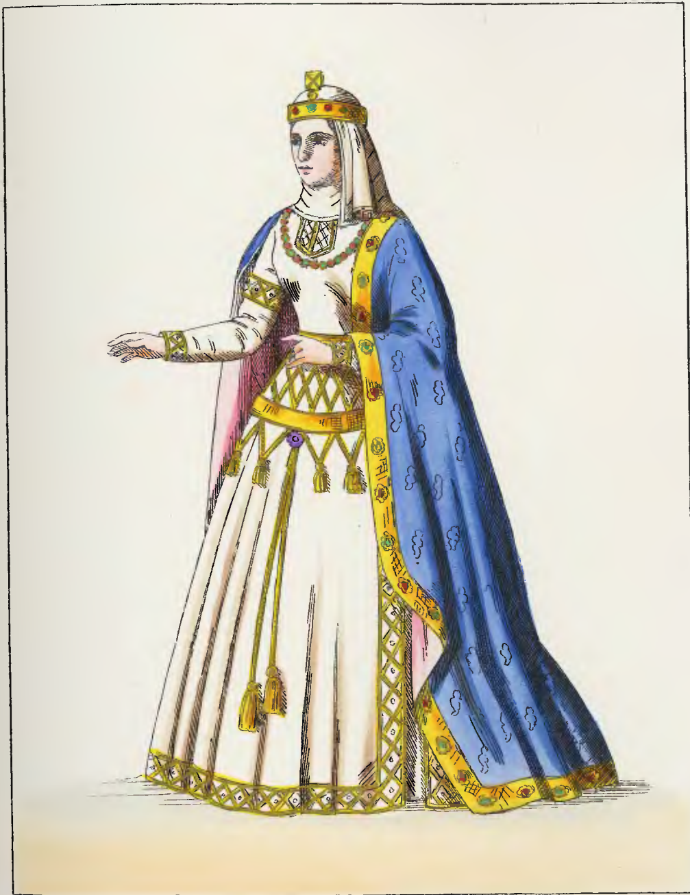
LADY OF RANK—1050