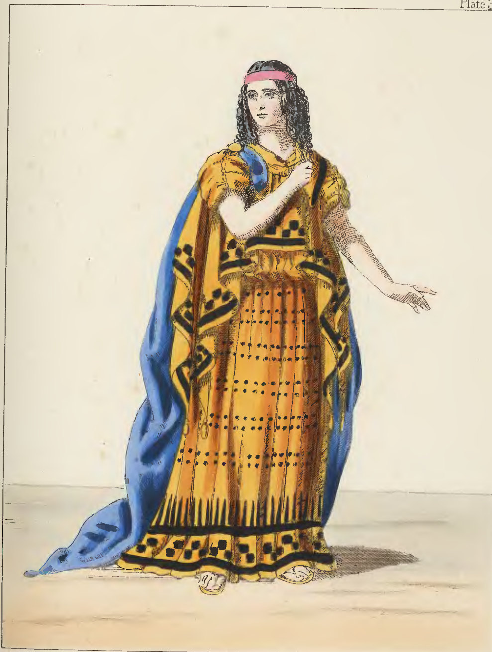
ANCIENT GREEK FEMALE.