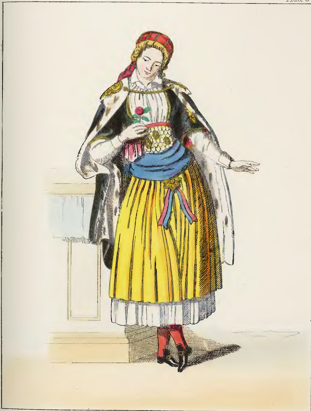
DENMARK—A YOUNG LADY ( National Costume )

Published by T. H. LACY, 89, Strand, London.