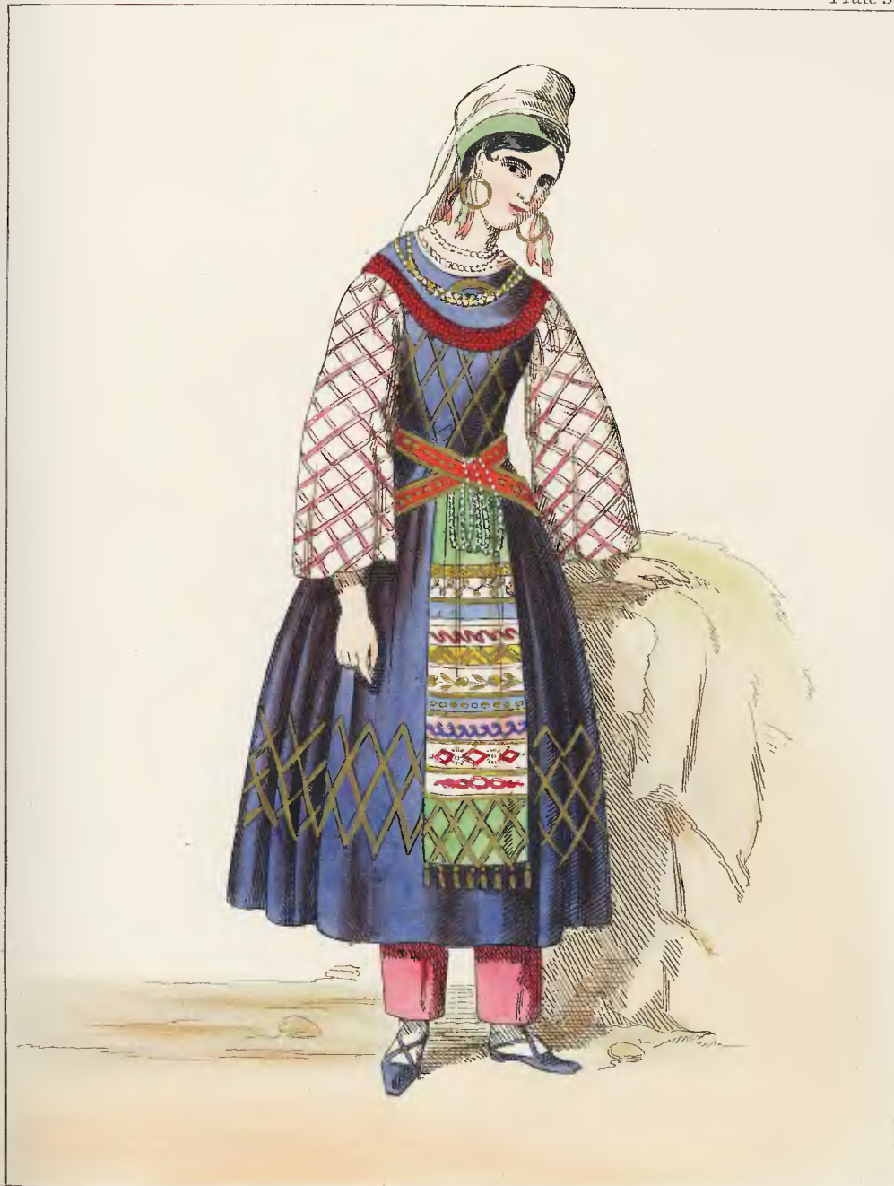
FINLAND (NATIONAL COSTUME)

Published by T.H. LACY, 89, Strand, London.