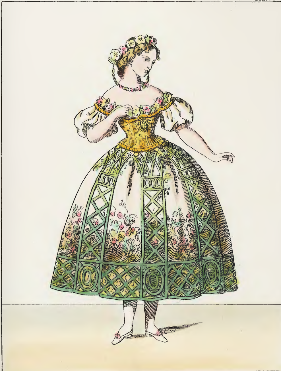
A FLOWER GARDEN,

Published by T. HLACY, 89, Strand, London.