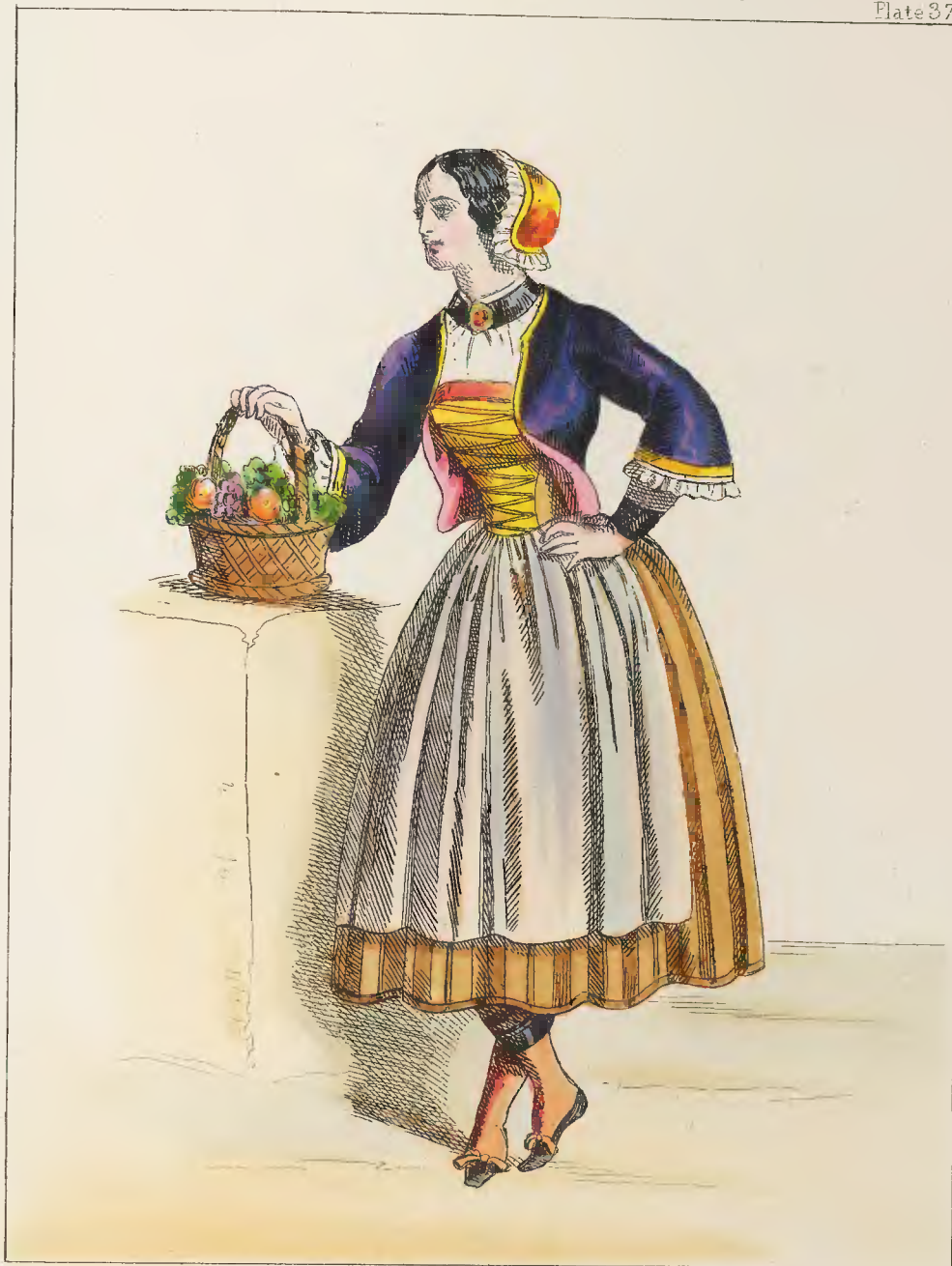
PEASANT GIRL (of the Tyrol)

Published by T.H. LACY, 89, Strand, London.