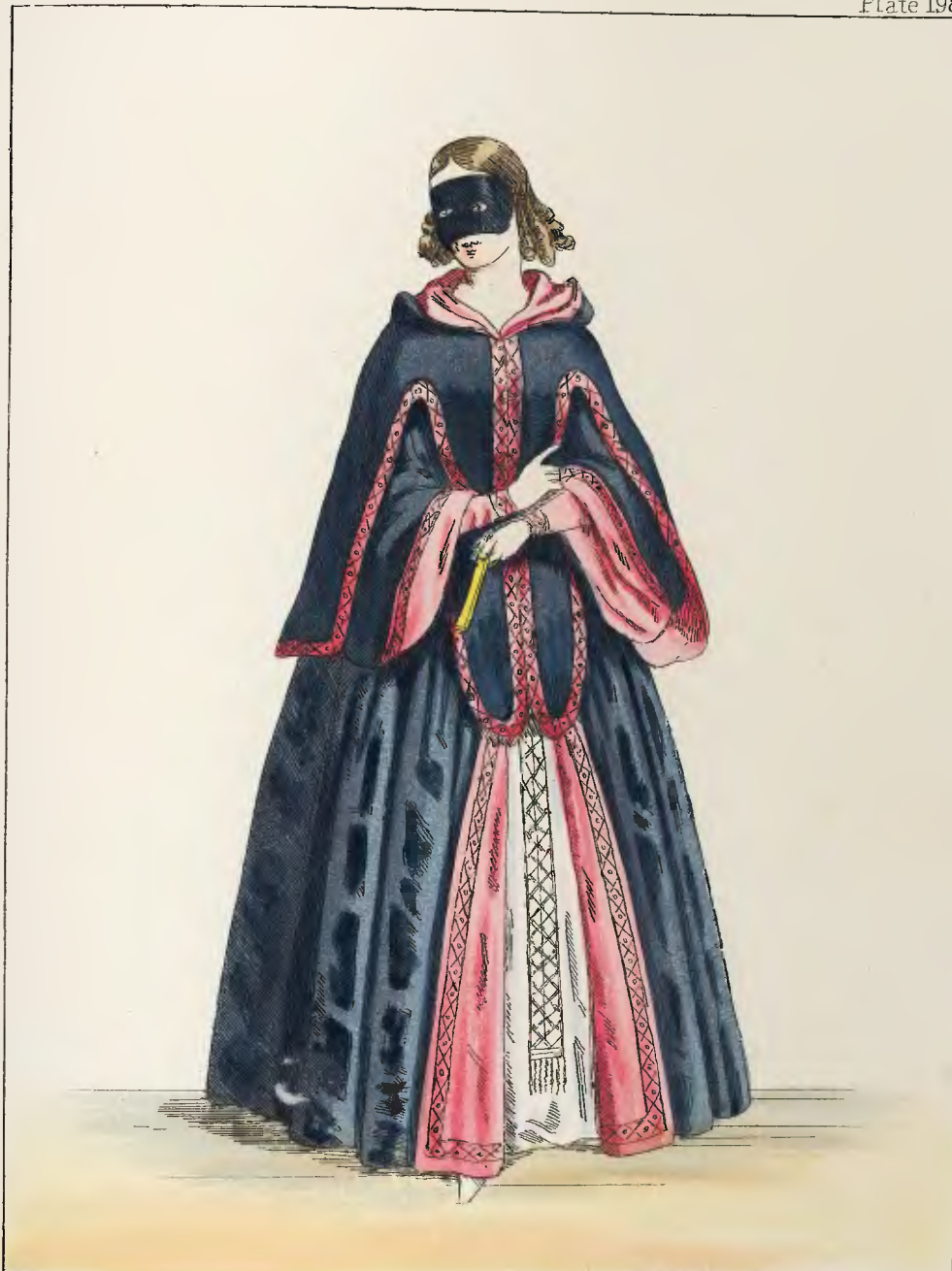
LADY IN DOMINO AND MASK