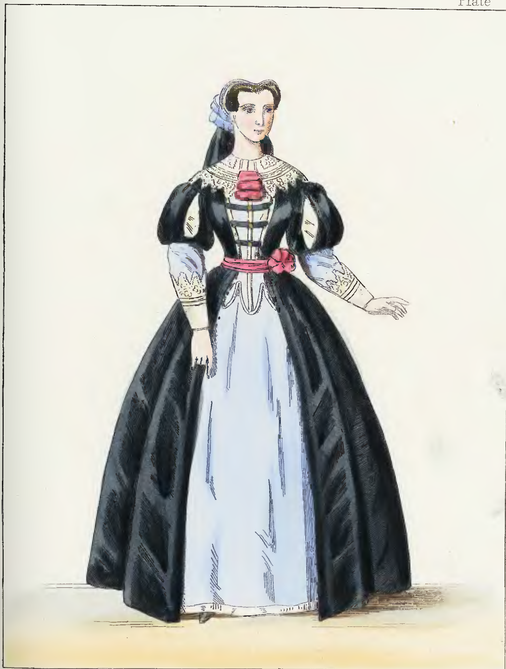
1650—A LADY OF THE COMMONWEALTH. ( Rachel as Diane )

Published by T.H. LACY, 89, Strand, London