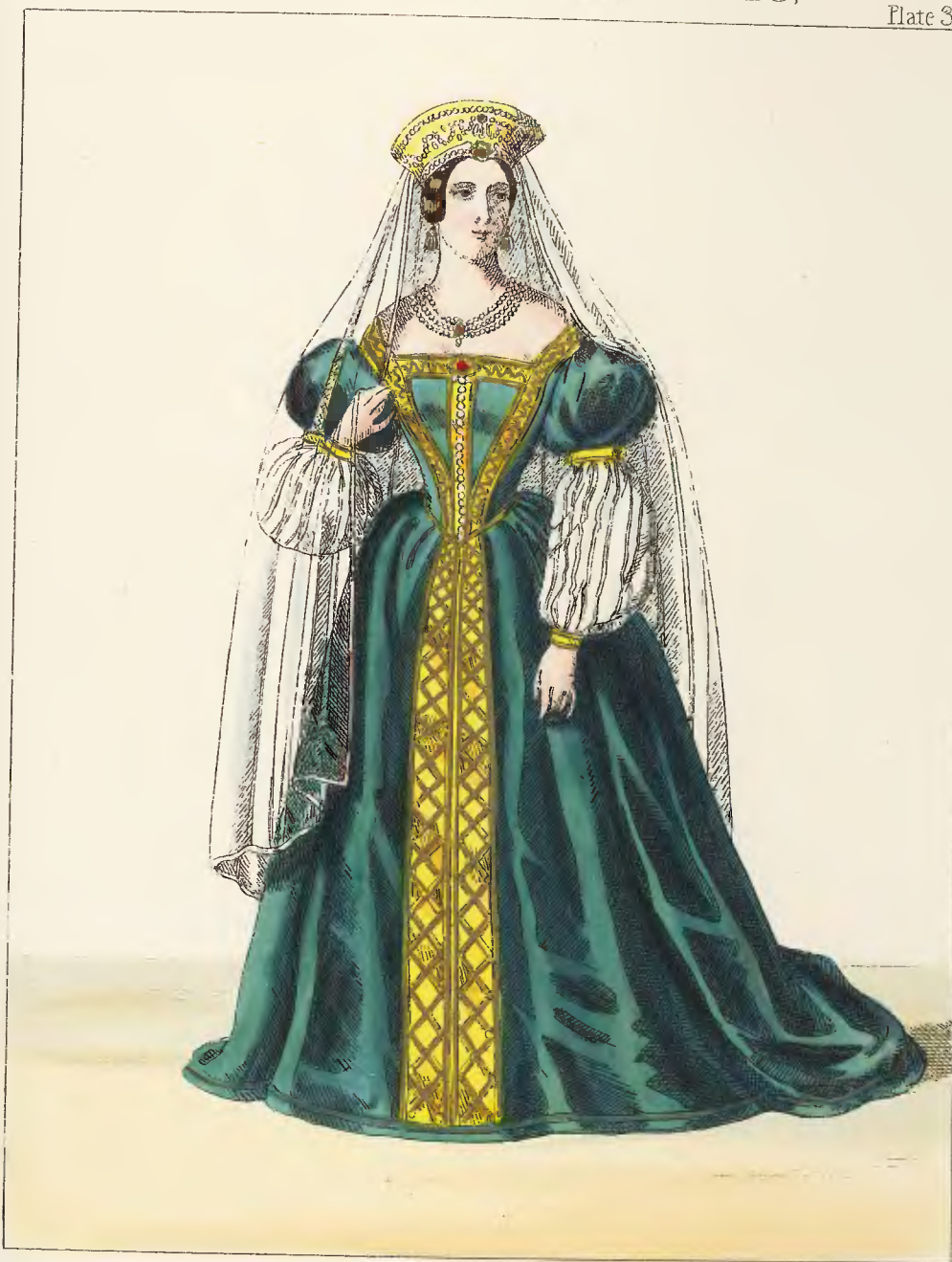
MODERN RUSSIAN LADY OF RANK,