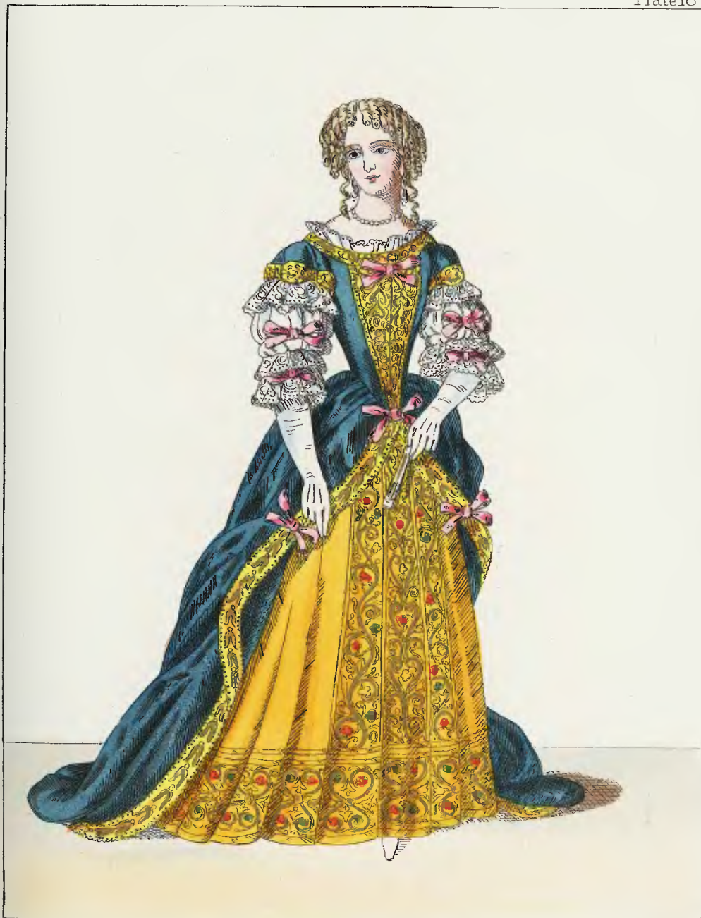
DUCHESS DE LA VALLIERE — 1670,

( England—Charles 2 nd France—Louis 14 th )