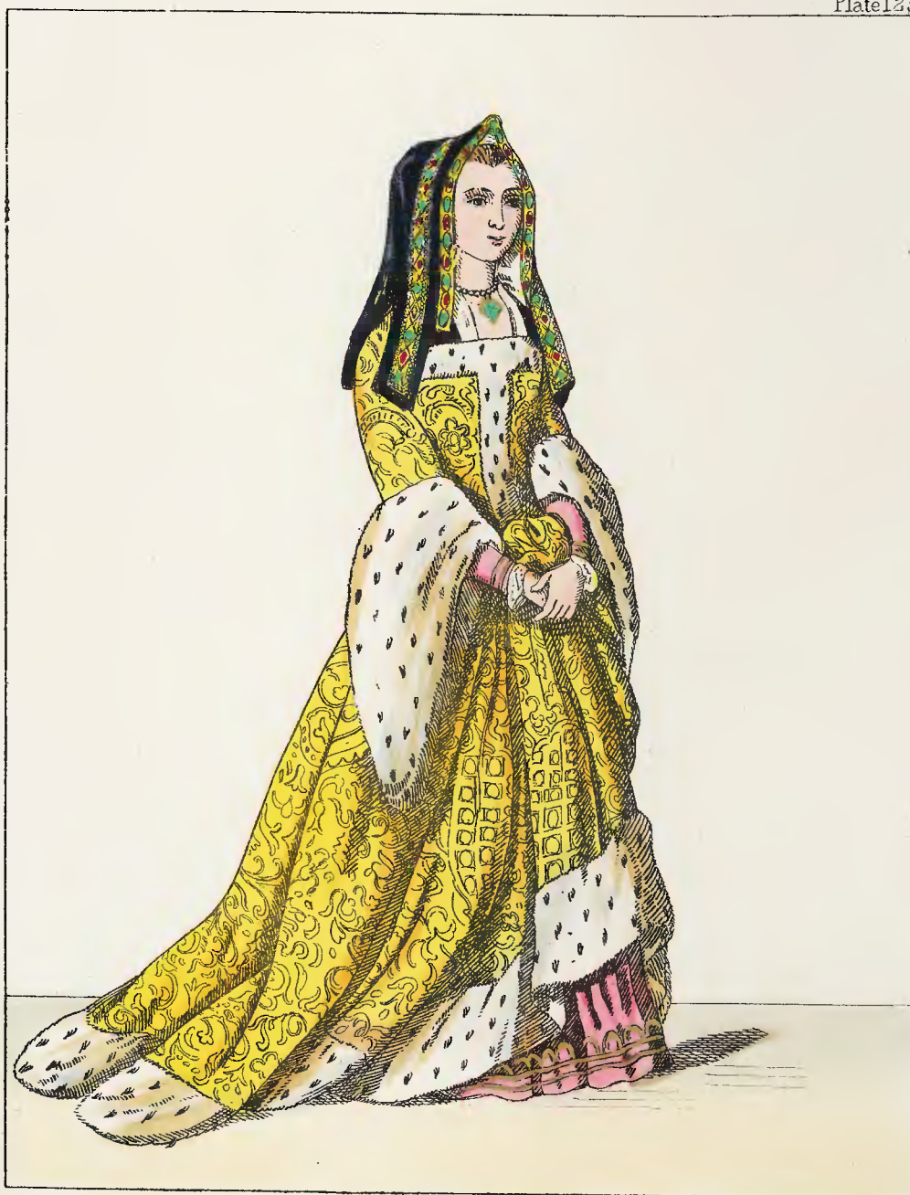
SCOTLAND—MARGARET QUEEN OF JAMES 4 th —1510.