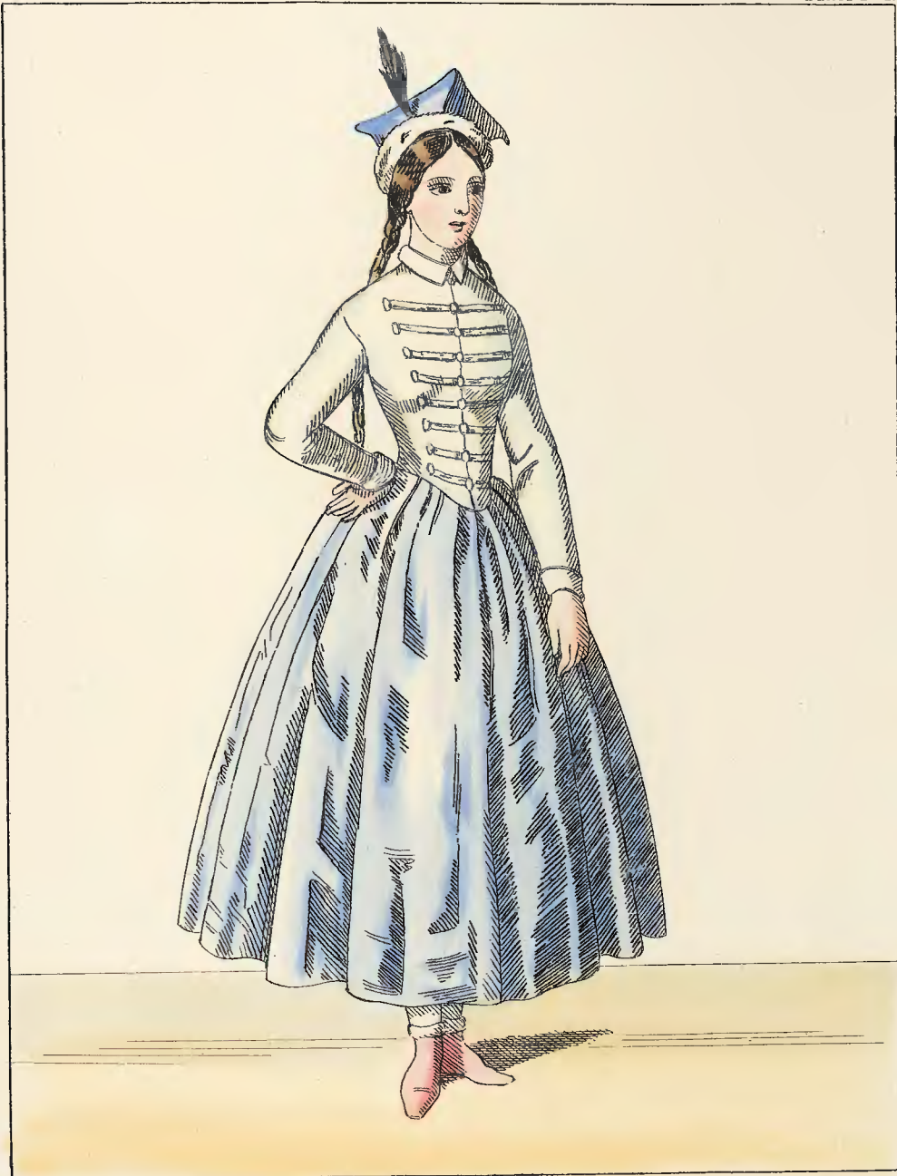
POLAND — A LADY OF CRACOW

Published by T. H. LACY, 89, Strand, London.