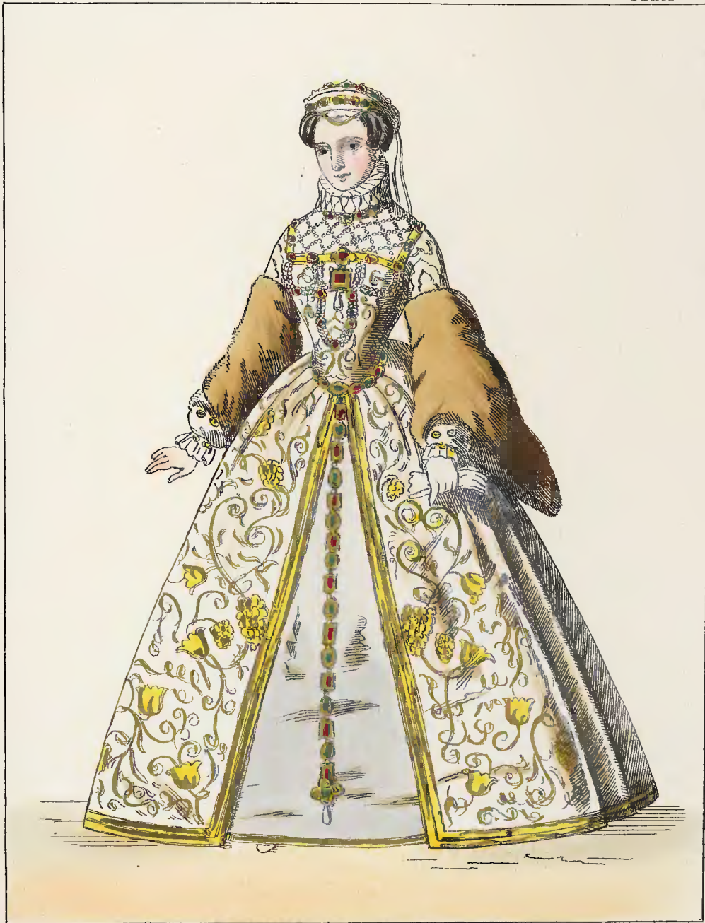
LADY OF RANK—1570,