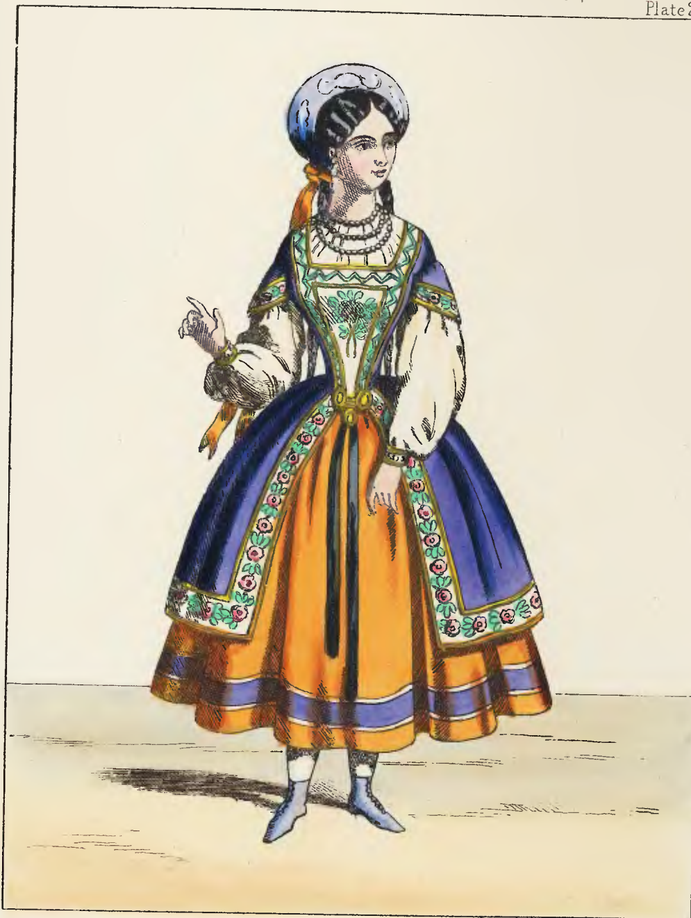
RUSSIAN FEMALE, (National)

Published by TH. LACY, 89, Strand, London.