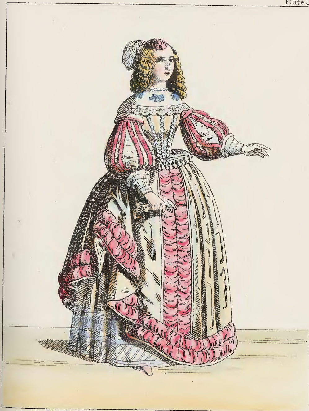
CATHERINE OF PORTUGAL—WIFE OF CHARLES 2 nd —1666.

Published by T H LACY, 89, Strand, London.