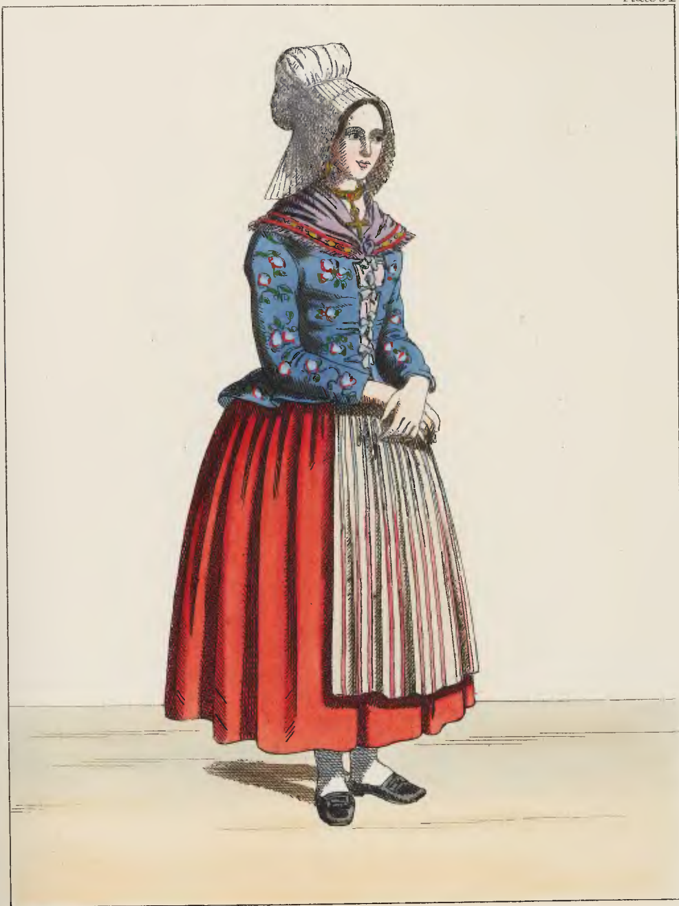
FRANCE — FISHERMANS WIFE