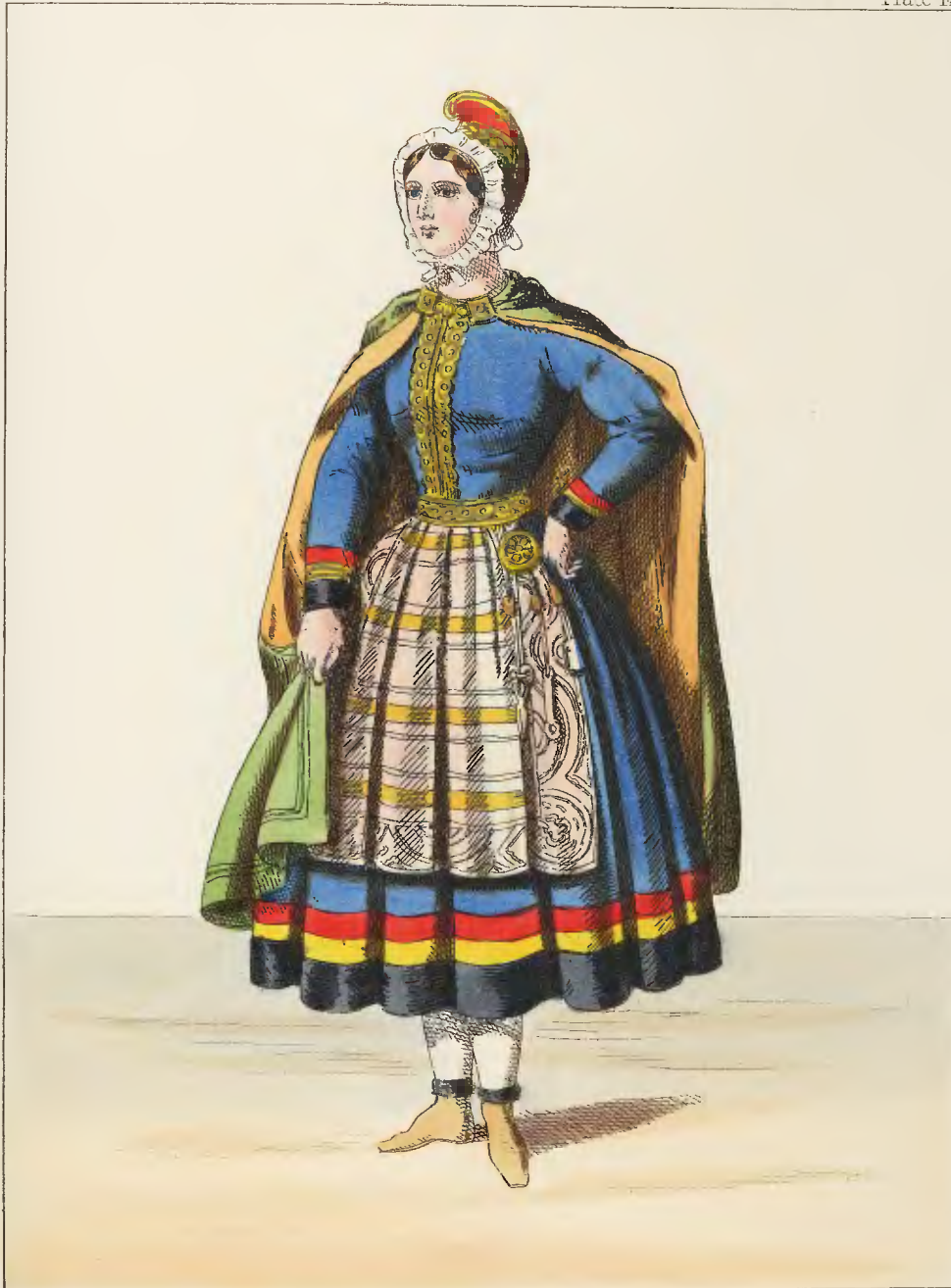
GIRL OF NORWAY.

Published by T. H. LACY, 89, Strand, London.