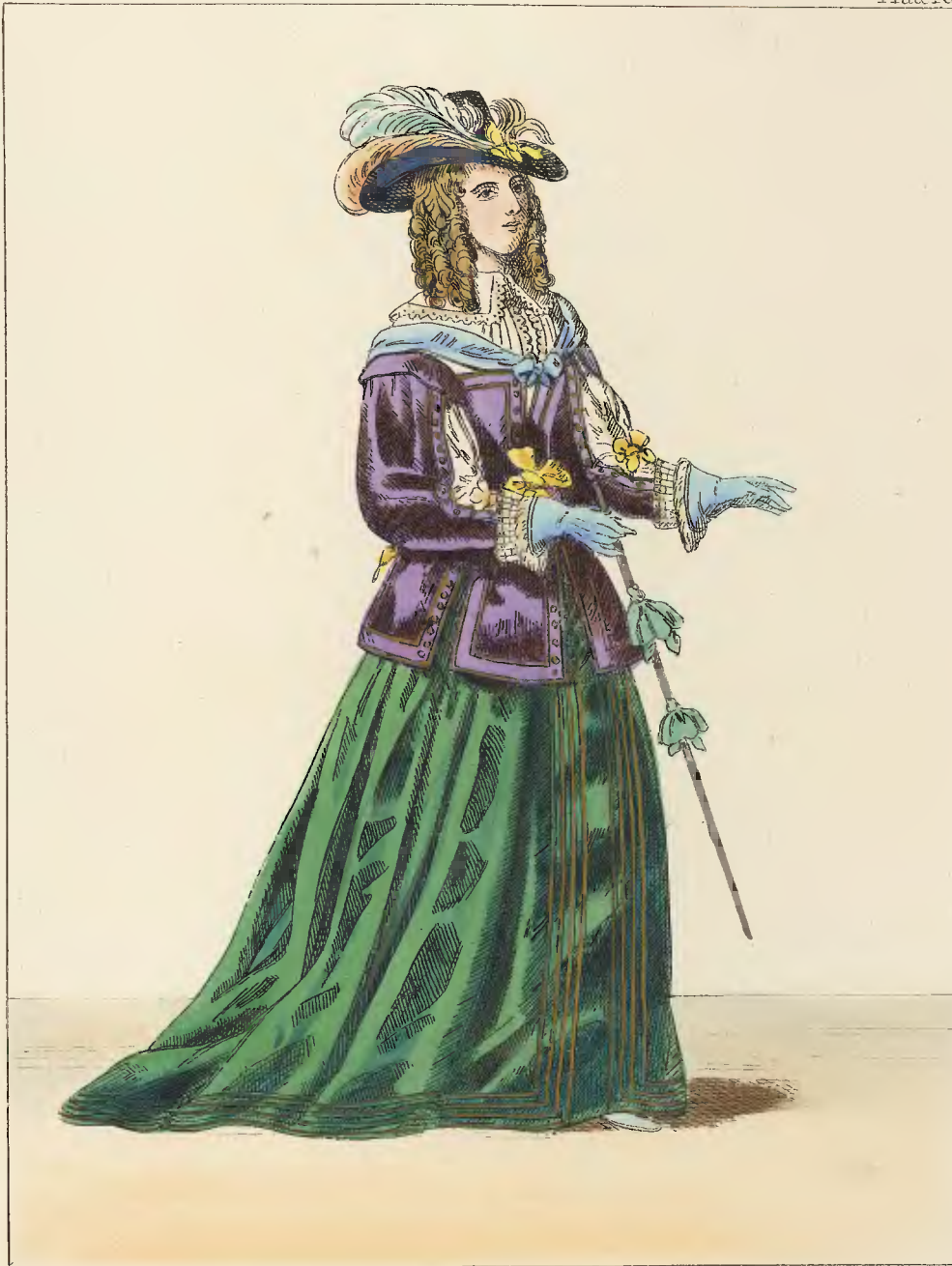
CHRISTINA QUEEN OF SWEDEN—1656

Published by T H LACY, 89, Strand, London.