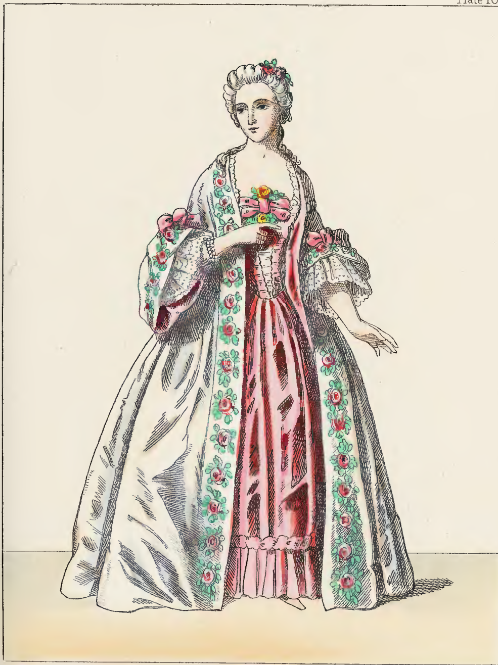
MADAME DU BARRY—1770