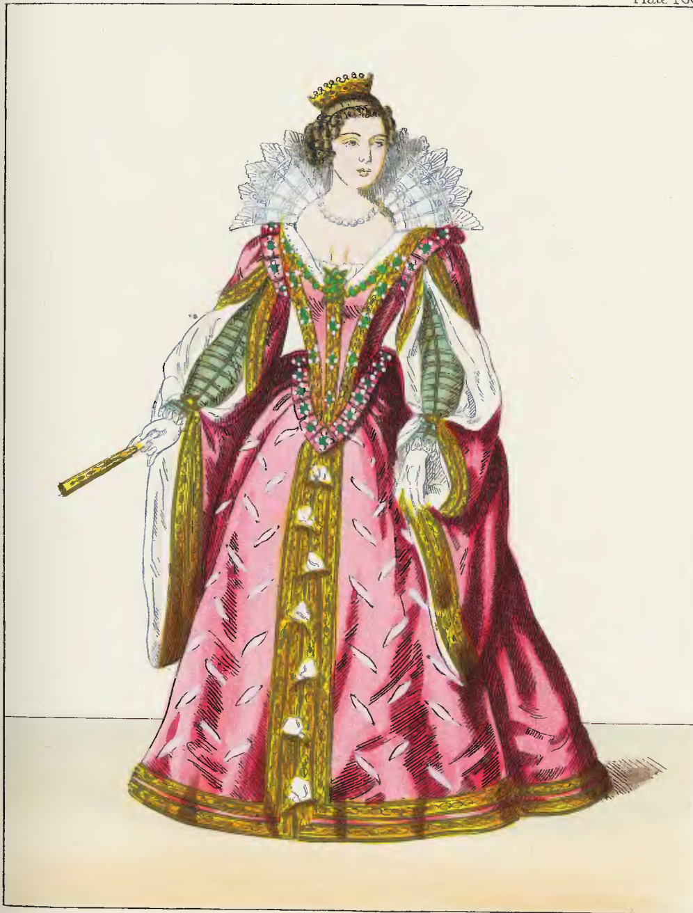
1630—ANNE OF AUSTRIA,