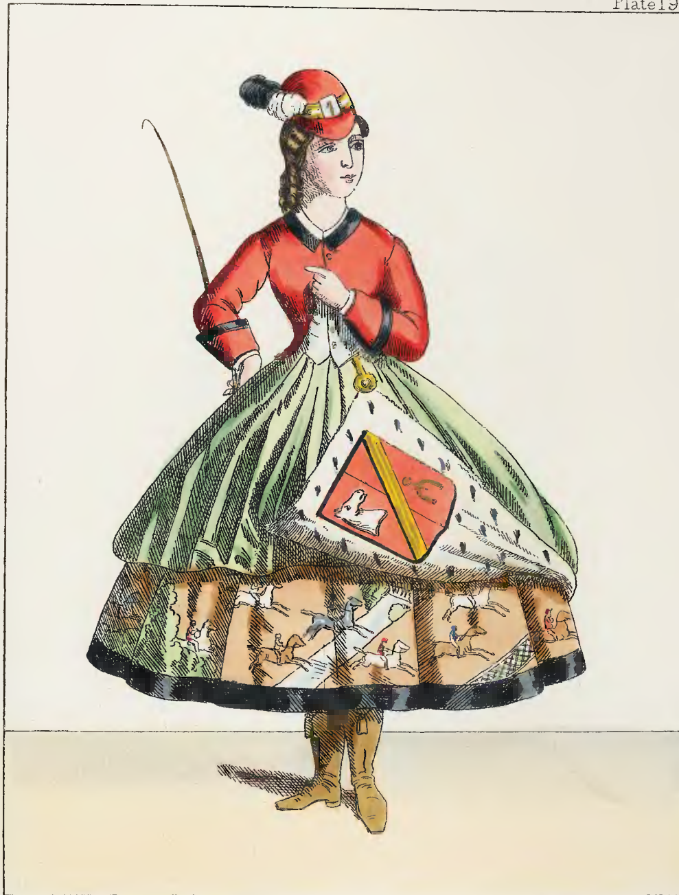
A MODERN DIANA.