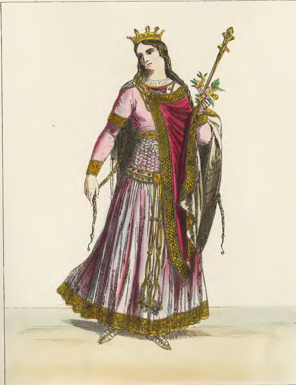
CLOTHILDE—QUEEN OF CLOVIS—496

Published by T.H.LACY, 89, Strand, London.