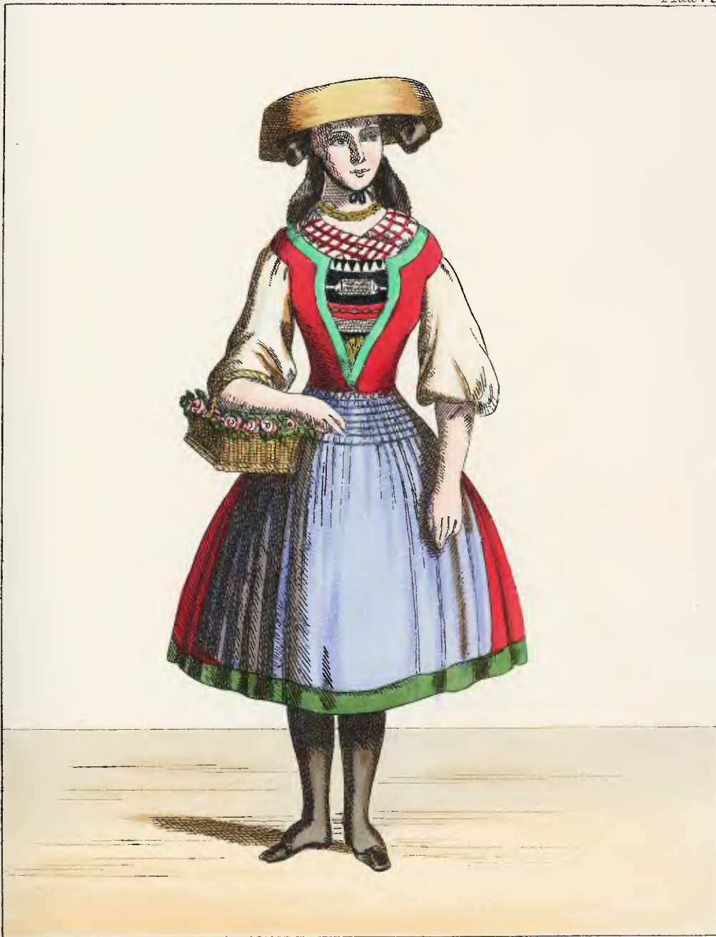
G E R M A N Y—BERGEDORF, (near Hamburg)