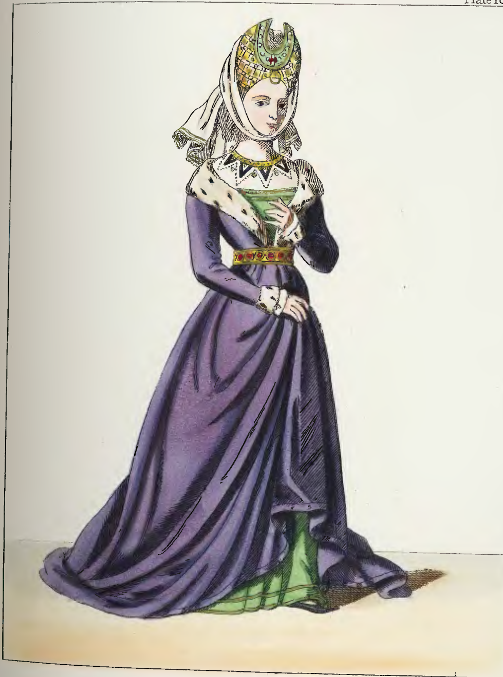
LADY OF RANK—ABOUT—1425, (England—Henry 6 th —France—Charles-7 th )