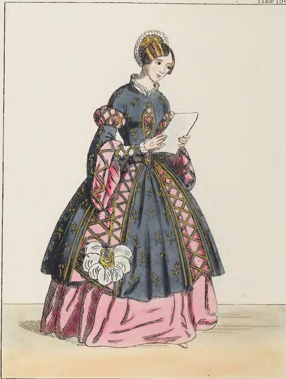
SPAIN—LADY OF RANK—1560