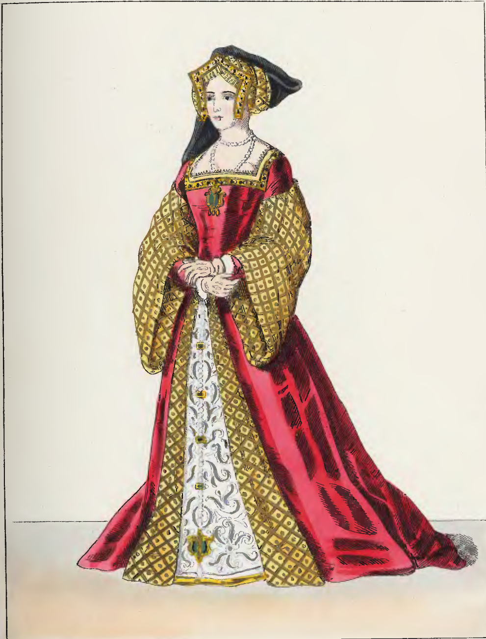
JANE SEYMOUR.— 1636 (3 rd Wife of Henry 8 th )

Published by T.H.LACY, 89, Strand London.