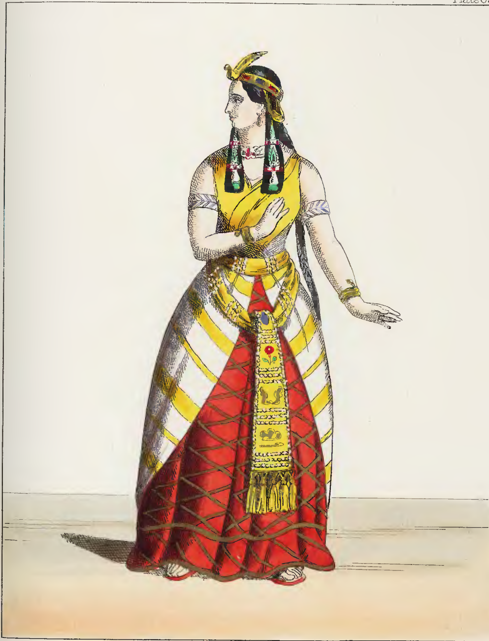
ANCIENT EGYPTIAN PRINCESS.