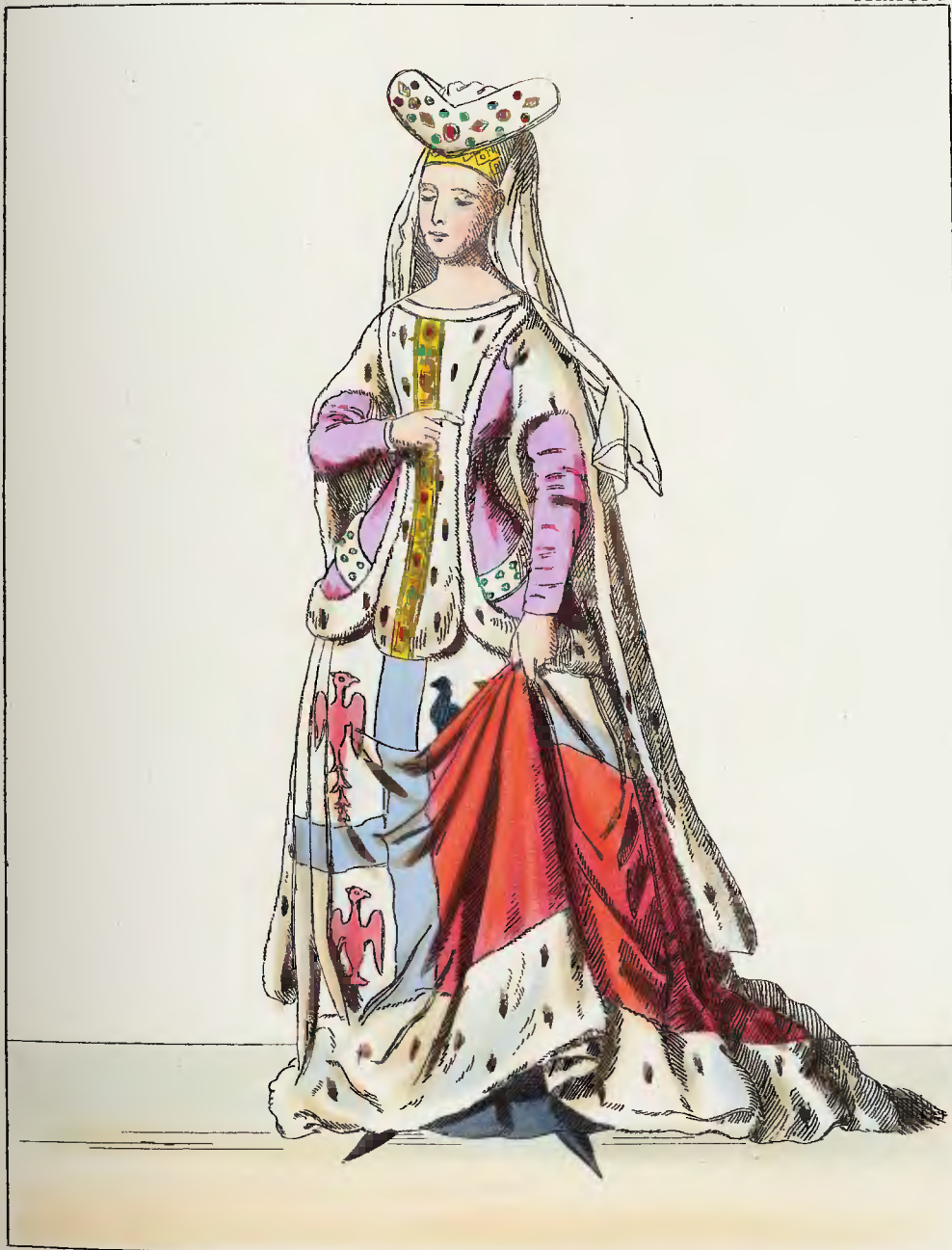
ENGLAND-HENRY 4 th -FRANCE-CHARLES 6 th -1408 LADY OF RANK.