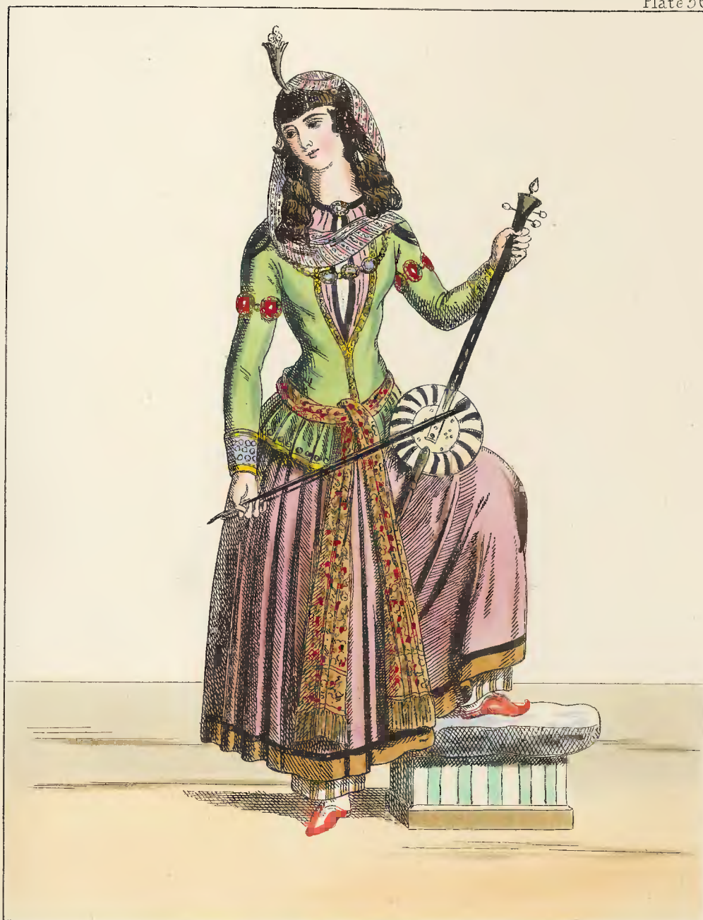
A PERSIAN LADY,