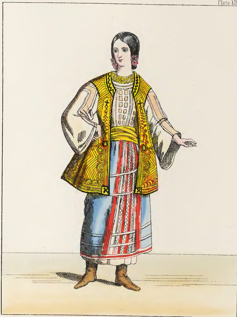
WALLACHIA — FEMALE PEASANT.