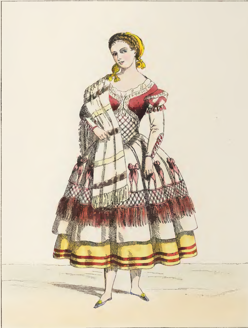
SPANISH LADY (National Costume.)