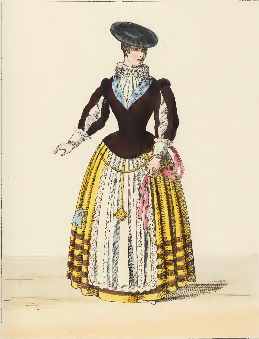
SWISS OR GERMAN LADY