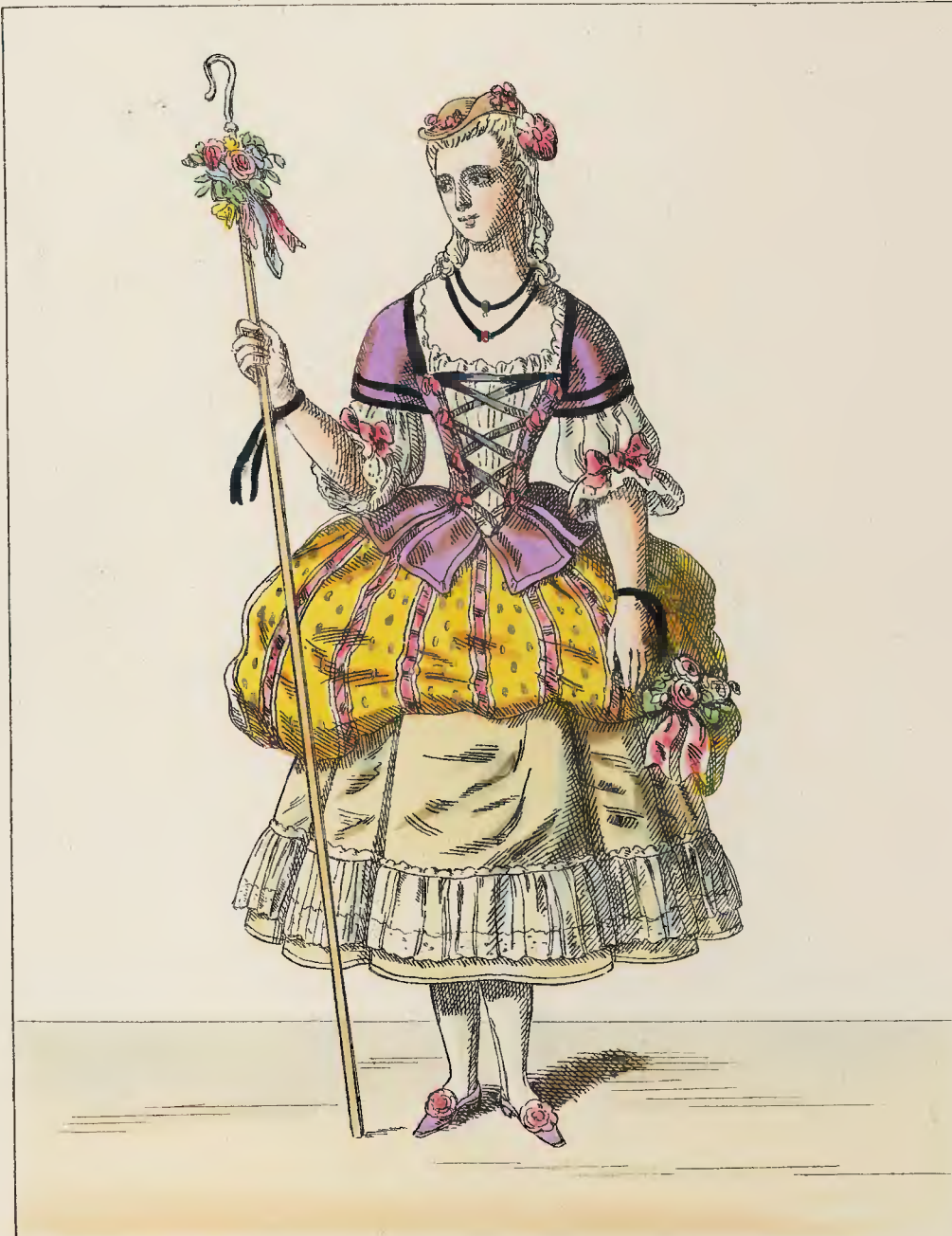
A SHEPHERDESS — AFTER WATTEAU