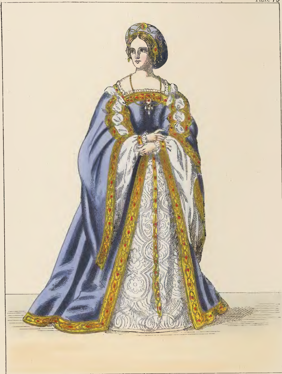
MADELINE OF FRANCE—1536