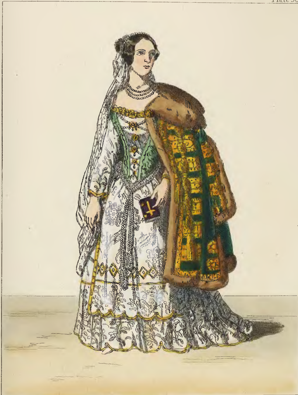
. HUNGARIAN LADY OF RANK.