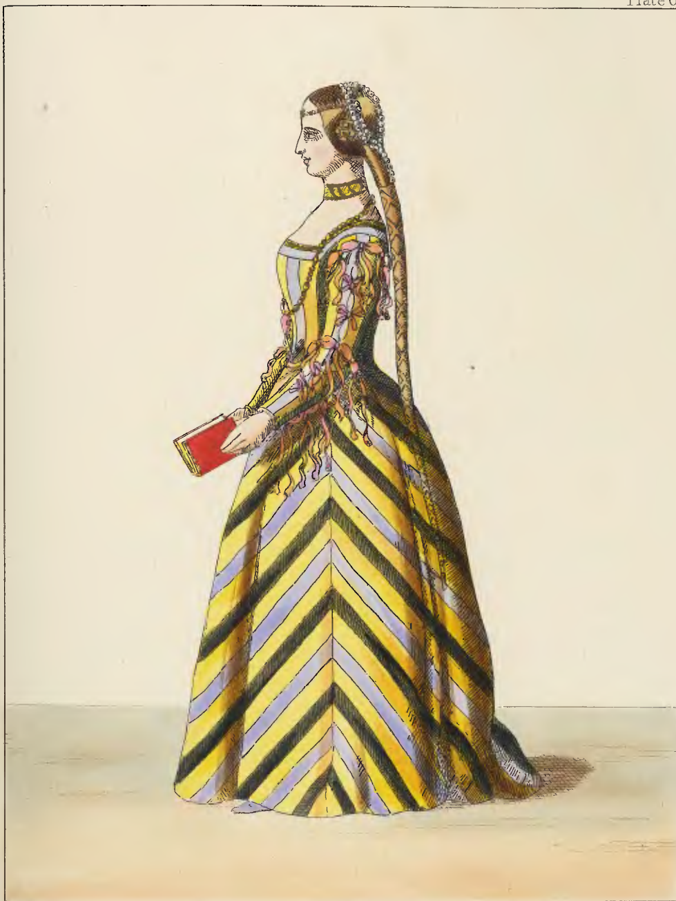
ITALIAN LADY—About, 1485, ( Beatrice of Este )