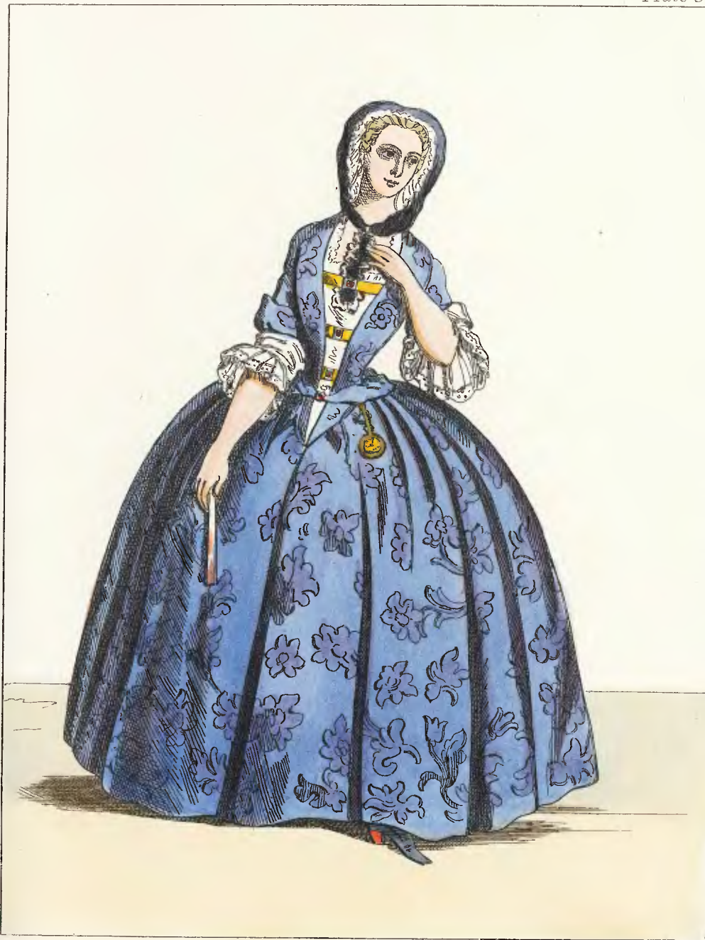
ENGLISH LADY Period 1746, GEORGE 2 nd (from Hogarth)