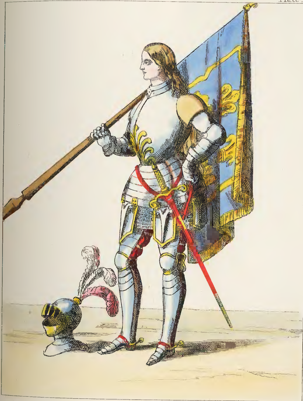
JOAN OF ARC, Armour of the Period 1431. (Henry 6 th —Charles 6 th .)