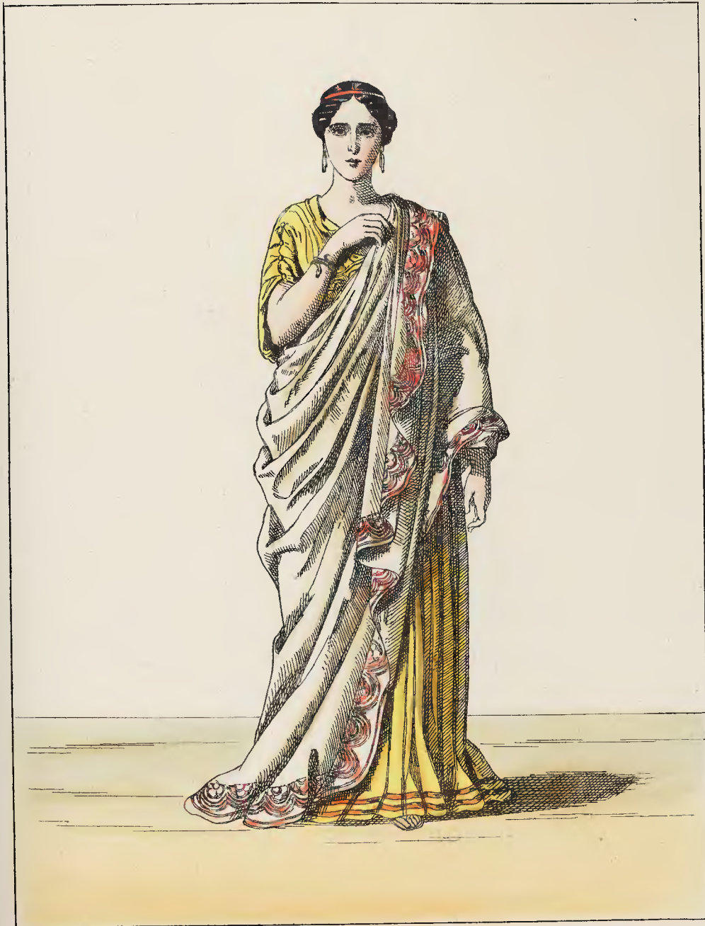
ANCIENT GREEK OR ROMAN LADY OF RANK.