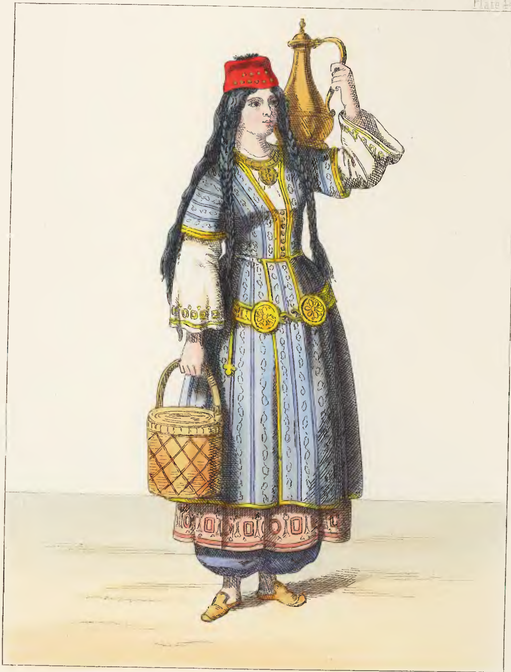
TARTAR GIRL (of the Crimea)

Published by TH. LACY, 89, Strand, London.