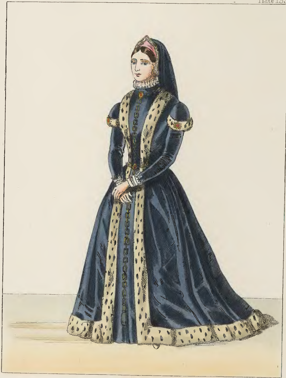
QUEEN JEANNE 2 nd OF SICILY—1400

Published by T. H. LACY 89 Strand London.