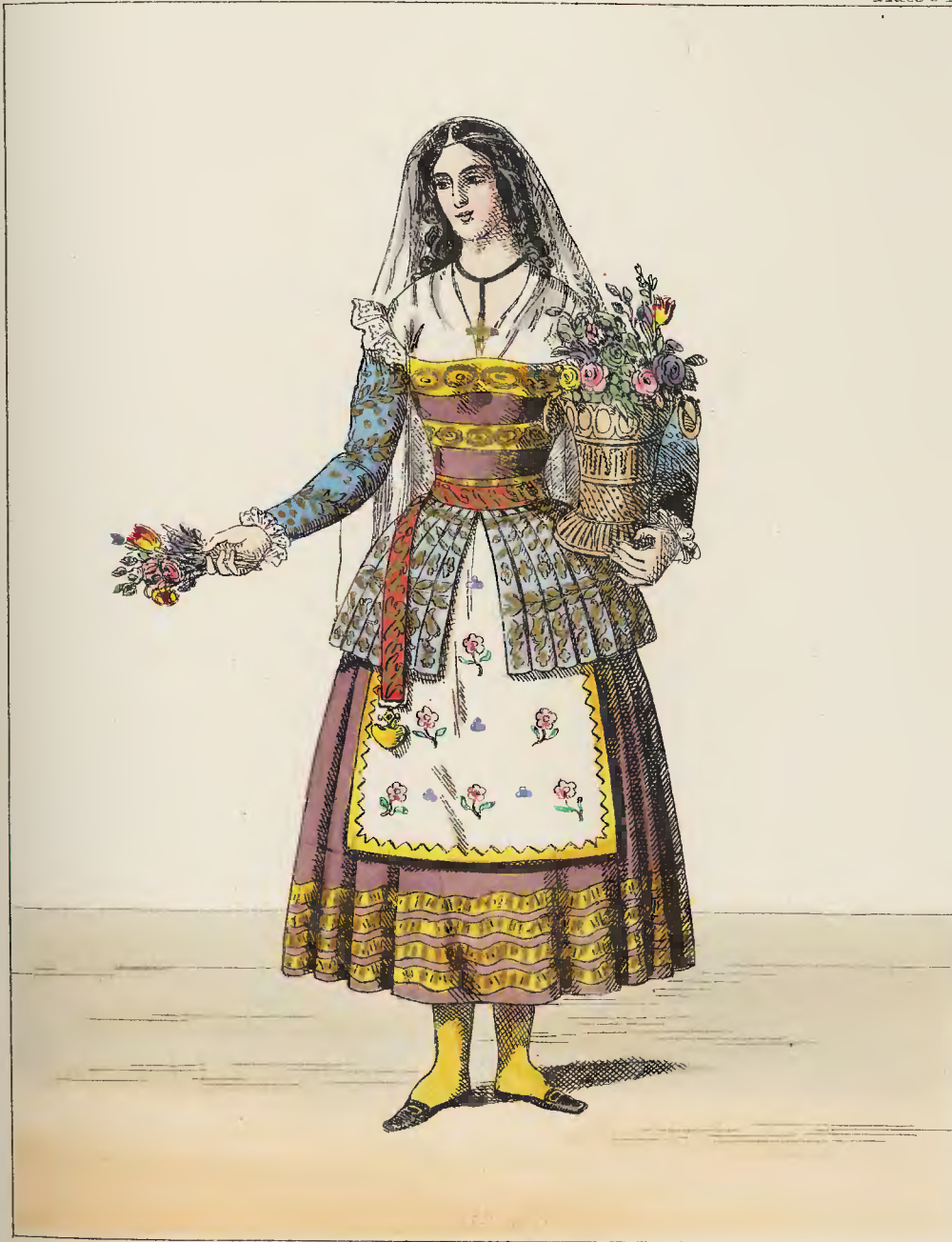
YOUNG FEMALE OF CORFU

Published by T H LACY, 89, Strand, London.