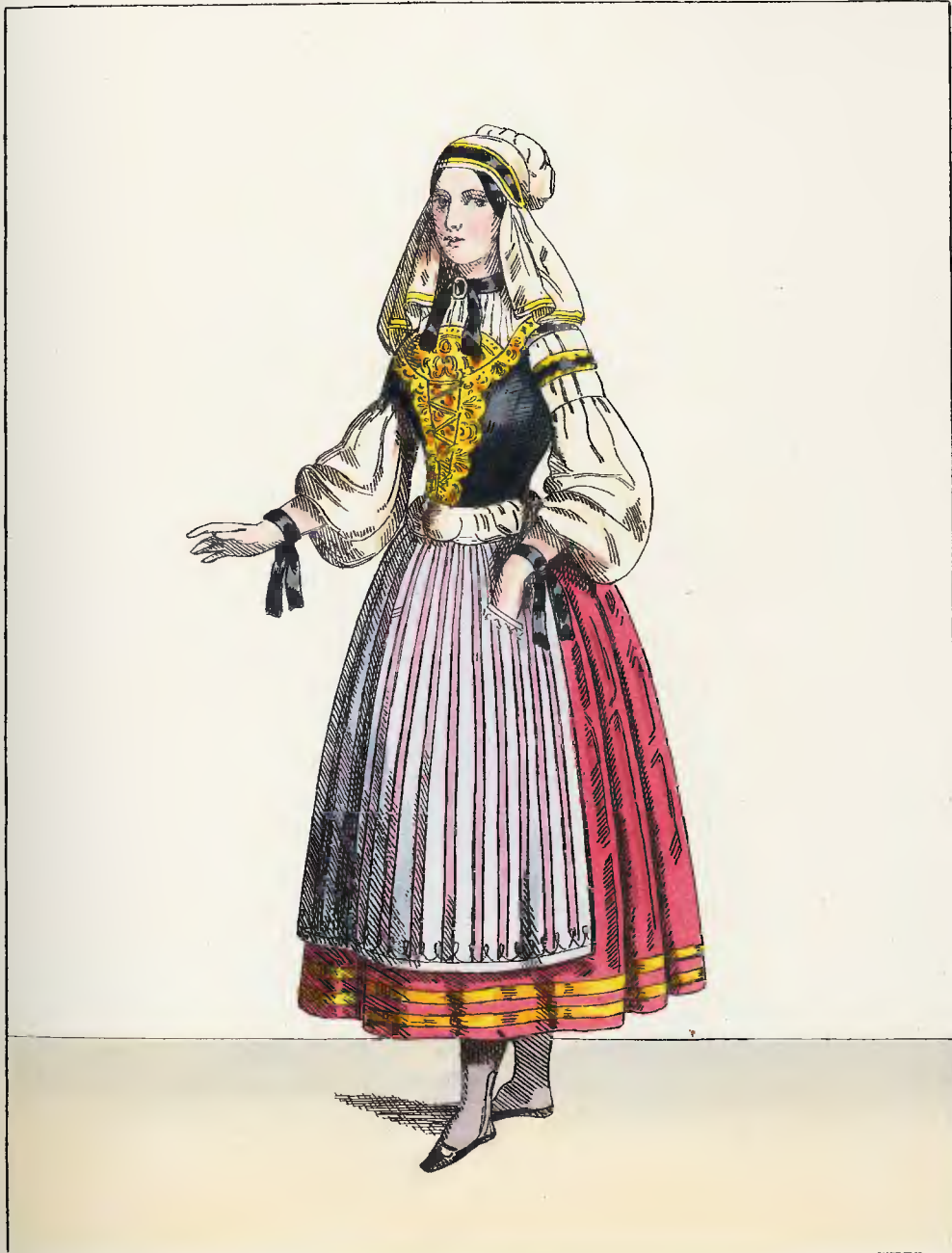
HOLLAND—A YOUNG PEASANT,