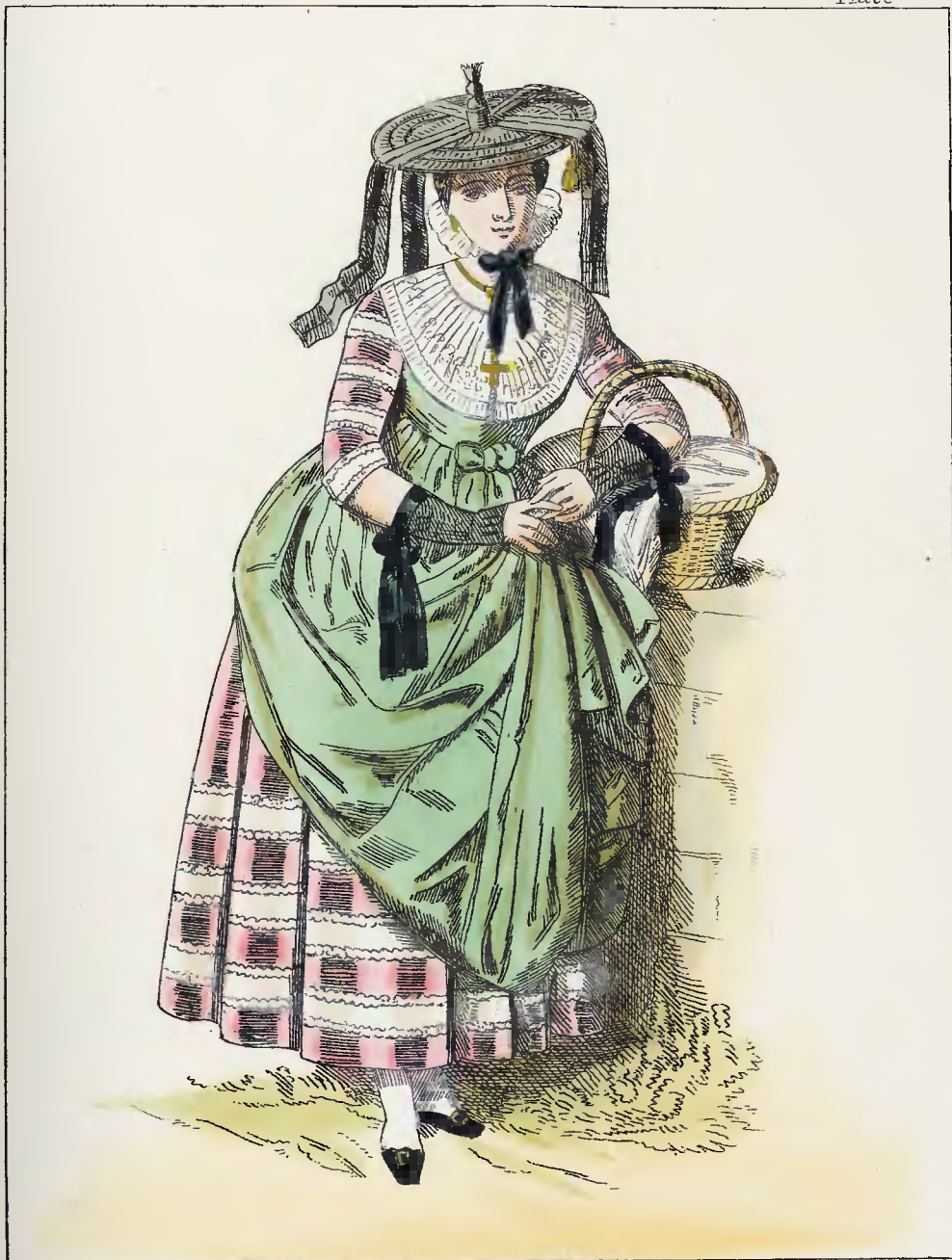
FRANCE—FEMALE OF BRESSANE.

Published by T. HLACY, 89, Strand, London.