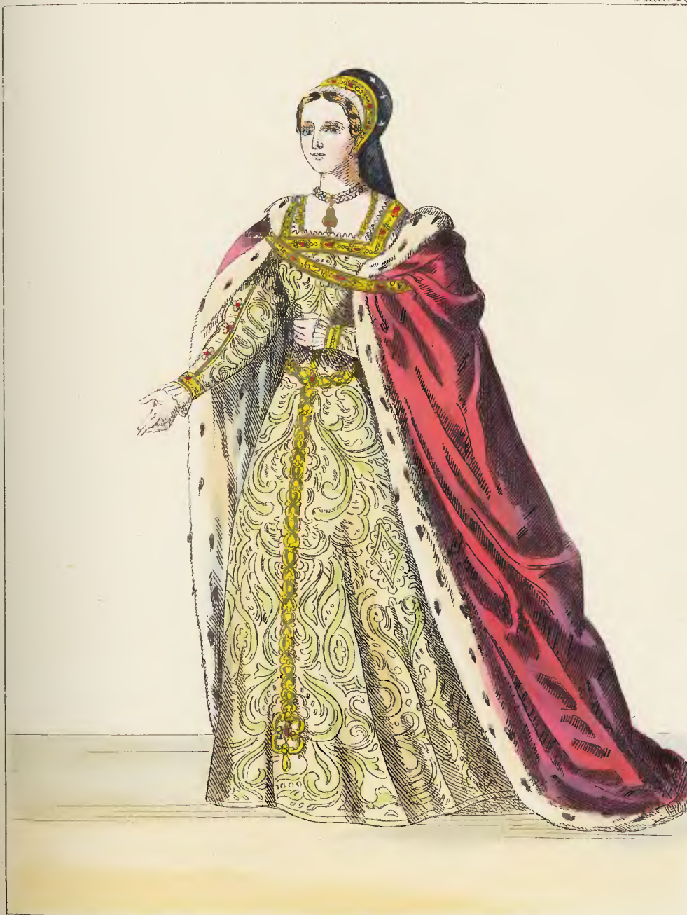
LADY JANE GREY—1553.