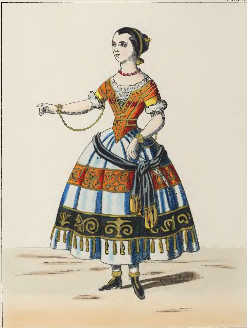
SPANISH OR PORTUGUESE GITANA