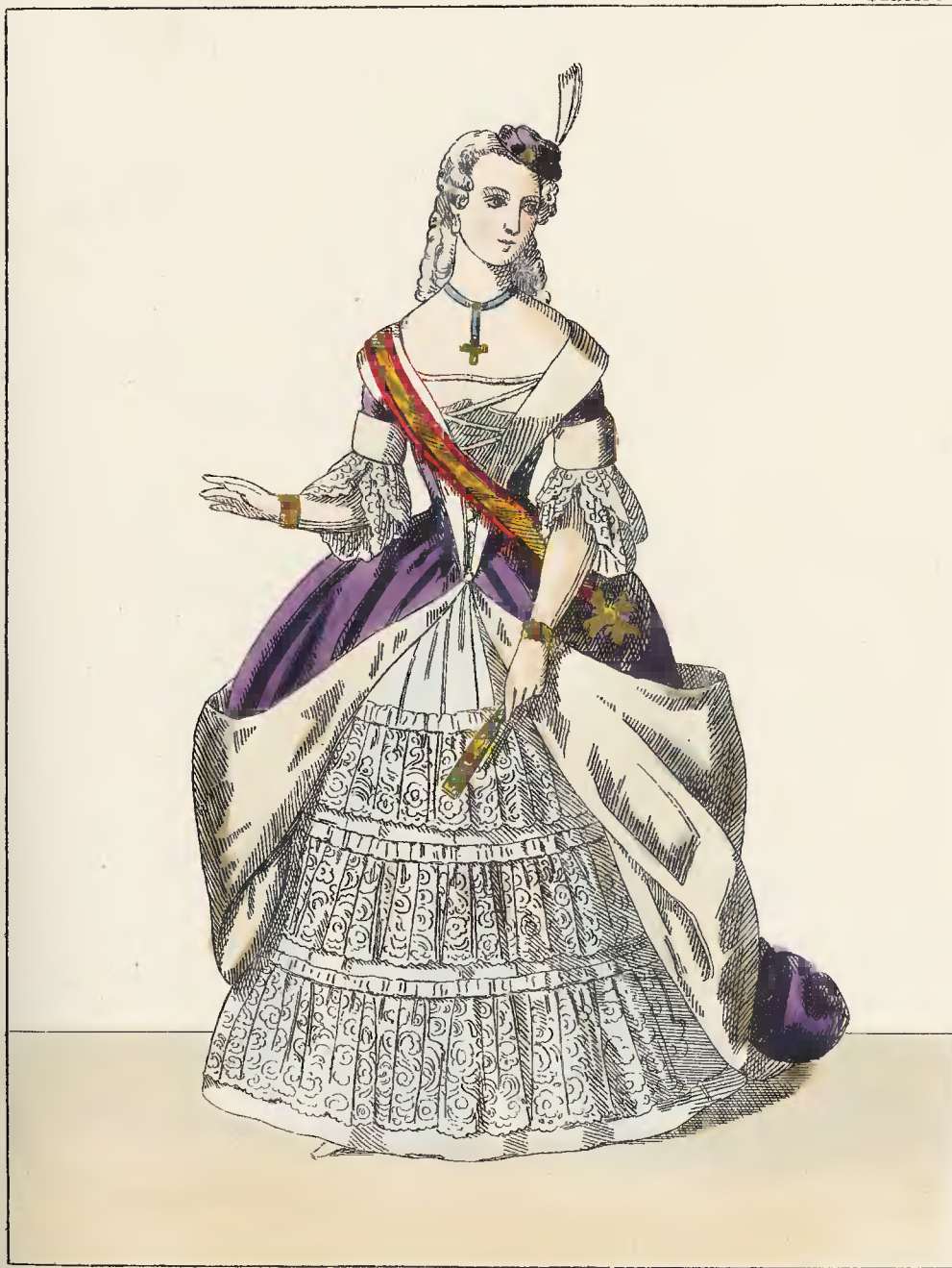
LADY OF RANK — 1770