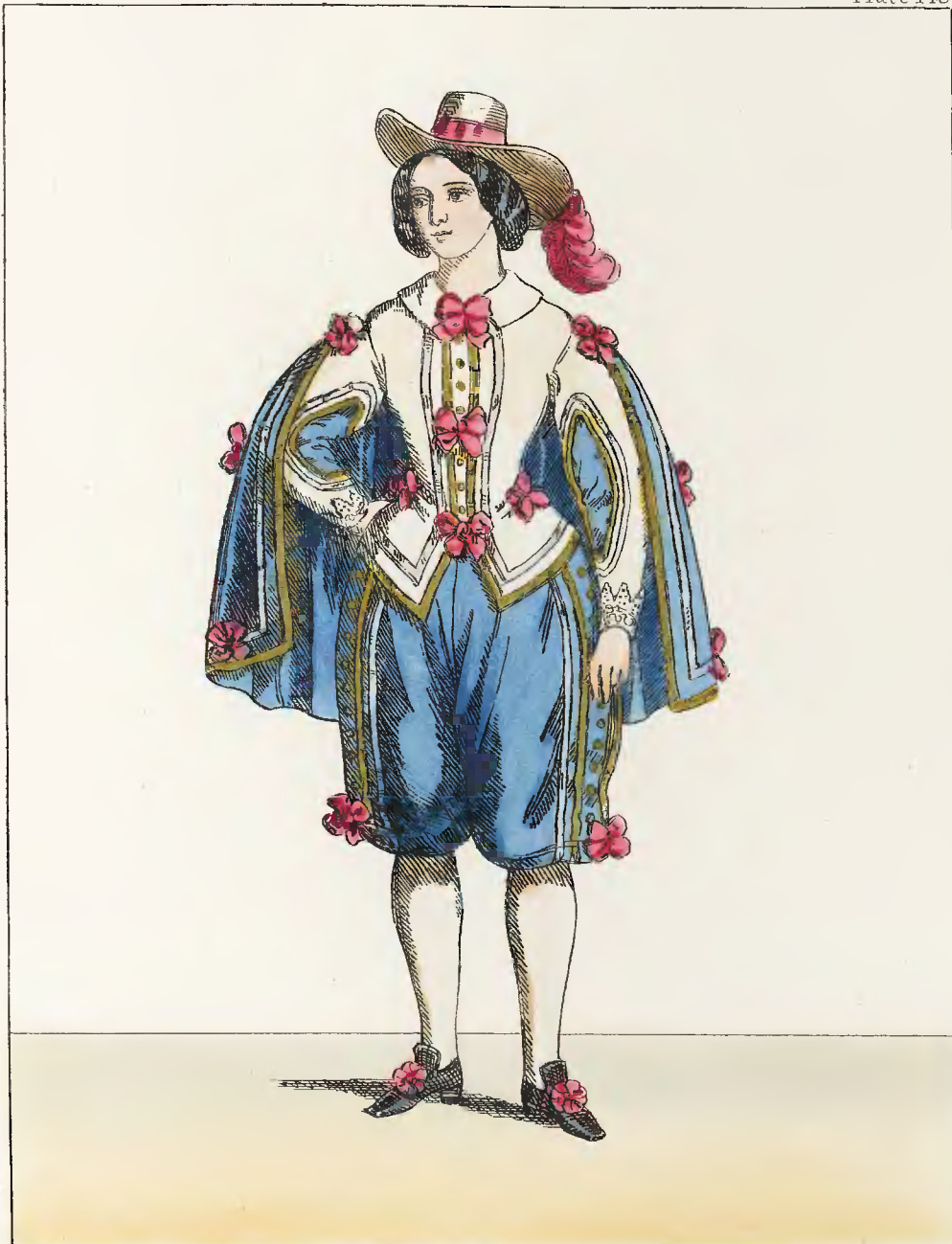
A PAGE—CHARLES 2 nd —LOUIS 14 th

Published by T.H.LACY, 89, Strand, London.