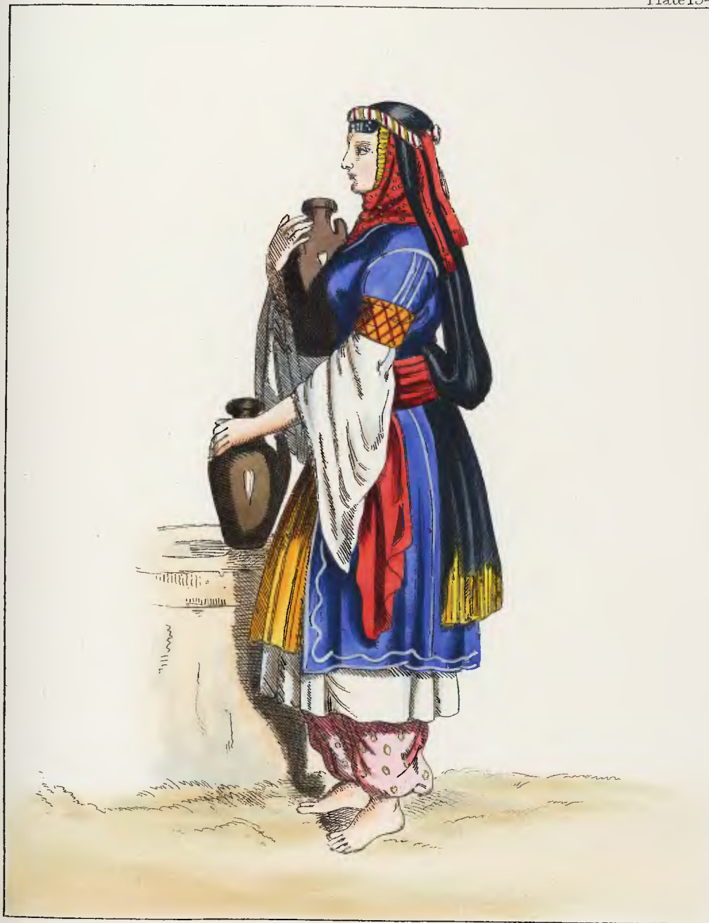
PALESTINE—A WOMAN OF NAZARETH,