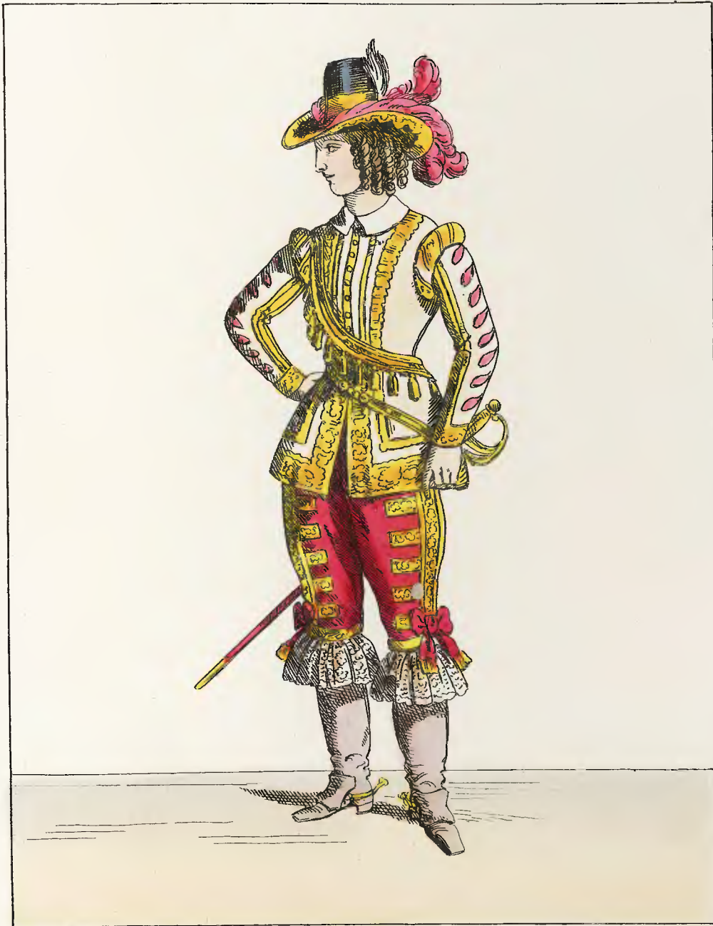
A PAGE—CHARLES 2 nd —LOUIS 14 th