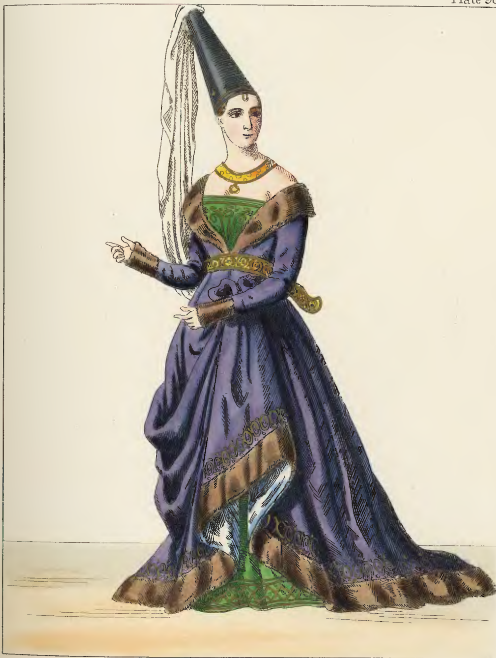
ISABELLA QUEEN OF EDWARD 2 nd 1320.

Published by T. HLACY, 89, Strand, London.