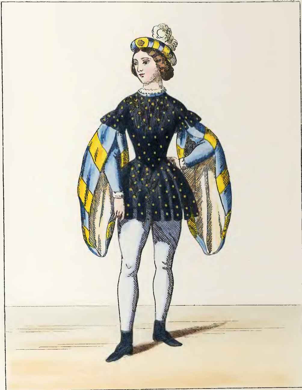
PAGE-IN THE ENCHANTRESS.