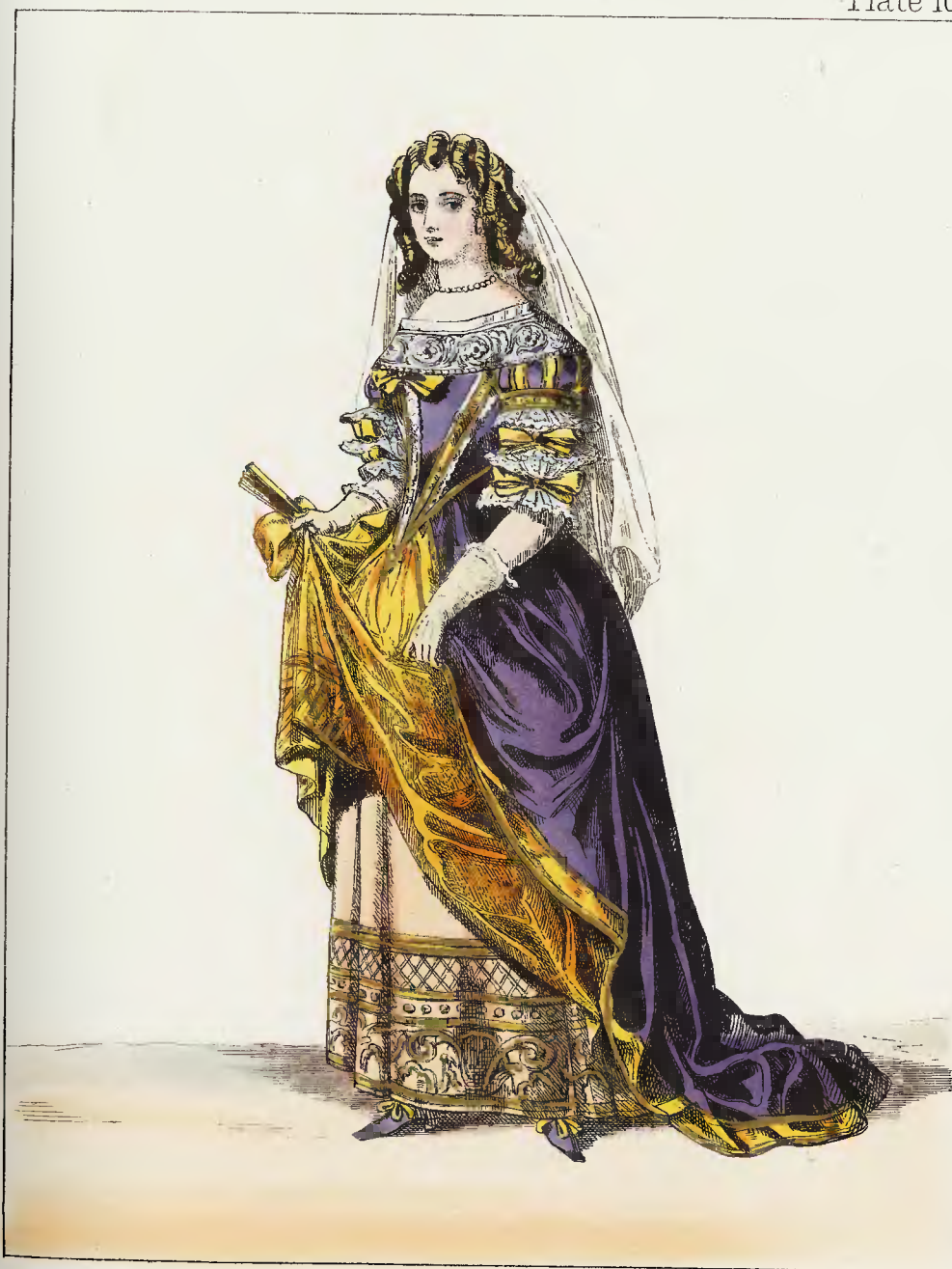
Period 1660, CHARLES 2 nd LOUIS 14 th Published by T. LACY, 89, Strand London.