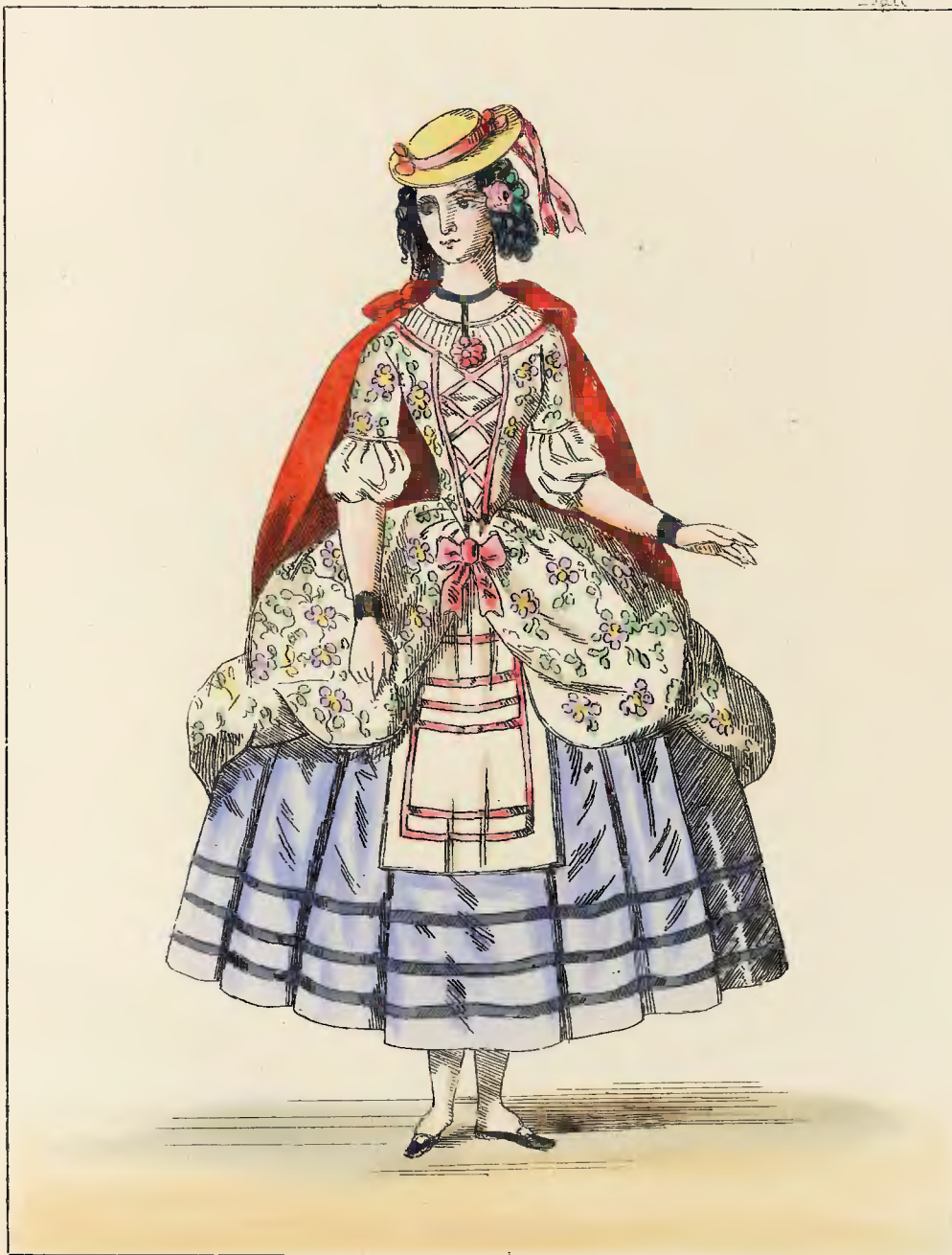
A COUNTRY GIRL,

Published by T.H. LACY 69, Strand London.