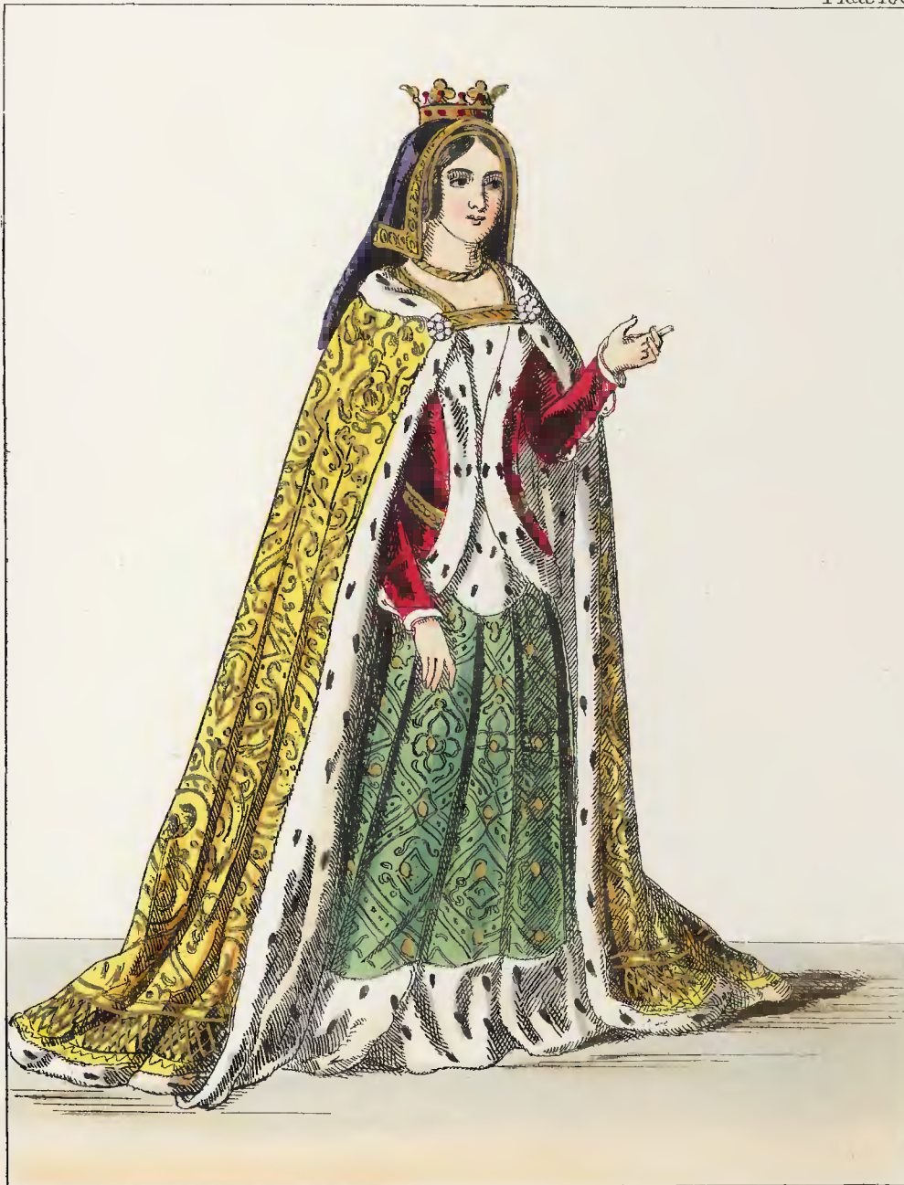
SPAIN—ISABELLA OF CASTILE—1487.

Published by T. H. LACY, 89, Strand, London.