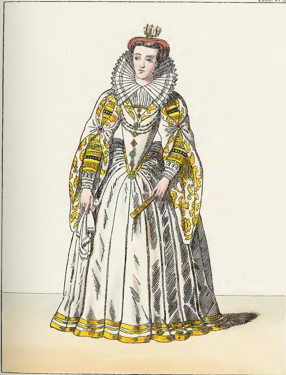
FRANCE—LADY OF RANK—1581