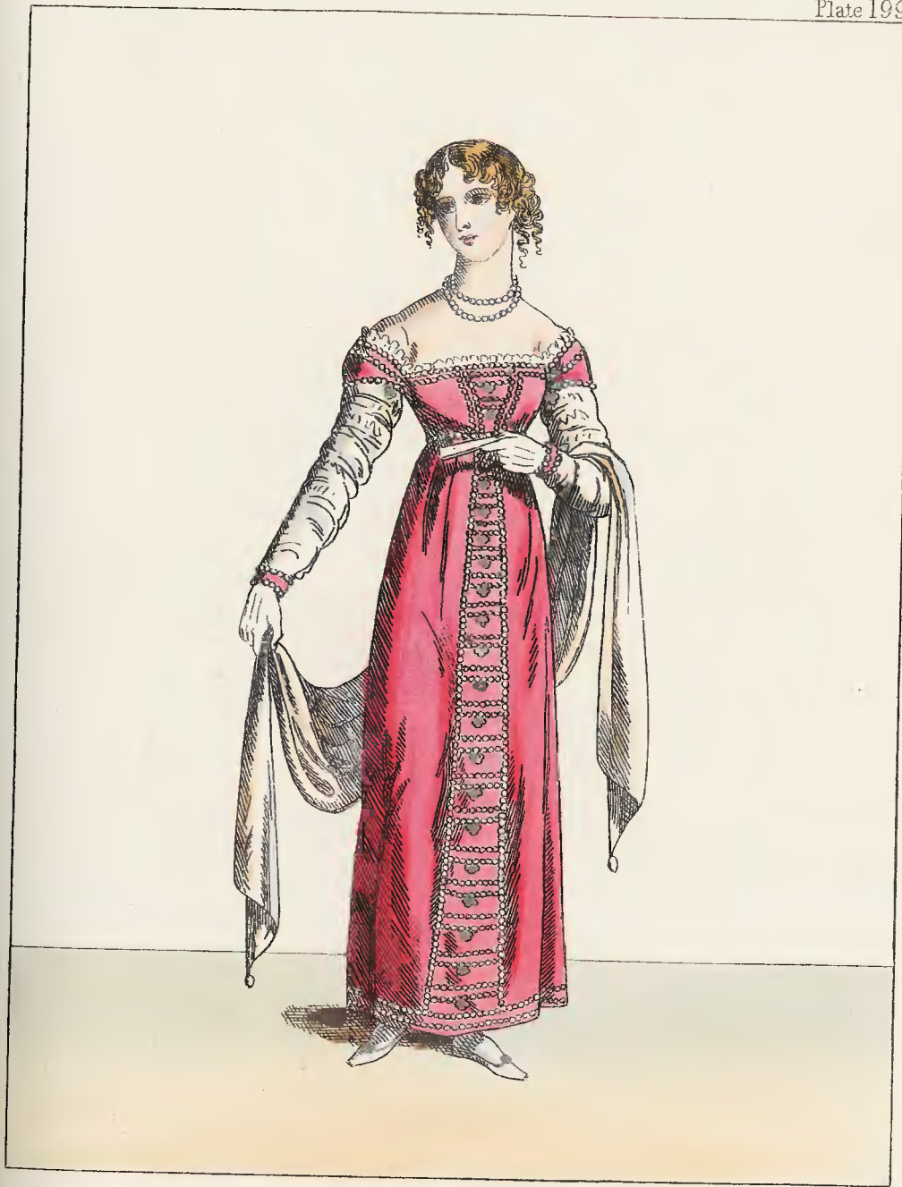
LADY—1814, (Evening Dress)

Published by T.H. LACY, 89, Strand, London.