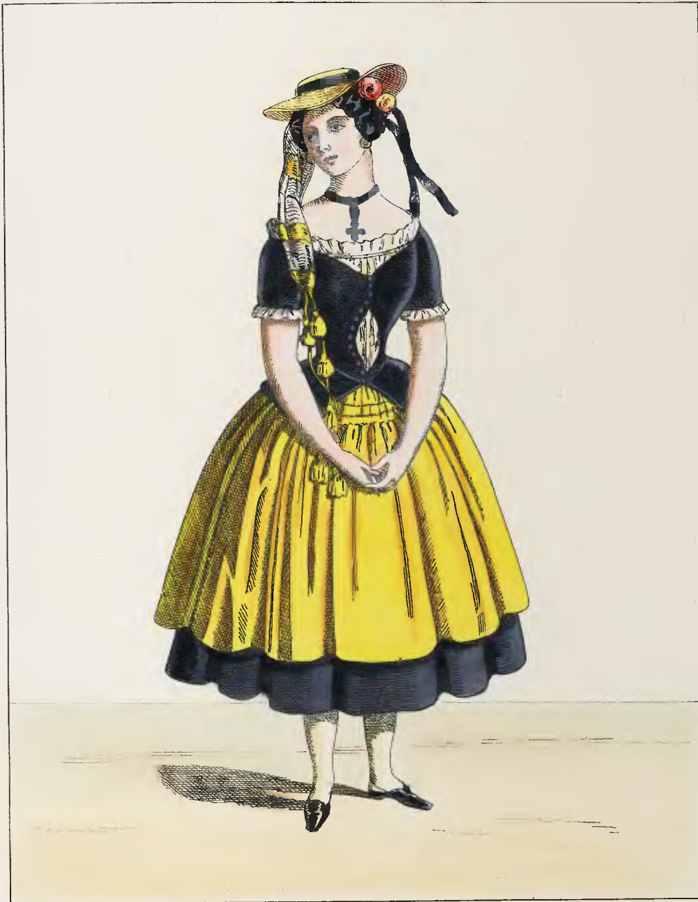
GIRL OF CATALONIA