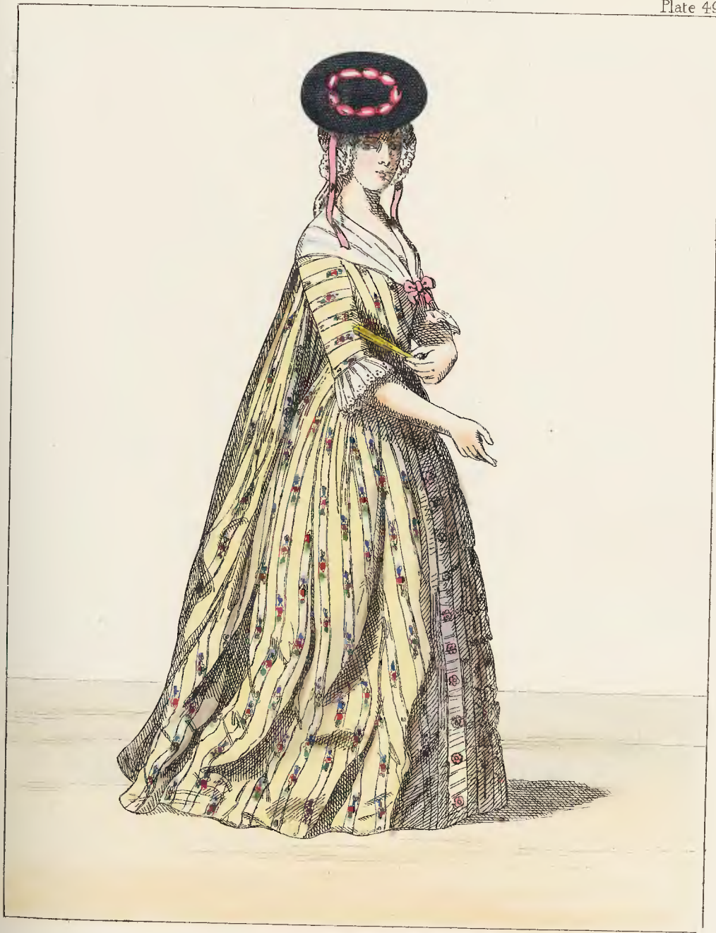
ENGLISH LADY, Period 1740, ( Walking Dress George 2. nd )