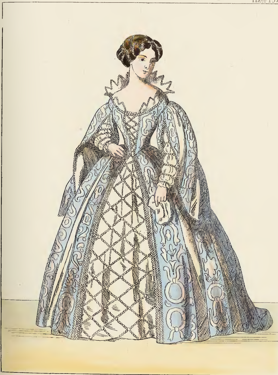
LADY OF THE COURT—ABOUT—1570.