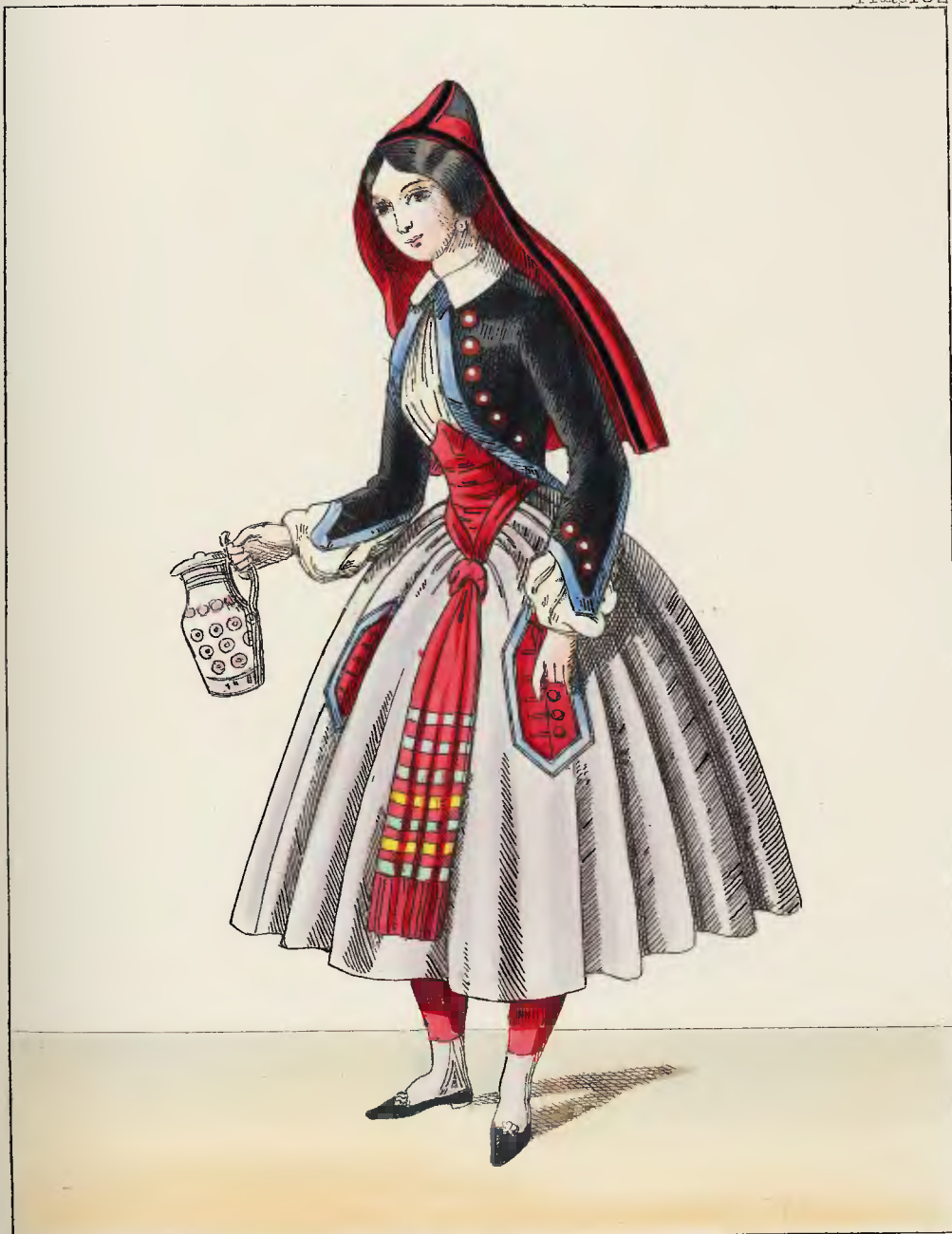
A FEMALE OF THE PYRENEES

Published by T. H. LACY 89 Strand London.