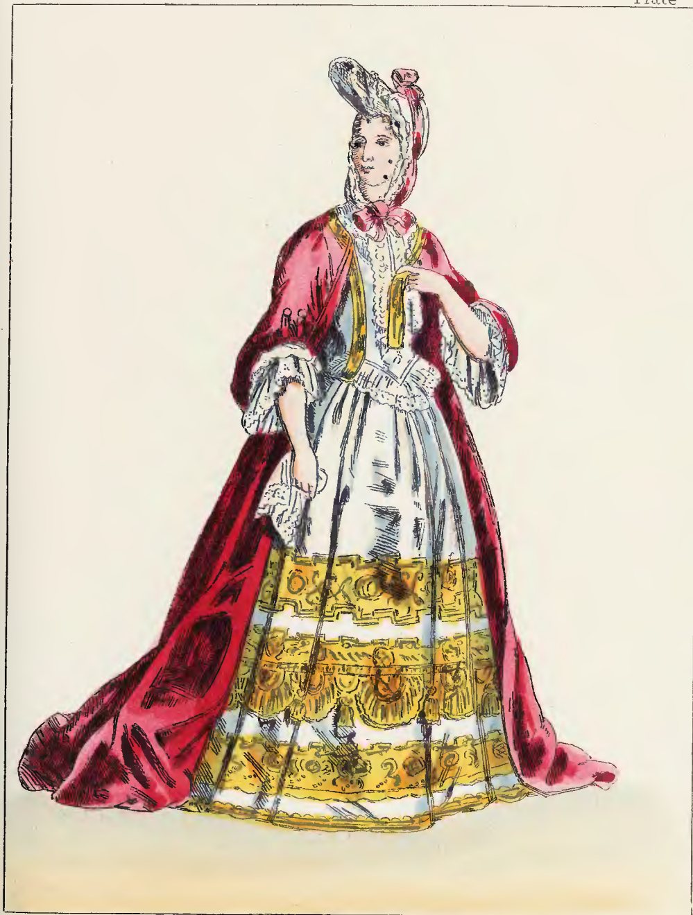
LADY OF RANK—1696.

( England—William & Mary—France—Louis 14 th . )