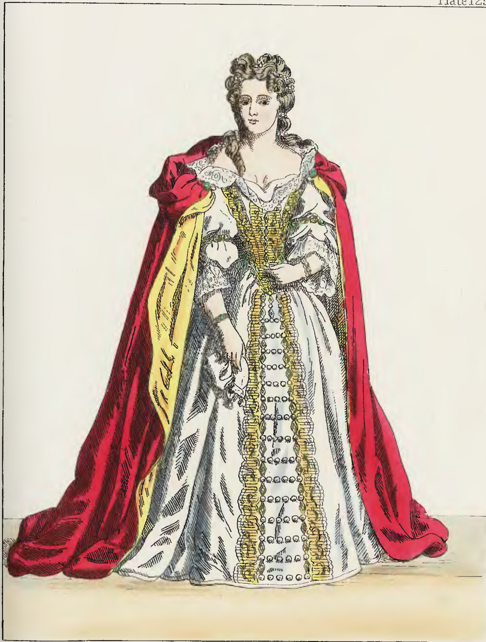
ENGLAND—MARIA BEATRIX—QUEEN OF JAMES 2 nd