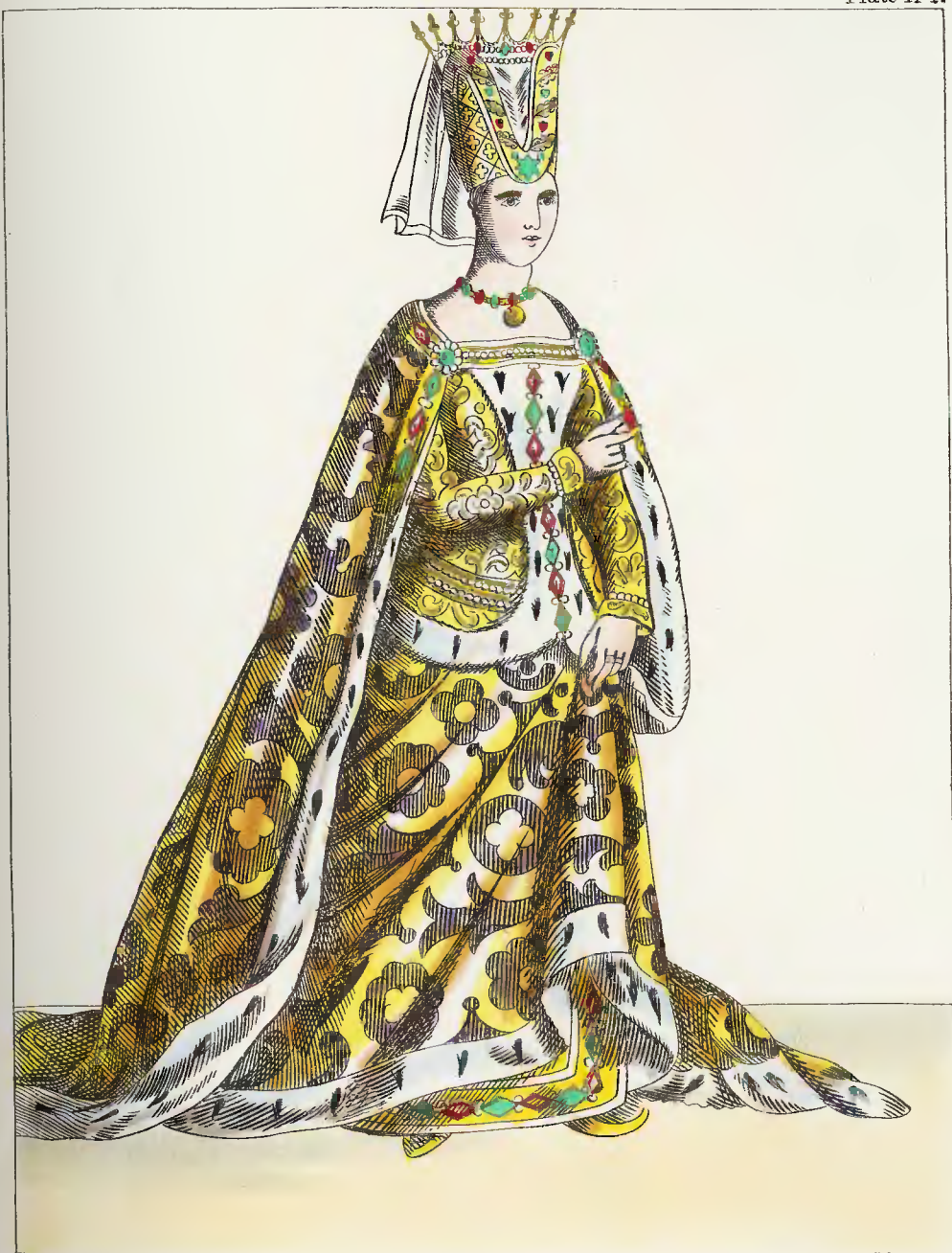
FRANCE-QUEEN ISABEAU OF BAVARIA - 1420

(England Henry 5 th - France Charles 6 th )