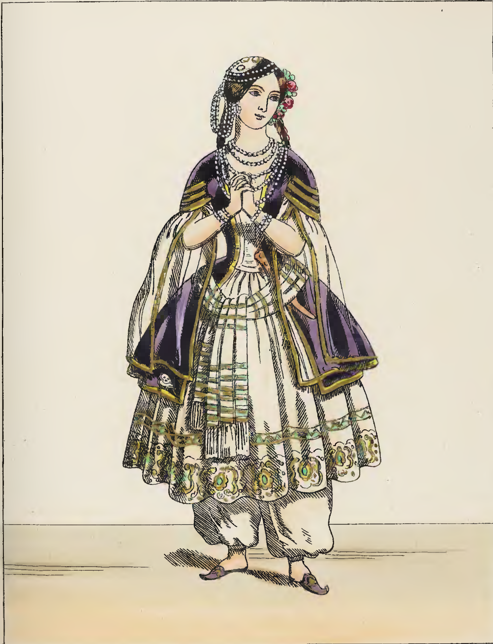
GREEK OR TURKISH LADY, ( Lavoye as Haydée )

Published by T.H.LACY, 89, Strand, London