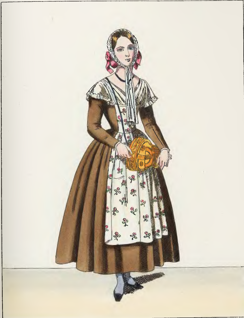
A SAVOYARD ORGAN GIRL