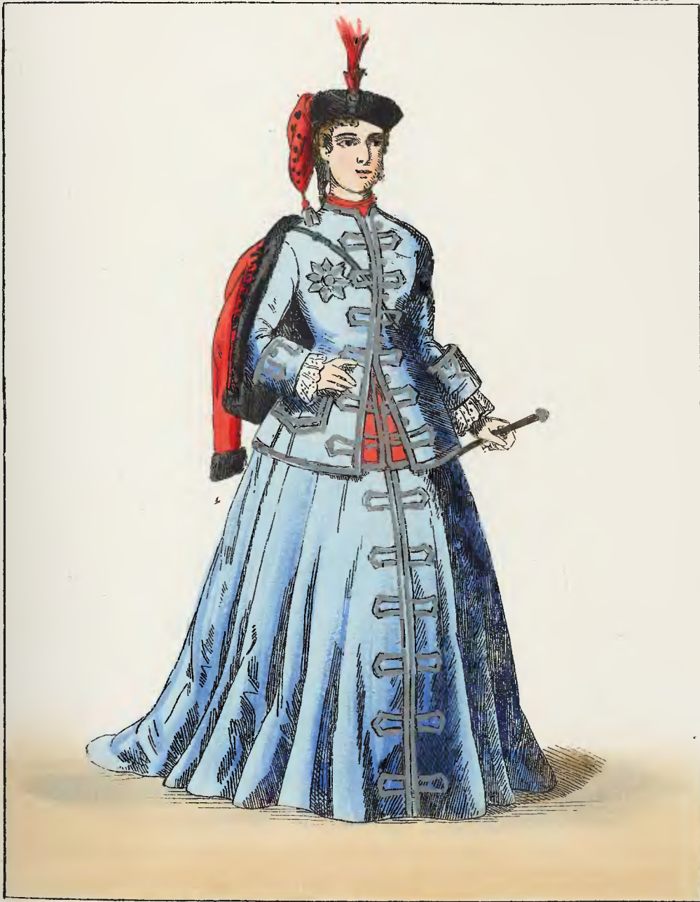
THE GRAND DUCHESS OF GEROLSTIEN, ( Schneider-15 t Dress )

Published by T.H.LACY, 89, Strand, London.