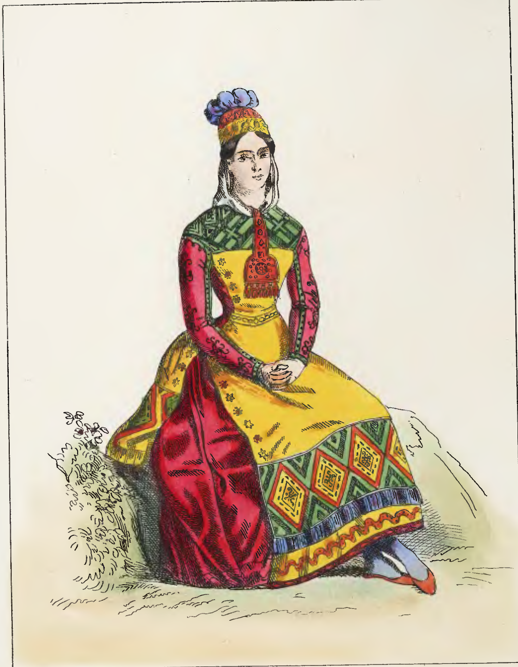
TARTARY—A YOUNG LADY