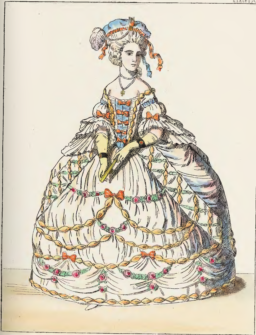
FRANCE—LADY OF THE COURT—1786