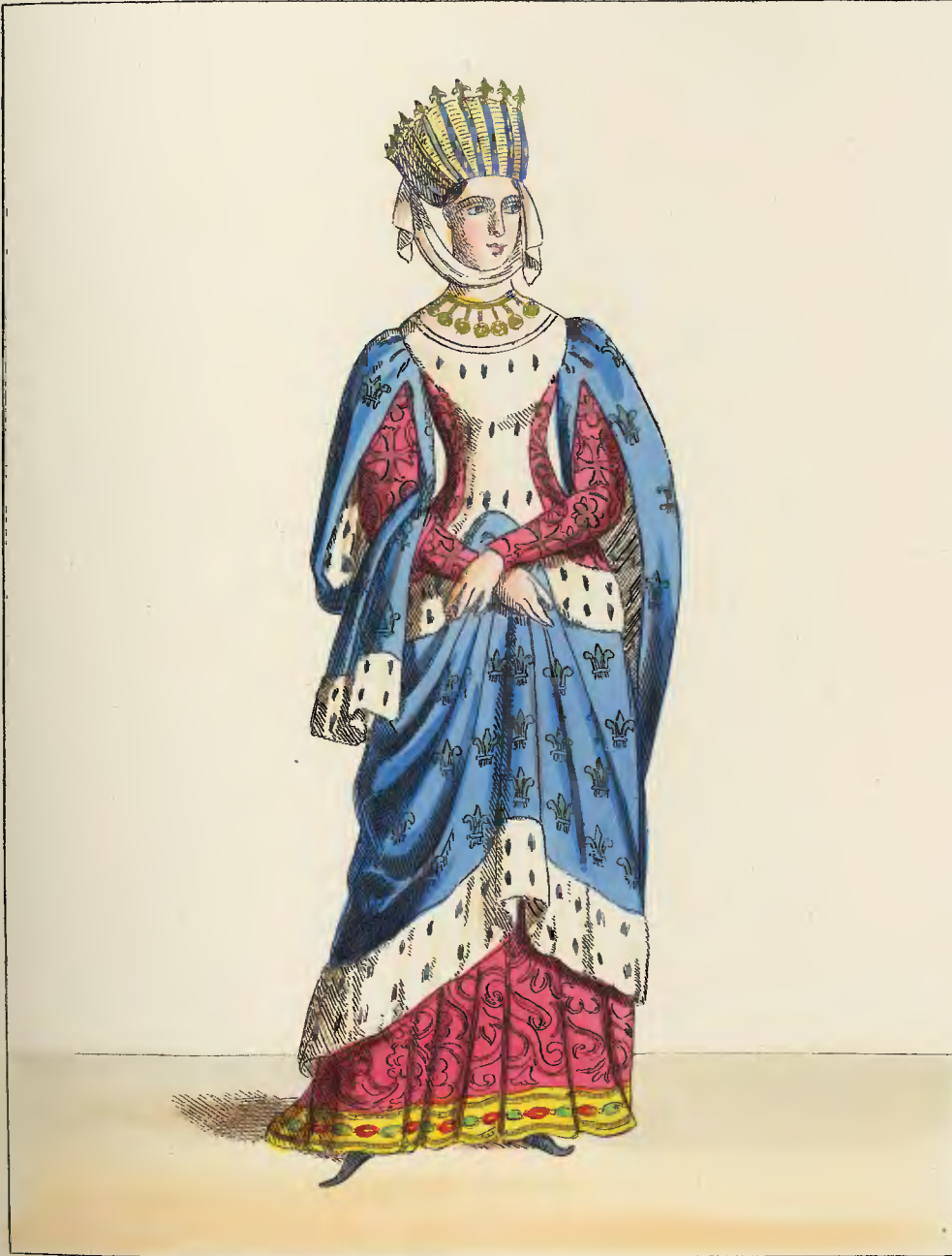
LADY OF RANK—1260

(England—Henry 3 rd France—Phillip 3 rd )