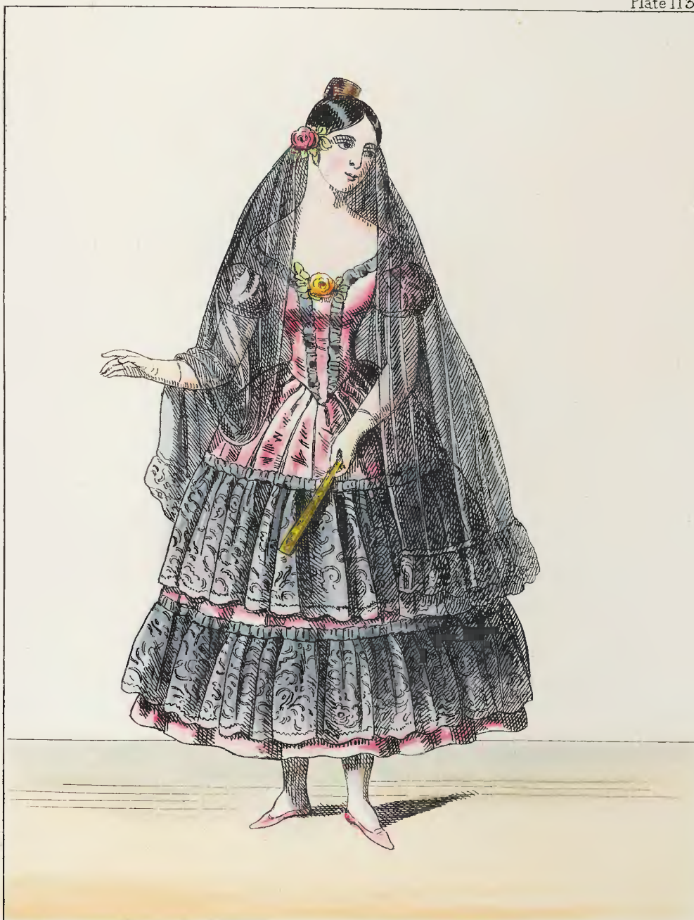
A SPANISH LADY.