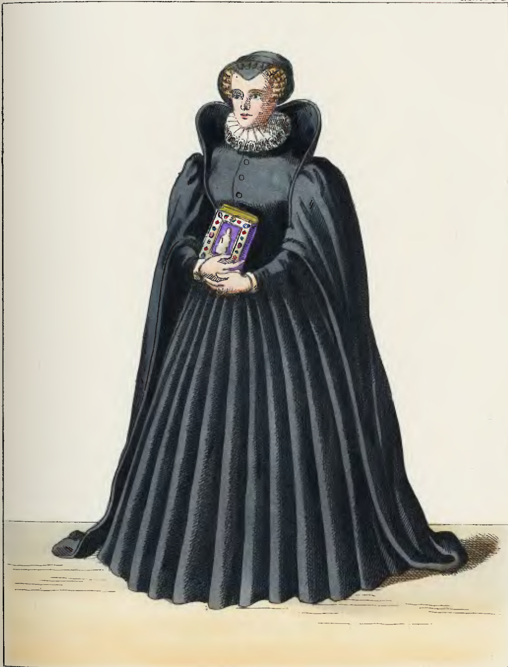
MARIE DE MEDICIS—1559

Published by T.H. LACY 89, Strand, London.