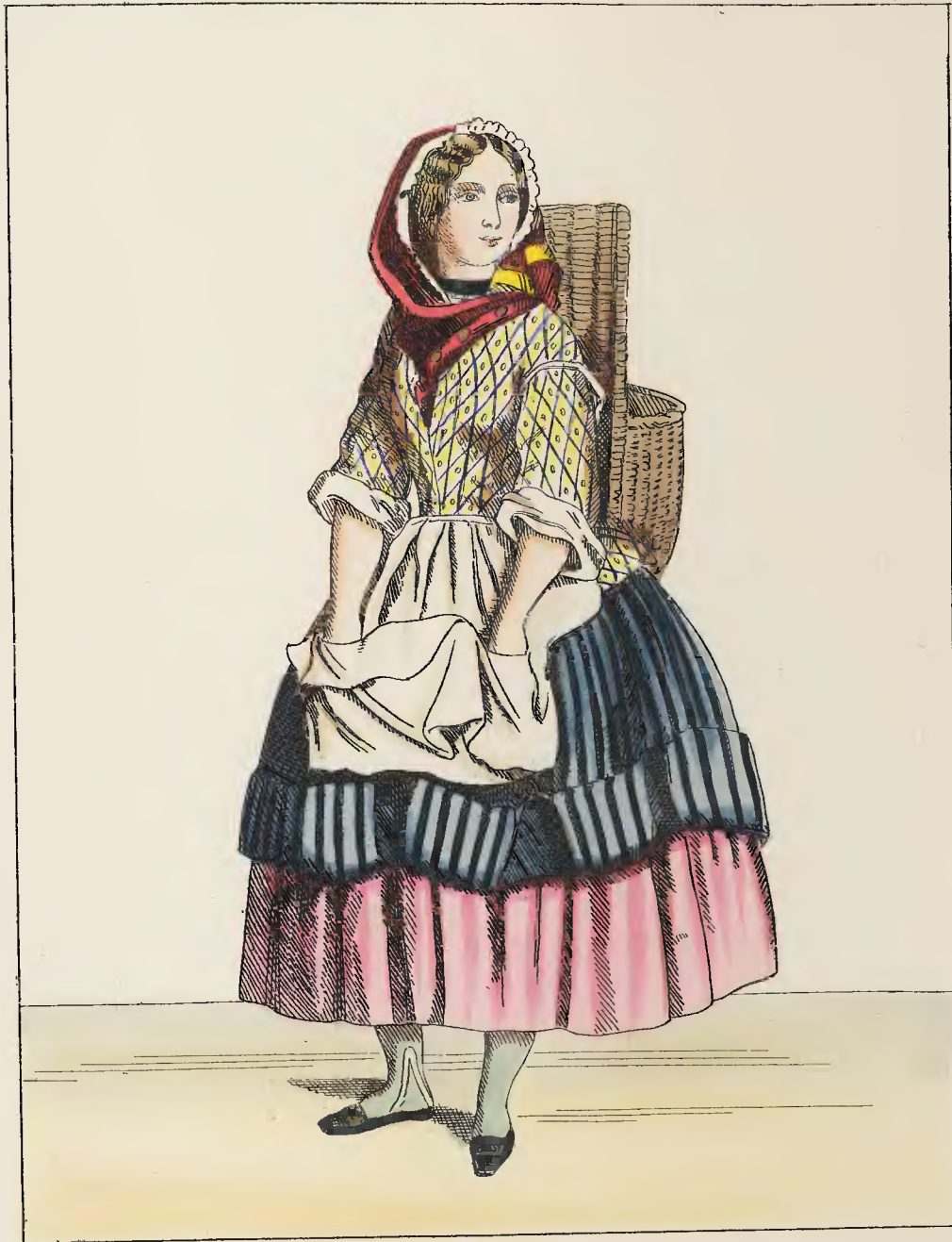
A SCOTTISH FISH WIFE.