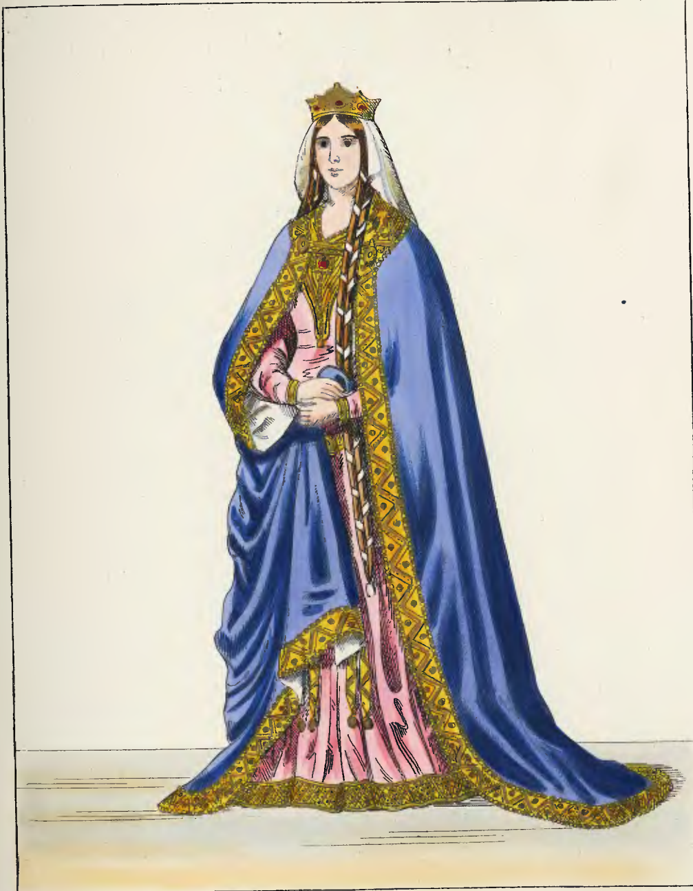
FRANCE—JUDITH, QUEEN OF LOUIS 1 st —842,