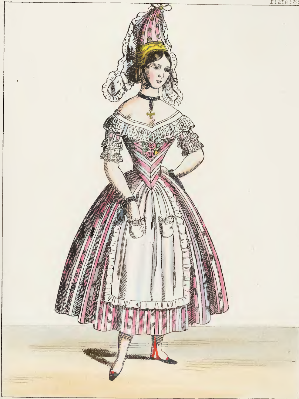
FRANCE—A YOUNG PEASANT OF NORMANDY.