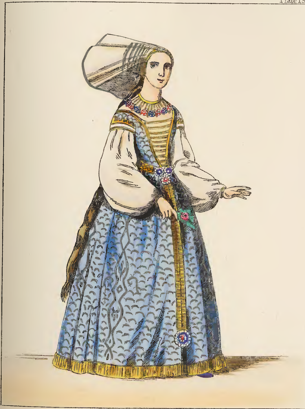
1483 — A LADY OF RANK — Richard 3 rd