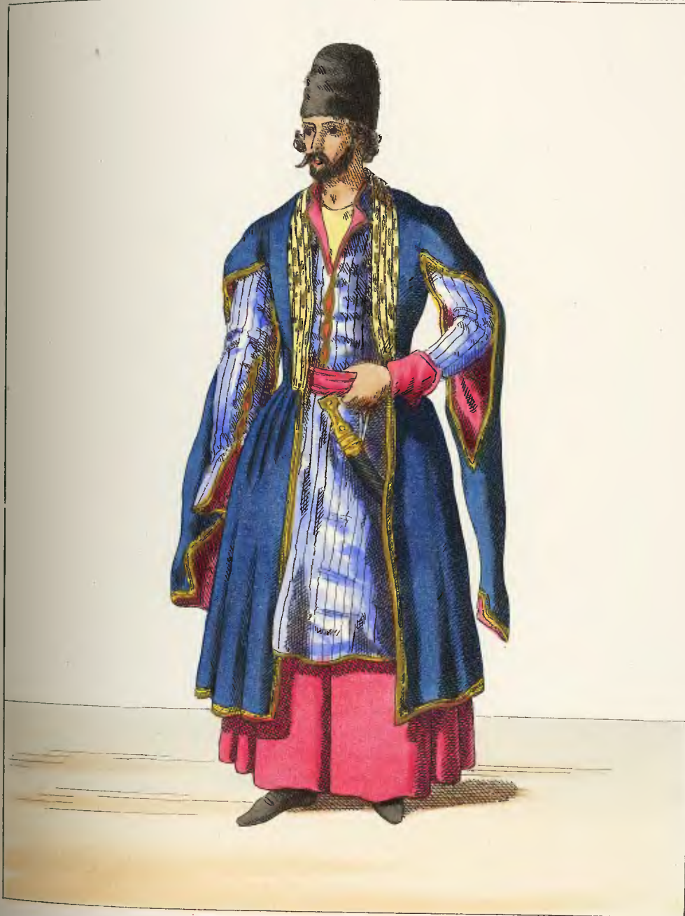
A GEORGIAN NOBLE