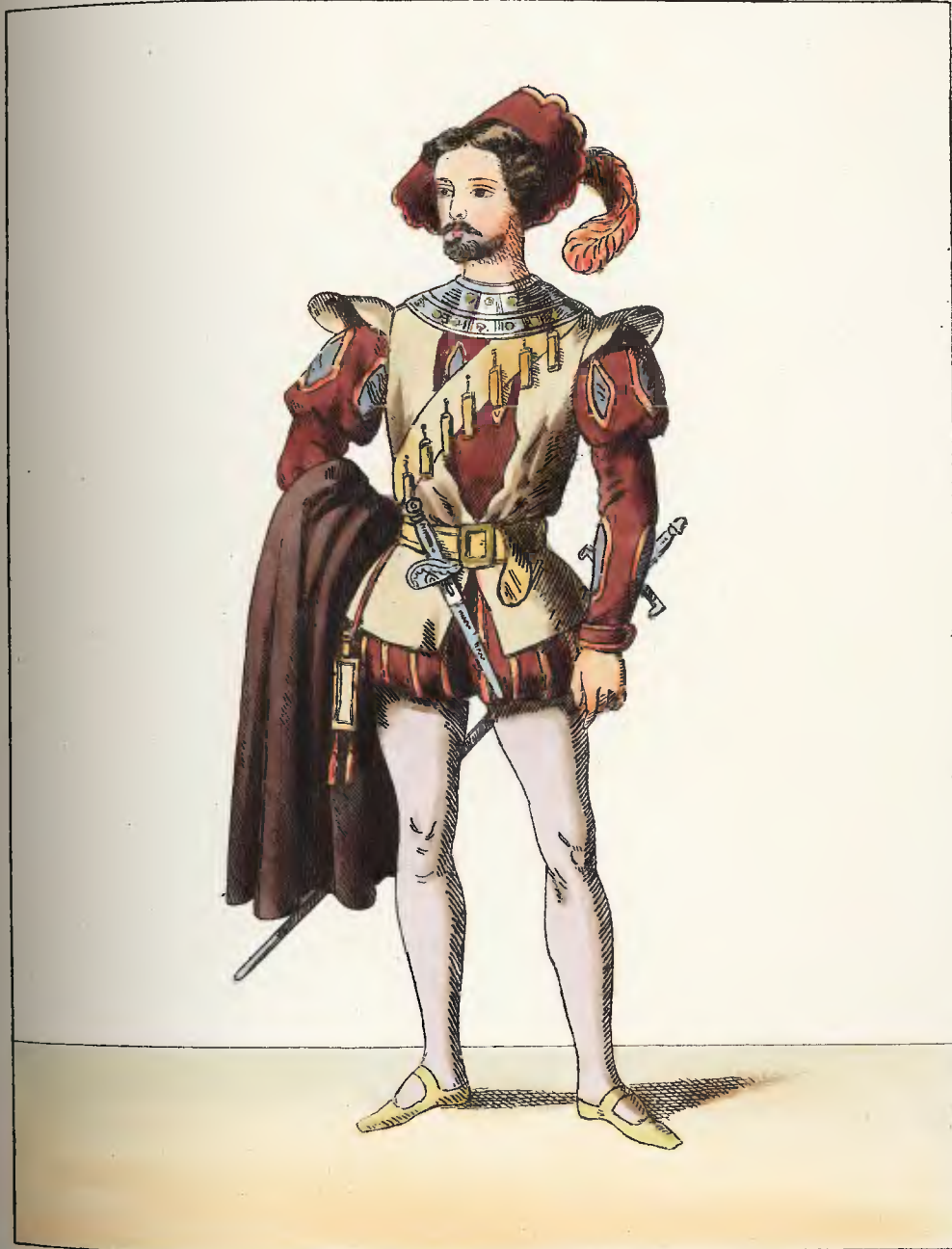
A GERMAN SOLDIER—1575, ( Valentine—Faust )