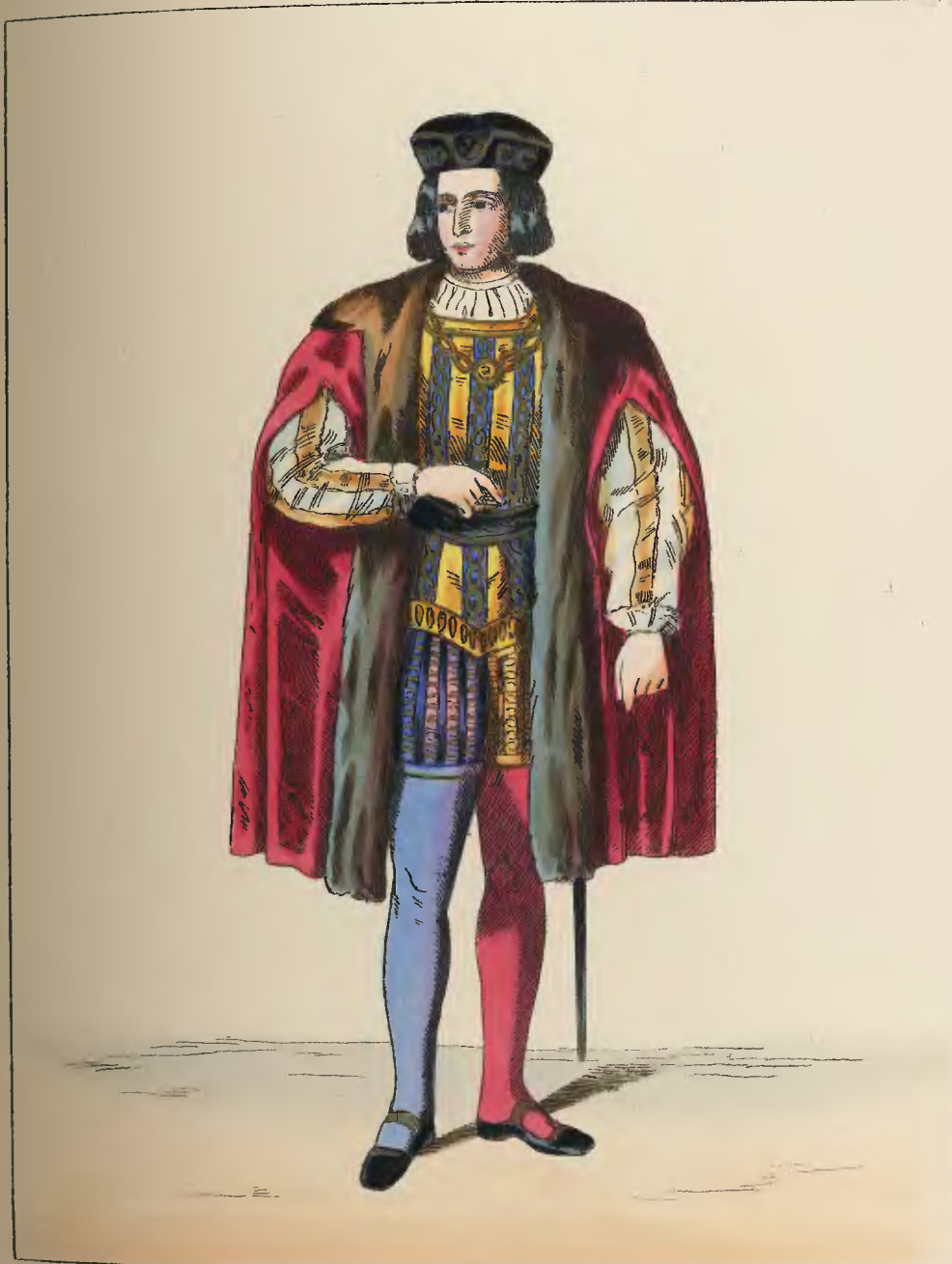
A NOBLE — 1510.

( England Henry 7 th —France Louis 12 th )