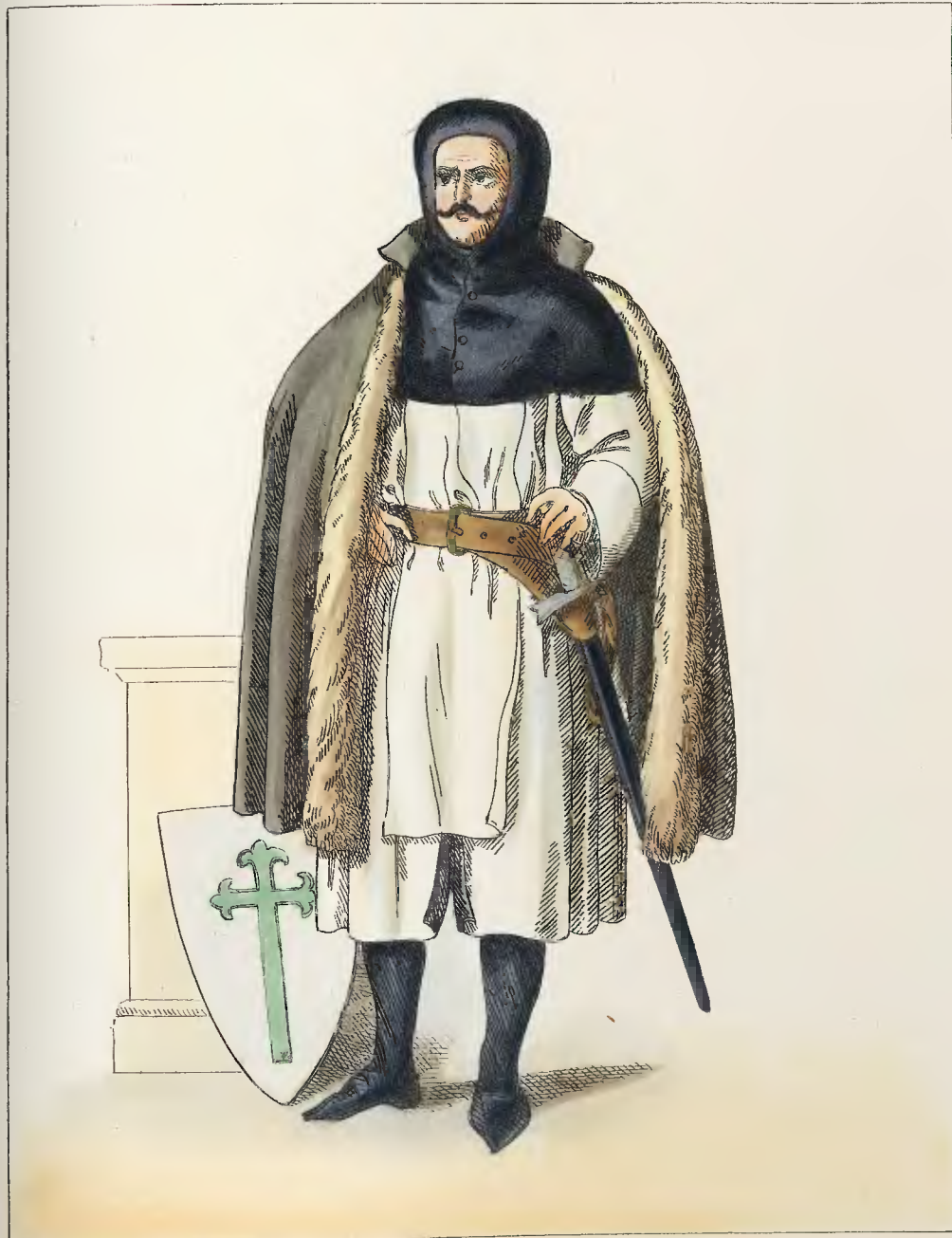
SPAIN — A KNIGHT OF CALATRAVA—1300

Published by T.H.LACY, 89, Strand, London.