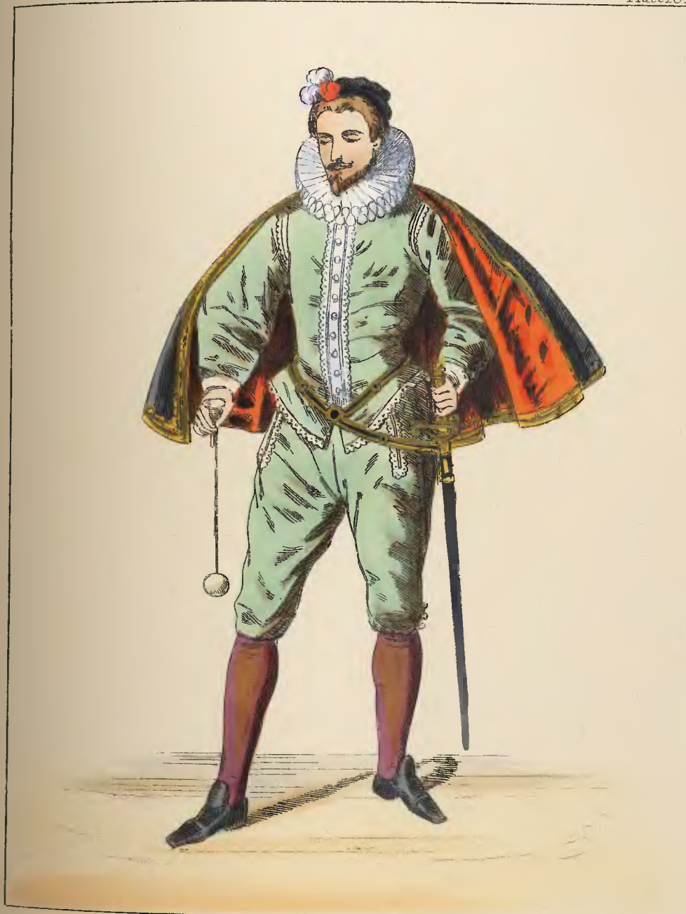
A NOBLEMAN — 1586

( England — Elizabeth — France — Henry 3 rd )