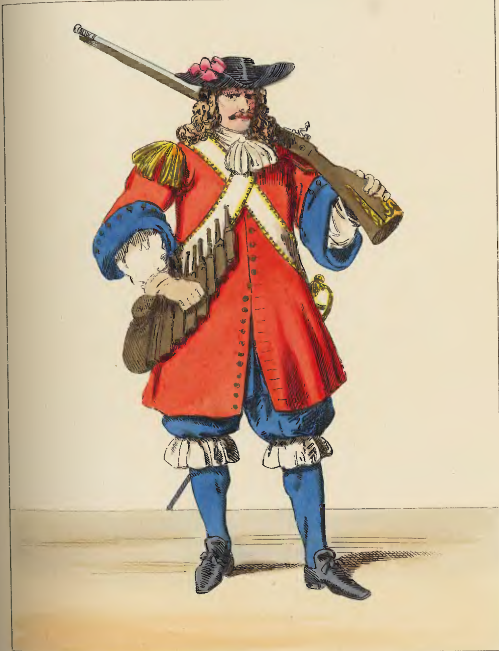
BRITISH ARMY—A MUSKETEER—1680.