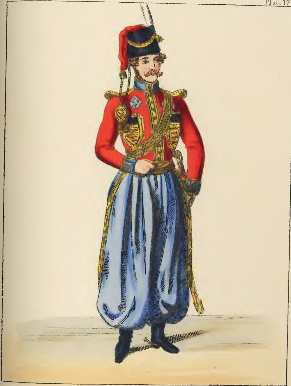
'RUSSIA—A COSSACK OFFICER.—1815,