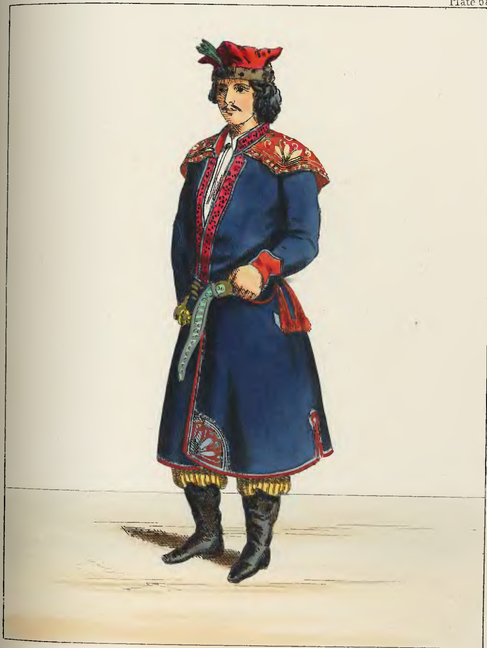
A POLISH PEASANT.