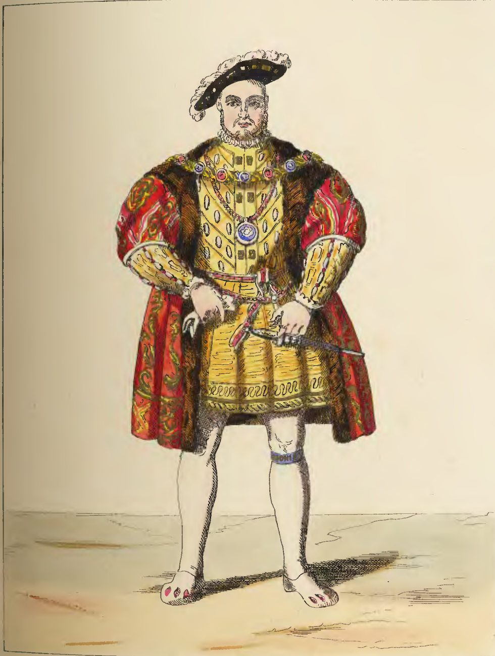
HENRY 8 TH Period 1527.