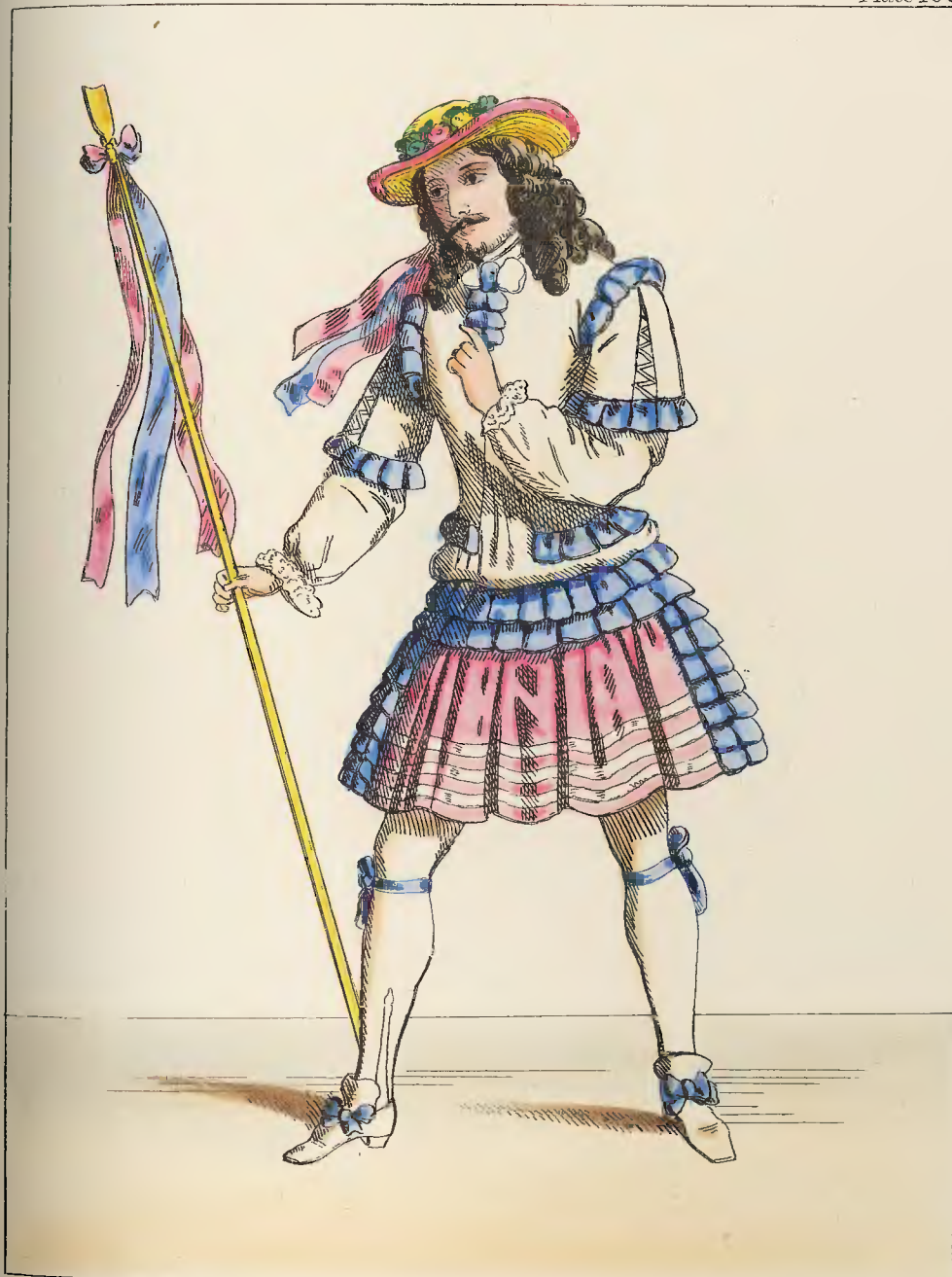
FANCY SHEPHERD'S COSTUME,