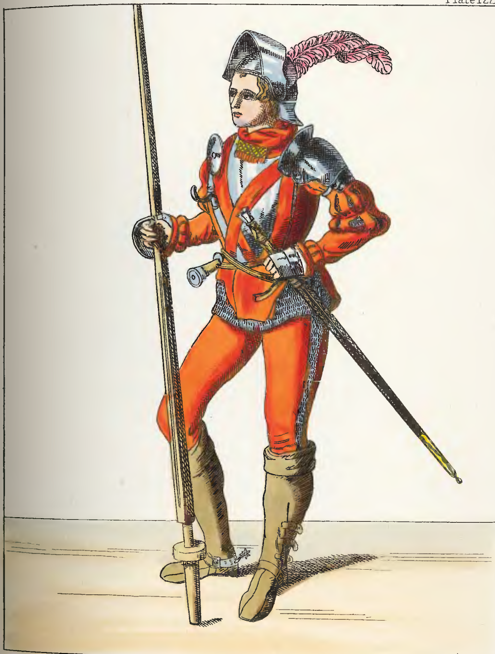
GERMANY—AN ARMED NOBLE—1512.