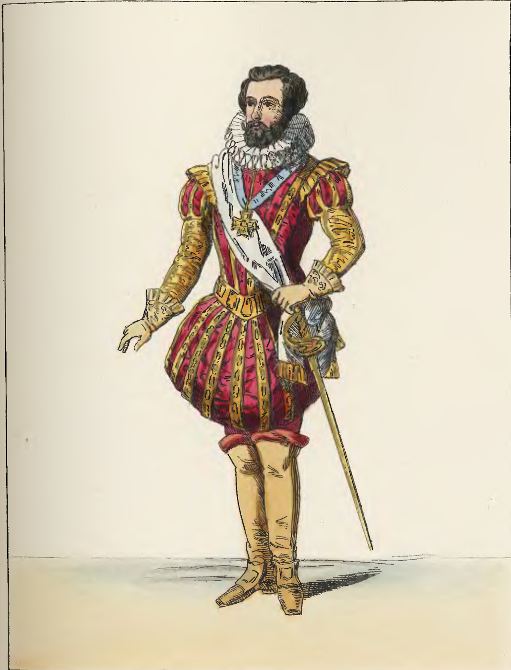
A NOBLEMAN—1605, England Elizabeth—France Henry 4 th