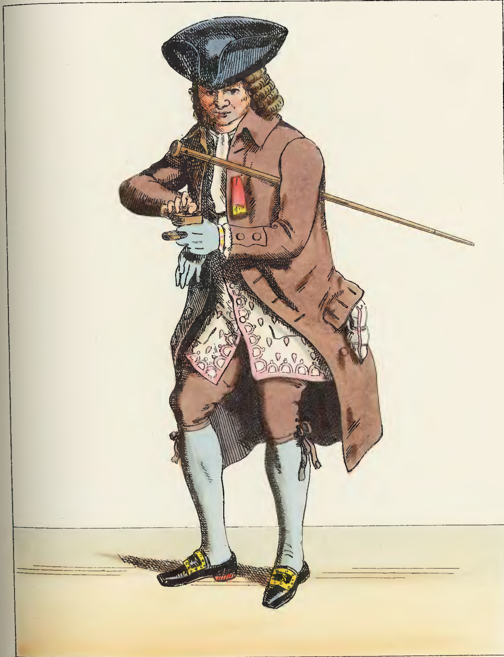
AN OLD GENTLEMAN—1770.

Published by T.H. LACY, 89, Strand, London.