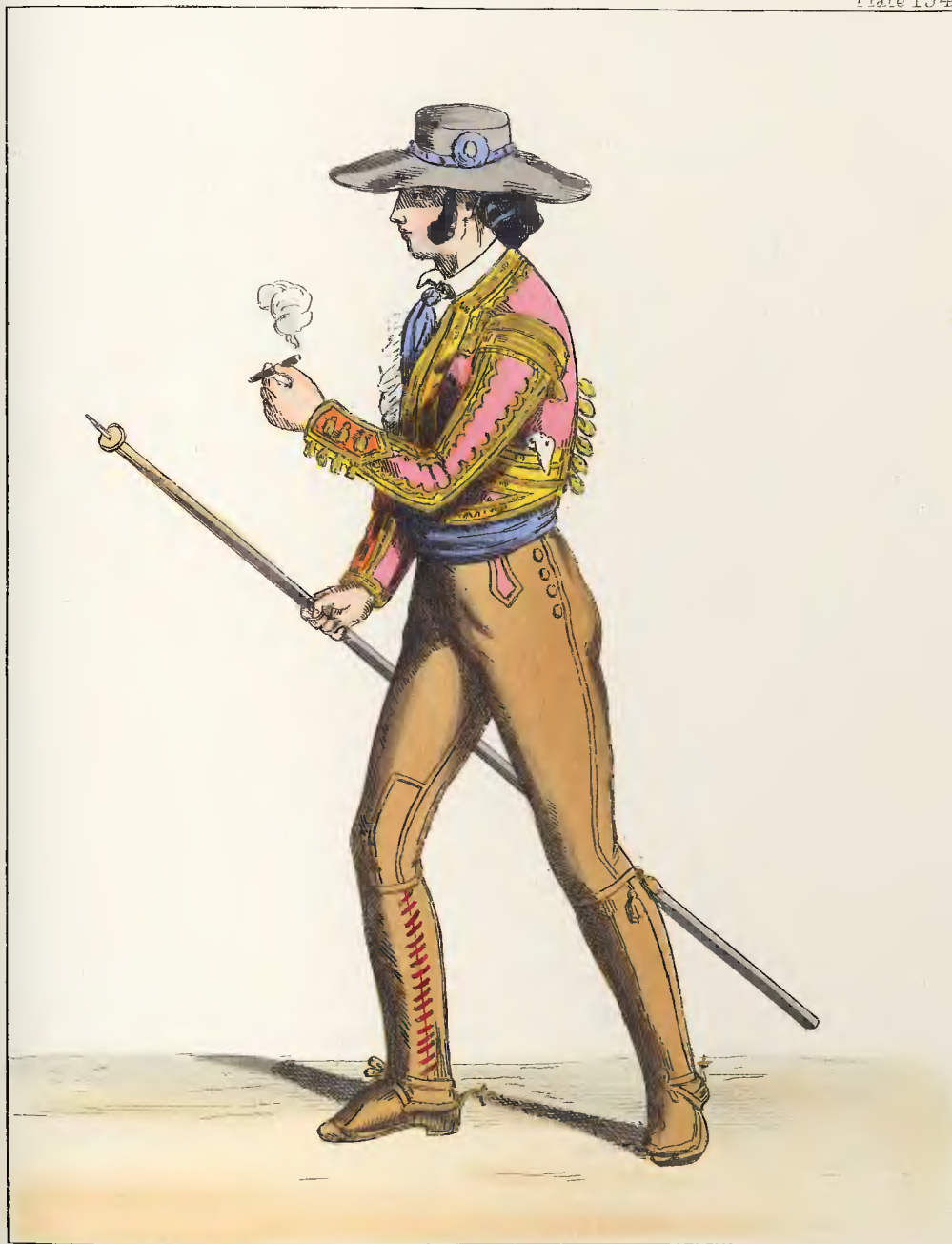
SPAIN—A BULL FIGHTER,

Published by T.H. LACY, 89, Strand, London.