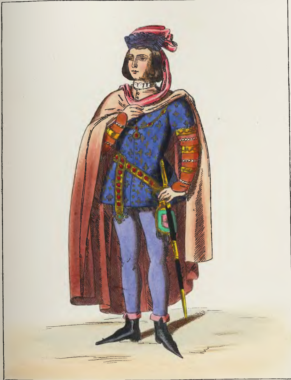
A NOBLE — 1380.

(England—Richard 2 nd —France—Charles 6 th )