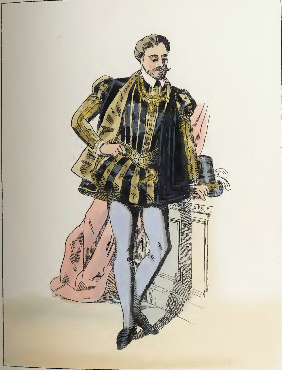
A NOBLE—1550, ( England—Mary—France—Henry 2 nd ) Published by T.H.LACY 89, Strand, London.