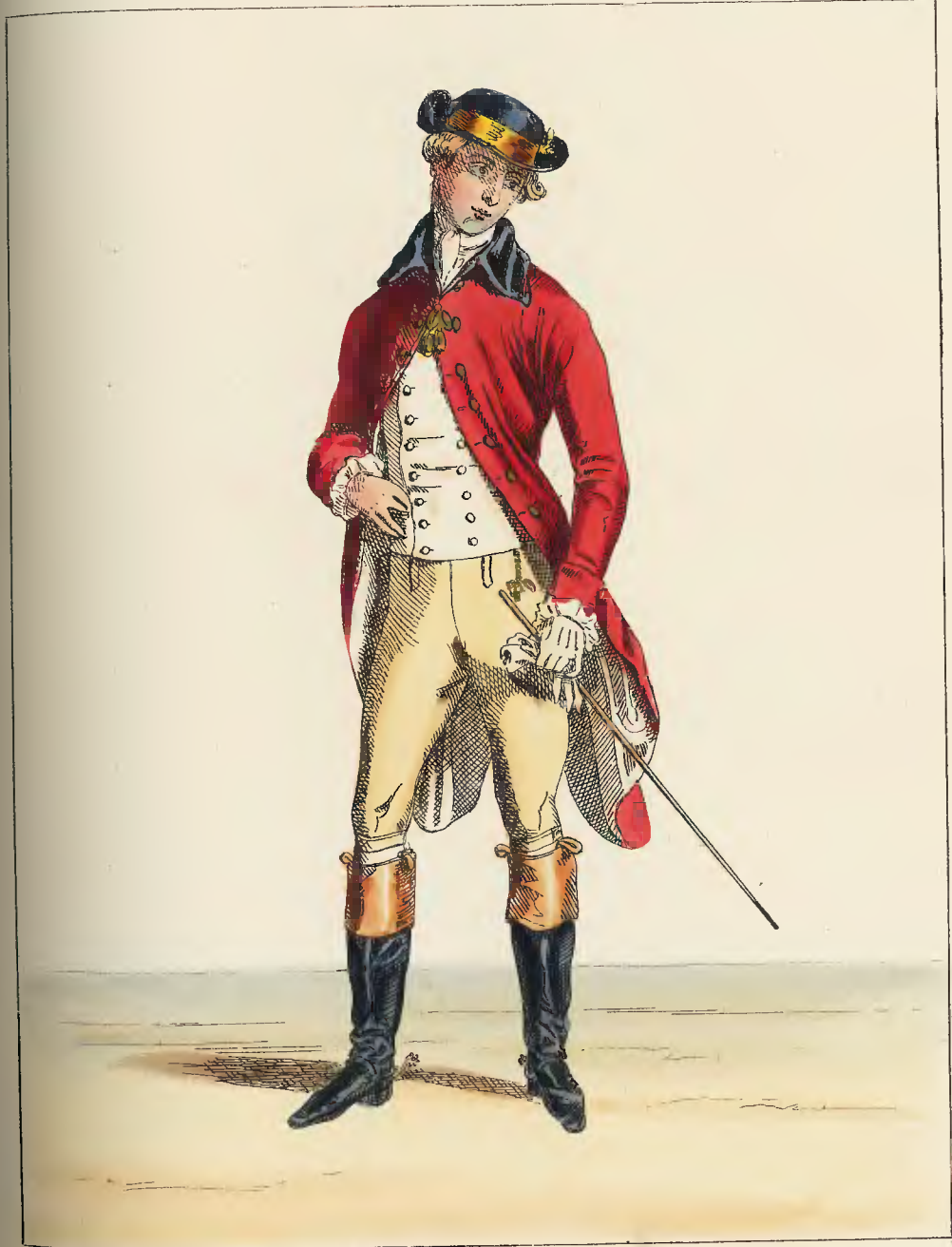
GENTLEMAN Period 1779 (George 3 rd - Louis 16 th )