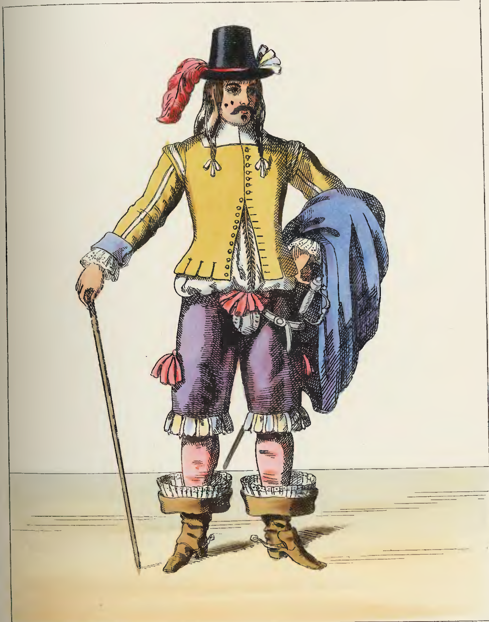
ENGLAND—A GAY GALLANT—1646