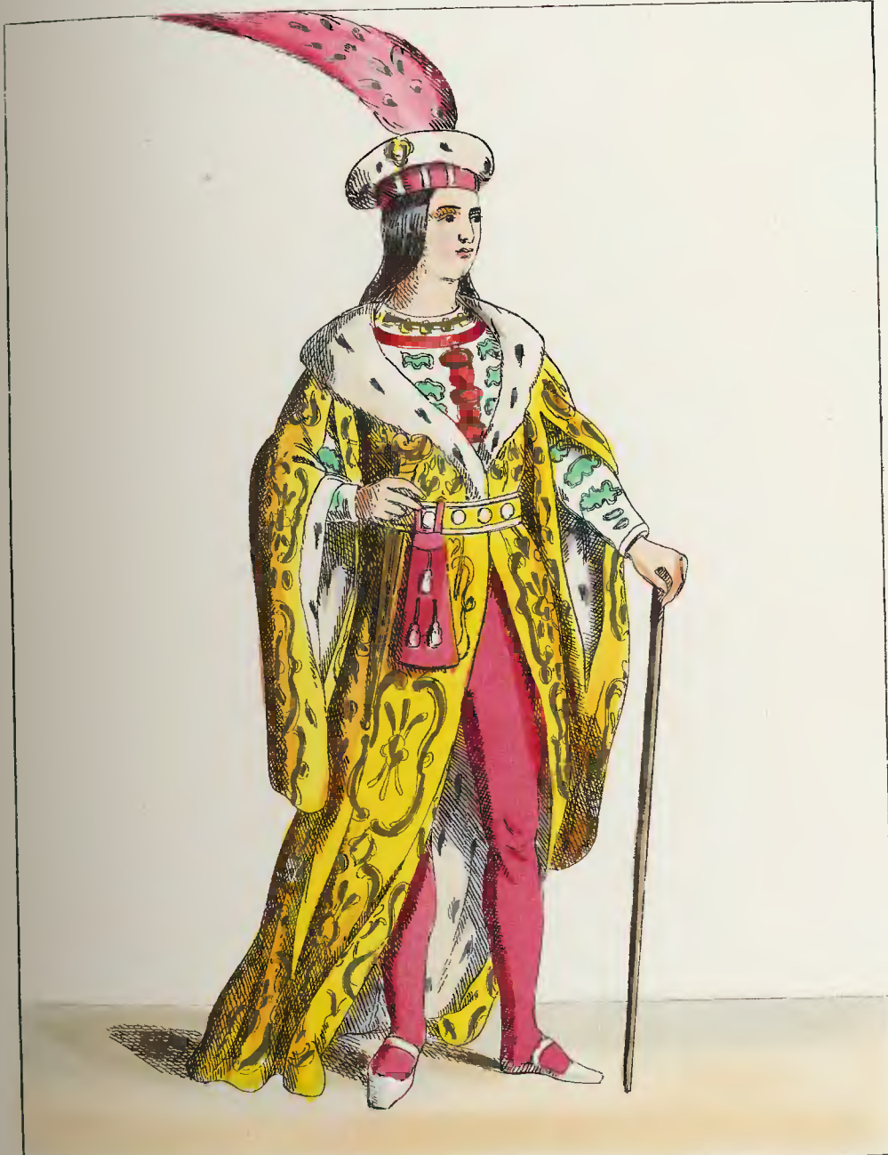
NOBLE OF THE COURT—1498.

(England, Henry 7 th —France, Charles 8 th )