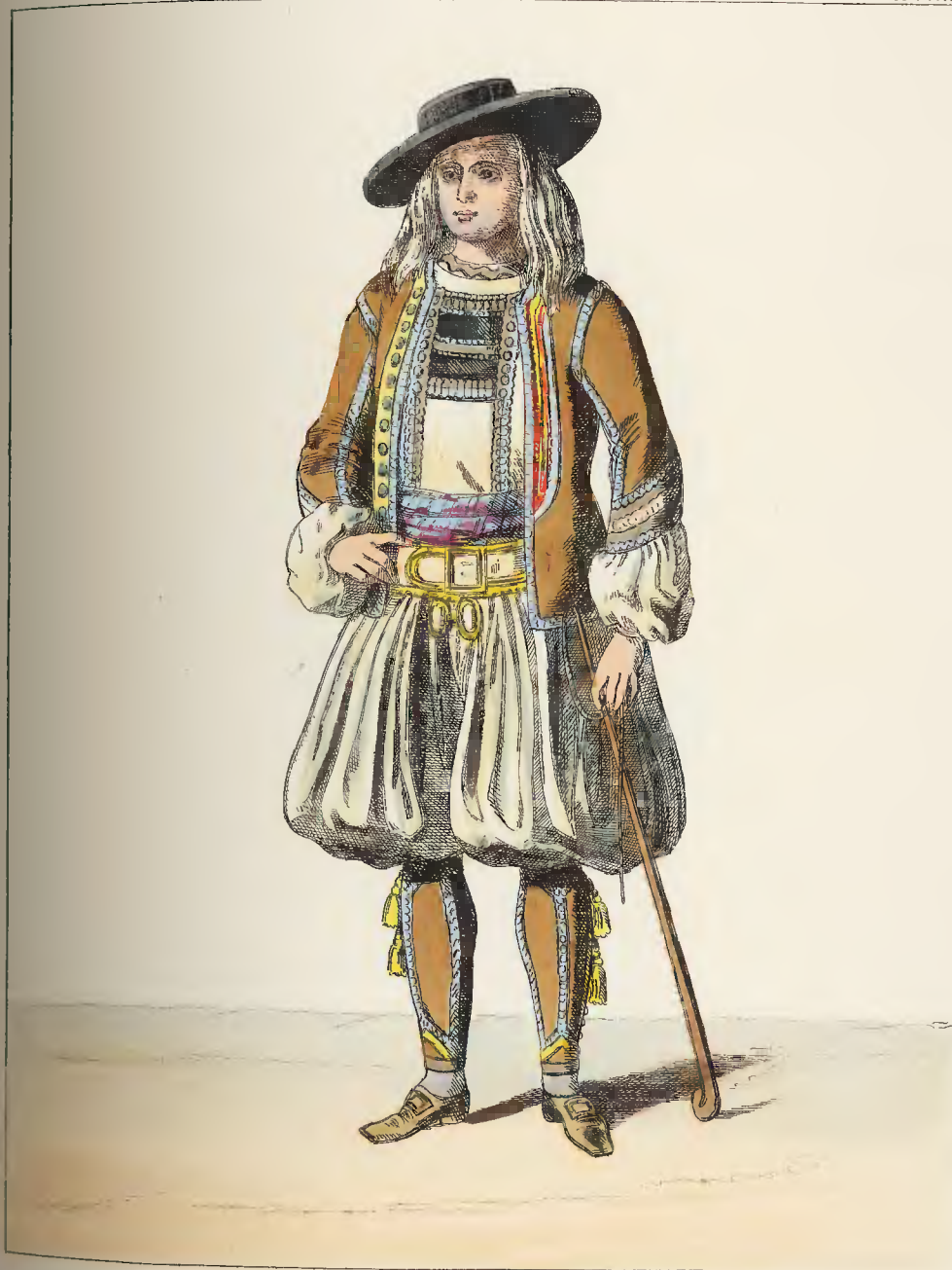
A BRETON FARMER.