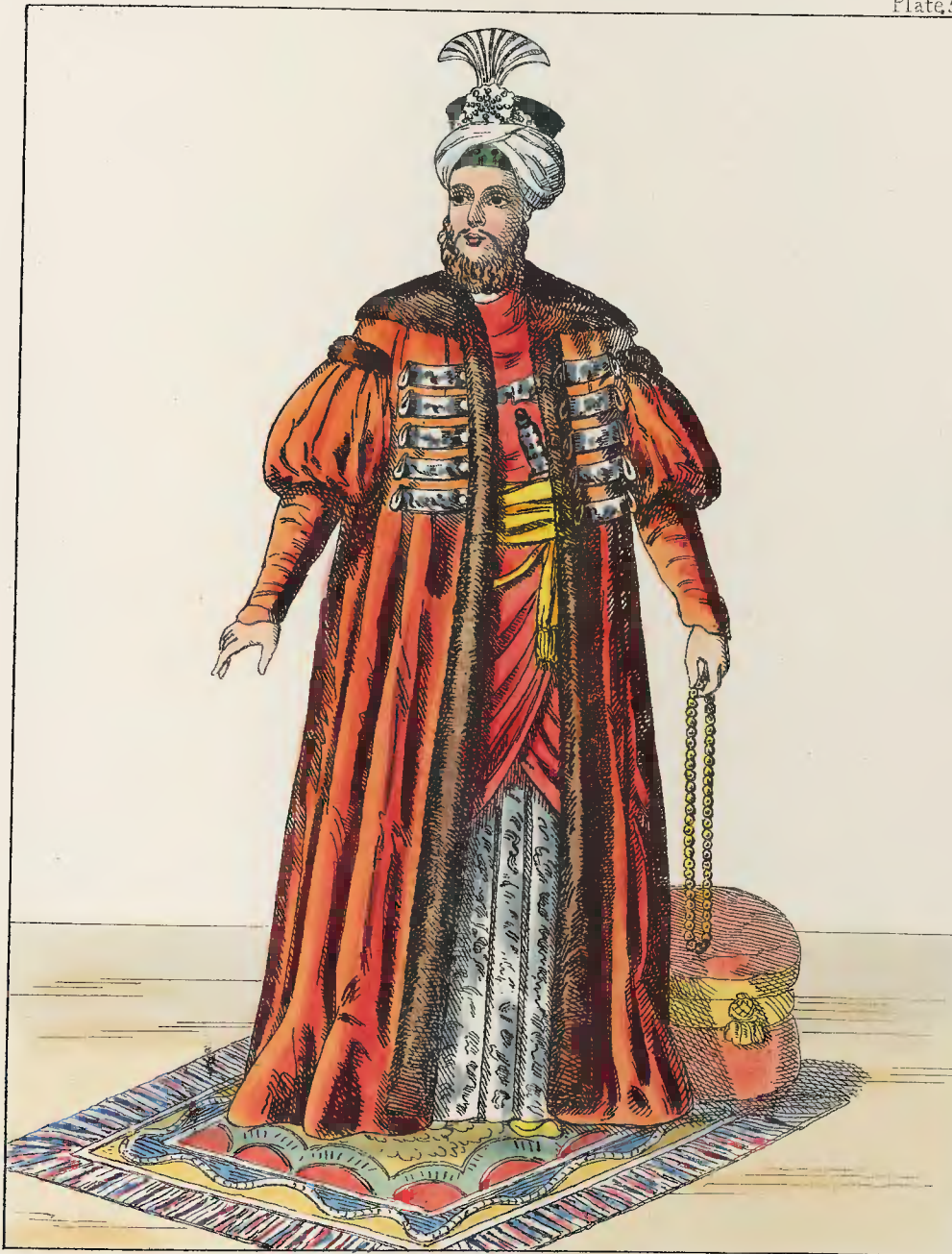
SELIM 3 rd . SULTAN OF TURKEY-1795.