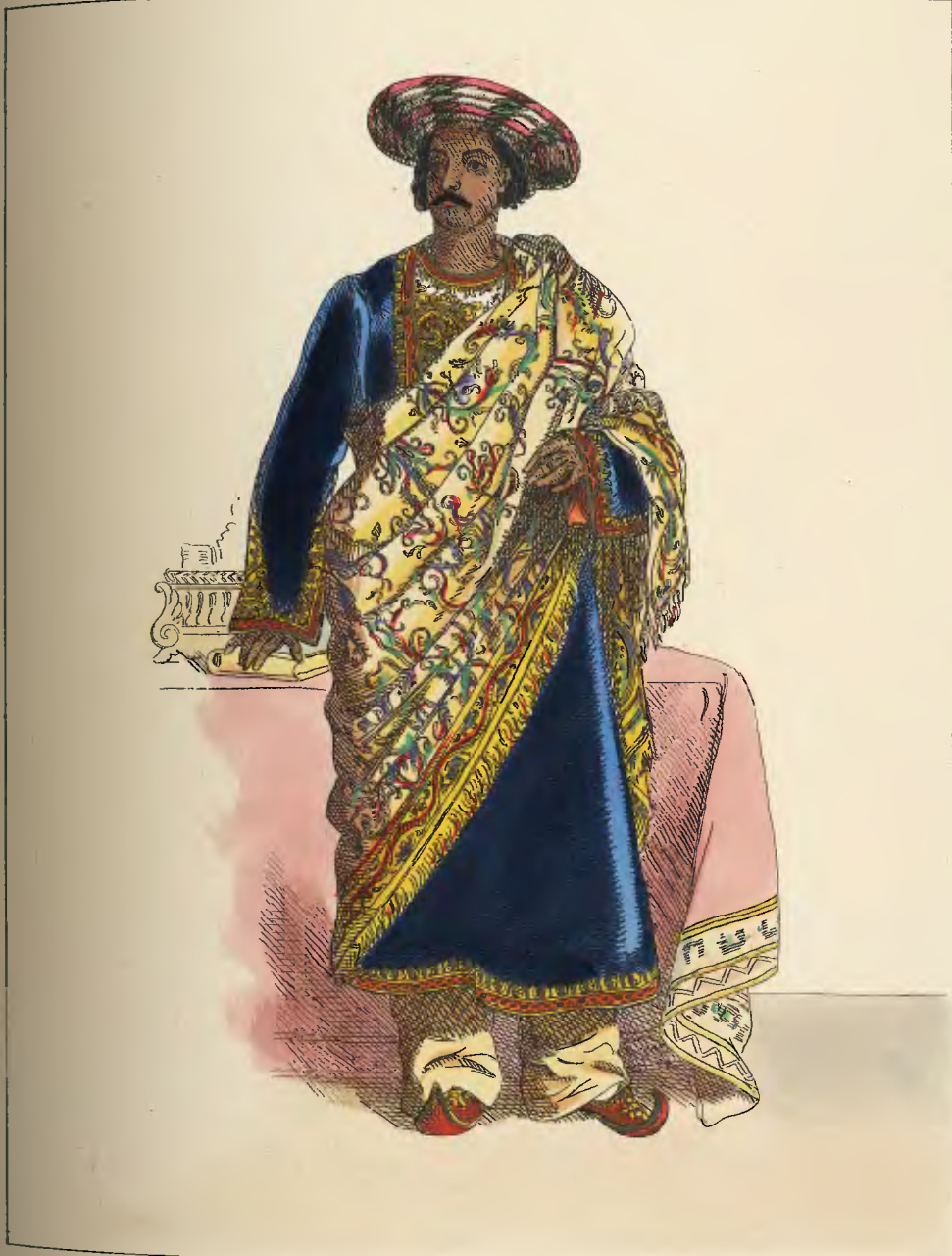
HINDOO OF RANK ( Modern )