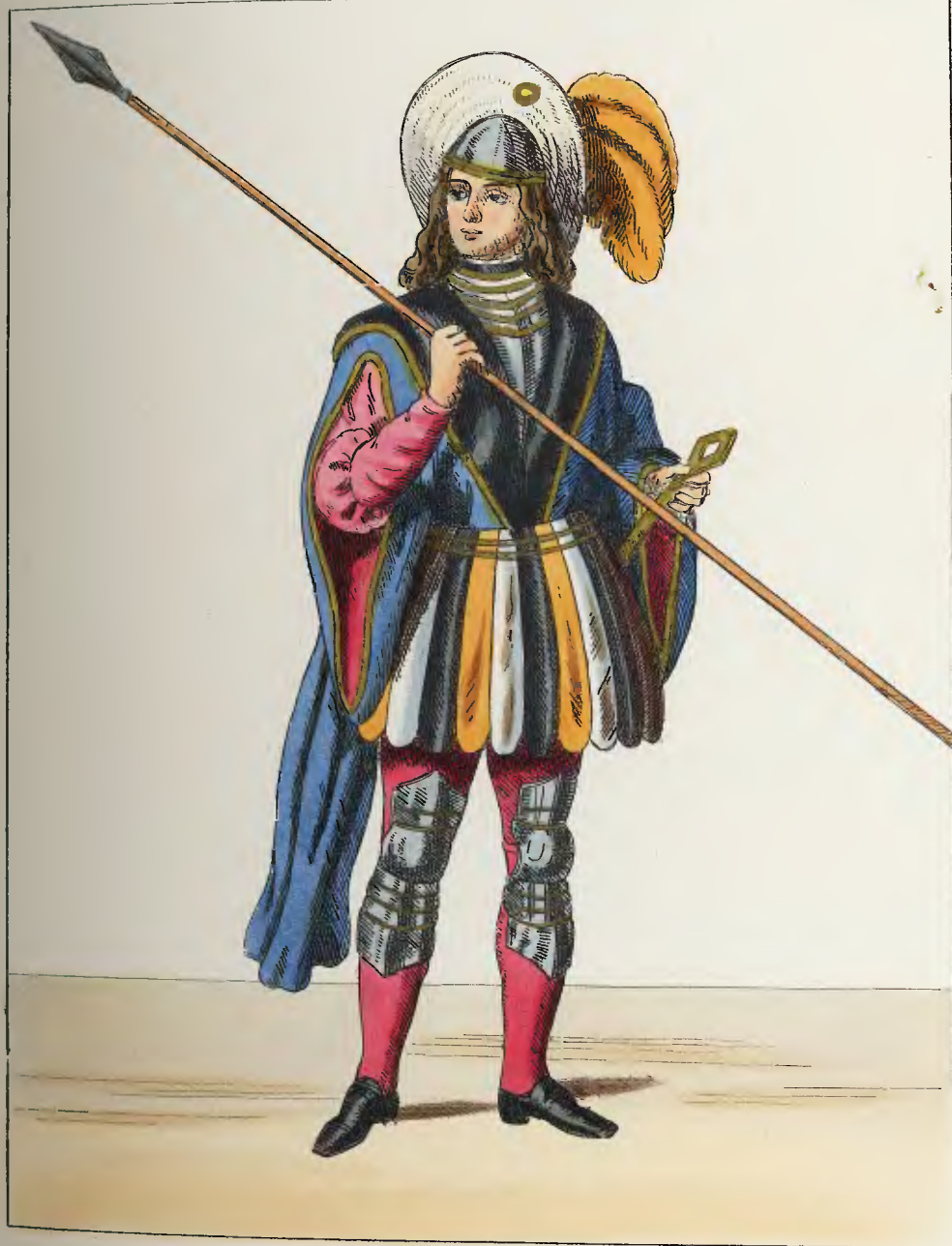
BRITISH ARMY—1480 MAN AT ARMS—EDWARD 4 th