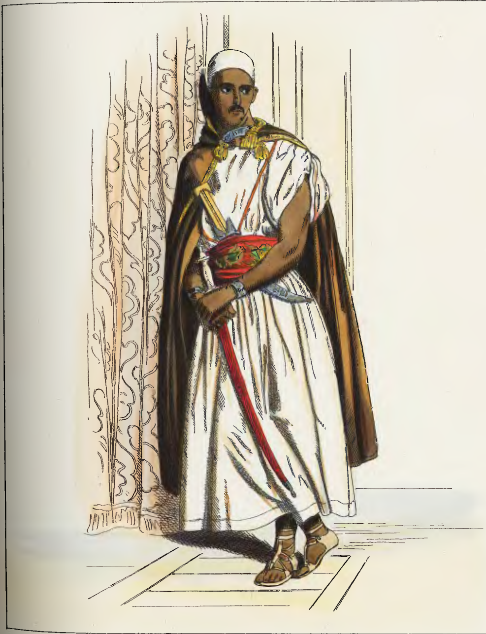
A N A R A B .