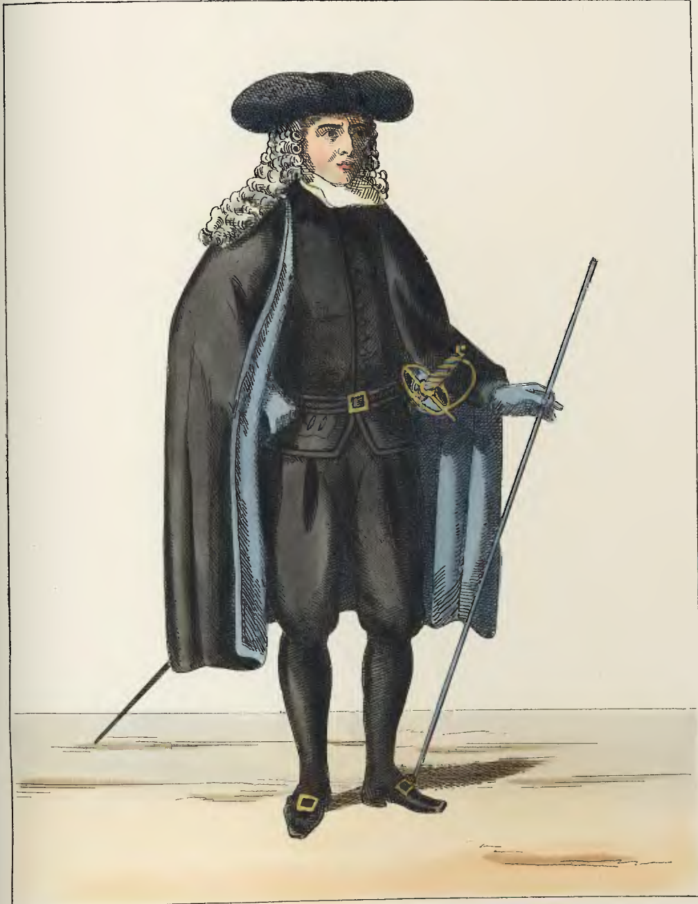
A SPANISH ALGUAZIL, ( Period 1700 )