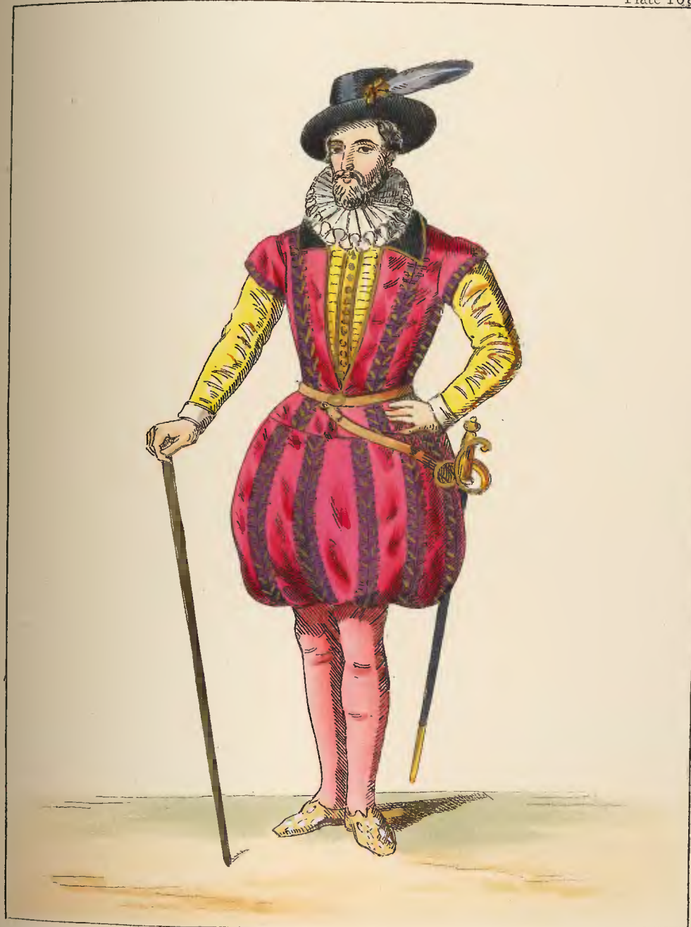
ENGLAND—SIR WALTER RALEIGH—1550.