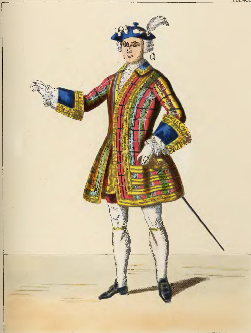
PRINCE CHARLES EDWARD—1745, ( THE PRETENDER ) from the Actual Dress

Published by T. H. LACY, 89, Strand, London.