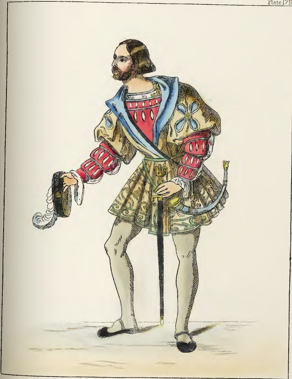
JAMES THE 4 TH OF SCOTLAND—1506.

Published by T.H. LACY, 89, Strand, London.