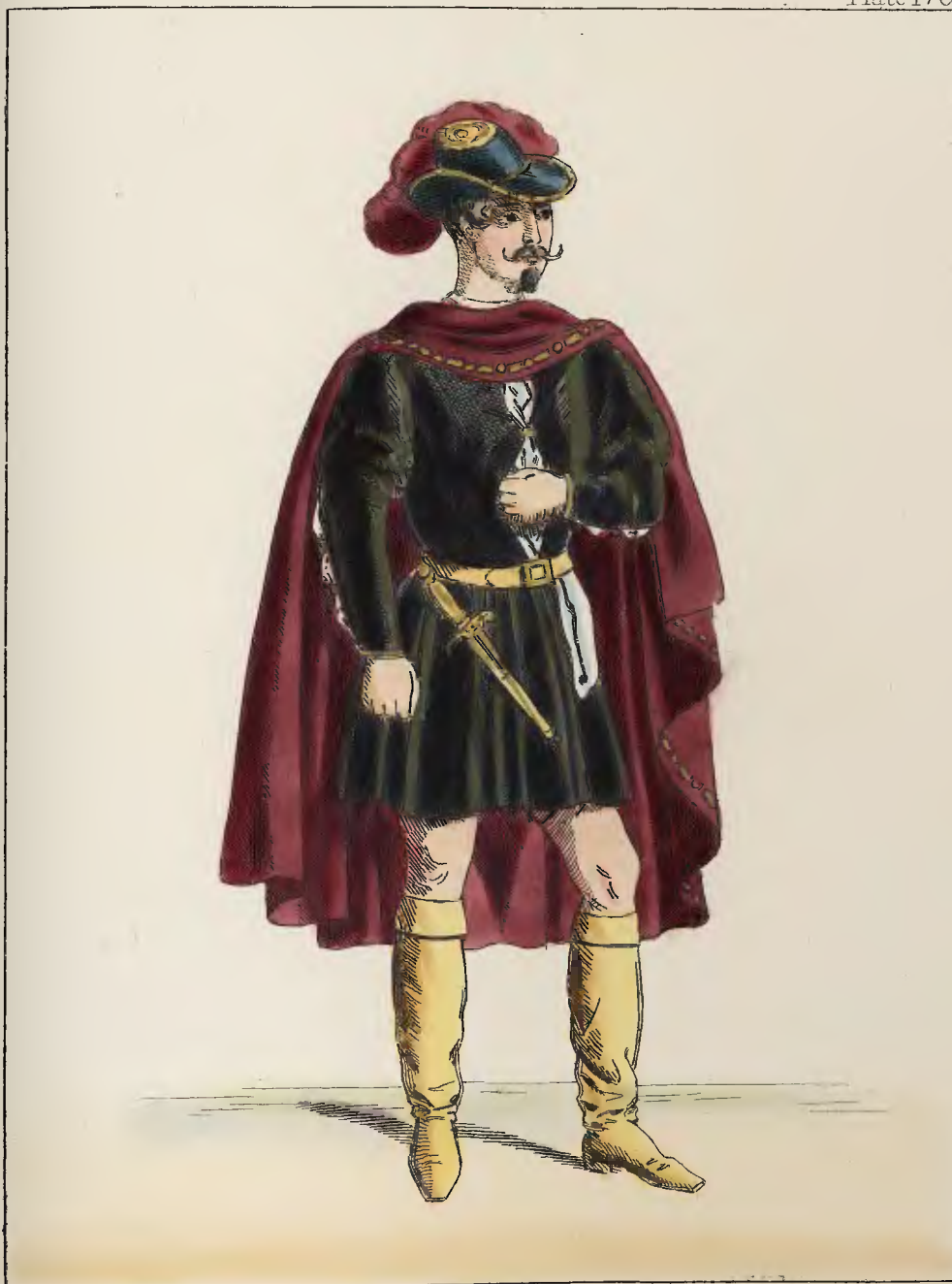
SICILIAN NOBLE — 1282.