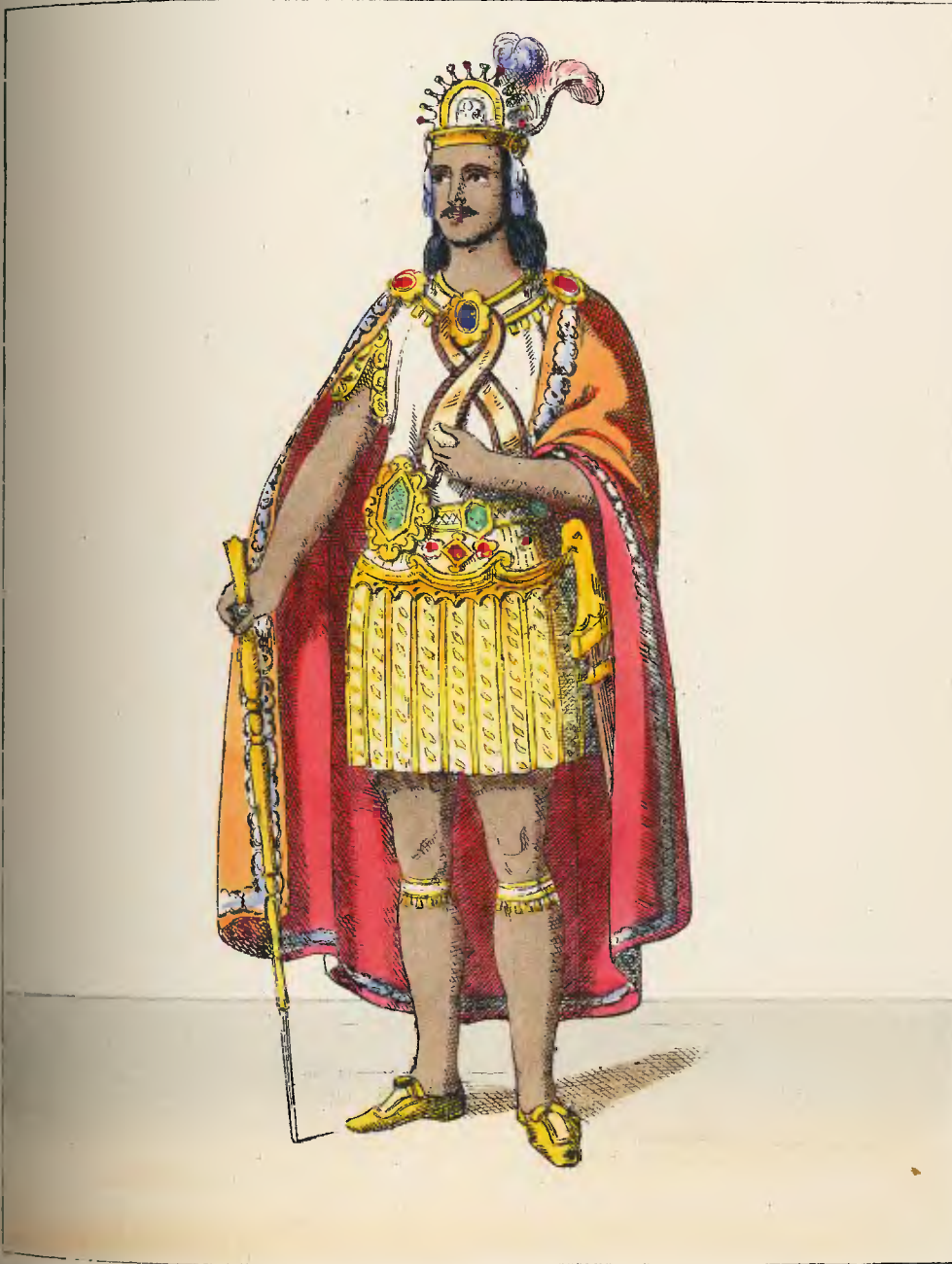
MONTEZUMA 2 nd EMPEROR OF MEXICO-1500

Published by T H LACY 89, Strand, London.