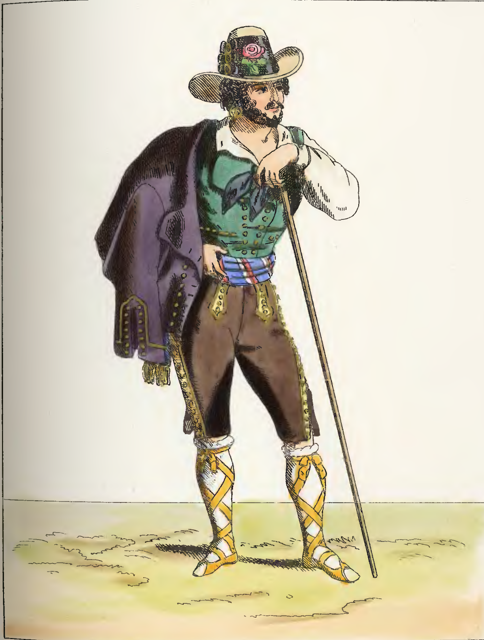
A ROMAN PEASANT.