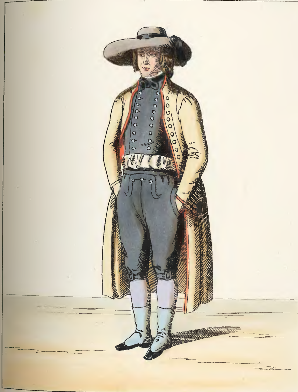
COUNTRY DRESS OF FLANDERS,

Published by TH. LACY, 89, Strand, London.