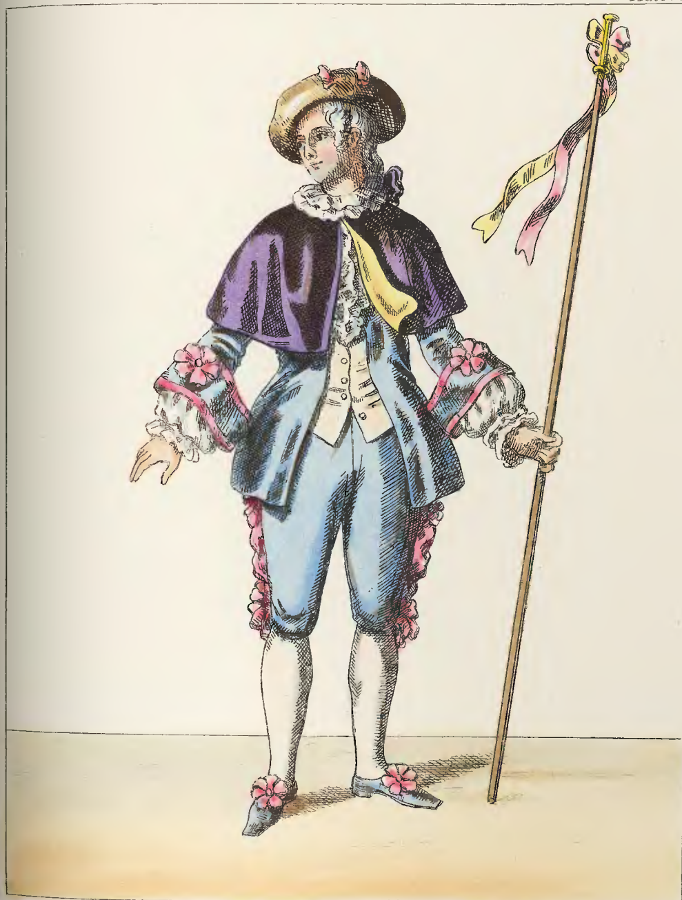
SHEPHERD AFTER WATTEAU