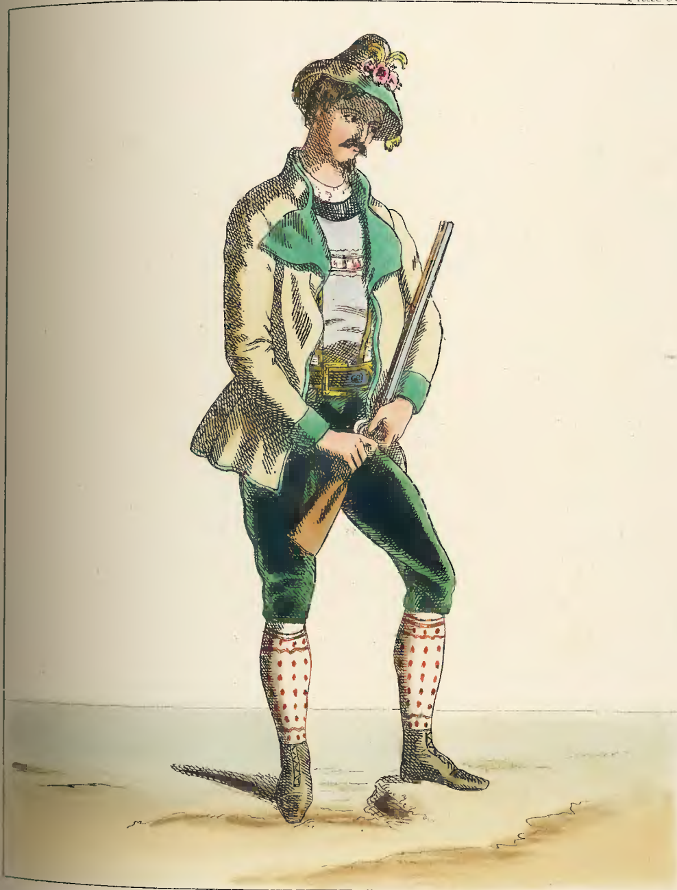
TYROL.—A HUNTER OR PEASANT.