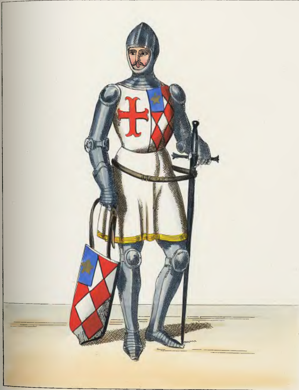
A KNIGHT OF RHODES

Published by T H LACY, 89, Strand, London.