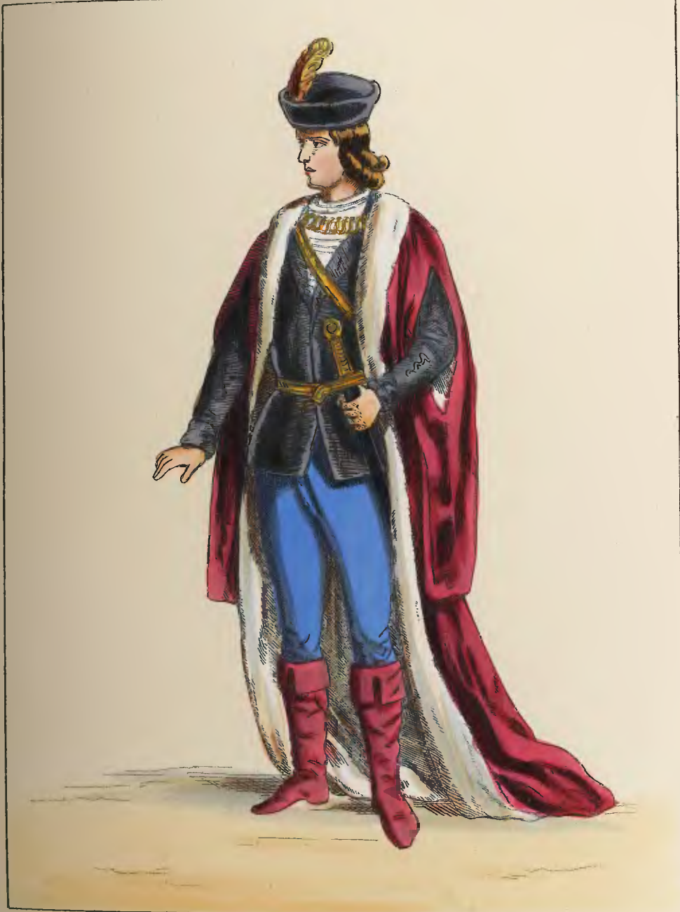
A NOBLE—1493, ( England—Henry 7 th —France—Charles 8 th )

Published by T.H. LACY, 89, Strand, London.