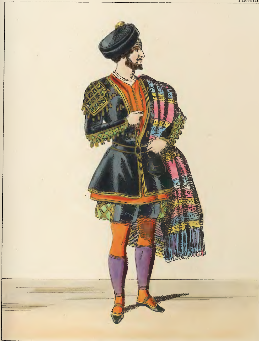
SPAIN—THE MULETEER OF TOLEDO.