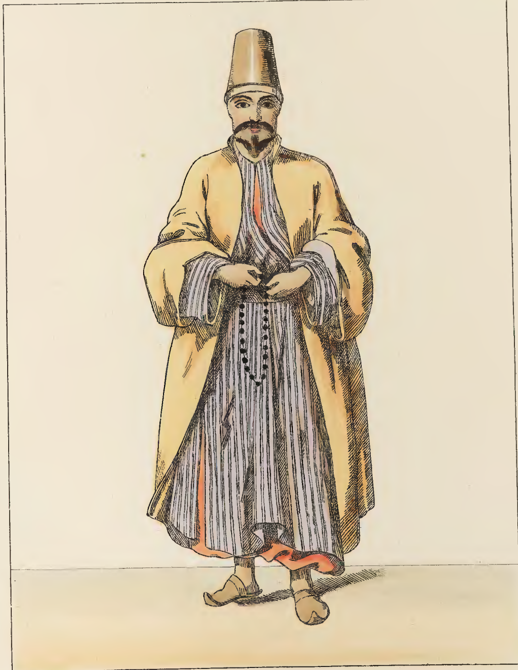
A TURKISH DERVISH,

Published by TH LACY, 89, Strand, London