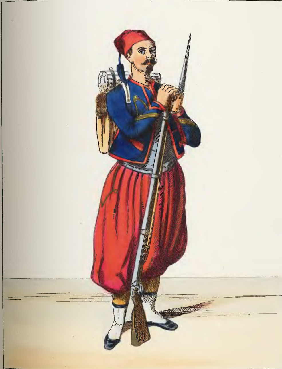
A ZOUAVE French Army, (Period 1860)

Published by TH. LACY 89, Strand, London.