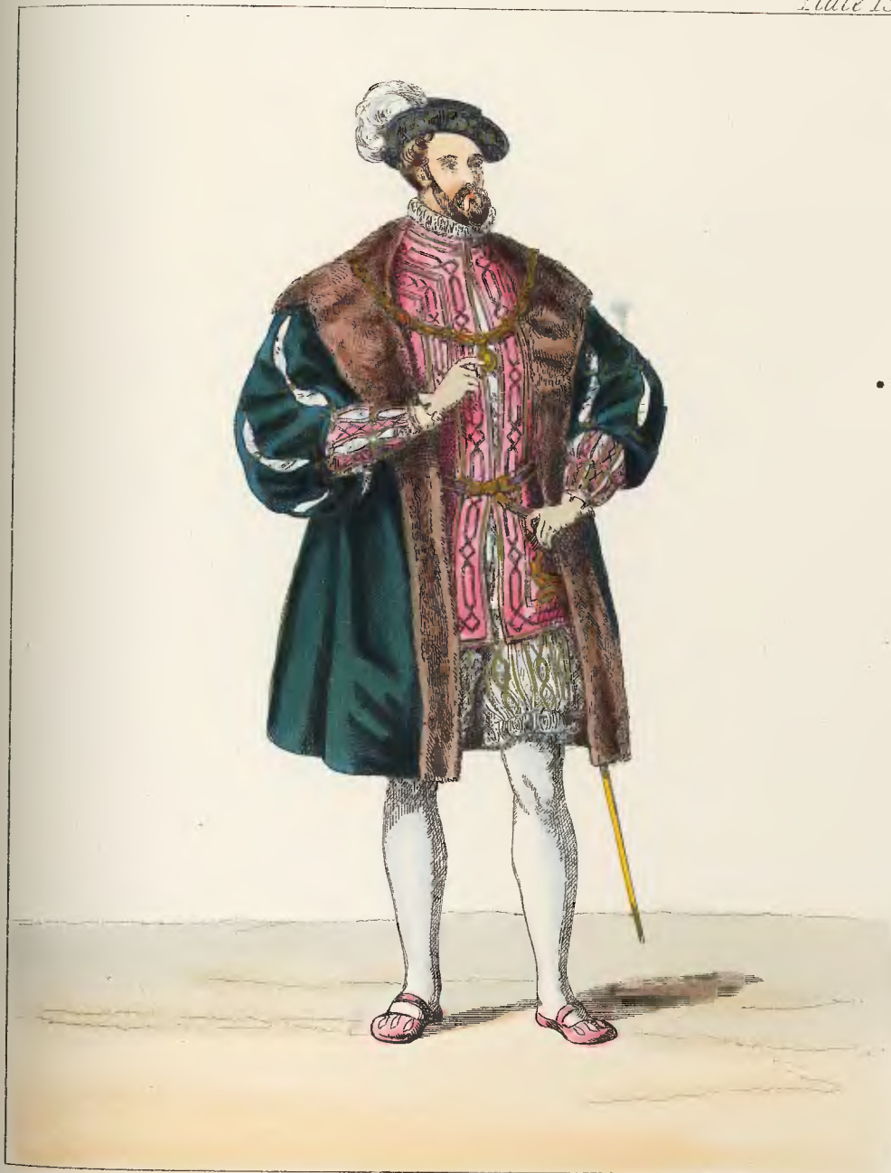
Period 1540, JAMES 5 th of SCOTLAND.