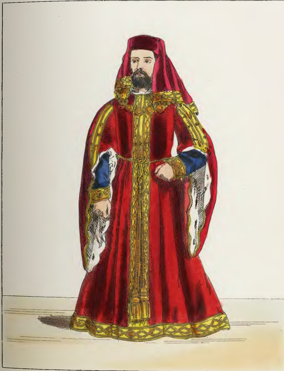
ENGLAND—KING HENRY 4 th —1412,