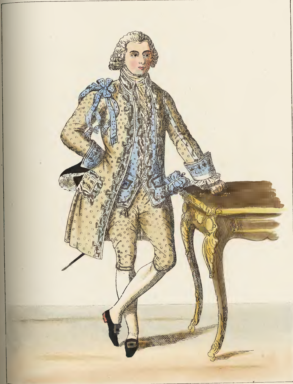
COURT DRESS ( Period 1760 ) ( George 3 rd —Louis 15 th )