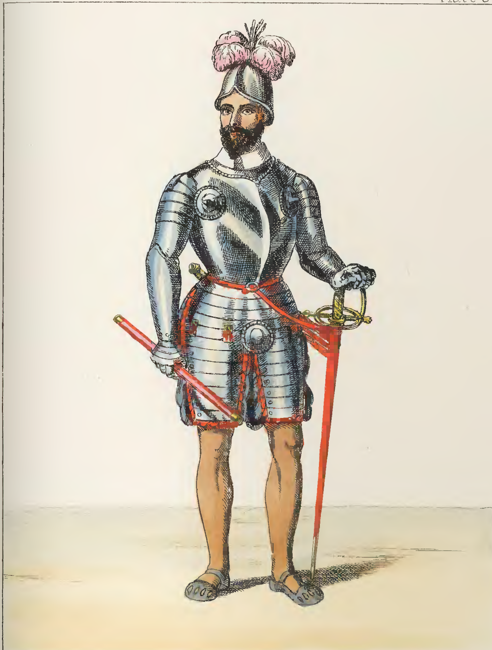
PIZARRO, Period, 1500.