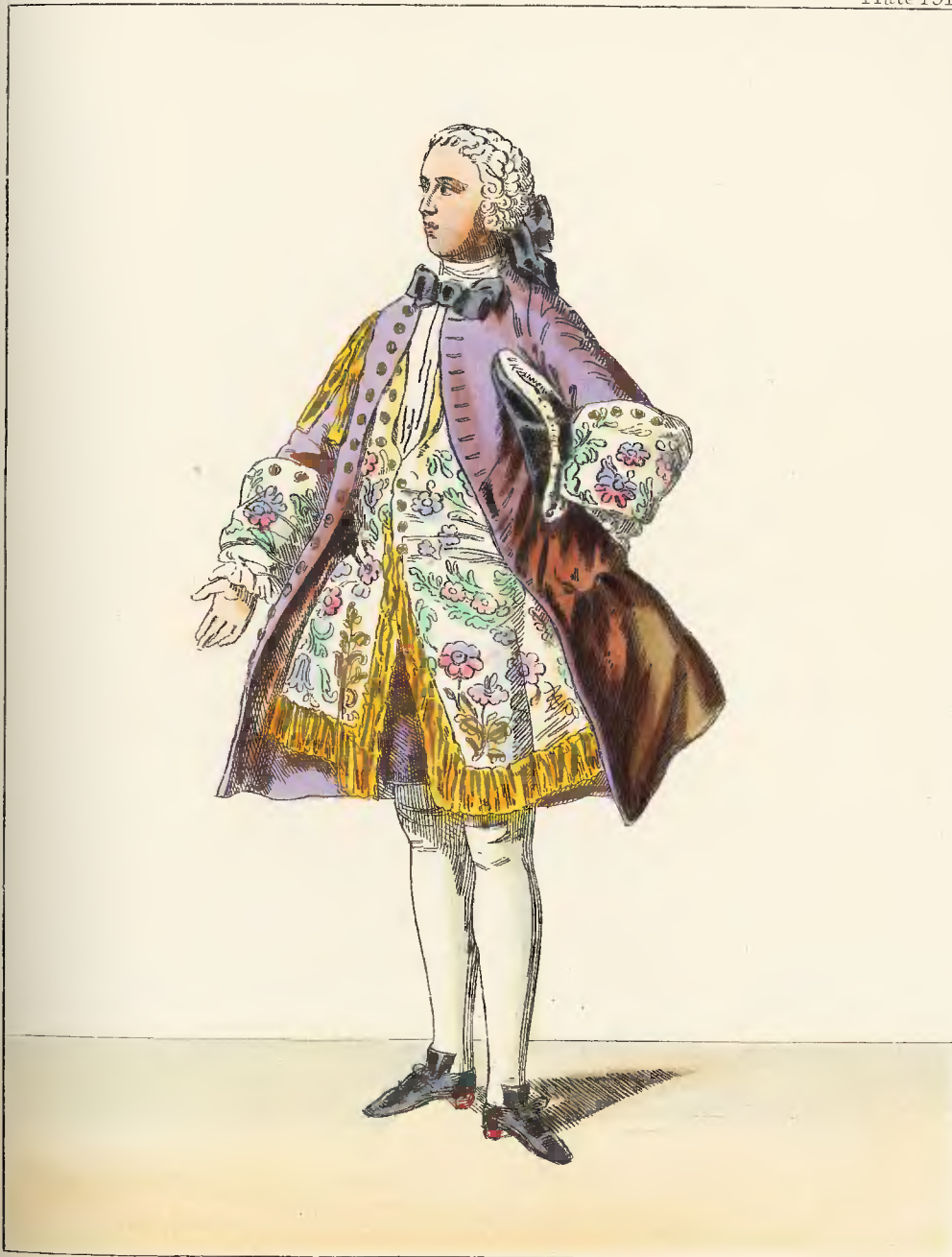
1740—A GENTLEMAN—GEORGE 2 nd LOUIS 15 th