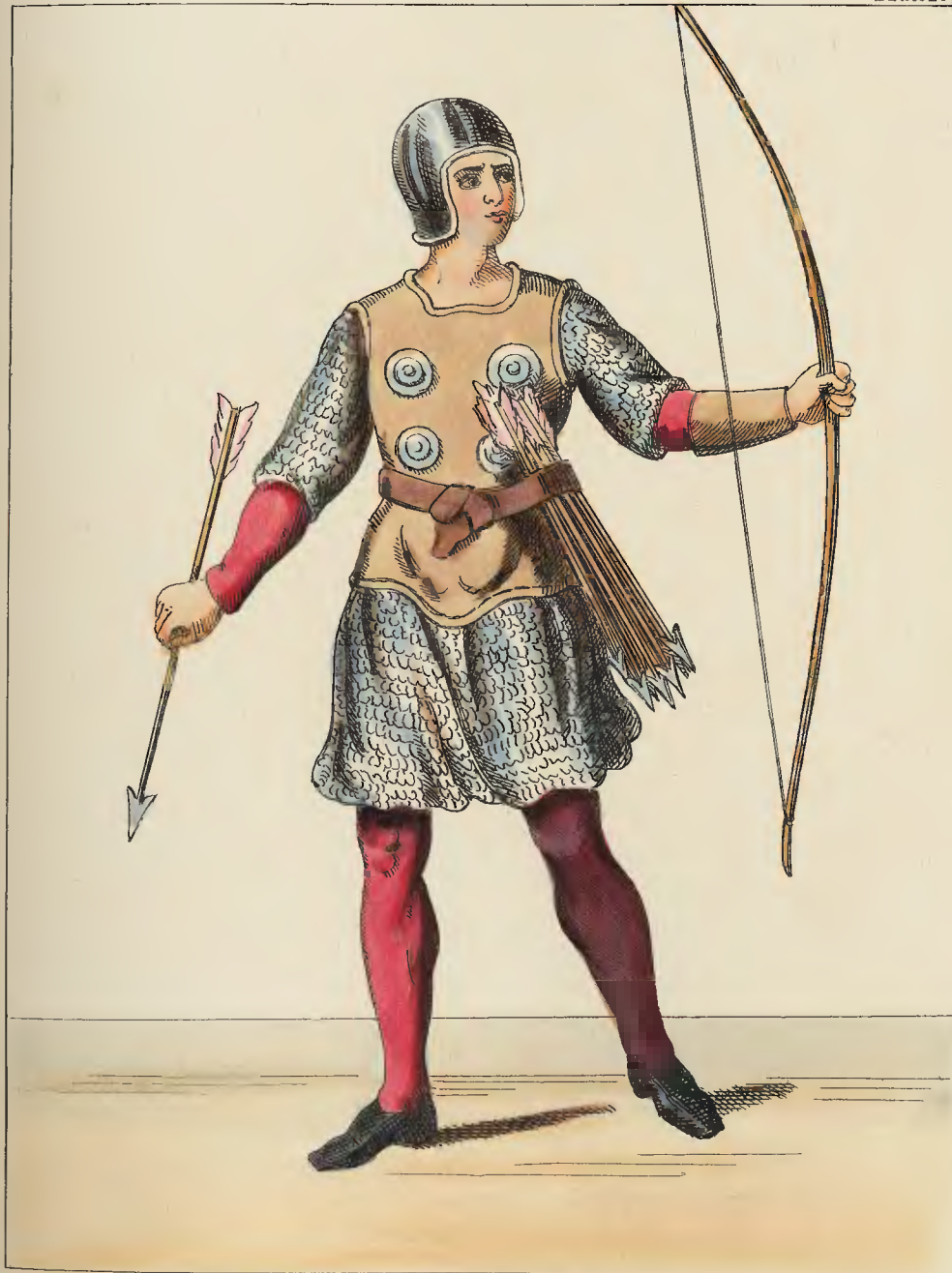
BRITISH ARMY—1216, A BOWMAN—KING JOHN—HENRY 3 rd