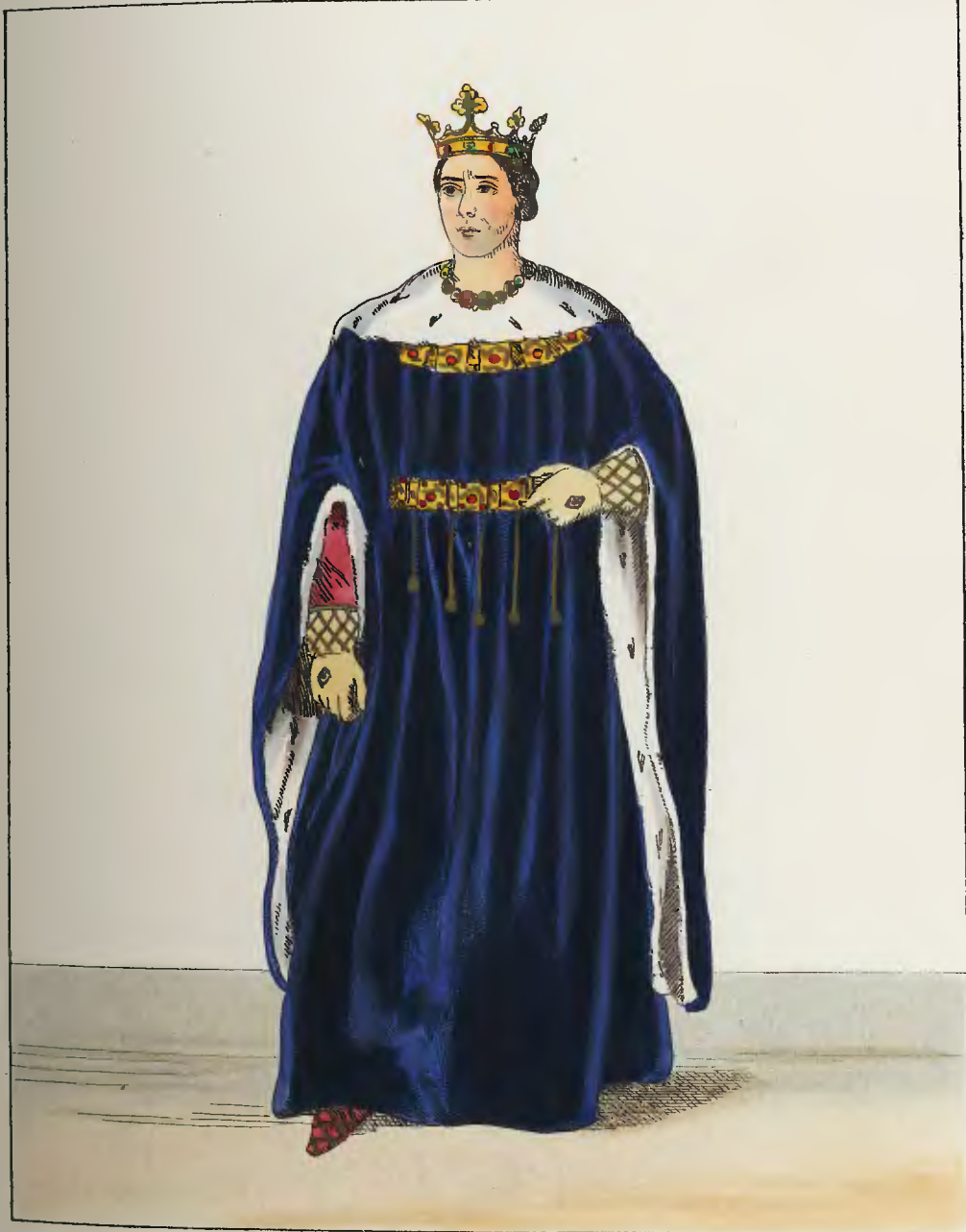
ENGLAND—KING HENRY 5 th —1417

Published by T. H. LACY, 89, Strand London.