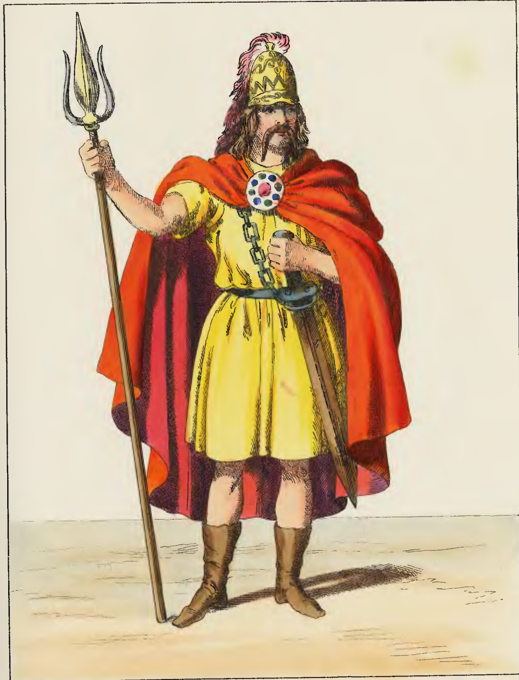
ANCIENT BRITON. (Period B.C. 54.)

King Cassibellanus (Cymbeline) Commanding against Julius Caesar