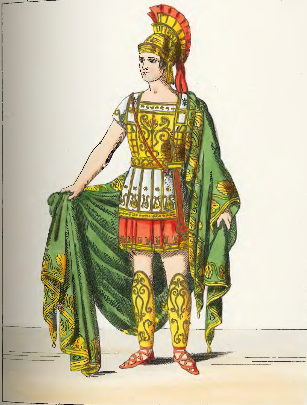
A GREEK WARRIOR, ( Achilles—Troilus & Cressida )