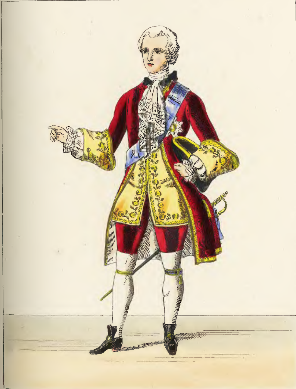
COURT DRESS — 1745