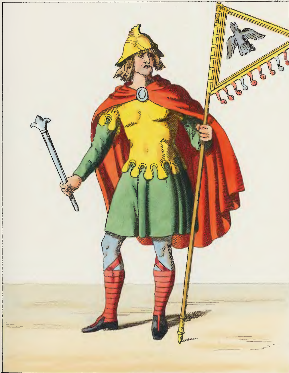
ANLAF THE DANE About 980,