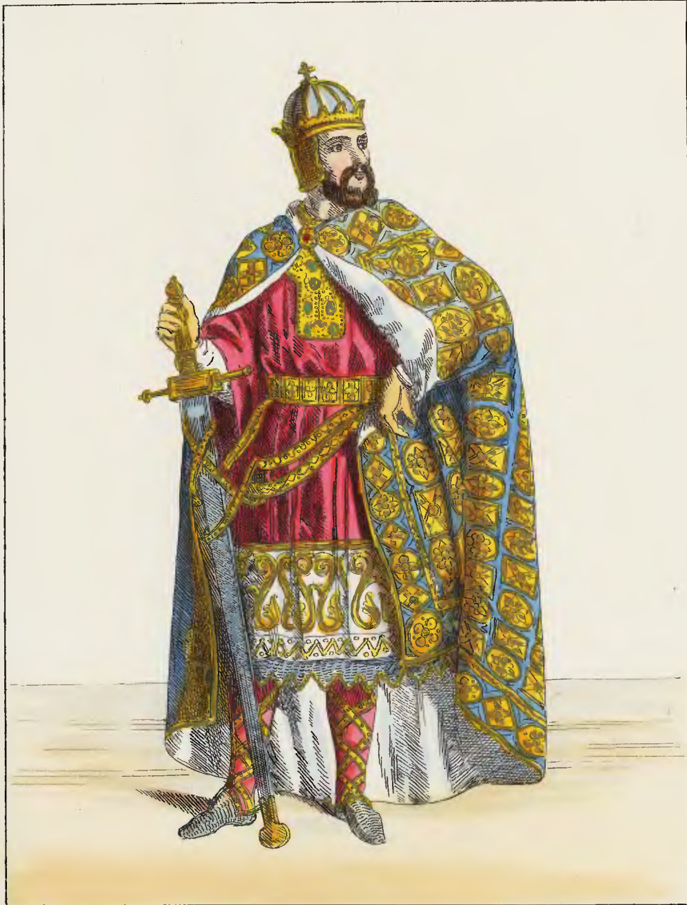
CHARLEMAGNE, EMPEROR OF THE FRANKS (800)

Published by T. H. LACY, 89, Strand, London.