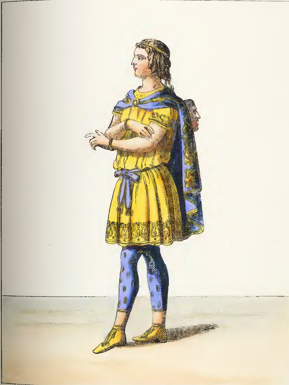
ROMAN NOBLE (of the Empire)