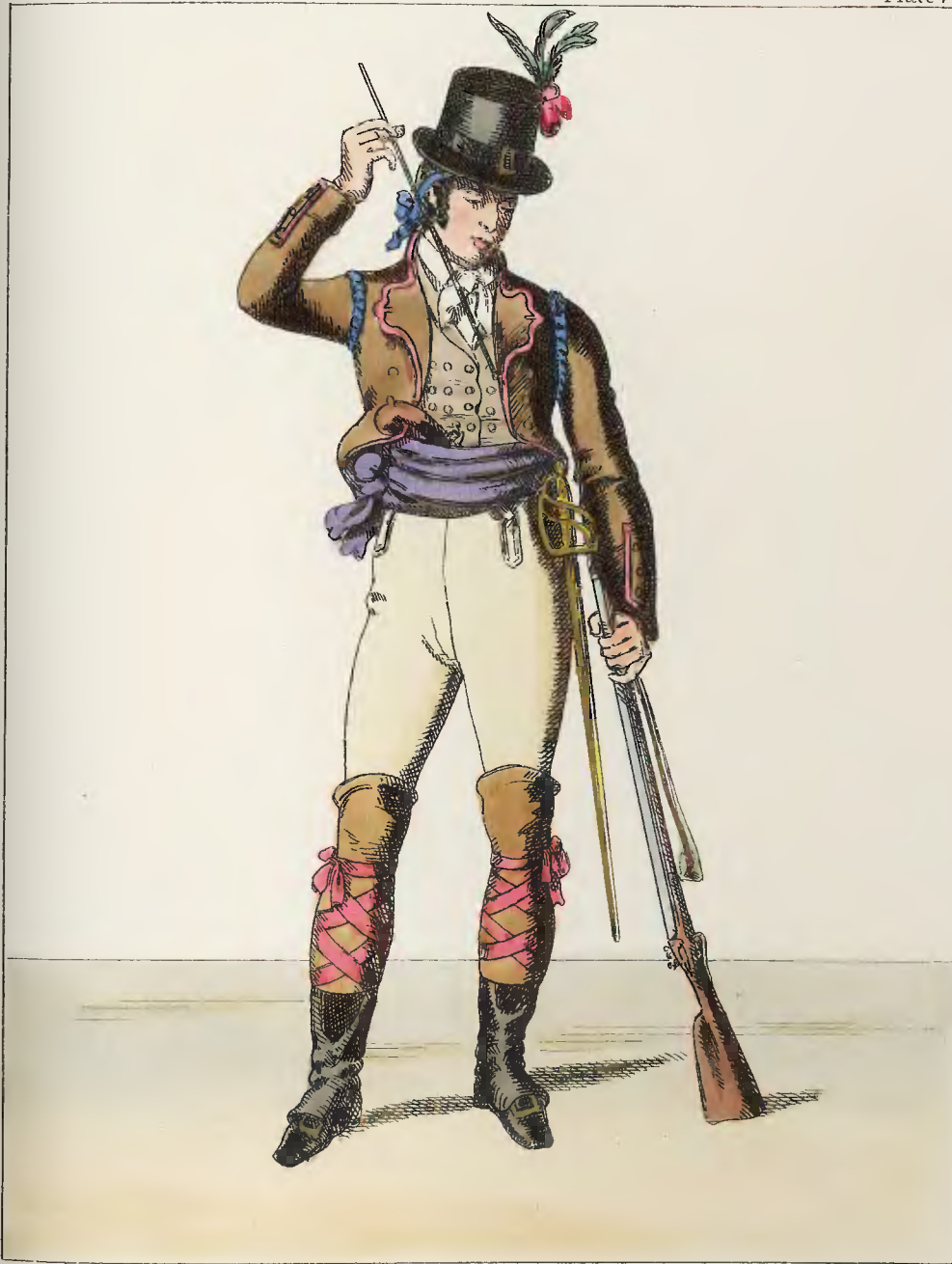
A SPANISH GUERRILLA—1809,