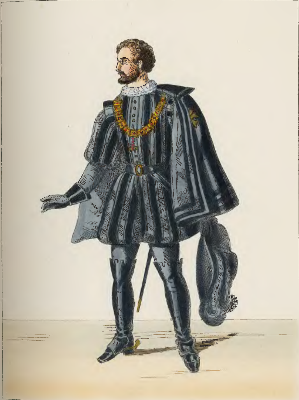
FRANCE—HENRY OF NAVARRE—1579 ( Dramatic Costume )

Published by TH. LACY, 89, Strand, London.