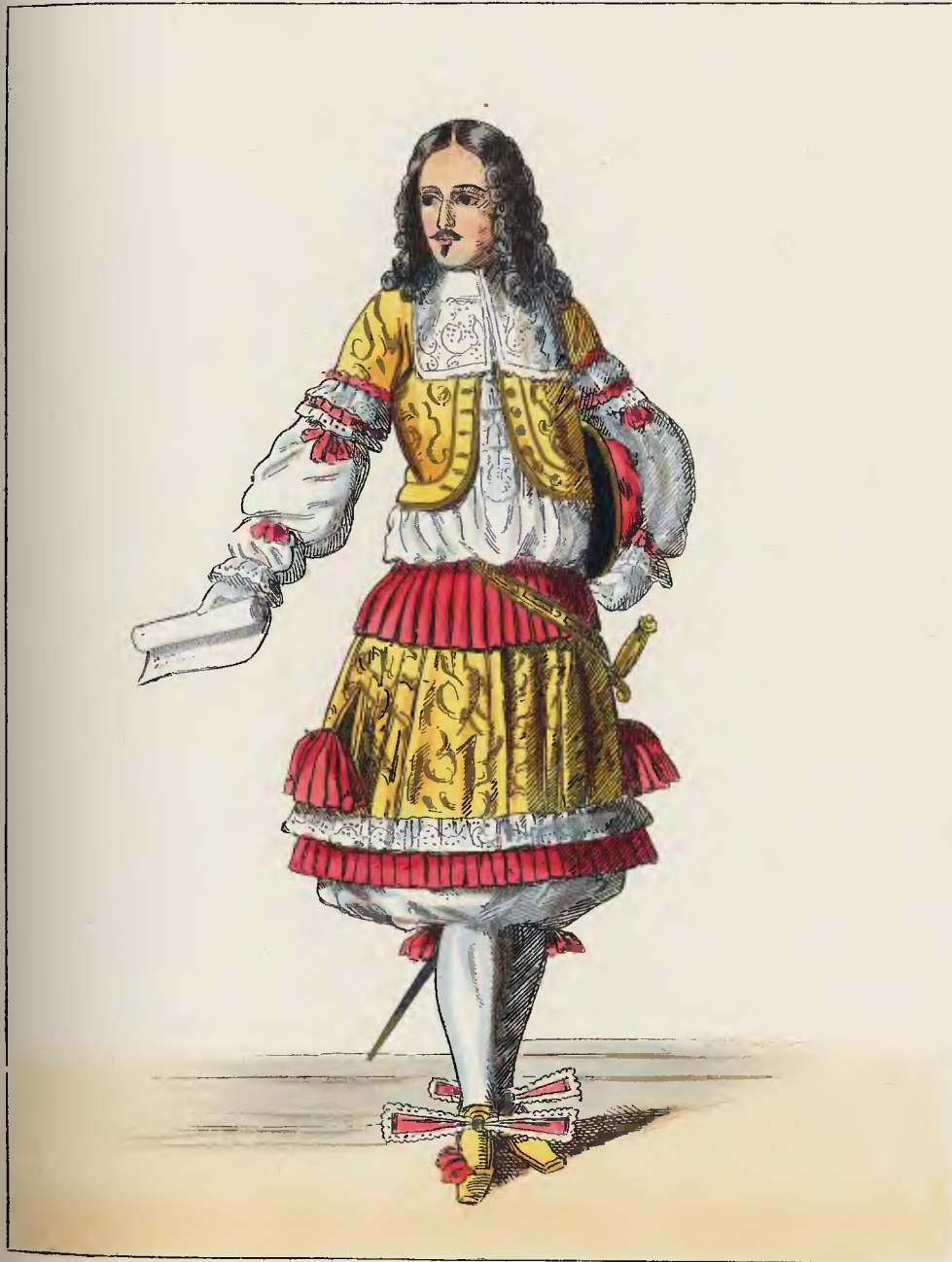
A NOBLE—1670, (England—Charles 2 nd —France—Louis 11 th ) Published by T. H. LACY 89, Strand, London.