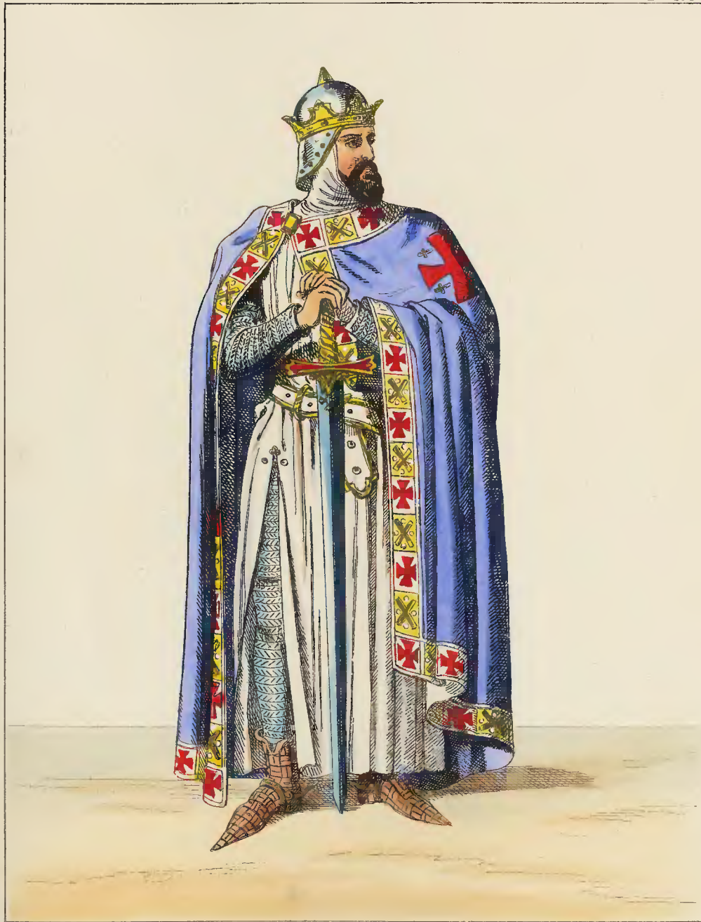
GODFREY OF BOUILLON—CRUSADER.

William Rufus—Phillip 1. st (Period 1099)