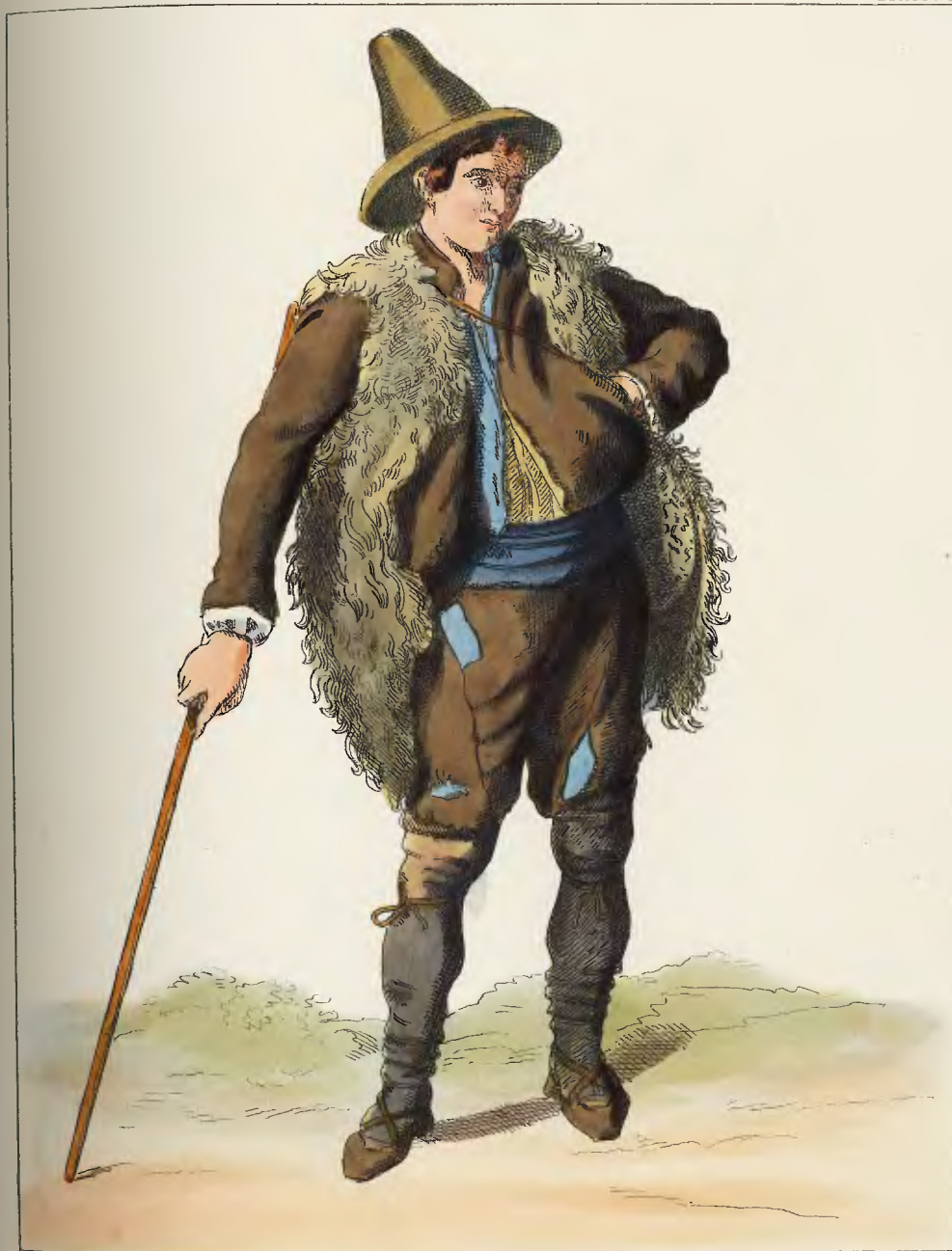
SHEPHERD OF THE ABRUZZI.

Published by T.H.LACY 89, Strand London.