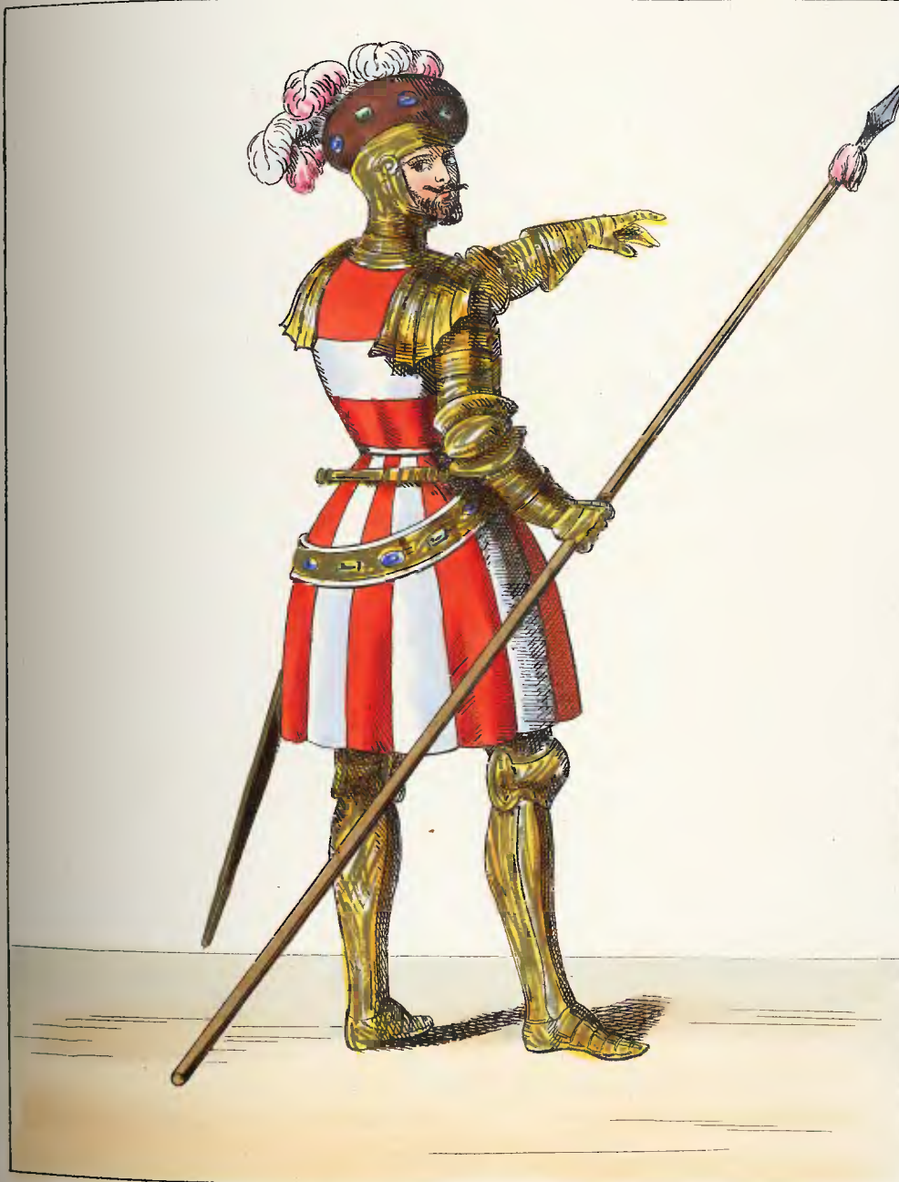
AN AUSTRIAN PRINCE—1510,