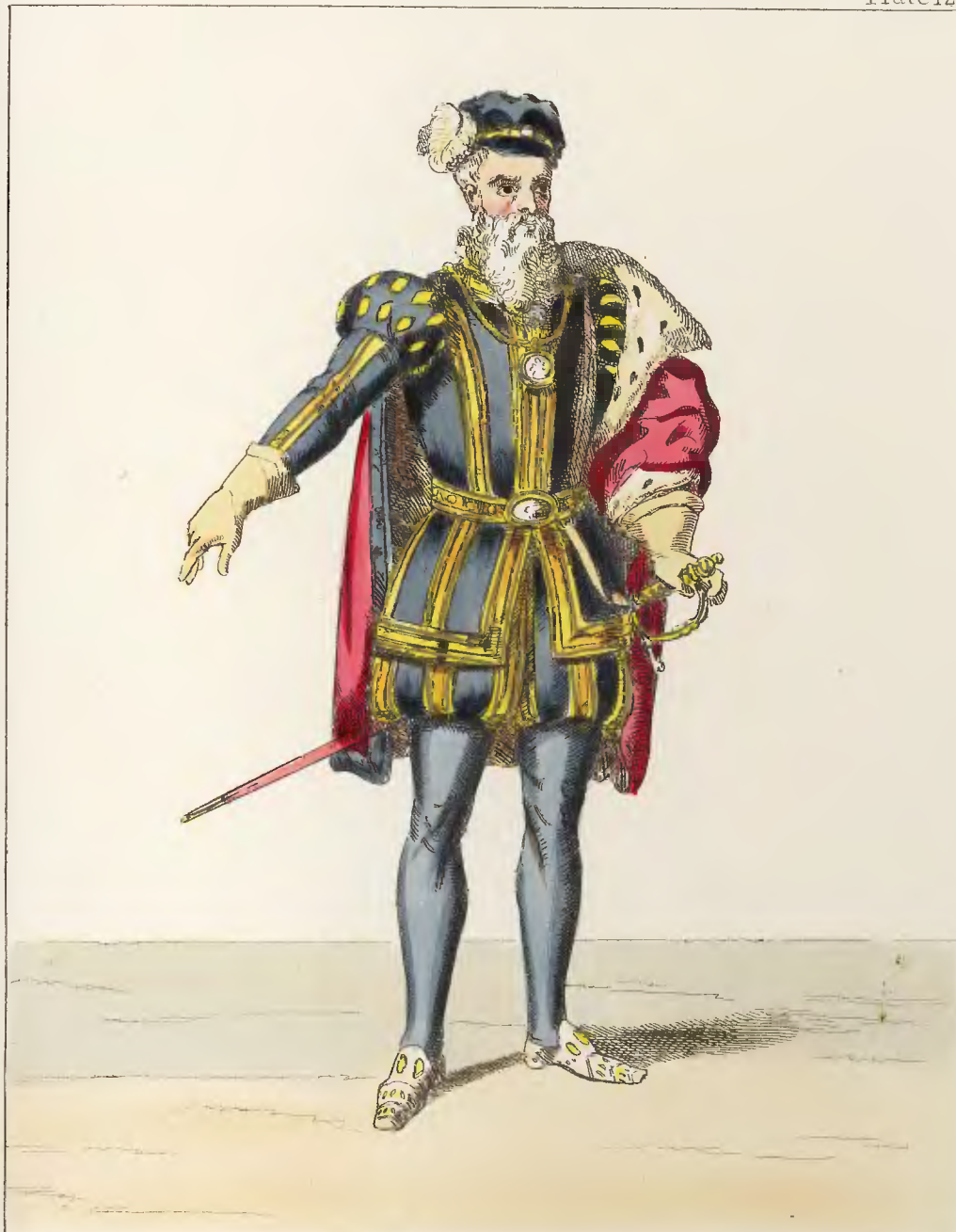
GUSTAVUS VASA, King of Sweden 1552

Published by T. LACY, 89, Strand, London.