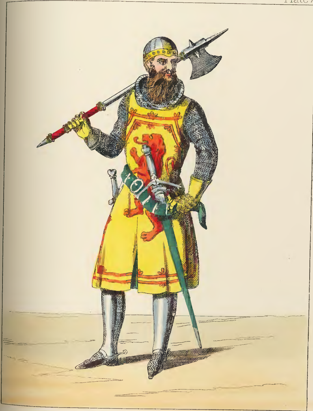
ROBERT BRUCE, Period 1308.

Published by T. LACY, 89, Strand, London.