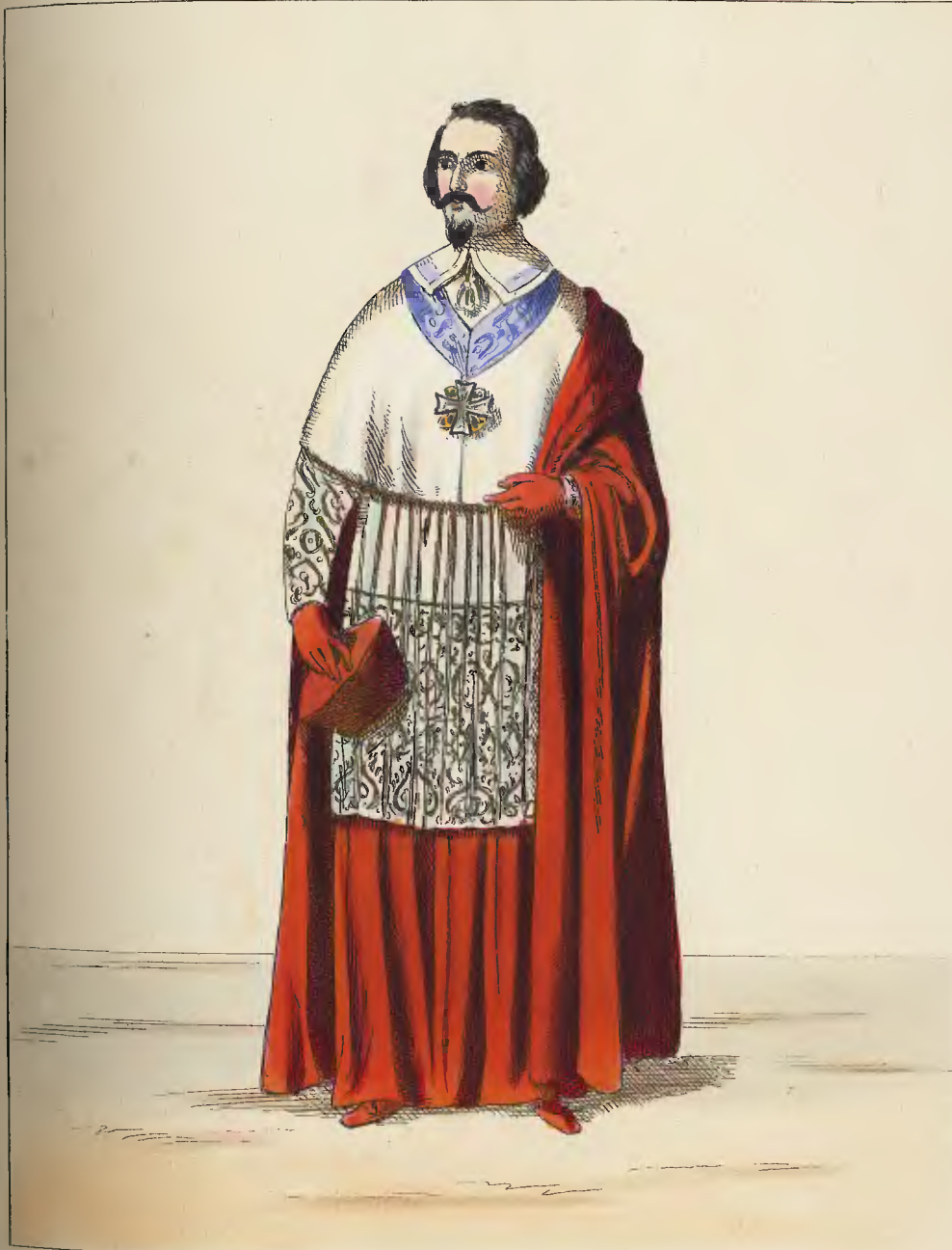
CARDINAL RICHELIEU—Period 1640.

Published by T.H.LACY 89, Strand, London.