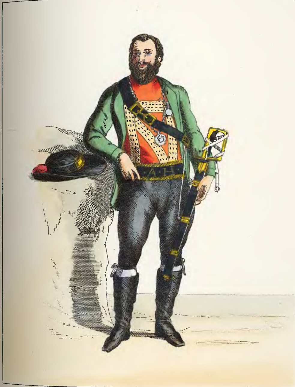
ANDREAS HOFER Period 1809, ( Costume of the Tyrol )

Published by T.H. LACY, 39, Strand London.