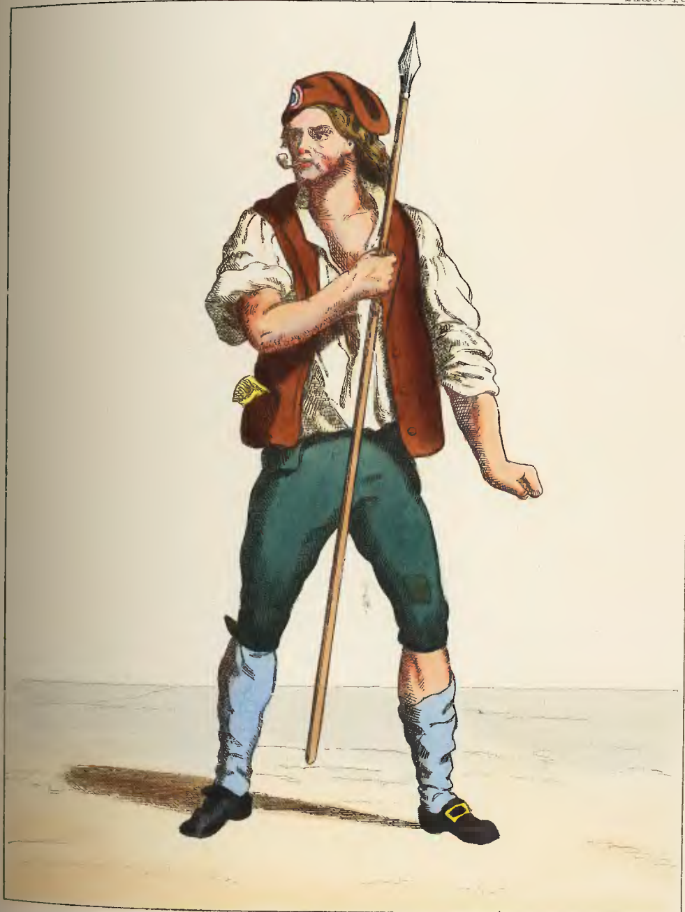
FRENCH REVOLUTIONIST (Period 1789)

Published by THLACY, 89, Strand, London.