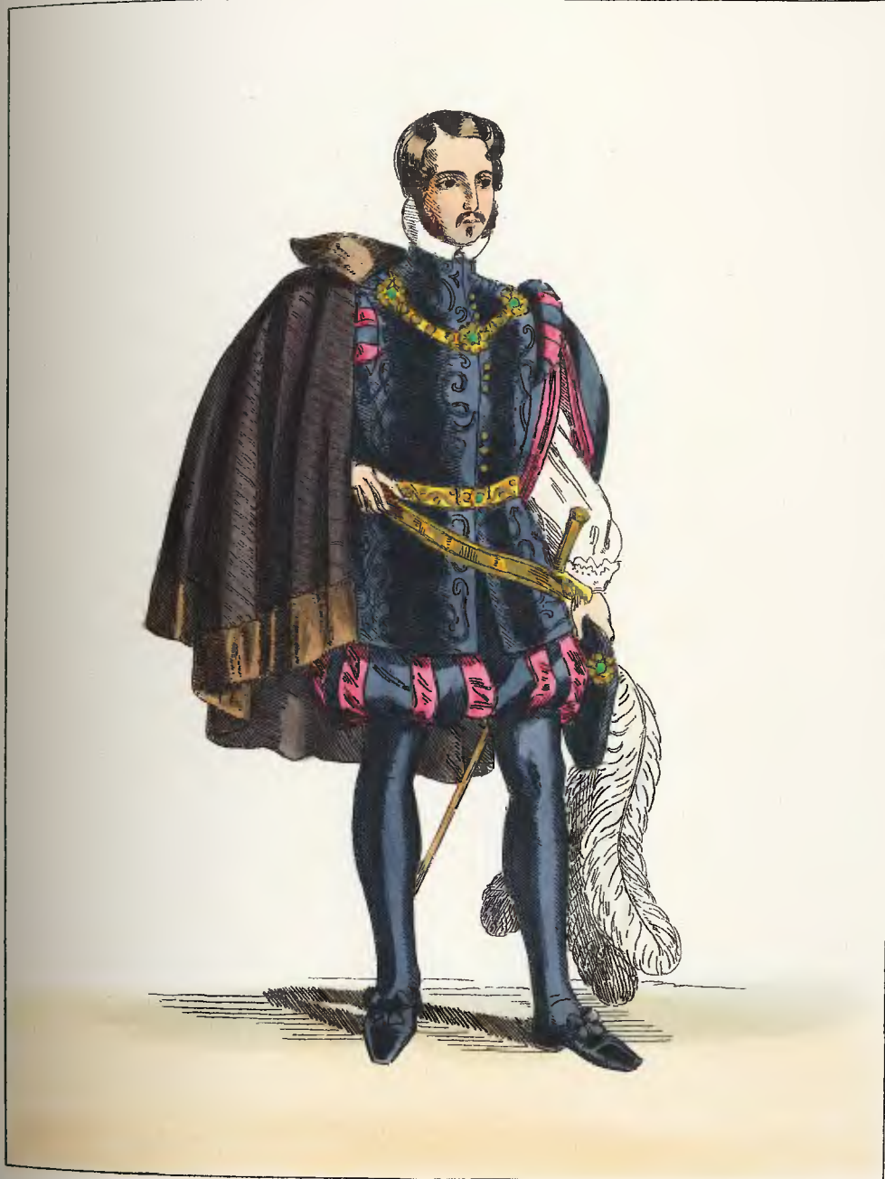
GERMANY—A NOBLE—1533, ( Costume of Prince Esterhazy—Queen's Ball Costume )

Published by T.H.LACY, 89, Strand, London.