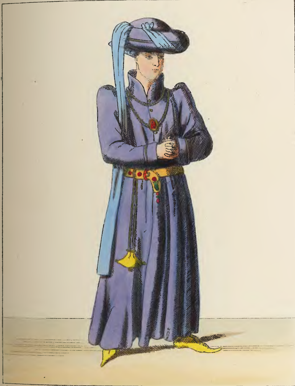
ENGLAND—KING HENRY 6 th 1444.

Published by T.H. LACY, 89, Strand, London