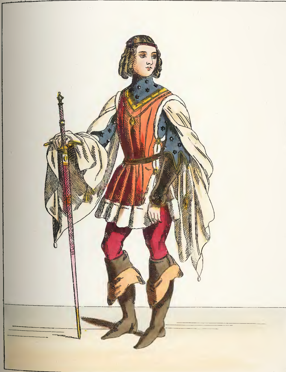
GERMANY—A NOBLE — 1350.