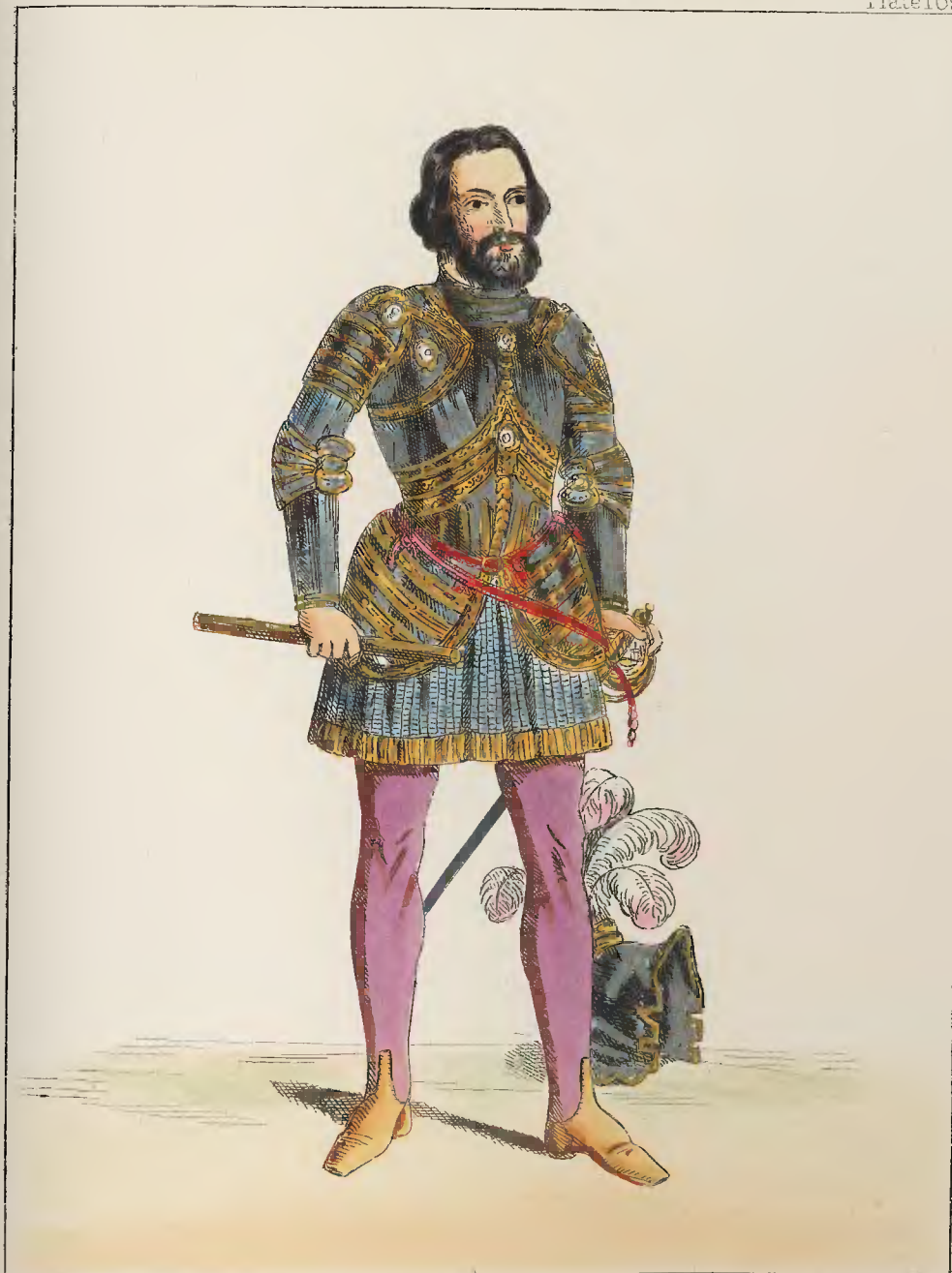
SPAIN—HERNAN, CORTEZ—1520, (Conqueror of Mexico)

Published by T H LACY, 89, Strand, London.