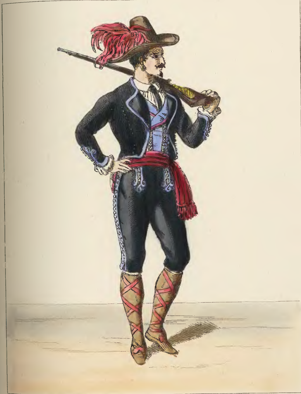
ITALIAN BRIGAND (Fra Diavolo)