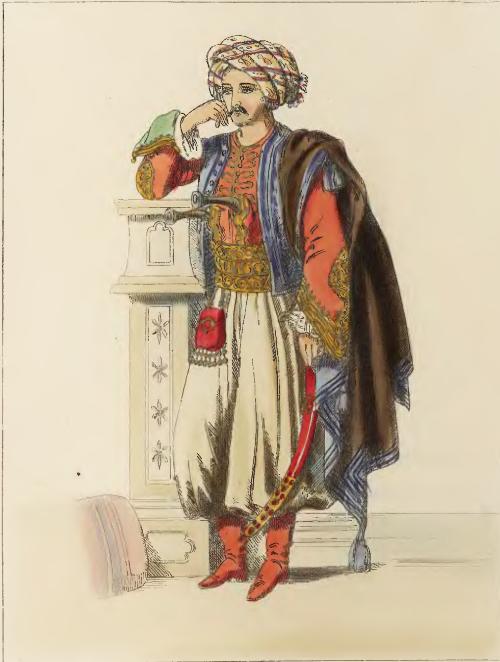
TURKISH NOBLE, NATIONAL COSTUME.

Published by T.H. LACY, 89, Strand, London.