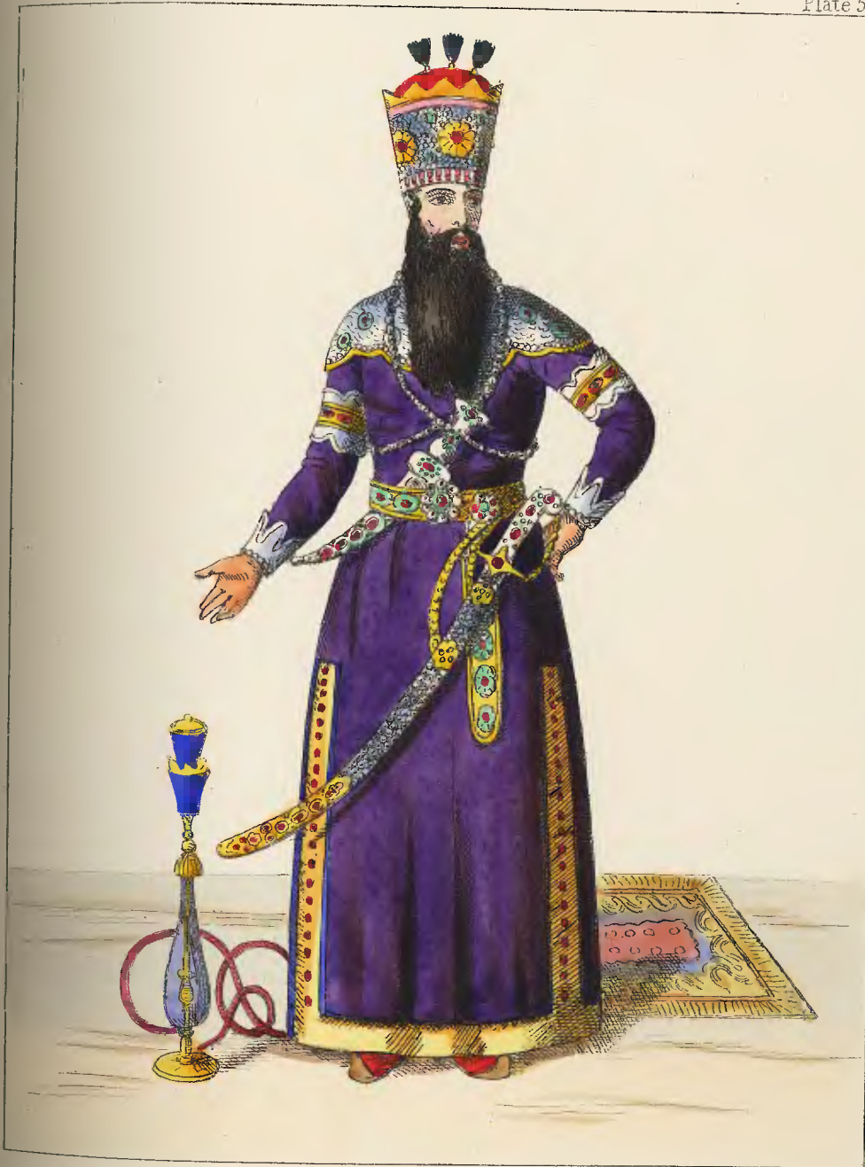
FETH ALI, - SHAH OF PERSIA - 1806