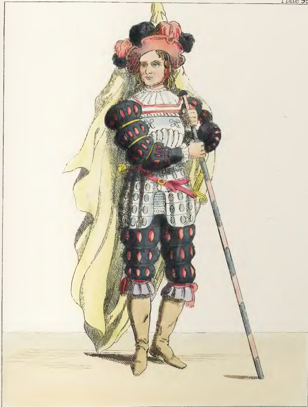
SWISS CAPTAIN — 1496.