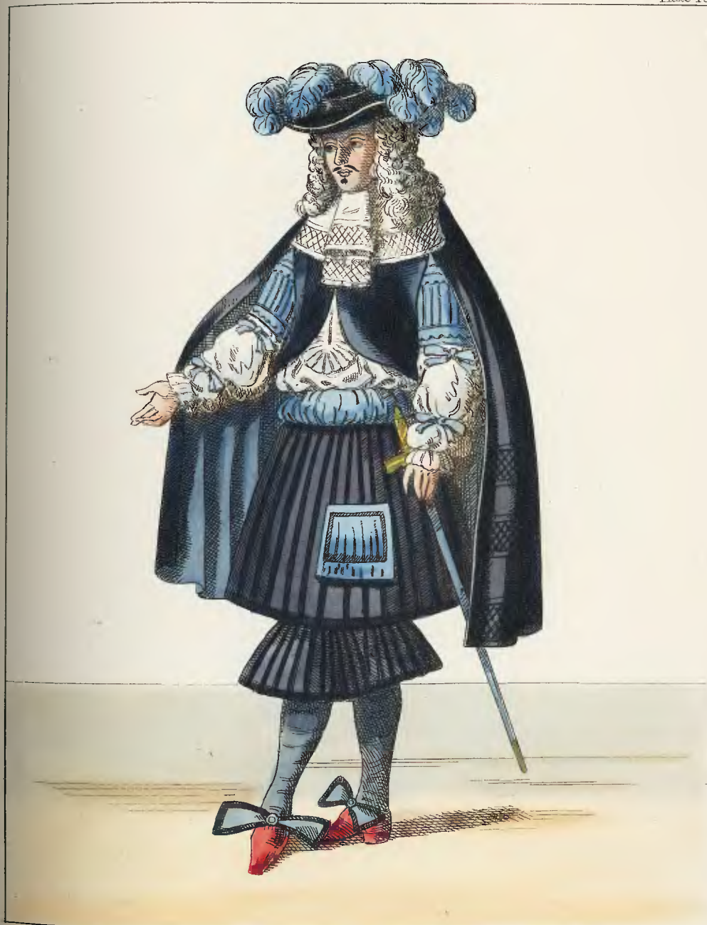
LOUIS 14 th OF FRANCE, 1643,