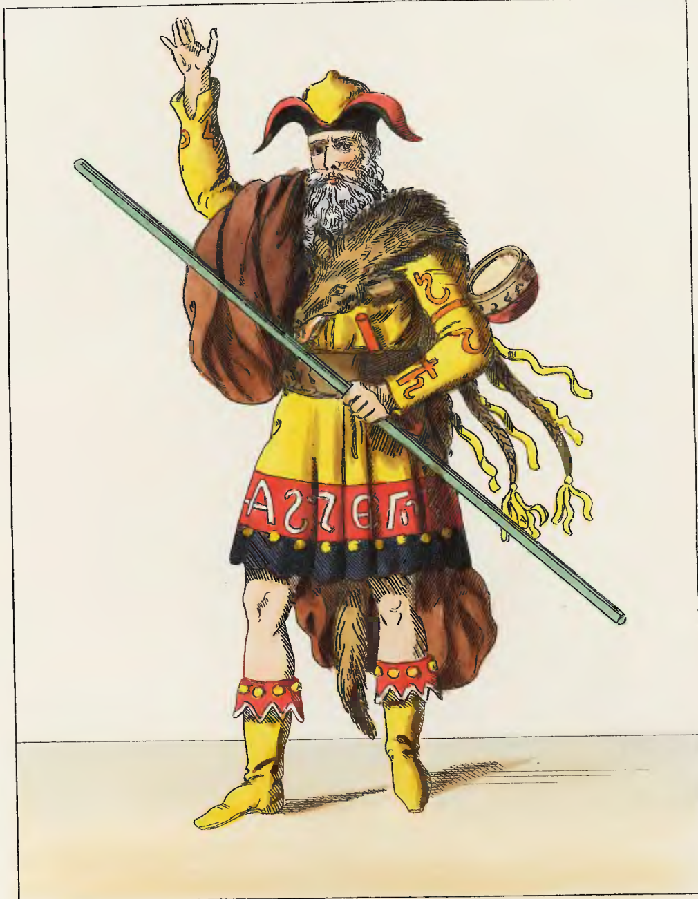
A WIZARD, (Osmond, Dryden's King Arthur.) Published by T.H.LACY, 89, Strand, London.