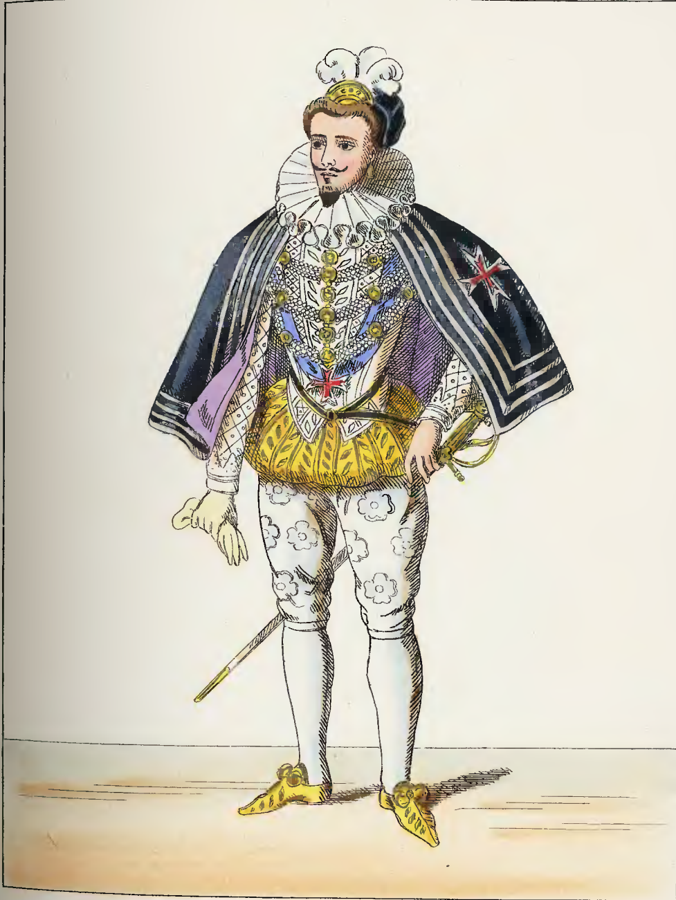
FRANCE—HENRY 3 rd —1579,