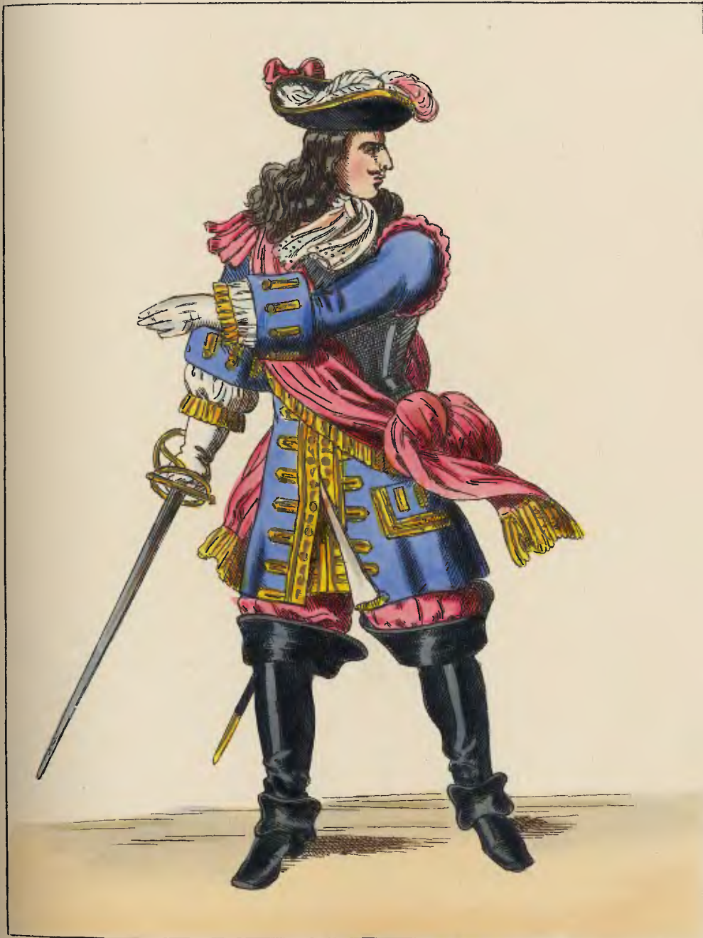
AN OFFICER—1680 ( England—James 2 nd —France—Louis 14 th ) Published by T H LACY 89 Strand London