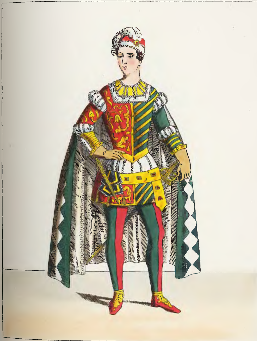
A PRINCE IN A FAIRY PLAY,

(Fortunio - in the Seven Wonders of the World)