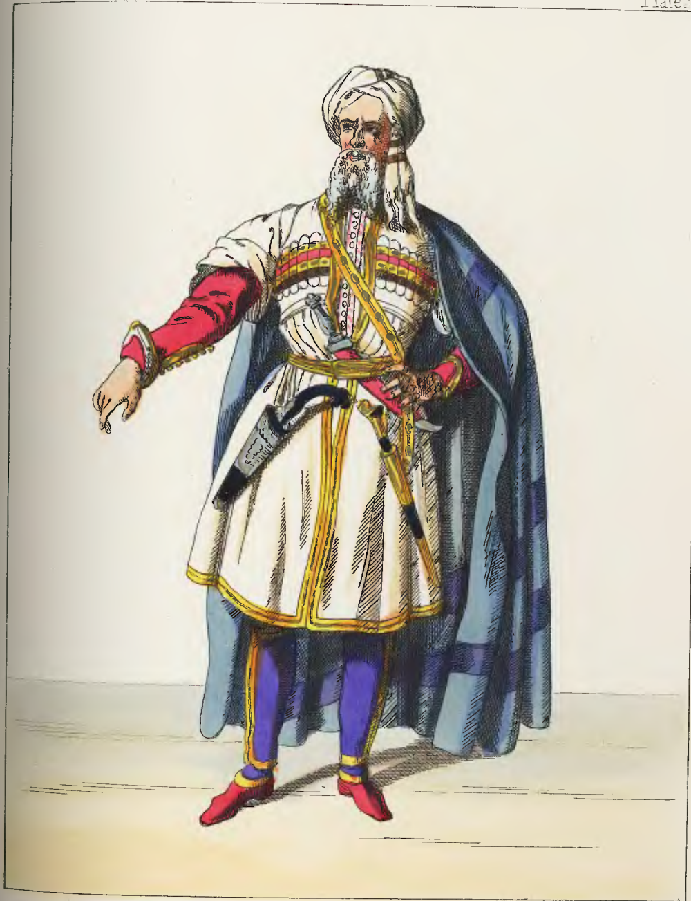
CIRCASSIAN CHIEF ( Schamyl )

Published by T H LACY, 89, Strand London.