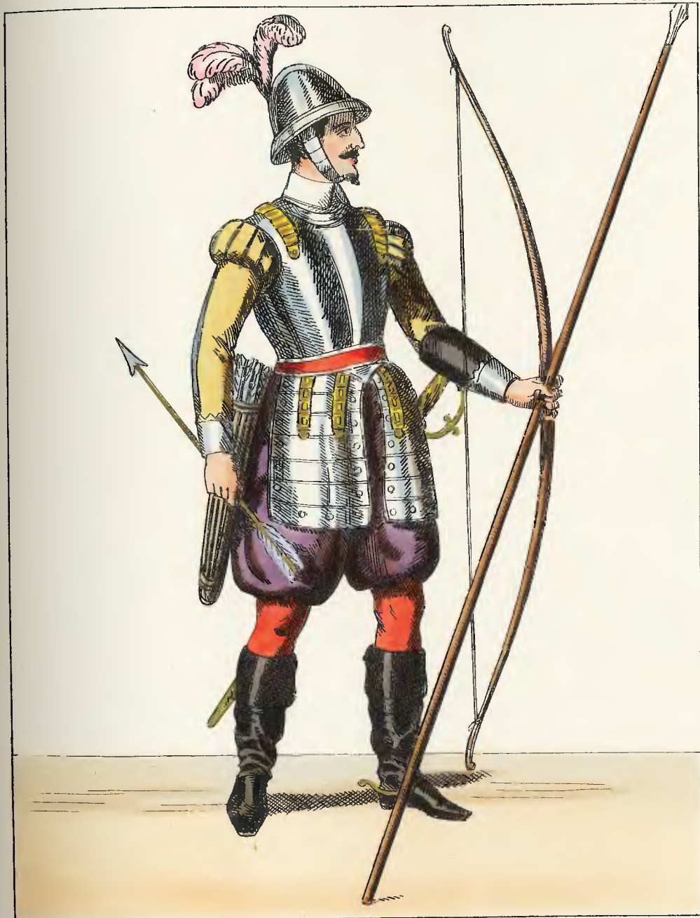
BRITISH ARMY — 1625.

(Doubly Armed Man — James 1 st Charles 1 st )