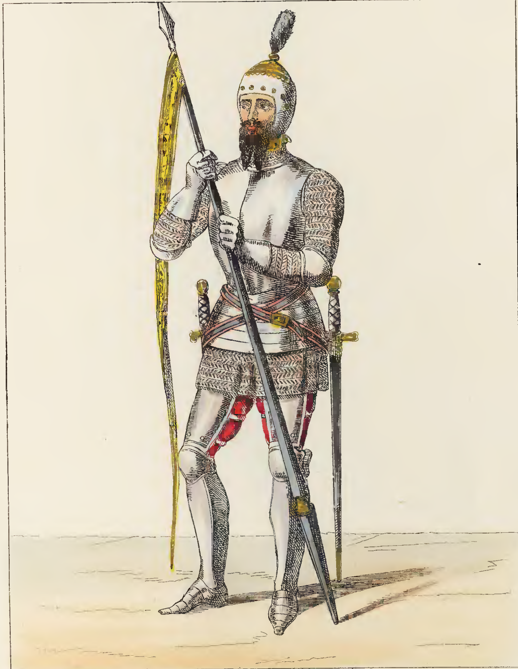
OWEN GLENDOWER, About 1404, (Armour of the Period)

Published by T H LACY, 89, Strand, London.