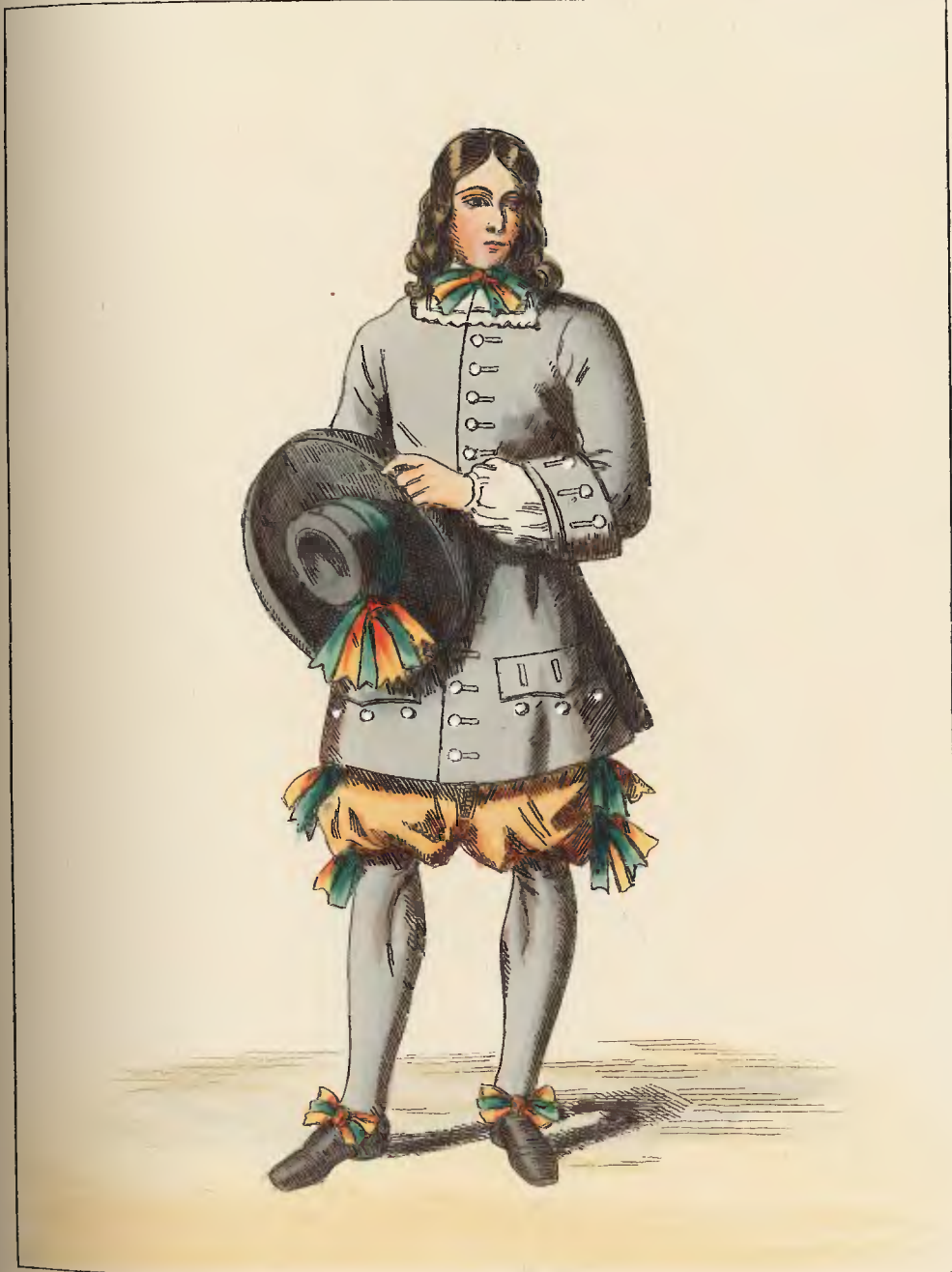
A YOUNG MAN—1705.

( England—Queen Anne—France—Louis 14 th )