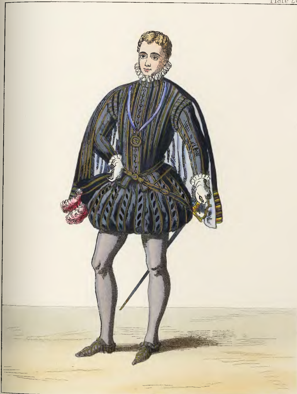
LORD HENRY DARNLEY (Period 1566)