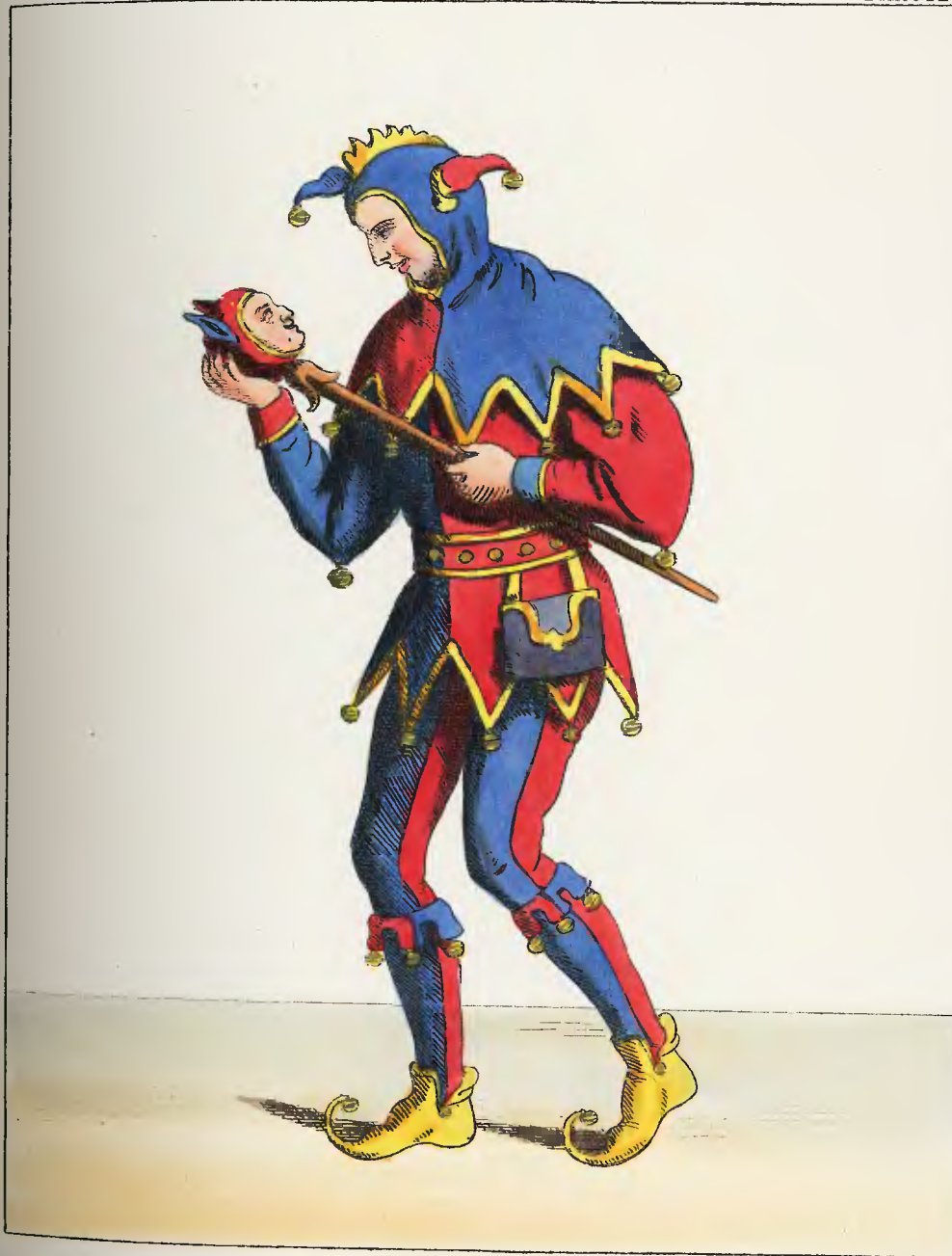
SHAKESPERIAN FOOL OR JESTER.