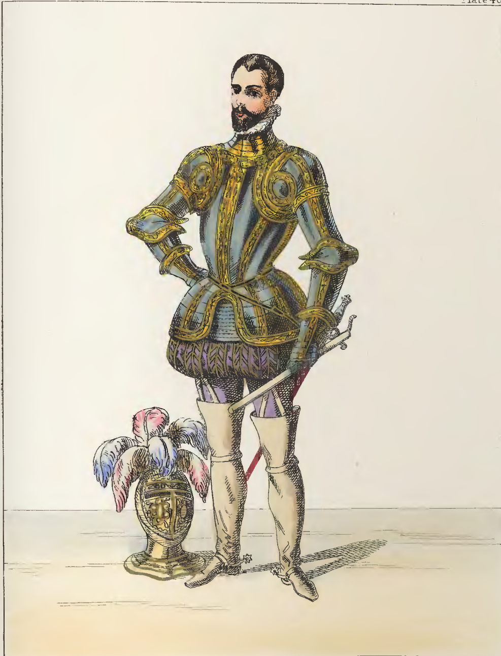
PHILLIP 2 nd HUSBAND of QUEEN MARY,