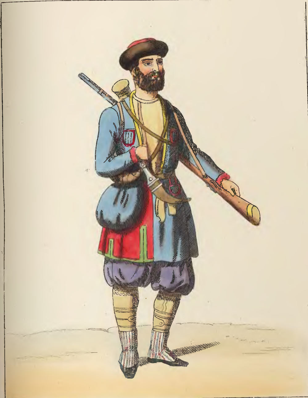
A LESGHI TARTAR.