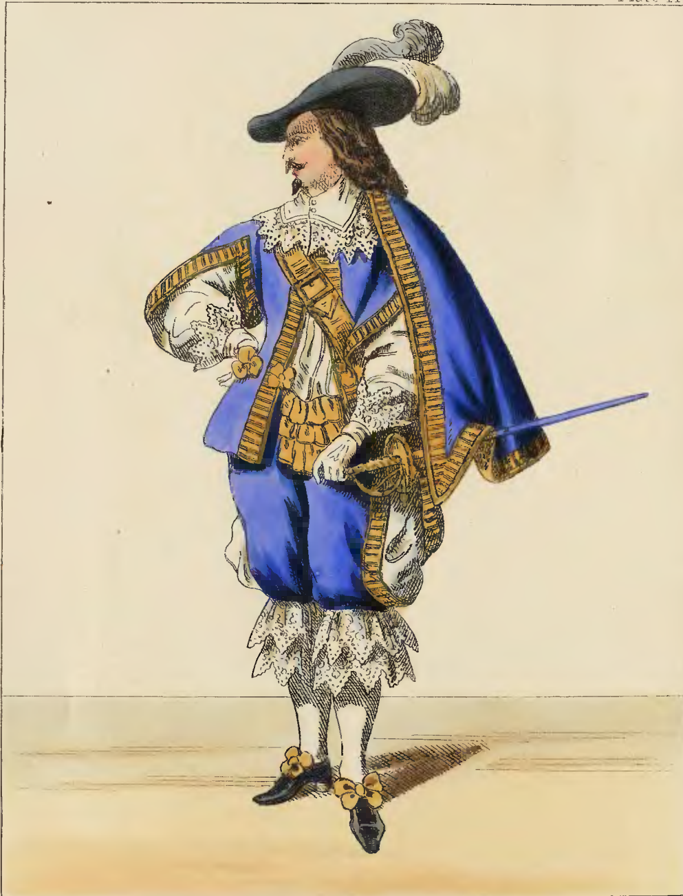
A GENTLEMAN—CHARLES 2 nd —LOUIS 14 th 1664

Published by T.H.LACY, 89, Strand, London