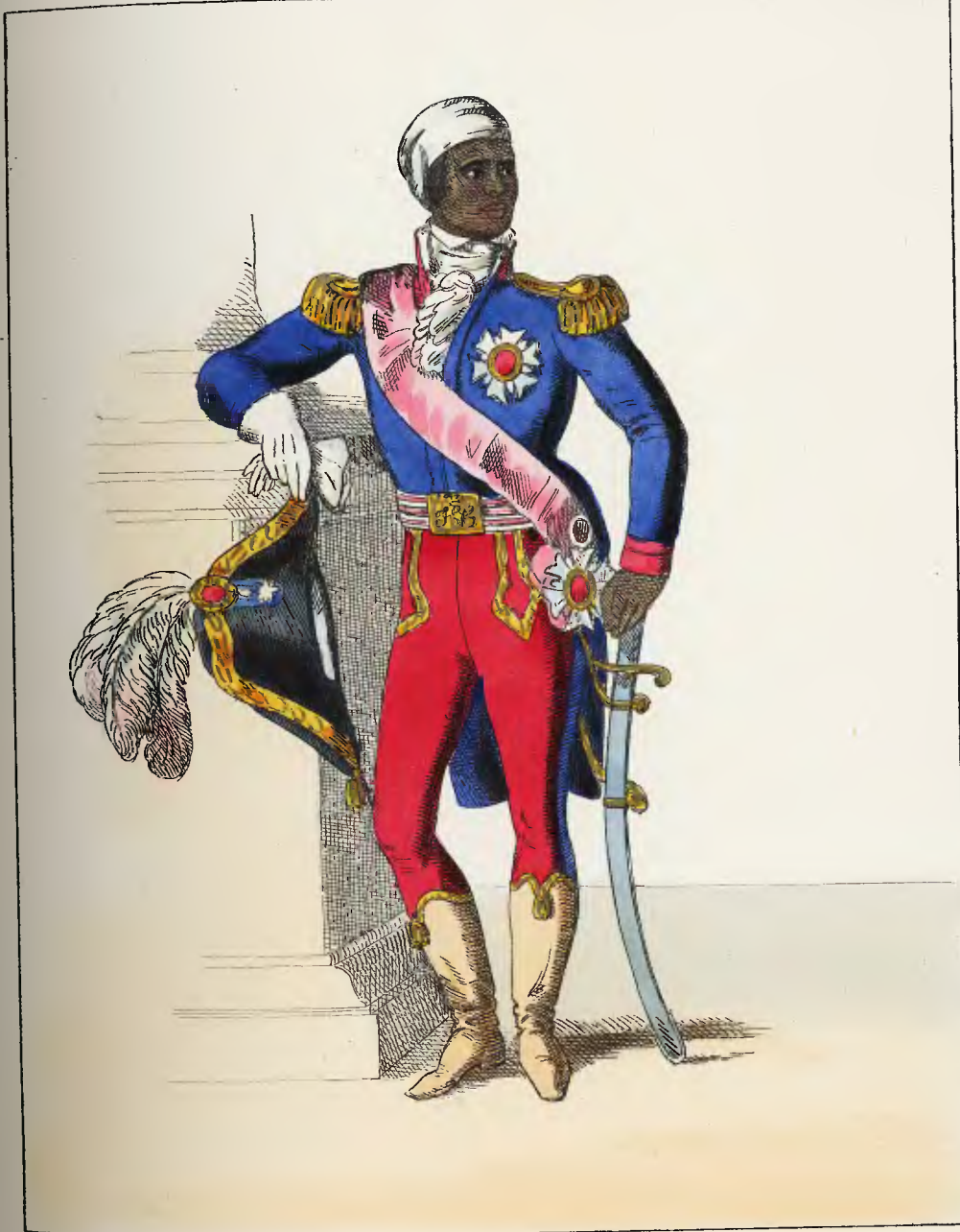
CHRISTOPHE, KING OF HAYTI, 1813