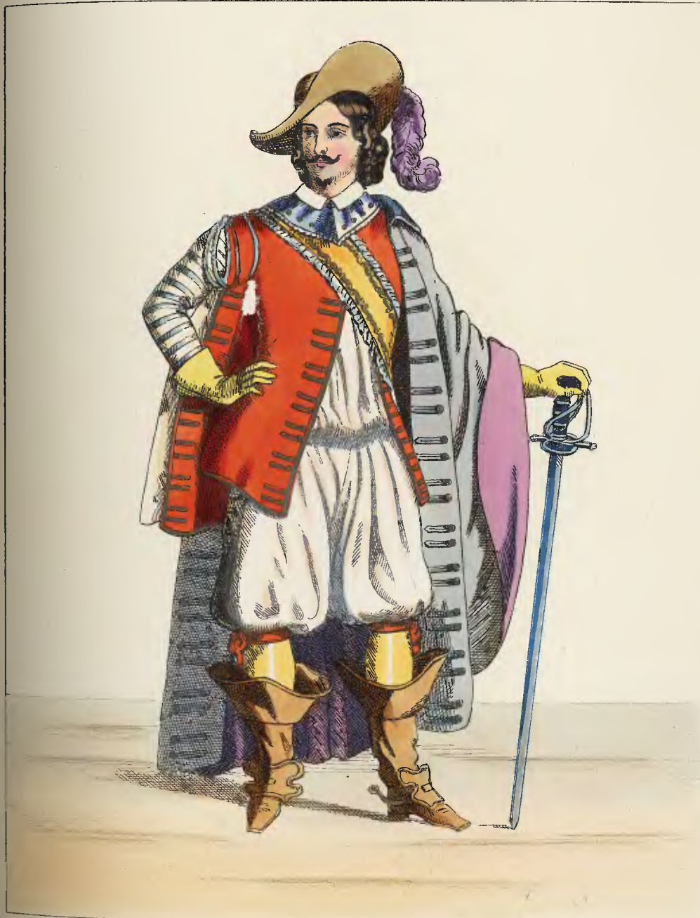
Costume of D'ARTAGNAN (Three Musketeers)