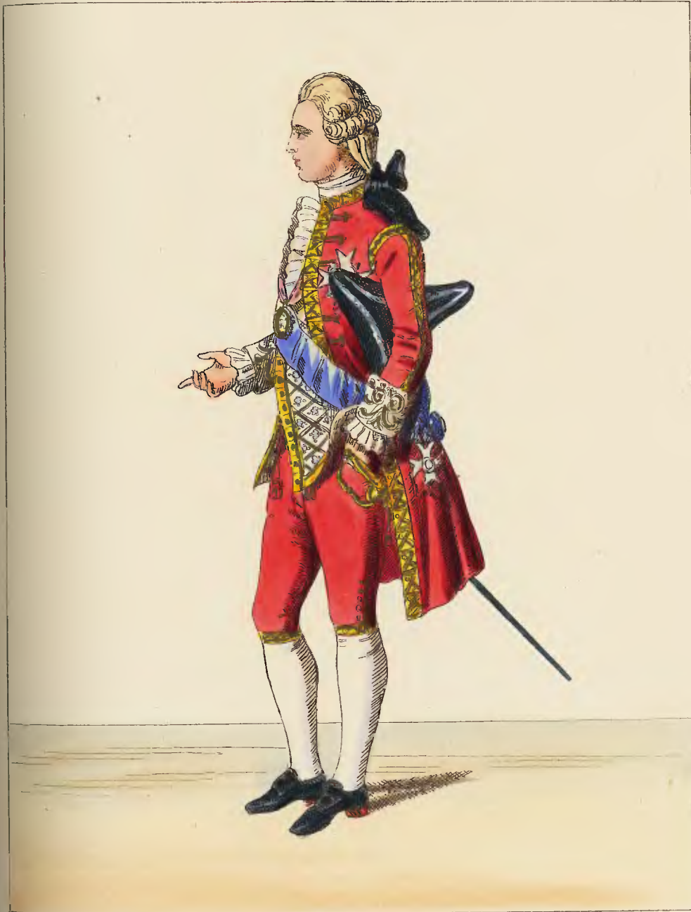
COURT DRESS—GEORGE 3 d —LOUIS 16 th —1780

Published by T. H. LACY, 89, Strand, London.