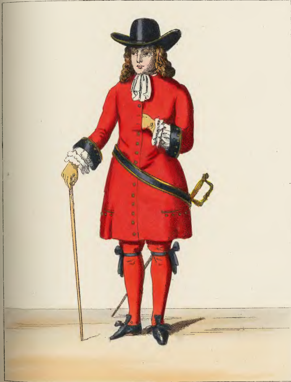
GENTLEMAN OF THE COURT OF CHARLES 2 nd (Period 1677)

Published by T.H. LACY, 89, Strand London.