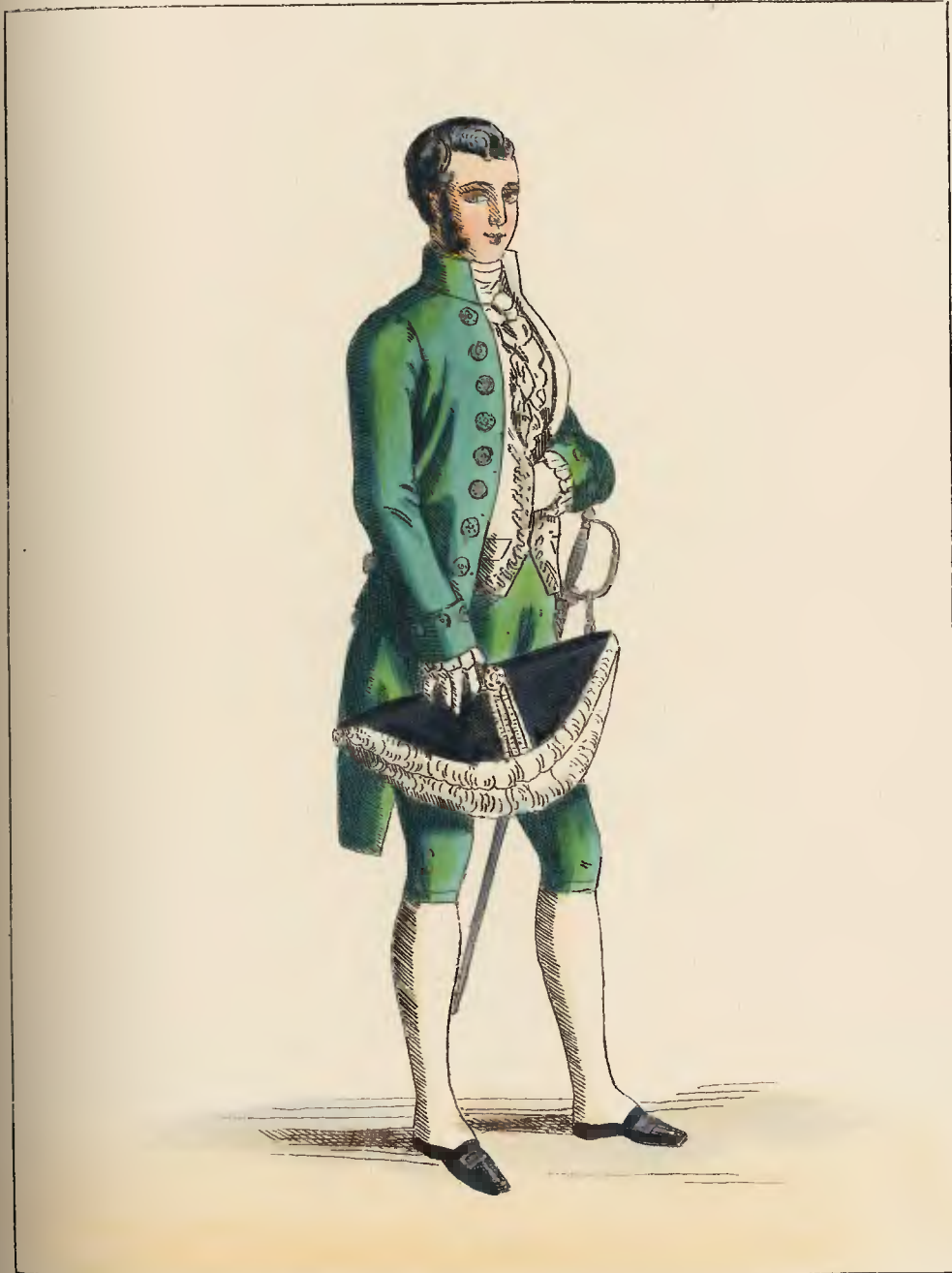
COURT DRESS. (Early Part of the Nineteenth Century) Published by T.H.LACY, 89, Strand, London.