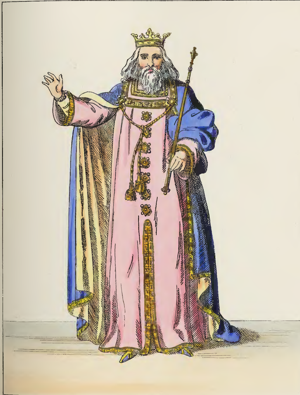
ENGLAND—KING EDWARD 3 rd —1320