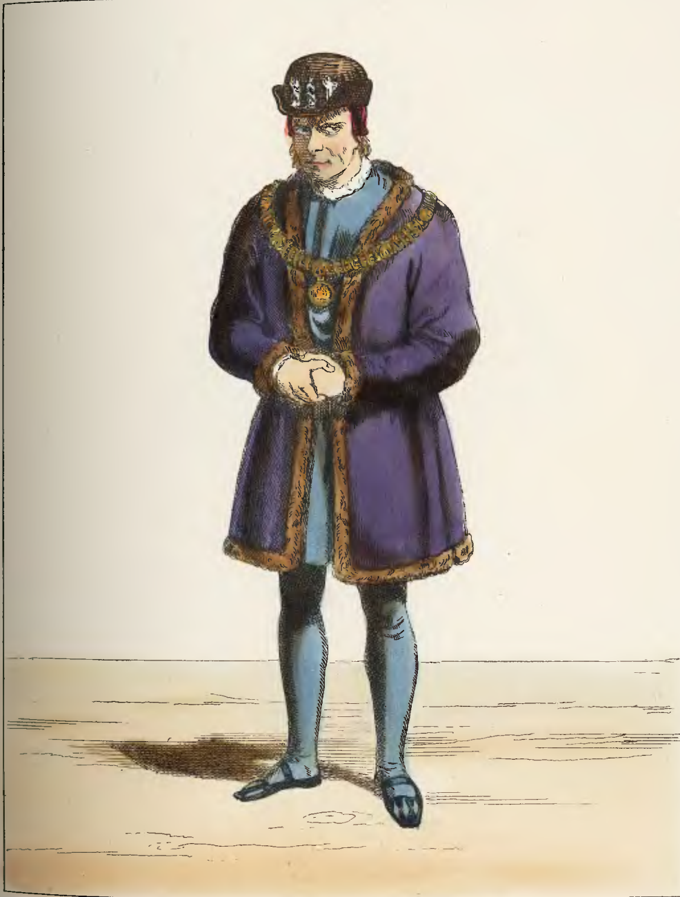
LOUIS XI, OF FRANCE (Period 1483)