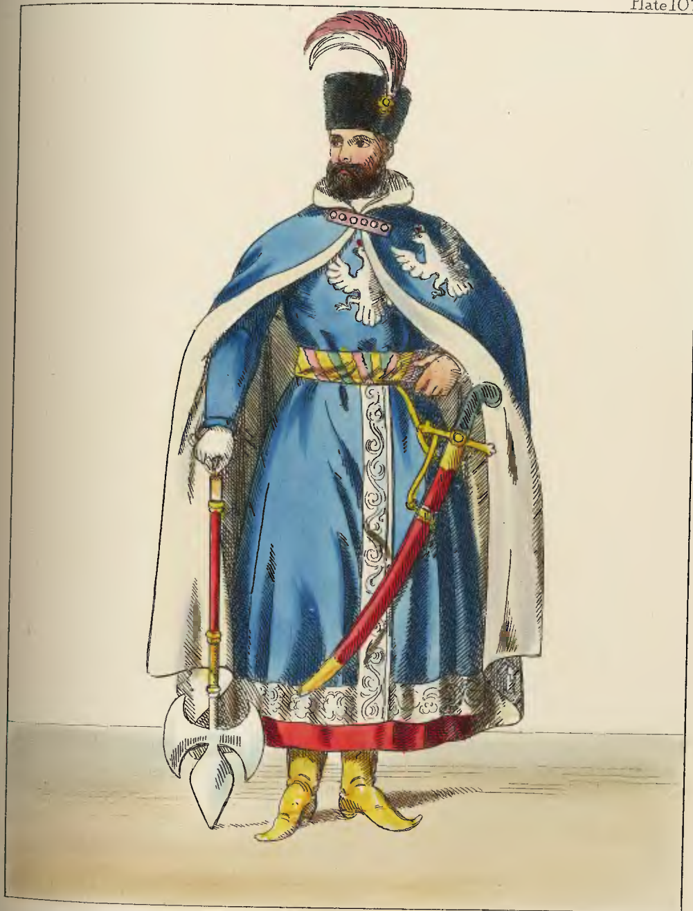
POLAND—KNIGHT OF THE WHITE EAGLE—1700

Published by T. H. LACY 89, Strand, London.