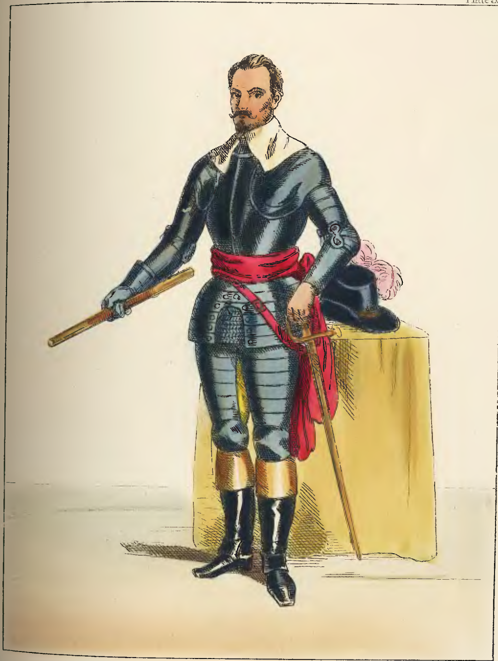
WALLLENSTIEN Duke of Friedland, Killed 1634 (Armour of the time)

Published by T. H. LACY 89, Strand London.