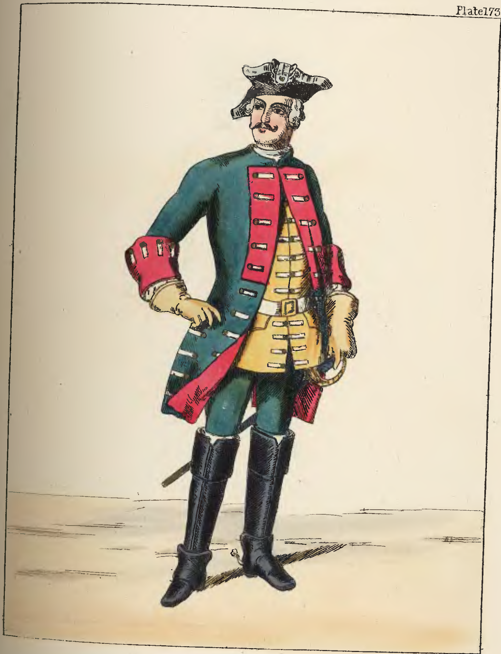
A FRENCH DRAGOON — 1775.