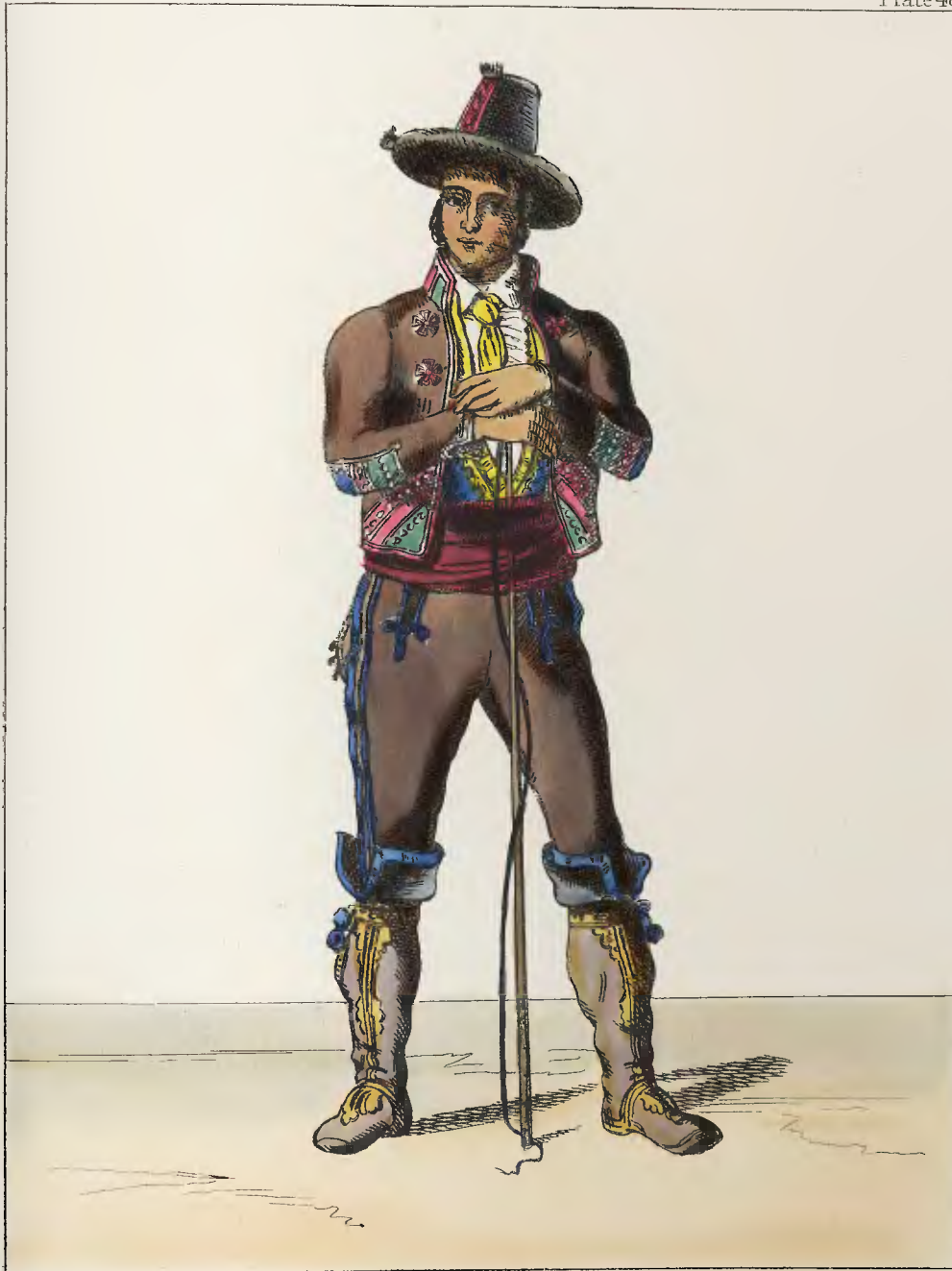
SPANISH MULETEER, Published by T.H.LACY, 89, Strand, London.