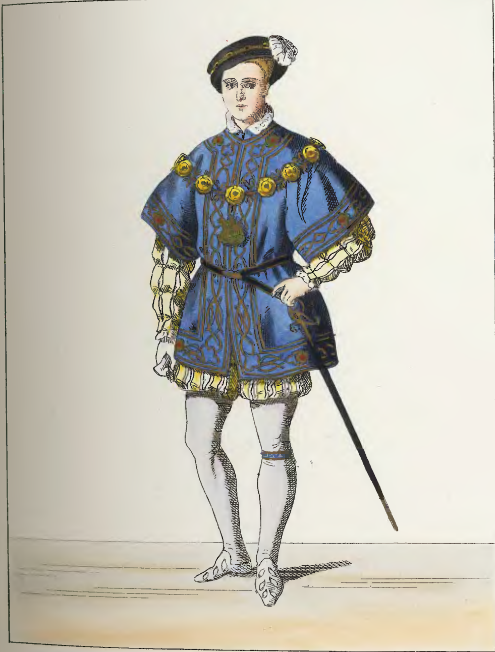
ENGLAND—KING EDWARD 6 th —1553

Published by T. H. LACY, 89, Strand London.