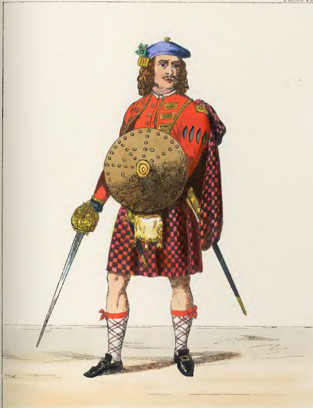
ROB ROY, Period 1712