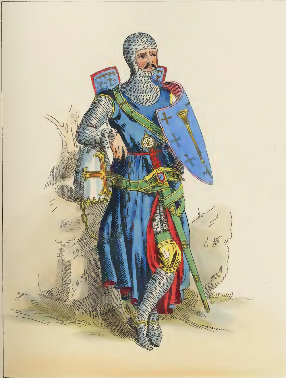
ENGLISH KNIGHT—EDWARD 1 st —1289,