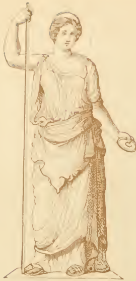
Hera, or Juno.