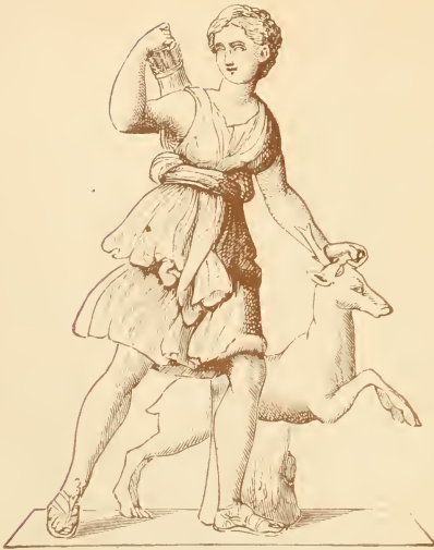
Artemis, or Diana.