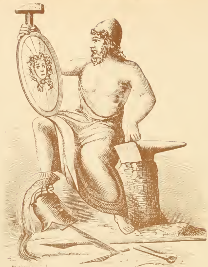
Hephæstos, or Vulcan.