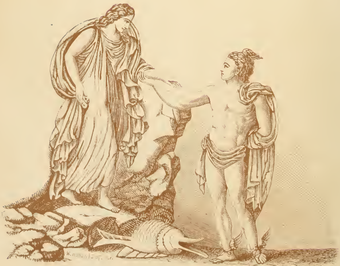
Perseus and Andromeda.