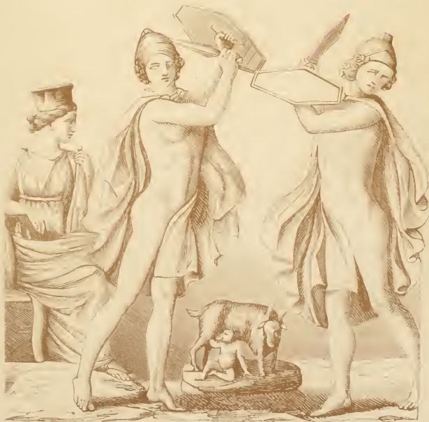
Kuretes Keeping Guard over Infant Zeus.