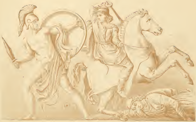
Combat between Greek and Amazon.