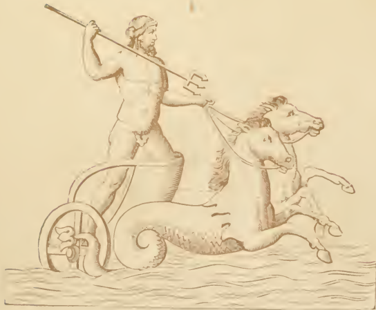
Poseidon, or Neptune.