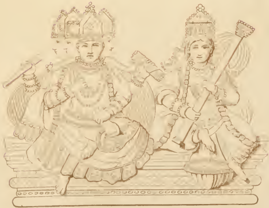
Brahma with Saraswati.