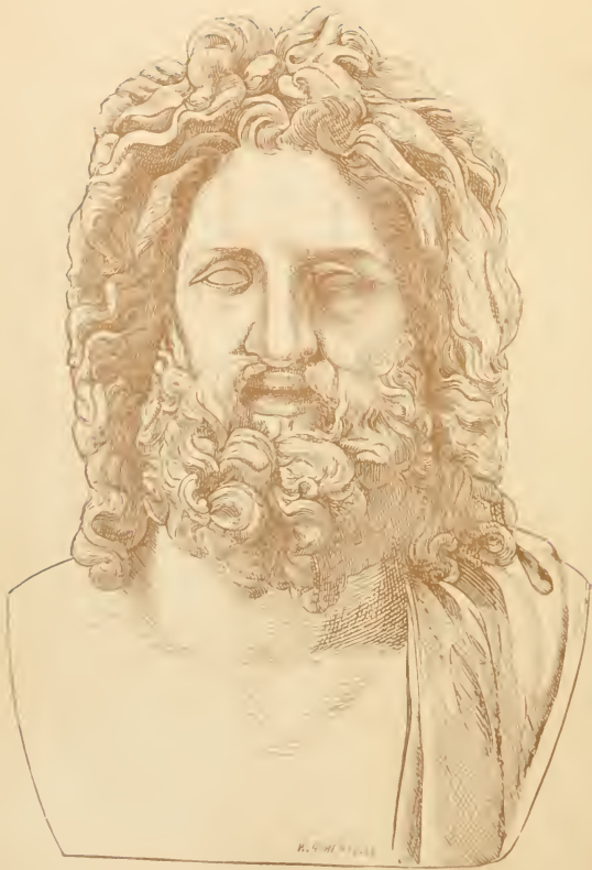
Zeus, or Jupiter.