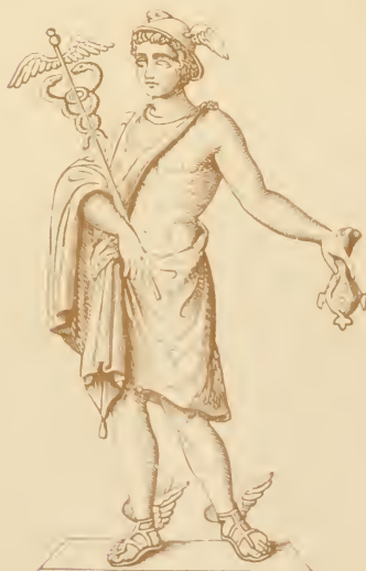
Hermes, or Mercury.