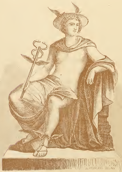
Hermes, or Mercury.