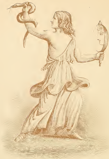
One of the Erinys.