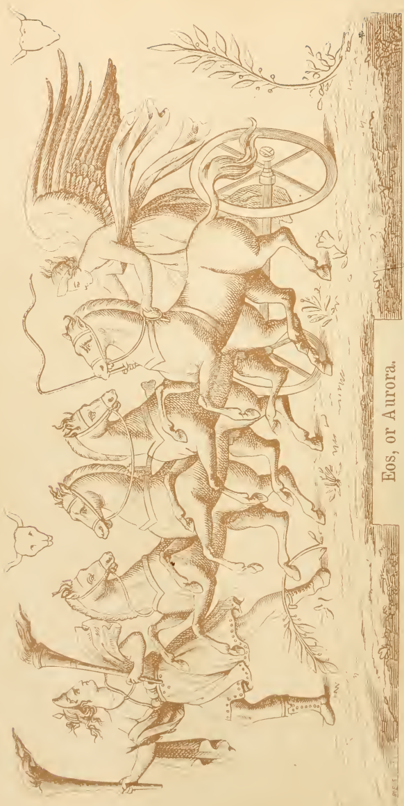
Eos, or Aurora.