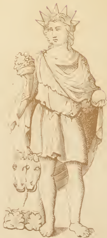
Helios, or Sol.