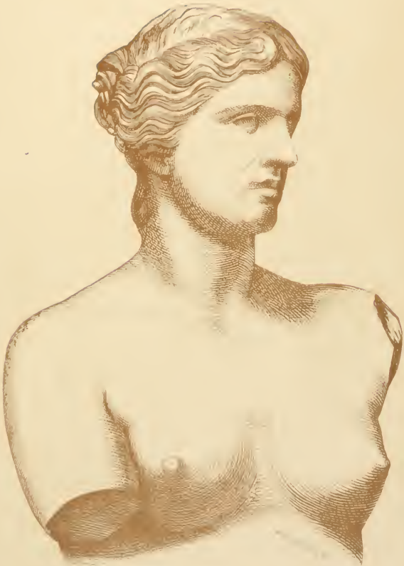
Aphrodite, or Venus.