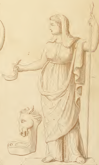
Hestia, or Vesta.