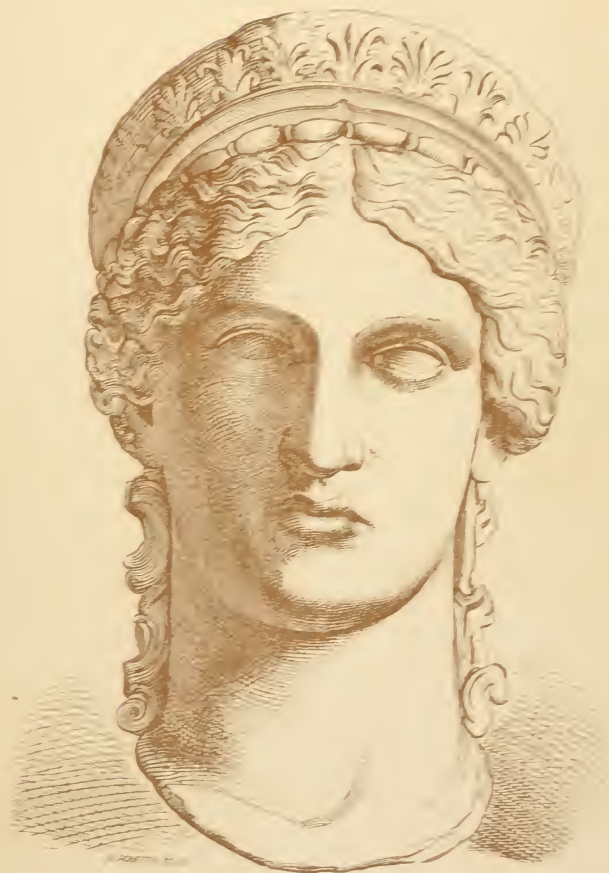
Hera. or Juno.