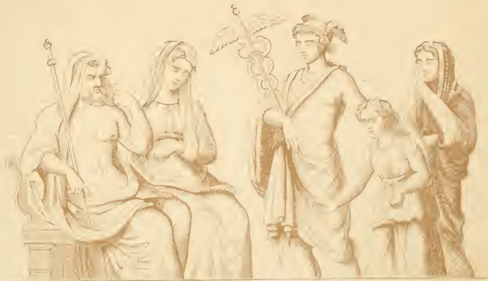
Pluto and Proserpina.