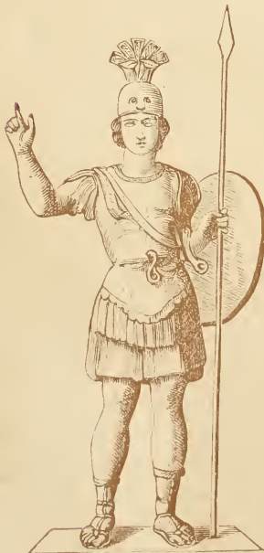
Ares, or Mars.