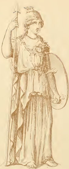
Pallas-Athene, or Minerva.