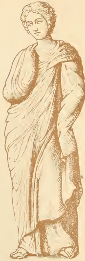
Mother of the Muses.