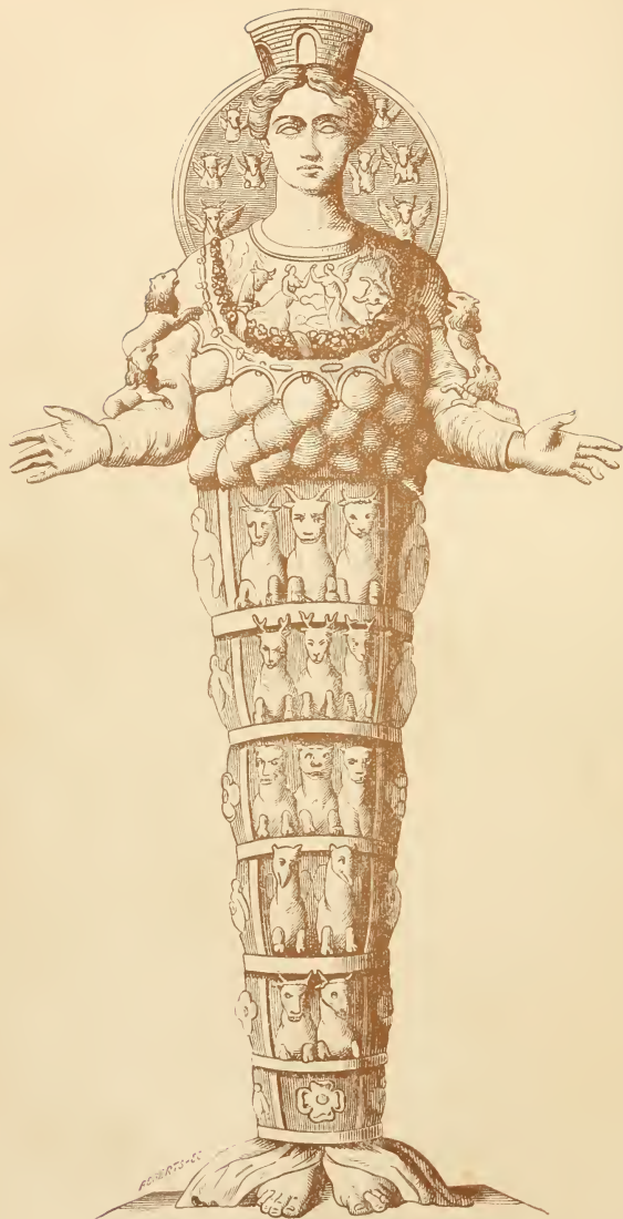
Diana of Ephesus.