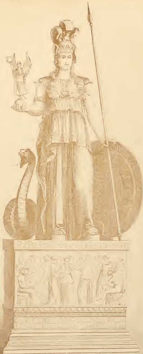
Pallas-Athene, by Pheidias.