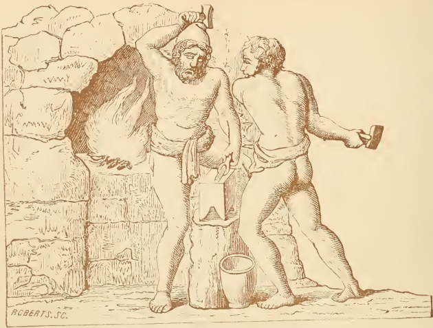
Hephæstos, or Vulcan