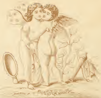
Cupid and Psyche.