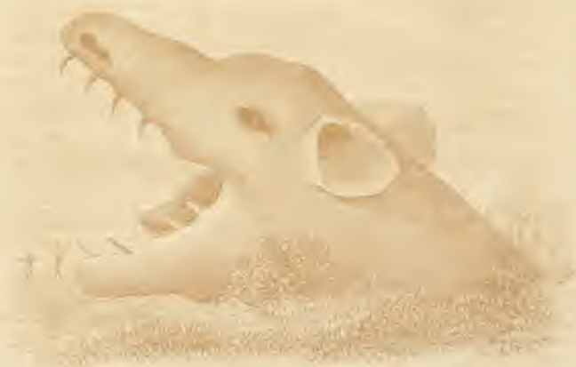
The Wolf Fenris.