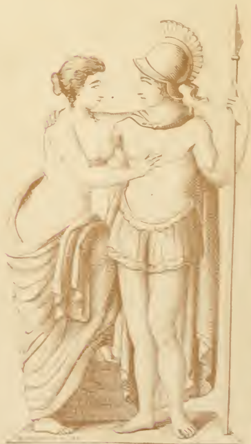
Mars and Venus.