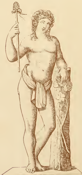
Dionysos, or Bacchus.