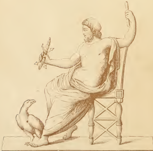
Zeus, or Jupiter.