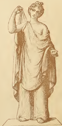
Aphrodite, or Venus.