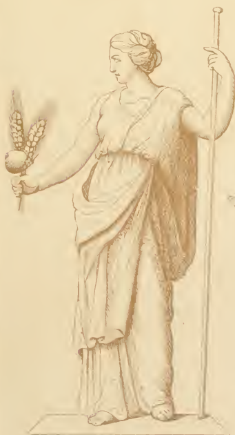
Demeter, or Ceres.