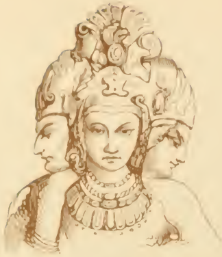
Trimurti, or Hindoo Trinity.