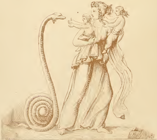
Leto, or Latona.