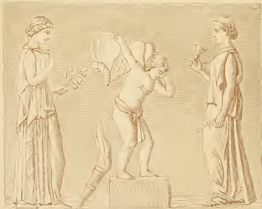
Eros Grieving for Psyche.