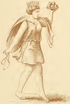
One of the Horæ.