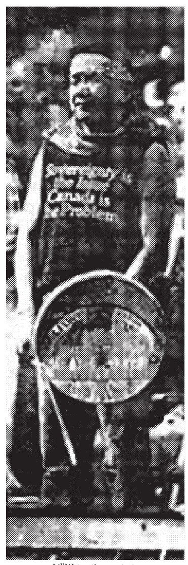
Lil'Wat nation protestor, British Columbia

Meanwhile, in British North America, the geo-military importance of the First Nations was quickly being eroded. With the influx of loyalists after the U.S. War for Independence, the European population had grown and was strategically garrisoned