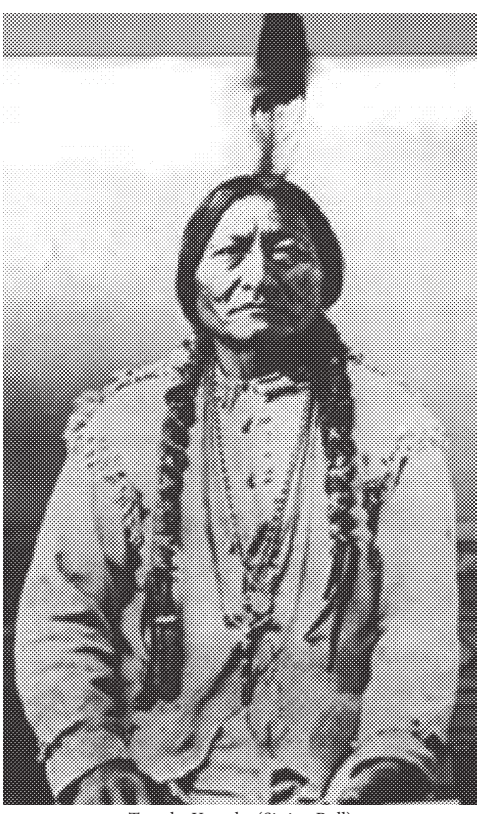
Tatanka Yotanka (Sitting Bull)

Prior to the U.S.-British War of 1812, Louisiana was purchased from France, in 1803, and Spain had ceded Florida in 1819. By 1824, the Bureau of Indian Affairs was organized as part of the War Department. Military campaigns were launched against First Nations, from the Shawnee of the Mississippi Valley to the Seminole in Florida. At the same time, the legalistic instruments for occupation were being introduced. In 1830 the Indian Removal Act was implemented, and in 1834 Congress reorganized the various departments dealing with Indian repression by creating the U.S.