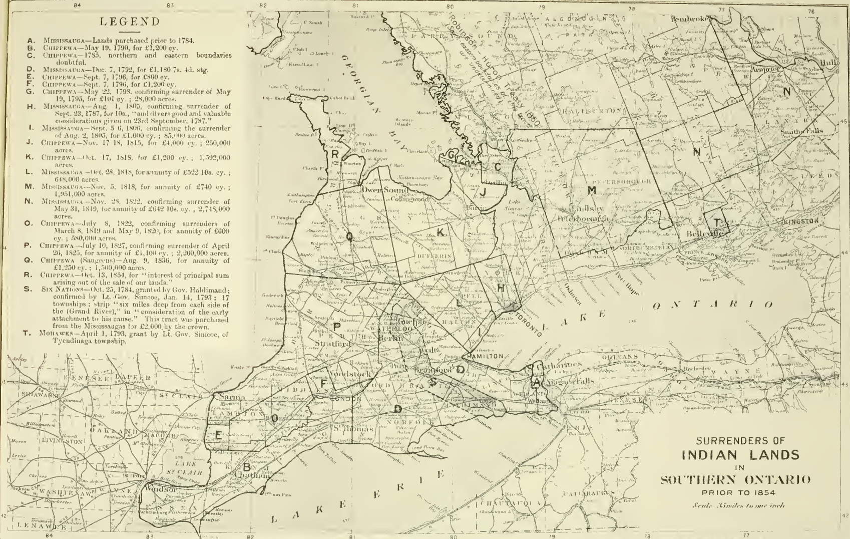
SURRENDERS OF INDIAN LANDS IN SOUTHERN ONTARIO PRIOR TO 1854