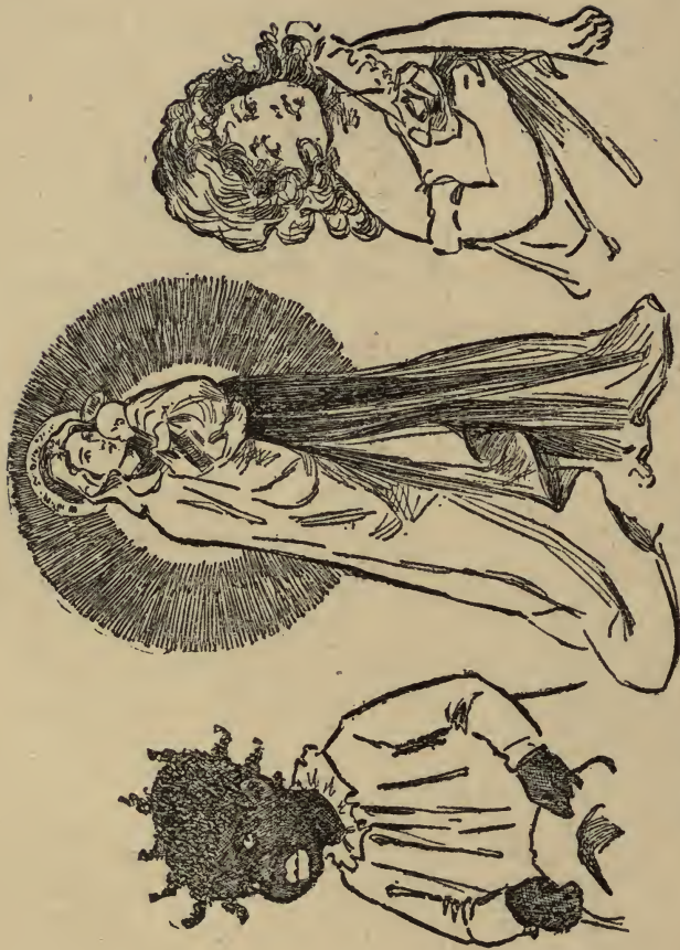
The VIRGIN MARY and the CHILD CHRIST. Could the Child Christ possibly be of the same flesh as the Negro?