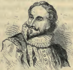
LOPE DE VEGA.

from the regions of fiction, in the very heart of truth." Not content with this appeal through the theatre, Cervantes, with constant zeal, takes up the same theme, in the tale of the Captive, in Don Quixote, as we have already seen, and also in that of El Liberal Amante , The Liberal Lover, and in some parts of La Espanola Inglesa , The English Spanishwoman. All these may be regarded, not merely as literary labors, but as charitable endeavors in behalf of human freedom.