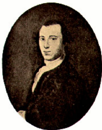
THOMAS HEYWARD, Jr.