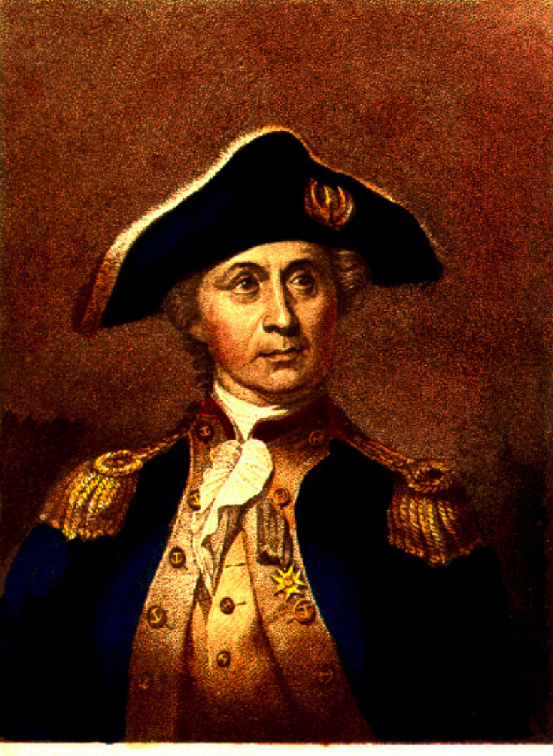
England bow it Lineary from a Power to C.W Water