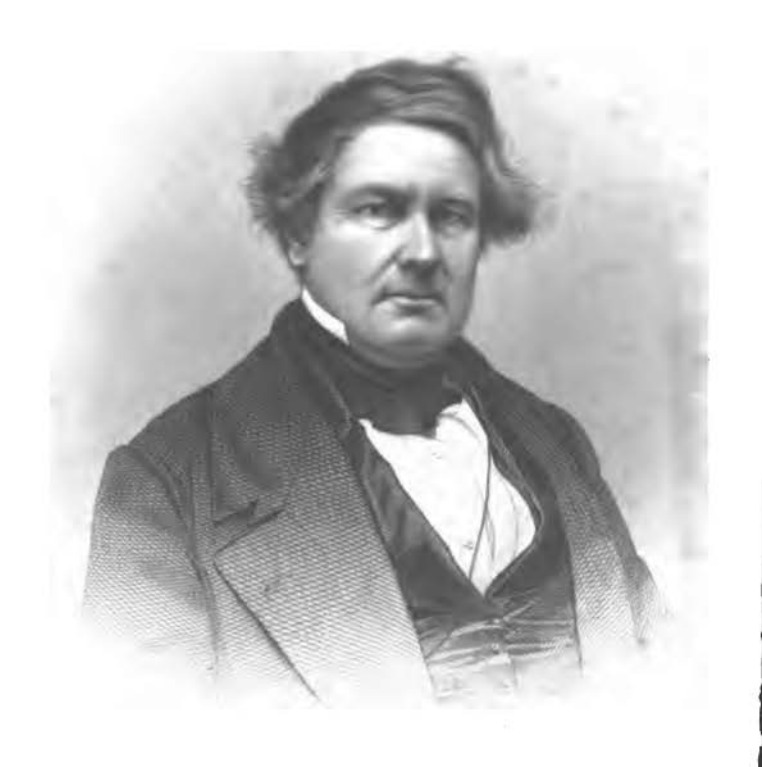
Engrave the tentition