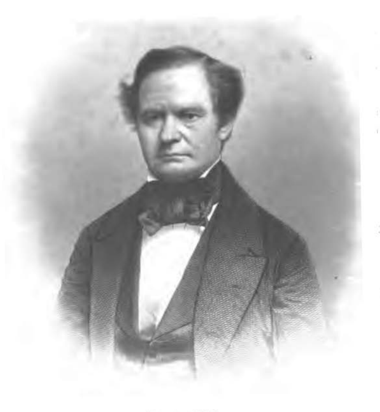
"women by J C Buttre