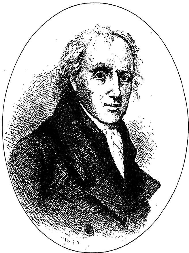
MASON LOCKE WEEMS