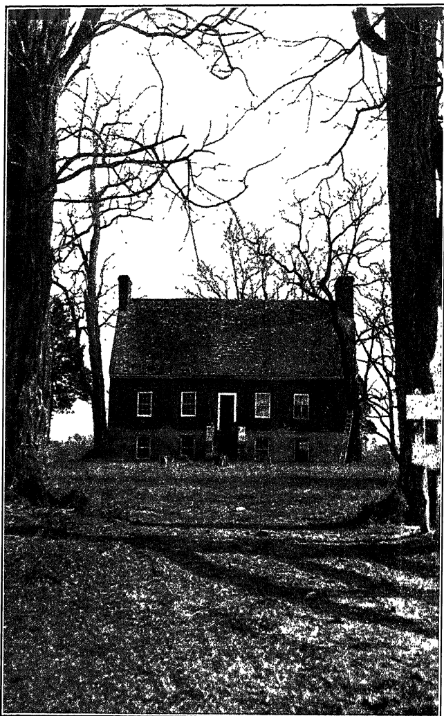
PARSON WEEMS'S HOME, "BEL AIR" NEAR DUMFRIES, VIRGINIA