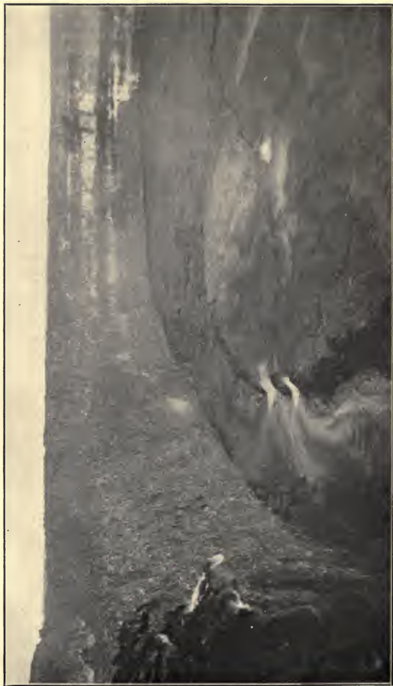
HALEMAUMAU—THE LAKE OF FIRE