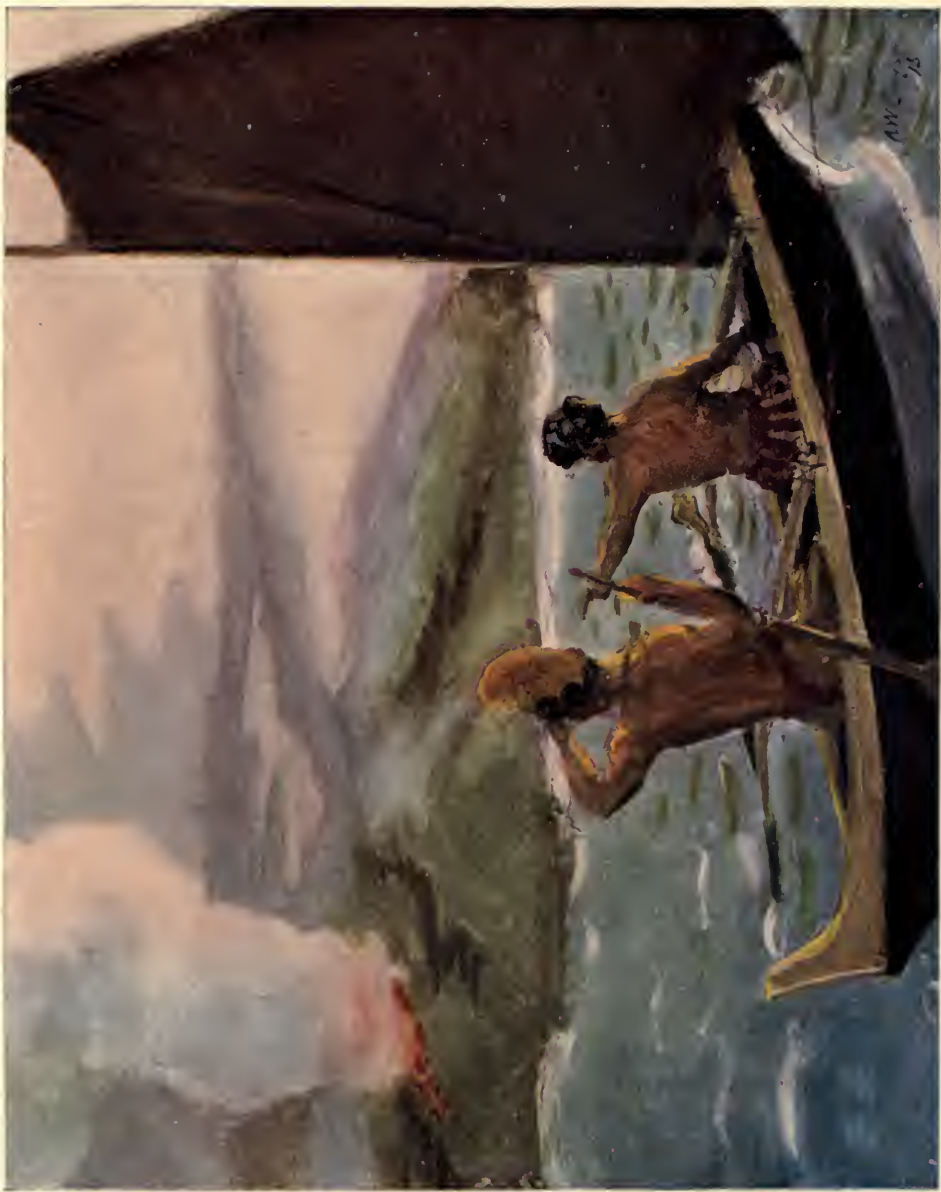
THE GOD IS AT WORK IN THE HILLS.