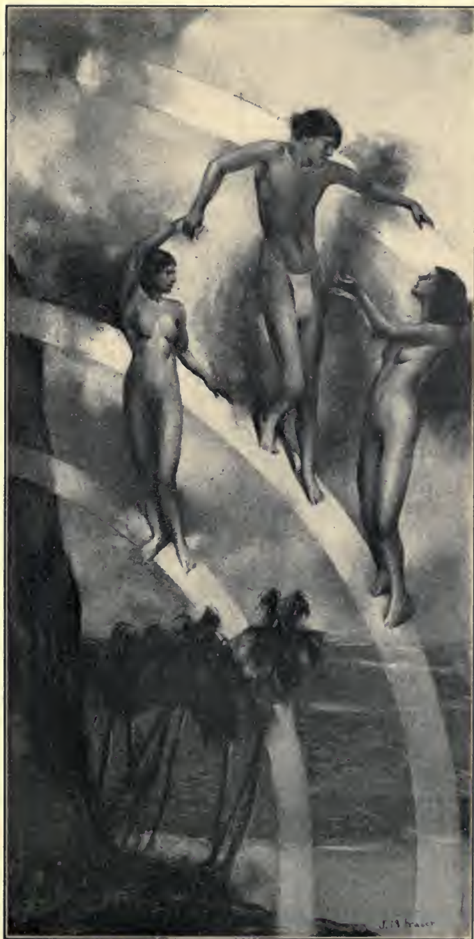
THE DESCENT FROM THE CLIFFS