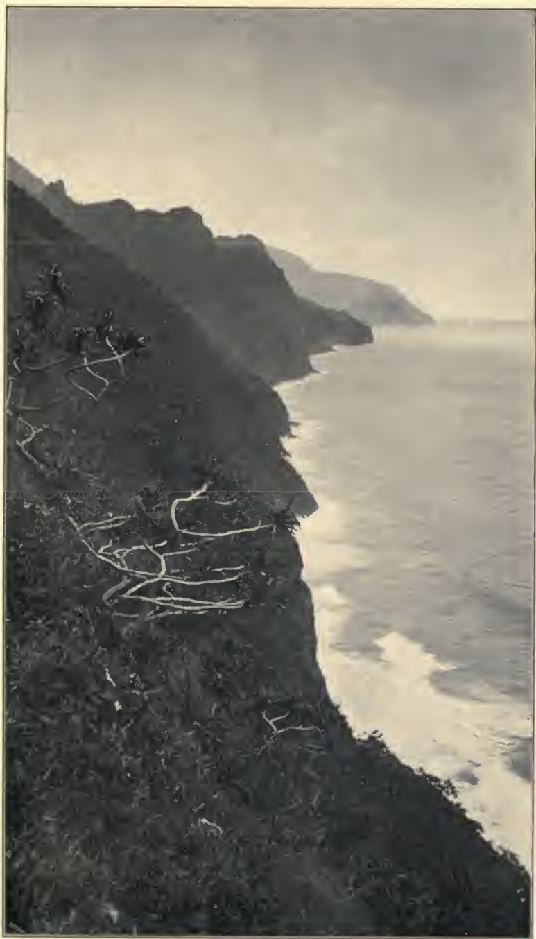
THE CLIFFS OF KALALAU