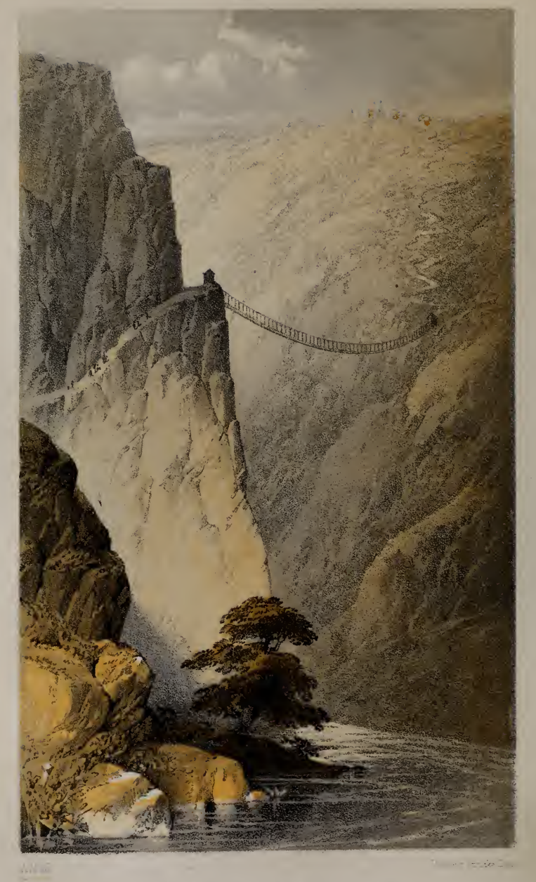
Jacks our the encrement