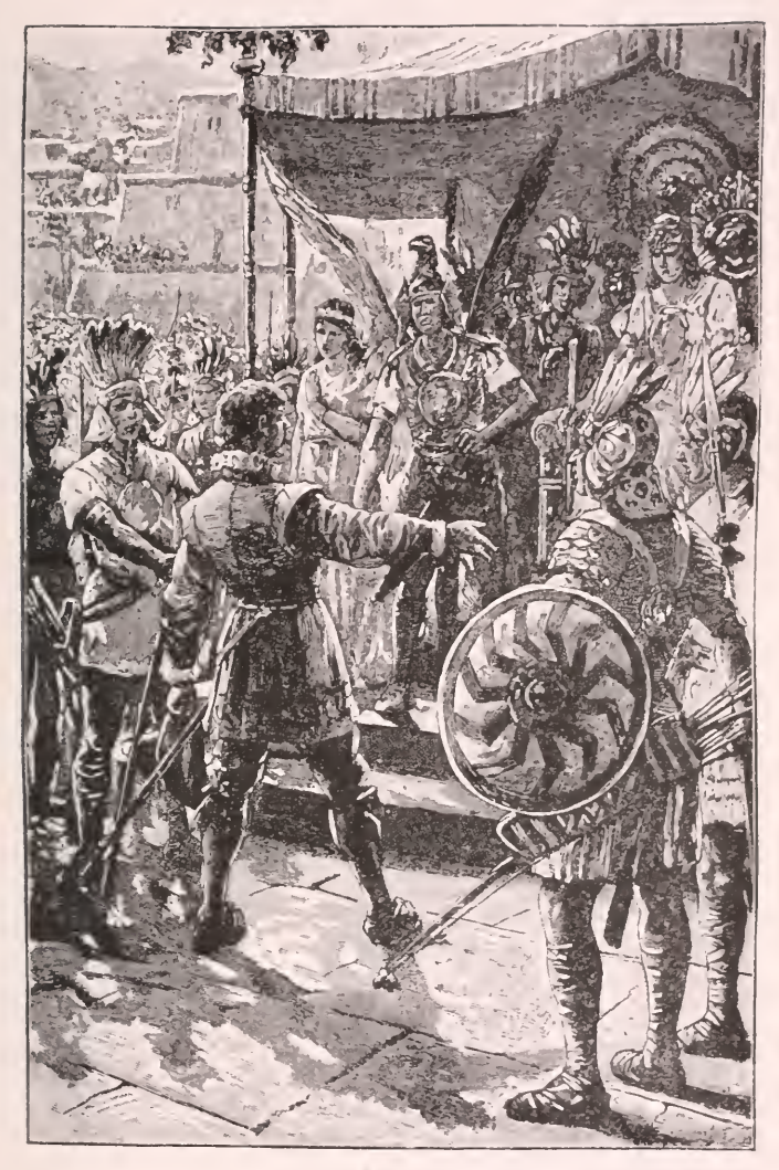
THE TWO SAVIOURS.