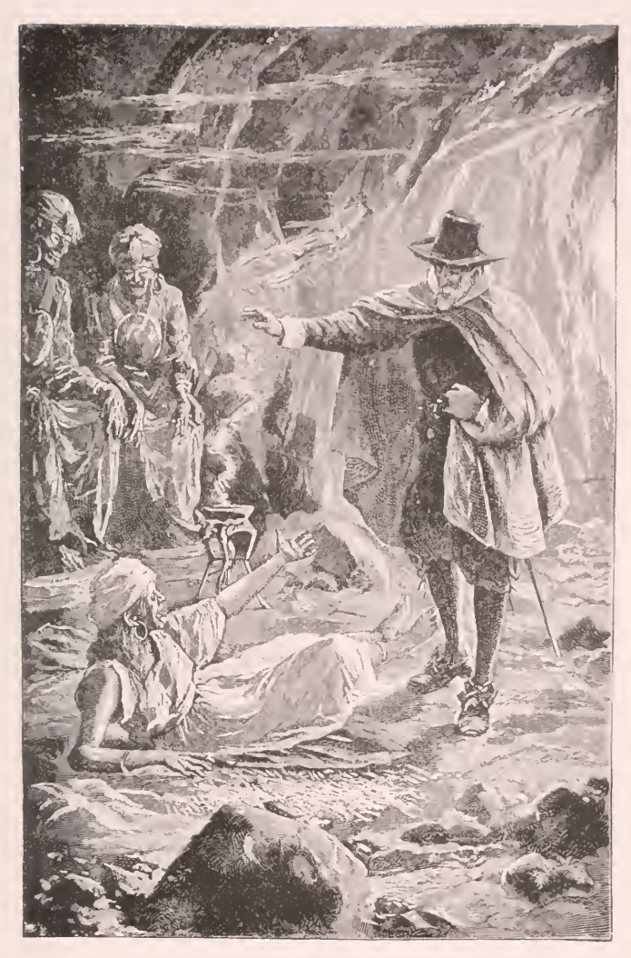
DEATH OF AKLIA THE CHRISTIAN.