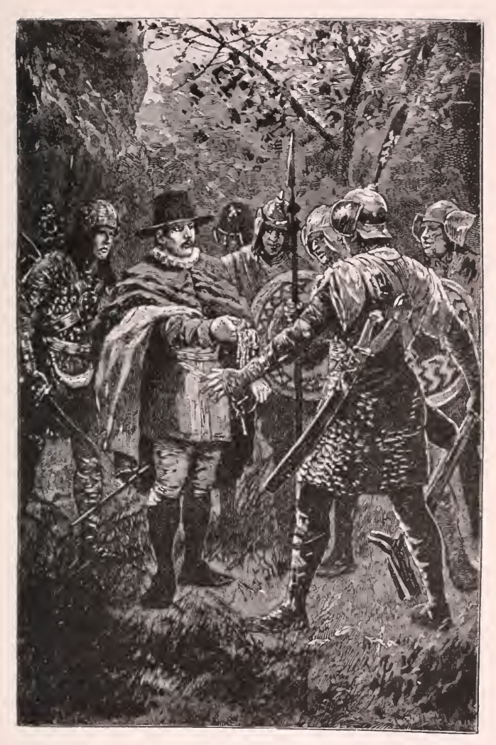
THE INCA'S KIPPU.