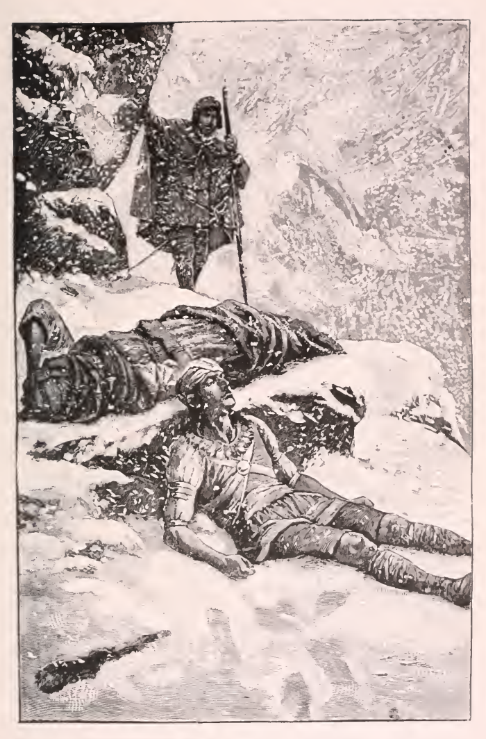
SNOWSTORM IN THE MOUNTAINS.