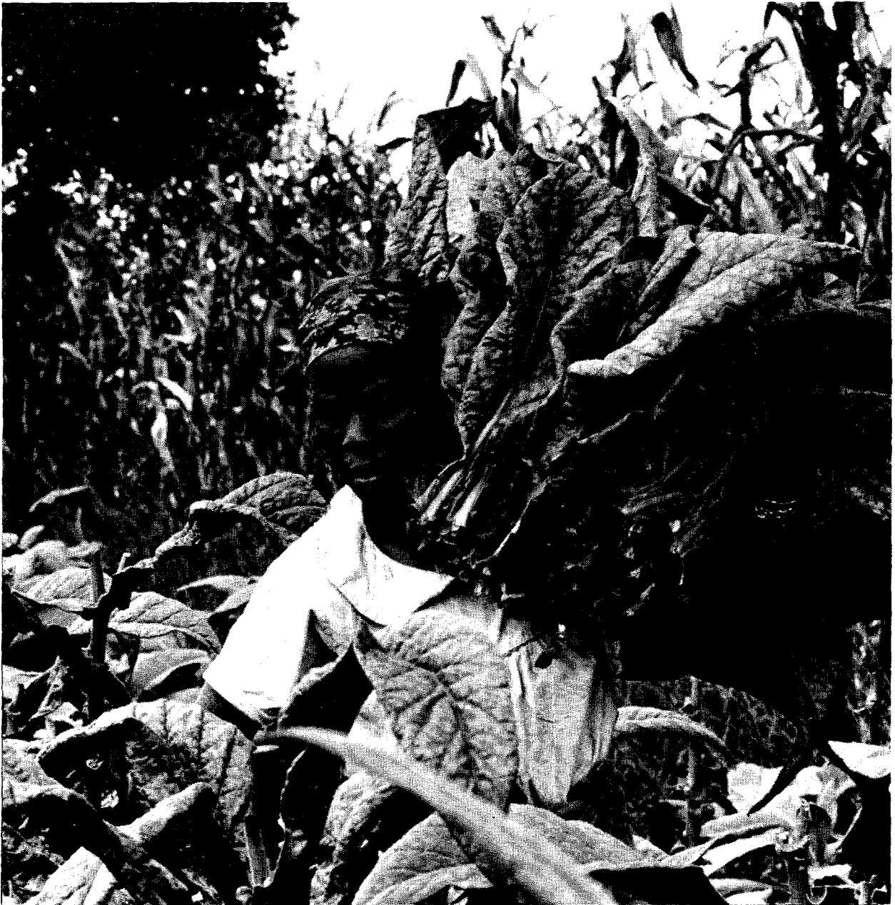
Tobacco farming in Lilongwe, Malawi.