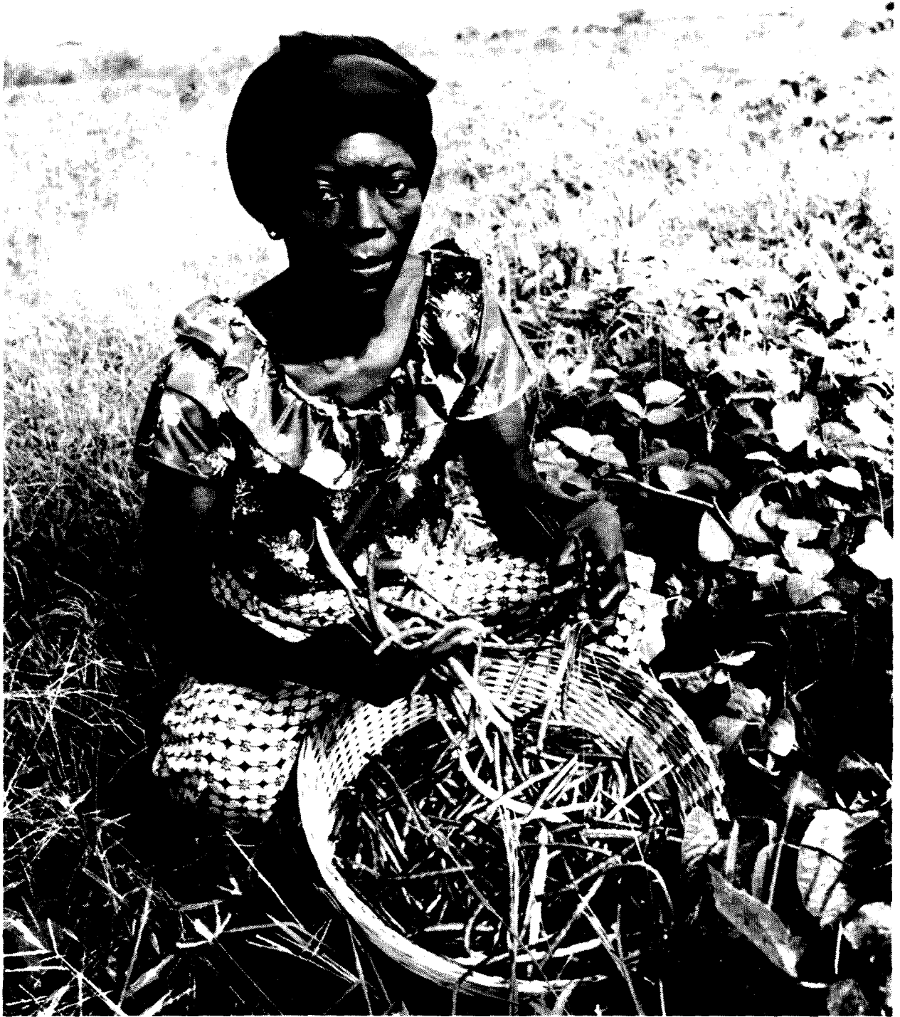
Irrigation on the Kpong Farm, Ghana.