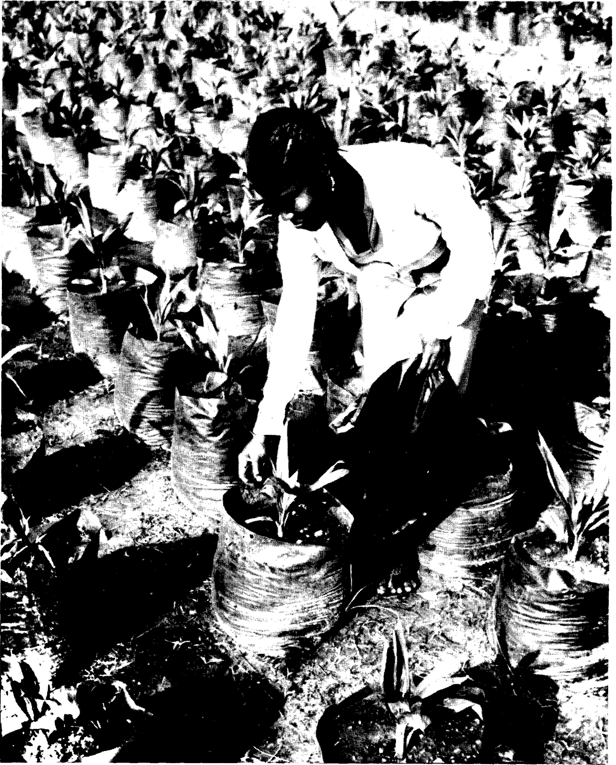
Tending palm seedlings at an orchard in Kwaie, Ghana.