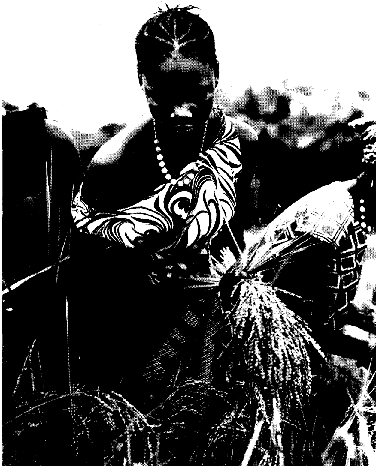
Young woman working in the rice fields of the Casamance region in Senegal.