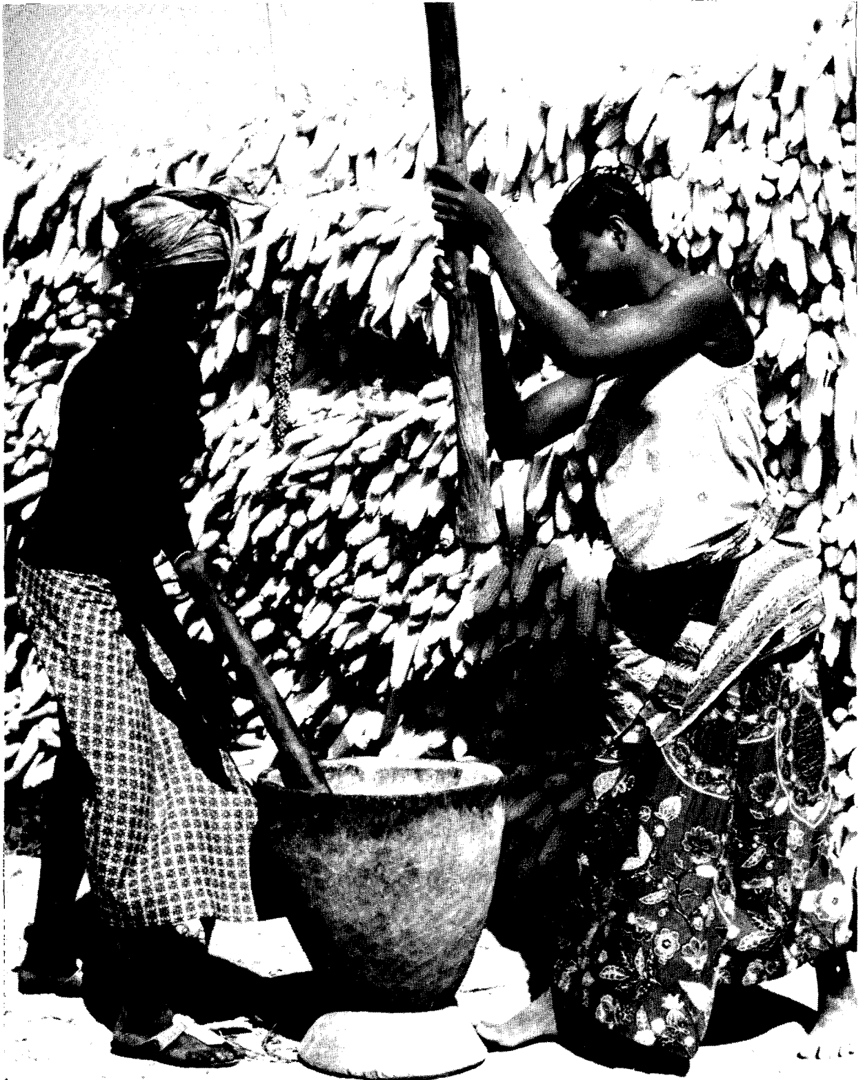
Use of the traditional mortar and pestle method to pound sorghum and corn into meal in Koro, Burkina, Faso.