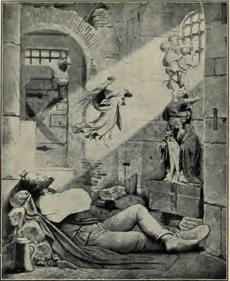
SCHWIND, The Dream of the Prisoner