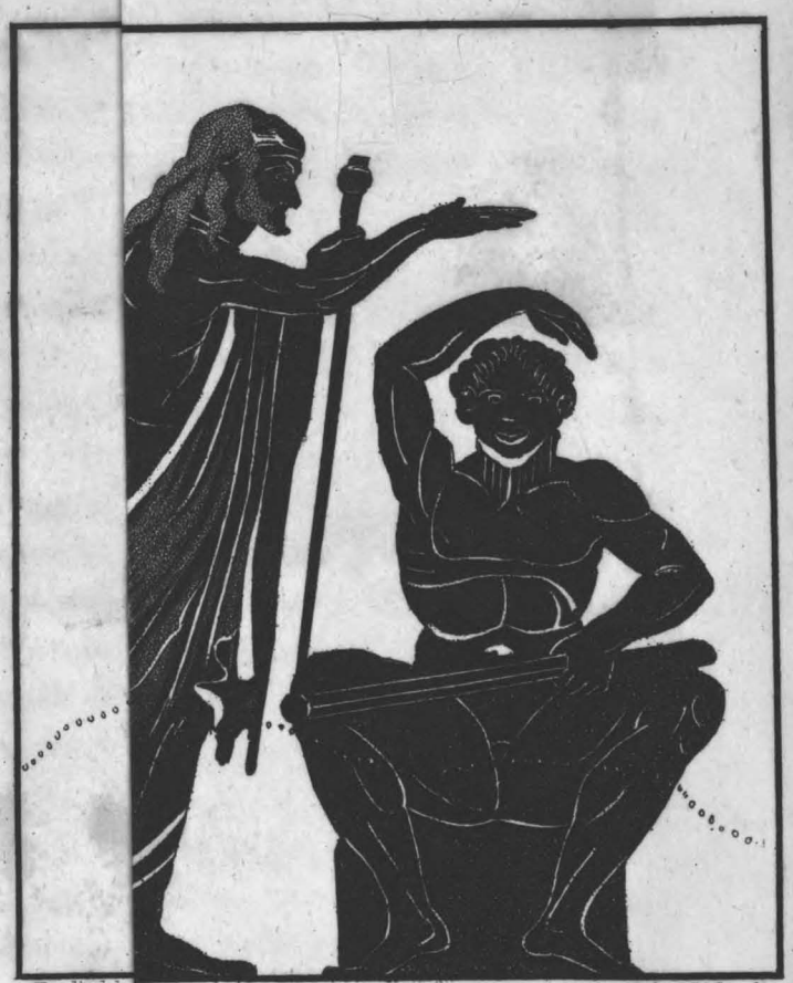
Tendi del: 1.1817.