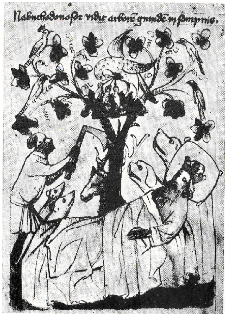
The Dream of Nebuchadnezzar

From the "Speculum humanae salvationis," Codex Palatinus Latinus 413, Vatican, 15th cent. (see pars. 163, 4 8 4f., 559)