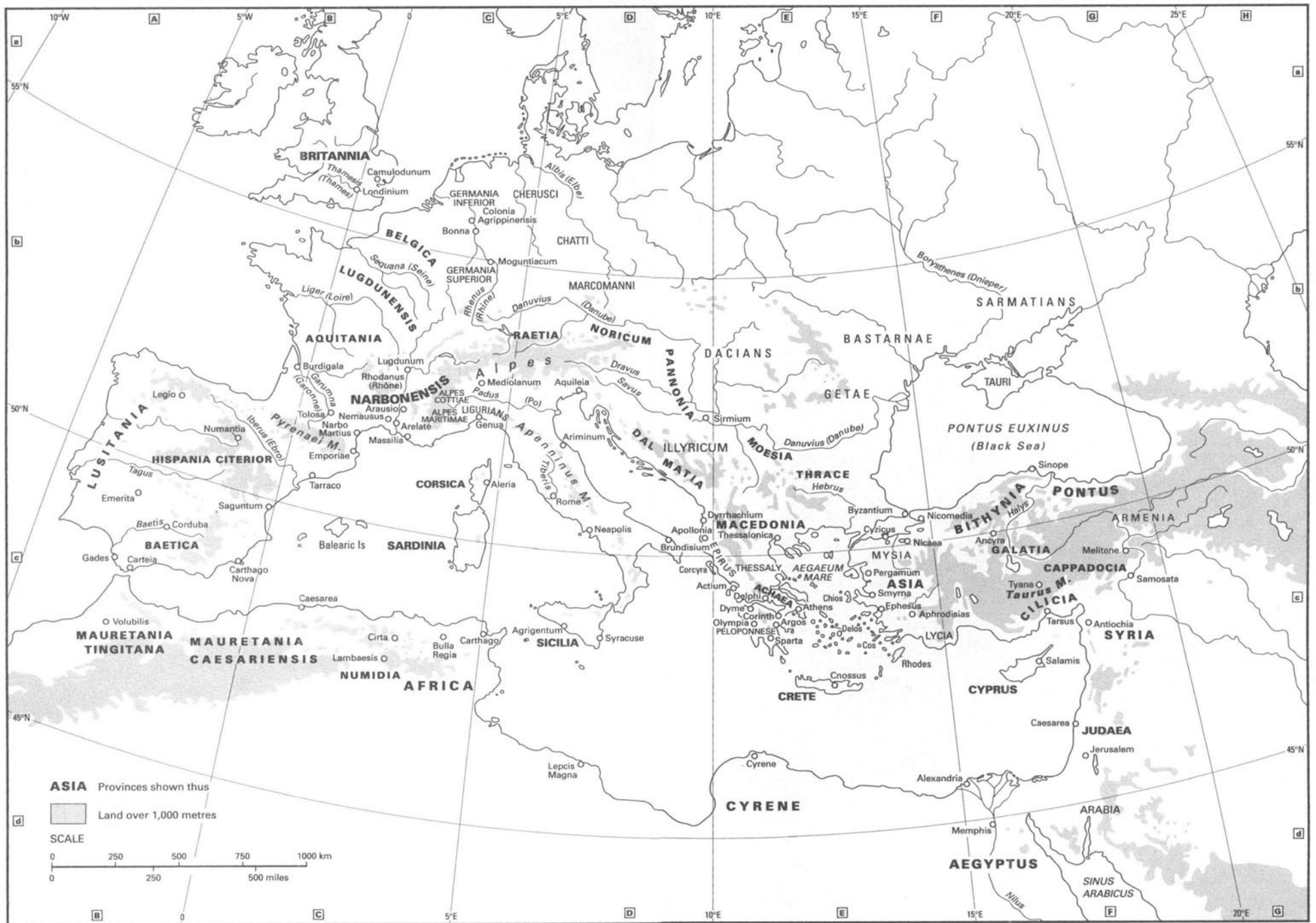
Map 2. The Roman empire, 45 BC-AD 69.