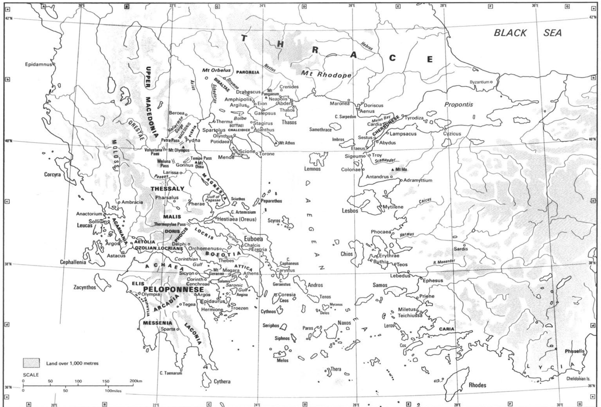
Map 1. Greece in the fifth century BC.