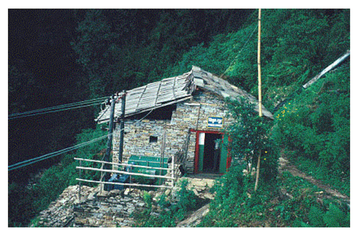
Figure 2: Micro hydro scheme showing the power house, the penstock and the transmission lines

possible where river flow fluctuates throughout the year or where daily load patterns vary considerably.