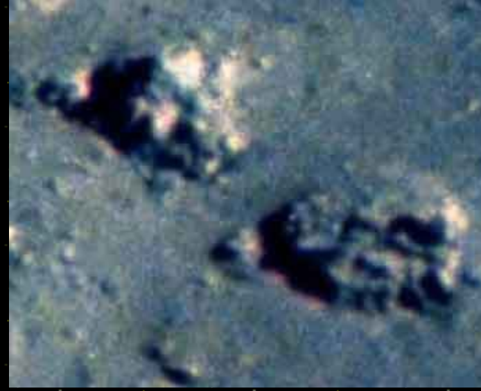
Two apparently metal cased or forged objects from the rim of Shorty Crater