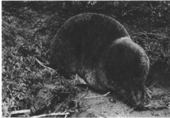
FIG. 3. Photograph of a feeding Blarina brevicauda .

species of B. brevicauda appeared later in the early Pleistocene, perhaps during the Kansan glacial, but before the origin of the two other species of Blarina ( B. carolinensis in the mid-Irvingtonian and B. hylophaga after the Wisconsinan glaciation). Continuity of gene flow between the two semispecies of B. brevicauda during the Pleistocene and Holocene and the absence of fixed chromosomal differences between the semispecies apparently prevented speciation of these phenotypes (Jones et al., 1984).