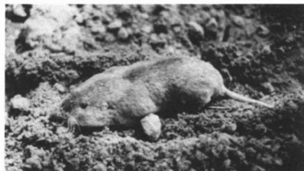
FIG. 1. Attwater's pocket gopher, Geomys attwateri, from San Patricio County, Texas.