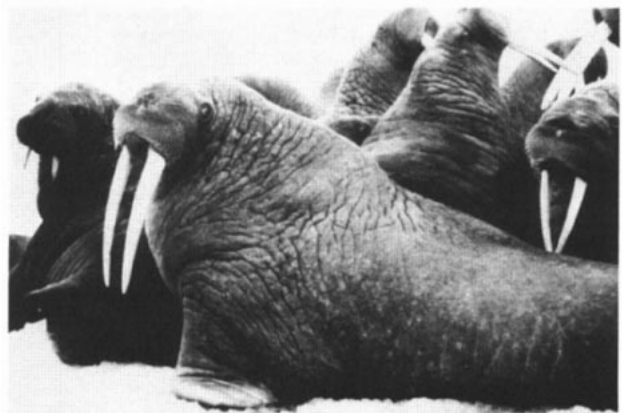
FIG. 1. A group of Pacific walrus ( Odobenus rosmarus divergens ) on an ice floe in the Bering Sea.

Adult males have paired, inflatable, pharyngeal pouches extending posterolaterad over the shoulders (Fay, 1960; Sleptsov, 1940). Testes hypodermal, somewhat scrotal; baculum is largest of any mammal, both absolutely and relatively (Fay, 1982; Scheffer and Kenyon, 1963). Seminal vesicles absent (Murie, 1871). Uterus didelphic; each horn opens separately into vagina (Burne, 1909; Cleland, 1900).