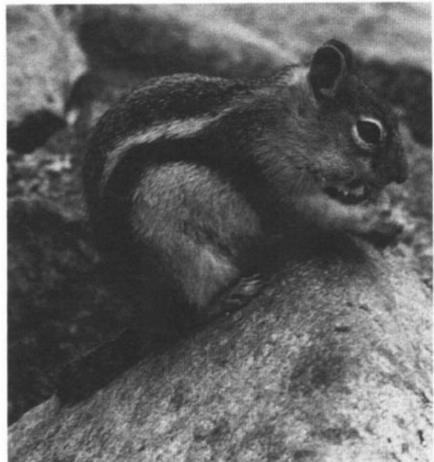
FIG. 1. Spermophilus lateralis from Lake Louise, Alberta, Canada.

DISTRIBUTION. Spermophilus lateralis occurs in the mountains of the western United States and Canada (Fig. 2; Hall, 1981), and ranges from Upper Sonoran to boreal zones (Armstrong, 1972; Grinnell, 1913). It ranges in elevation from 1,220 m in the northern Sierra Nevada of California to 3,965 m at Pikes Peak, Colorado (Hatt, 1927; Tevis, 1952).