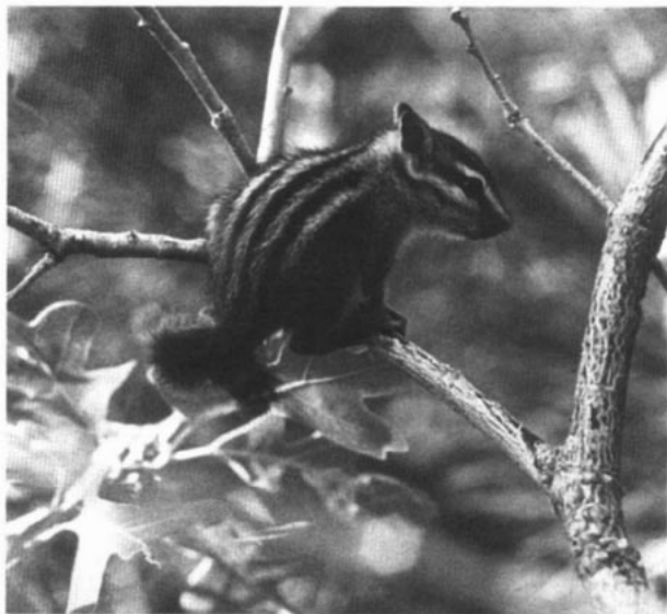
FIG. 1. A young Tamias palmeri in Kyle Canyon, Mt. Charleston, Spring Mountains, Clark Co., Nevada.

GENERAL CHARACTERS. In Nevada, differences between coloration of winter and summer pelage are greater in T.