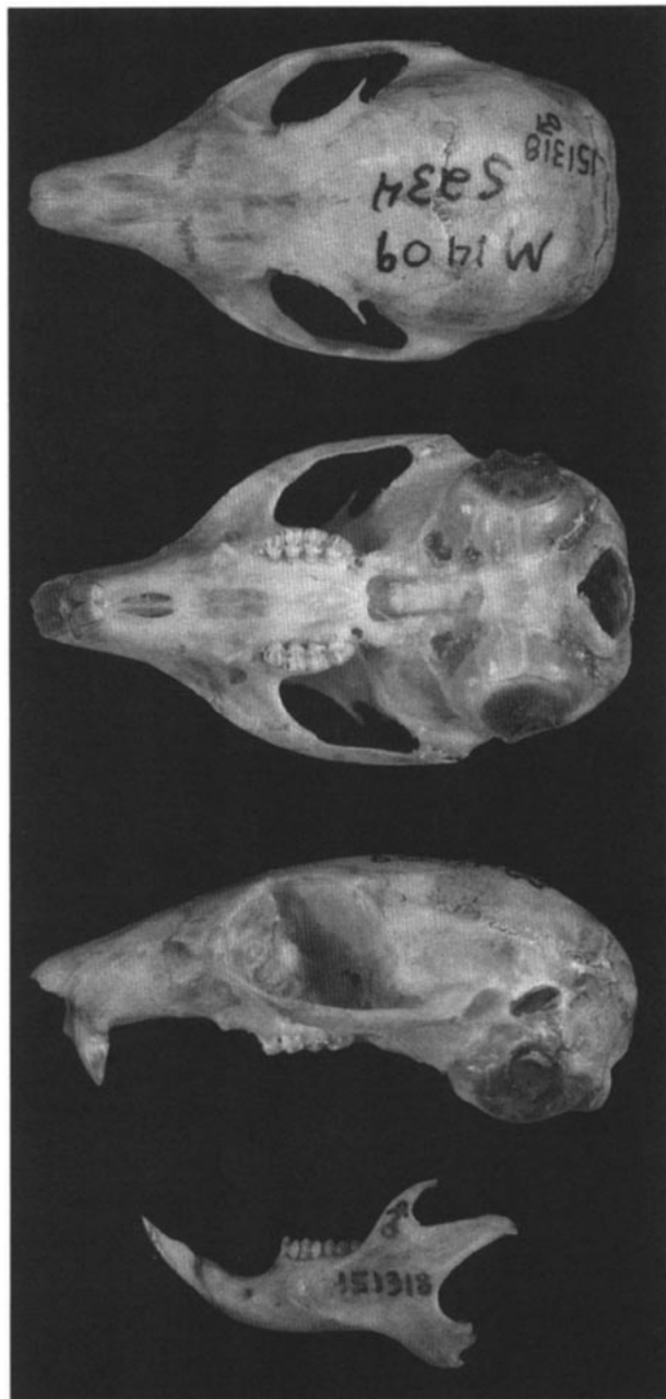
FIG. 2. Dorsal, ventral, and lateral views of cranium and lateral view of mandible of Tamias palmeri from Charleston Park on Charleston Peak, 2,400 m elev., Clark Co., Nevada (male, Museum of Vertebrate Zoology, University of California, Berkeley 151318). Greatest length of cranium is 35.5 mm.

palmeri than in T. umbrinus inyoensis , T. umbrinus nevadensis , or T. speciosus frater (Hall, 1946). In summer pelage (early July), the sides of the nose of T. palmeri are pale pinkish-cinnamon, and the top of the head is smoke gray mixed with pale pinkish-cinnamon