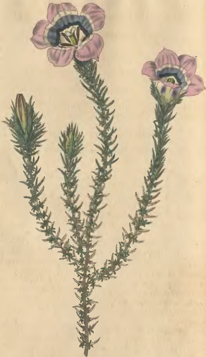
Pub. by W. Curtis Scilicet. Cressent July 1797