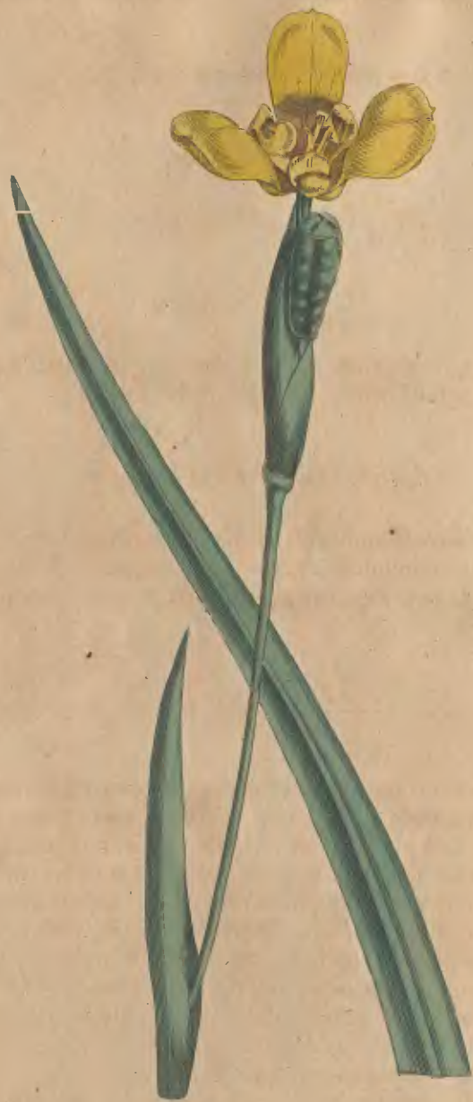
Publ. by W. Curtis Scilicet Geo. Cresser. An. 1. 1798. S. Edwards del. 1797.