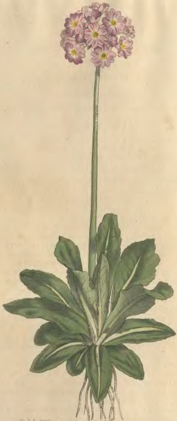
Pub. by W. Curtis Sc. Gen. Cryptog. vol. 1. 1797