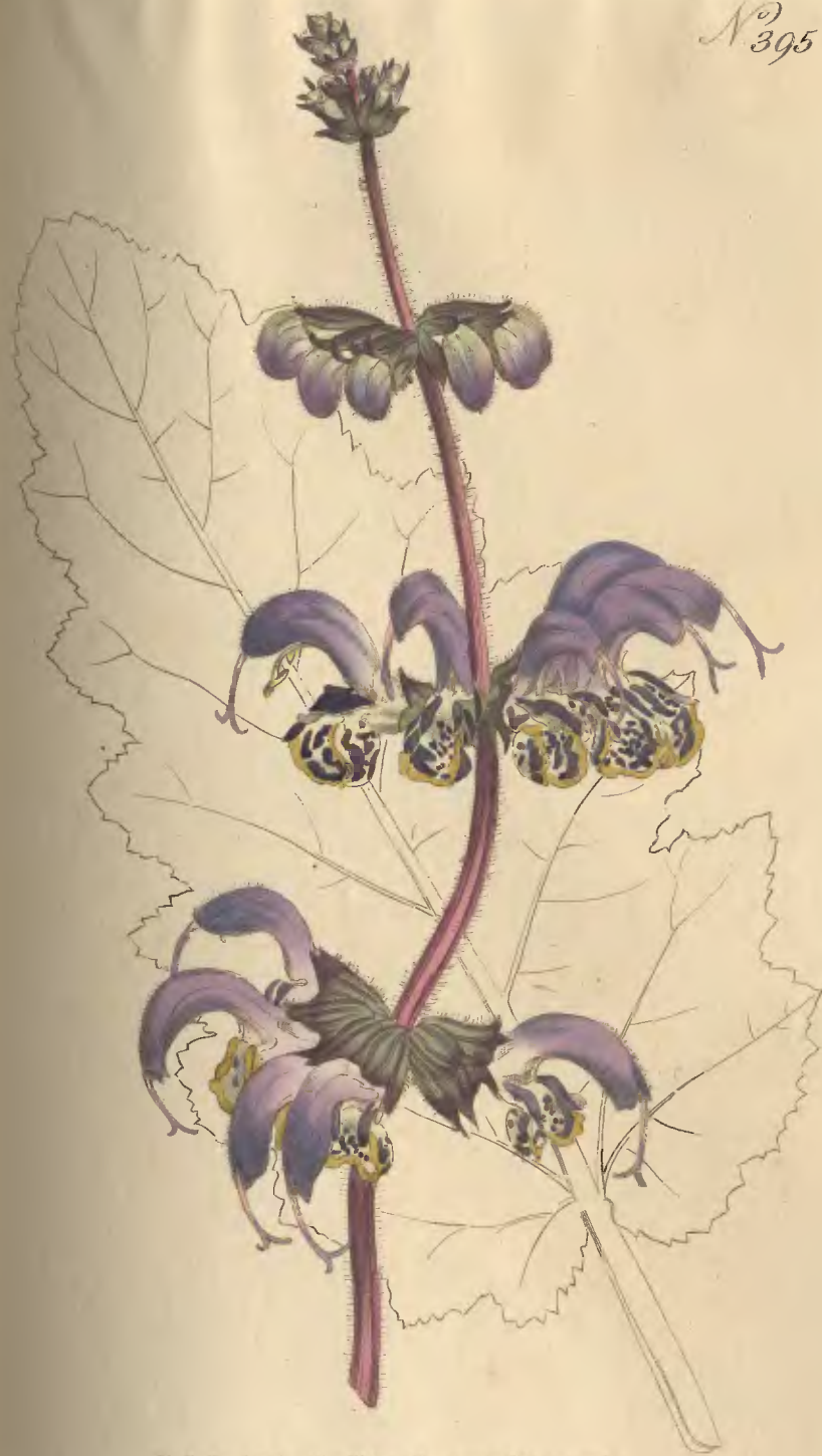
Jan. 1. 1798.