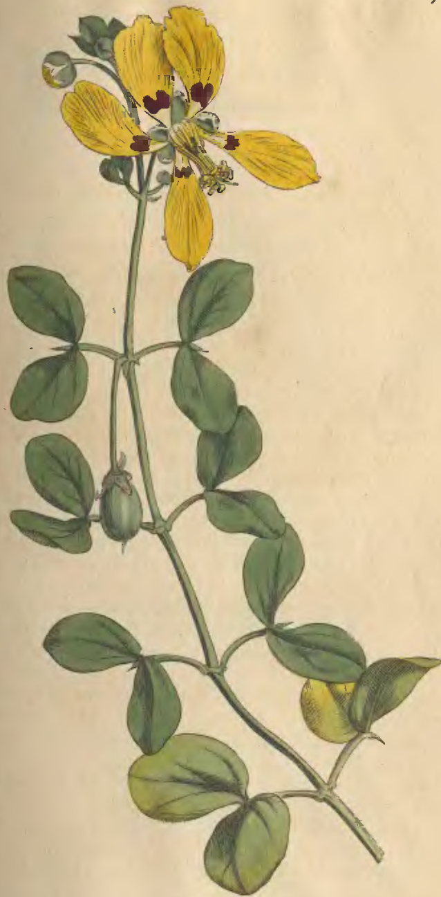
Pub. by W. Curtis. S c Geo. Crescent. May. 1. 1797

It is a green-house plant of ready growth; flowers from July to September, and is easily increased by cuttings; its unpleasant scent will prove an insuperable bar to its general introduction.