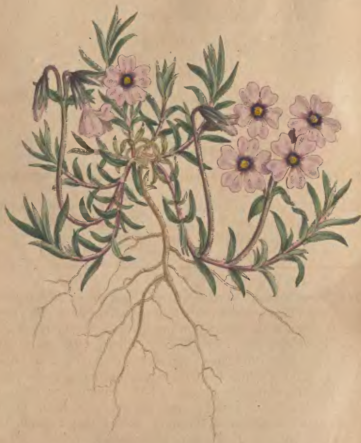
Pub. by W. Curtis, 57 Great Crescent, June 1, 1798