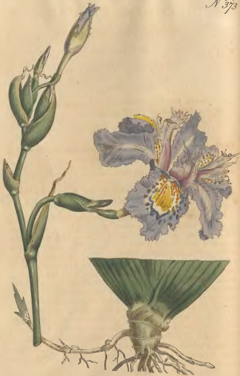
Pub. by W. Curtis Sc. Geo. Crescent. June 1. 1797