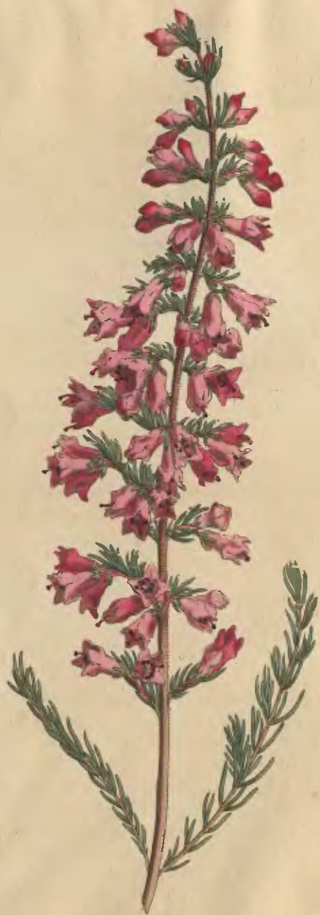
Pub. by W. Curtis, St. Geo. Crescent, Nov. 1, 1797.