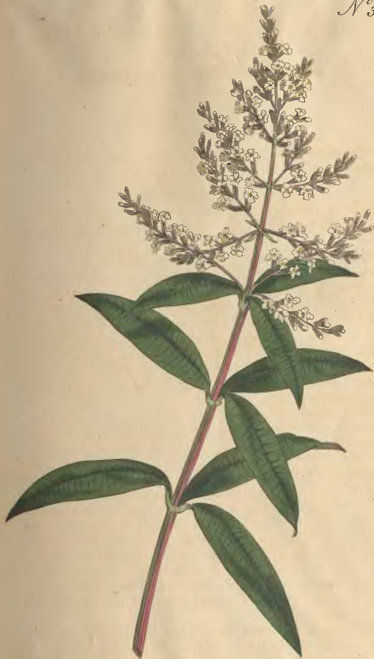
Pub. by W. Curtis Sc. Gra. Crescent Apr. 1797.

This shrub, being easily propagated by cuttings, is now become common in the neighbourhood of London, where it is treated as a greenhouse plant; in some parts of this island, especially near the sea, where the winter loses much of its severity, it would, in all probability, succeed very well in the open border.