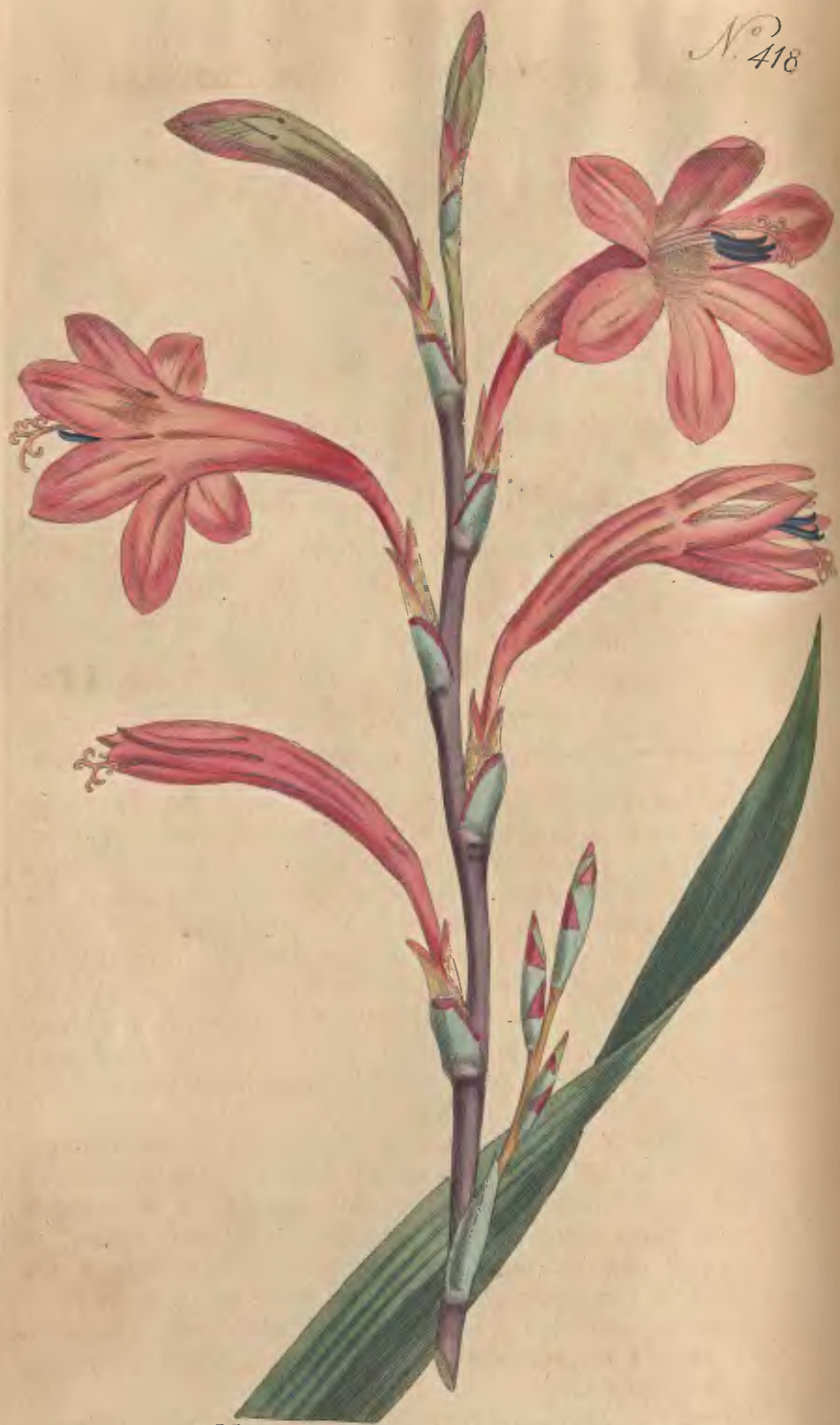
Pub. by W. Curtis. N o 600. Crypt. Cent. Sep. 1. 1798. Ed. de la Société de l'Éducation.