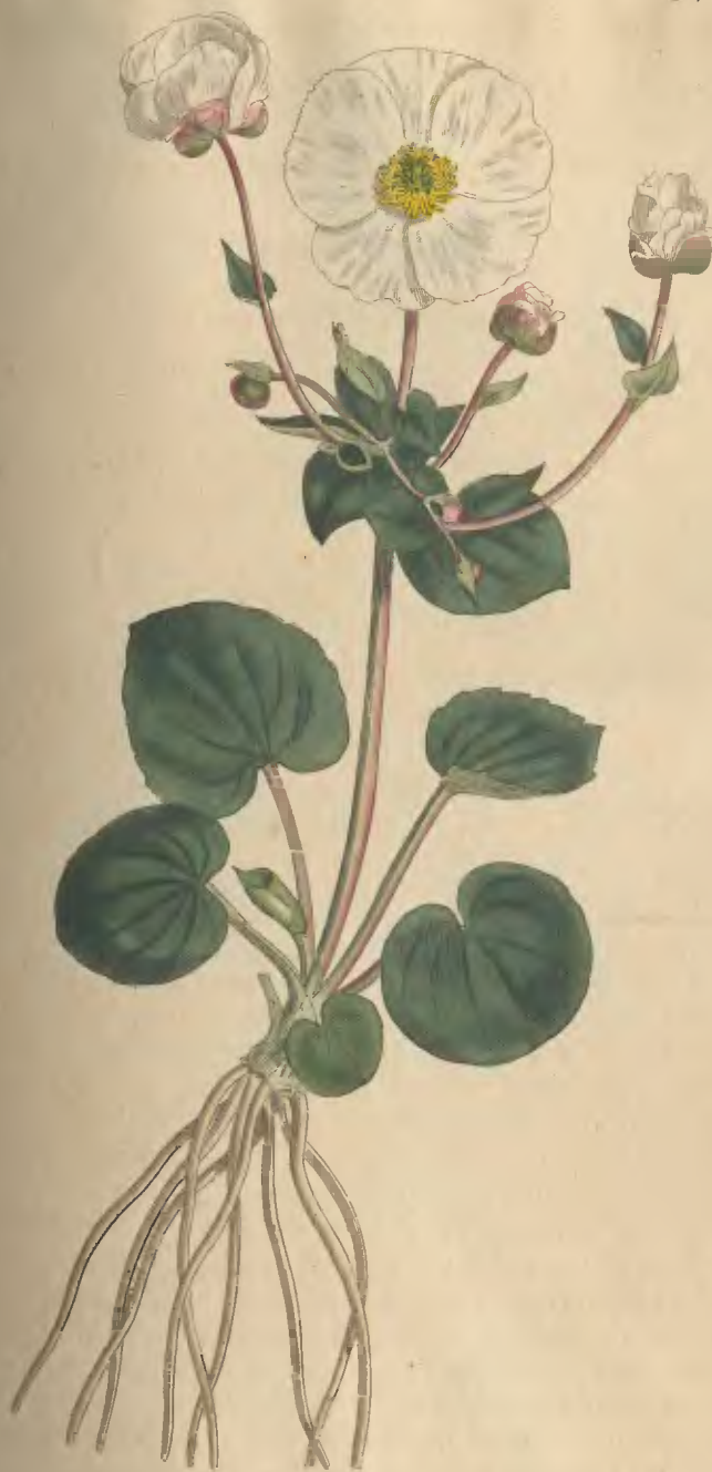
Pub. by W. Chertie St Geo. Crescent Oct. 1. 1797