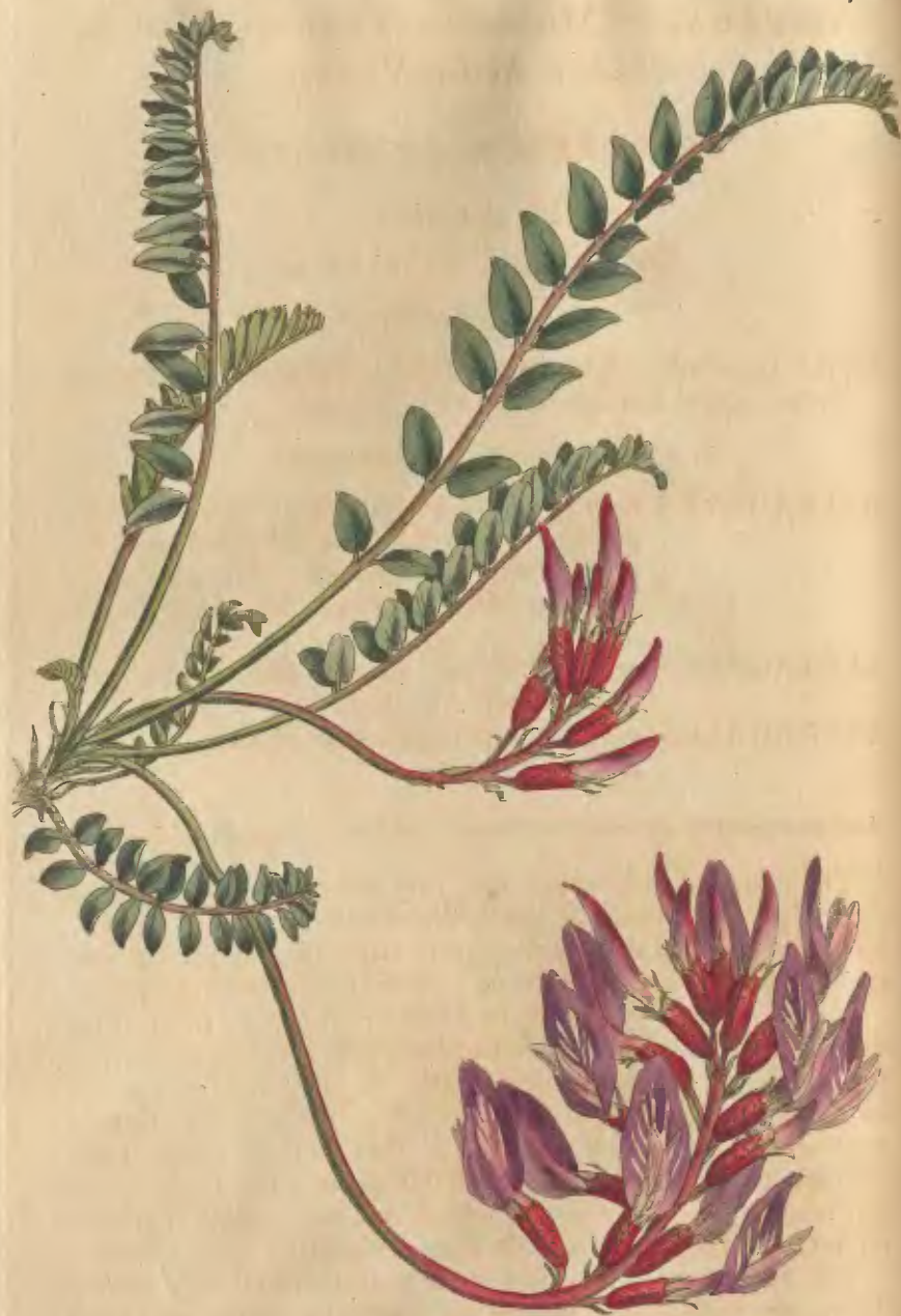
Pub. by W. Curtis sculp. Geo. Craymont July 1 1797