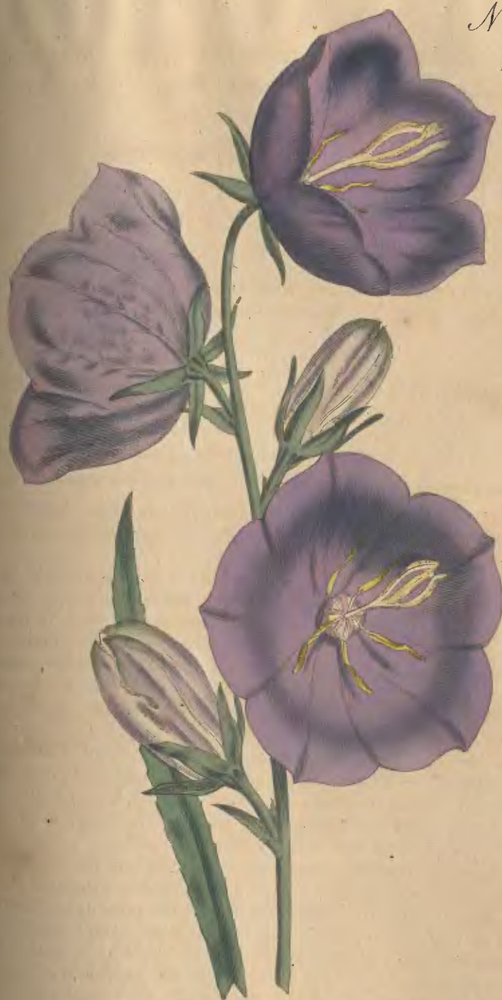
Pub. by W. Curtis s r Geo. Cr. Gent. Feb. 1. 1798.

In a moist rich soil, it will acquire the height of three or four feet, and produce during the months of August and September abundance of flowers truly magnificent.