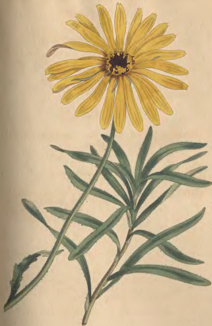
Pub. by W. Curtis Sculp. Crayon May 1798.

The only account we have of this plant is in the Hort. Kew. of Mr. AITON, where it is first described.