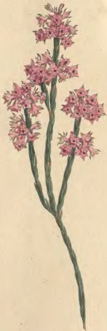
Pub. by W. Curtis Sc o Geo. Orfeene Oct. 7. 1798. S. Edwards del. & Scaph o