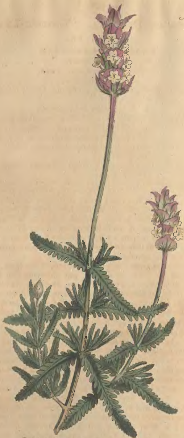
Pub. by W. Currier & Co. Englewood, N.J. 1798.