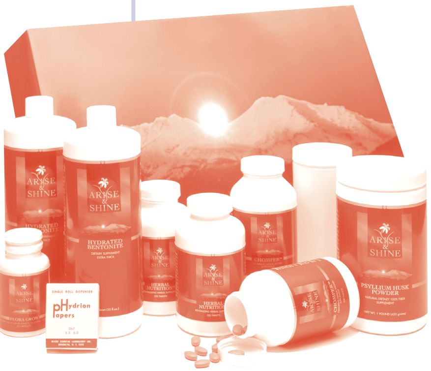
The Complete Cleanse Kit

Chomper and Herbal Nutrition are the driving force behind the Cleanse Thyself Program. These two products soften and break up the mucoid plaque and help remove toxic waste from the alimentary canal, and all other organs and cells. For maximum results these two formulas must be used together.