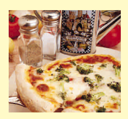
Bisignano Spinach, 49 Italian-Style Cauliflower, 50