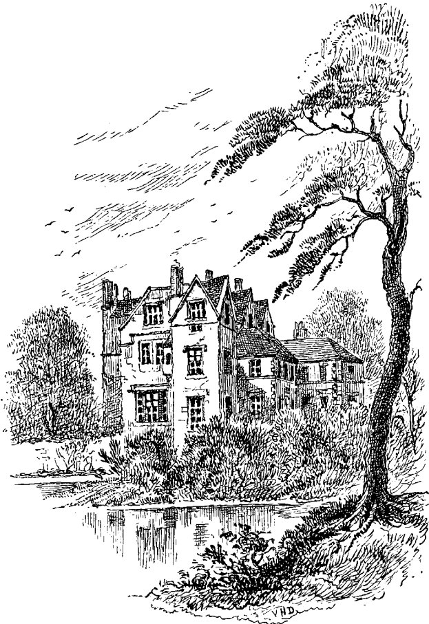
BREADSALL PRIORY, WHERE ERASMUS DARWIN DIED.