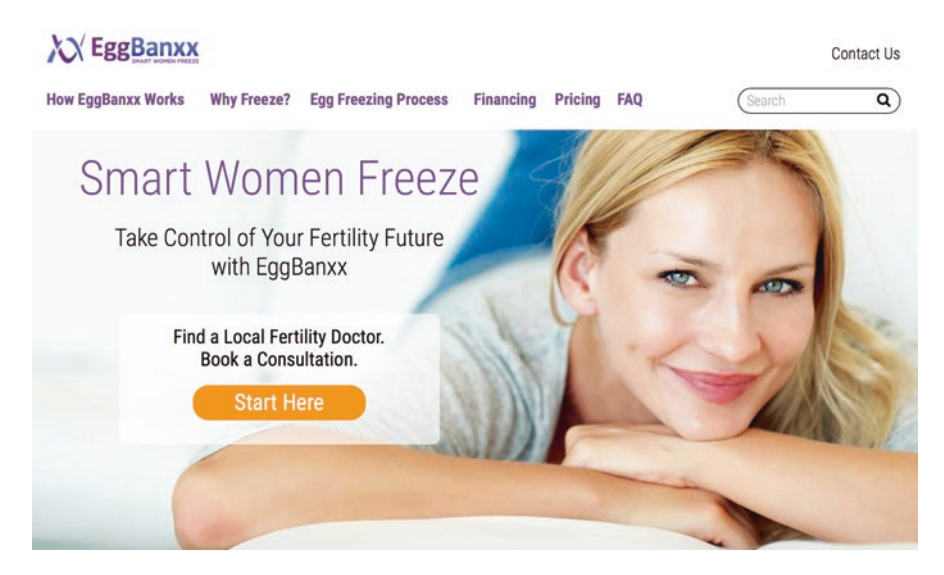
Illustration A https://www.eggbanxx.com

embryos, the eggs are frozen—usually through a technique known as vitrification. The frozen eggs are then stored until such time as the woman wants to attempt fertilization and pregnancy.