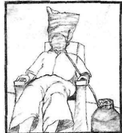
Fasten strap snugly around the neck and inhale deeply. Keep gas flowing steadily until tank is empty. Patient dies in 5-15 minutes.