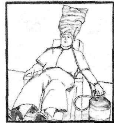
Lean back and turn the gas valve partway open to a gentle flow. Bag gradually fully inflates with pure helium above the head.