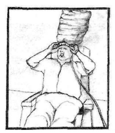
Completely exhale air in lungs, hold breath, and then quickly pull the bag down to neck.