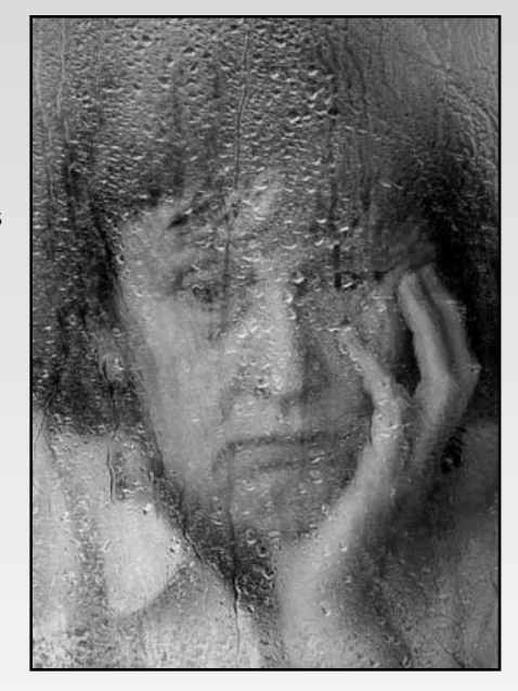
Many atheists, including me have cared, and wanted to help the homeless in Austin.

We are trying to have a give-away event about once a month as donations allow. We have been told that they appreciate our being secular. Some have expressed that the "Jesus thing was overwhelming," and we are "doing it as it should be."