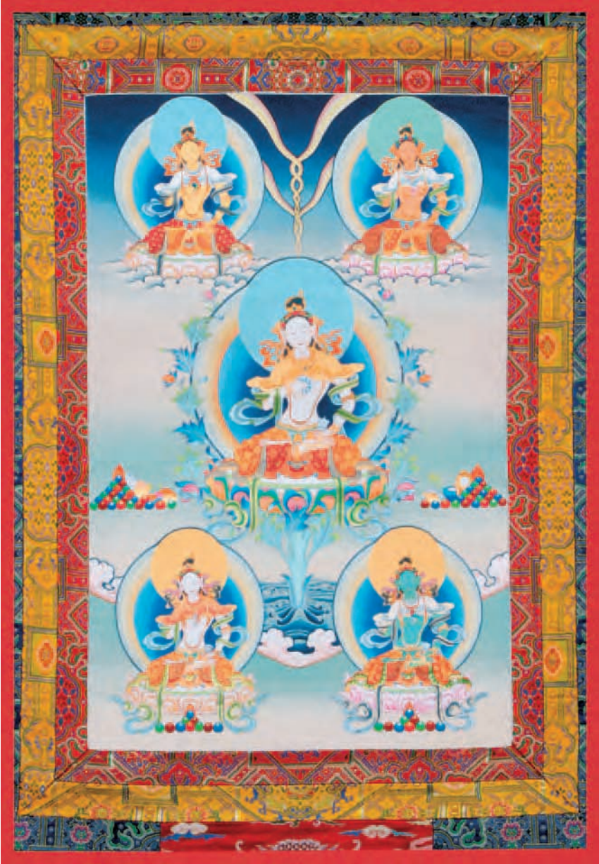
5. Five Female Buddhas, thangka painting by disciples of master painter Gega Lama, Nepal