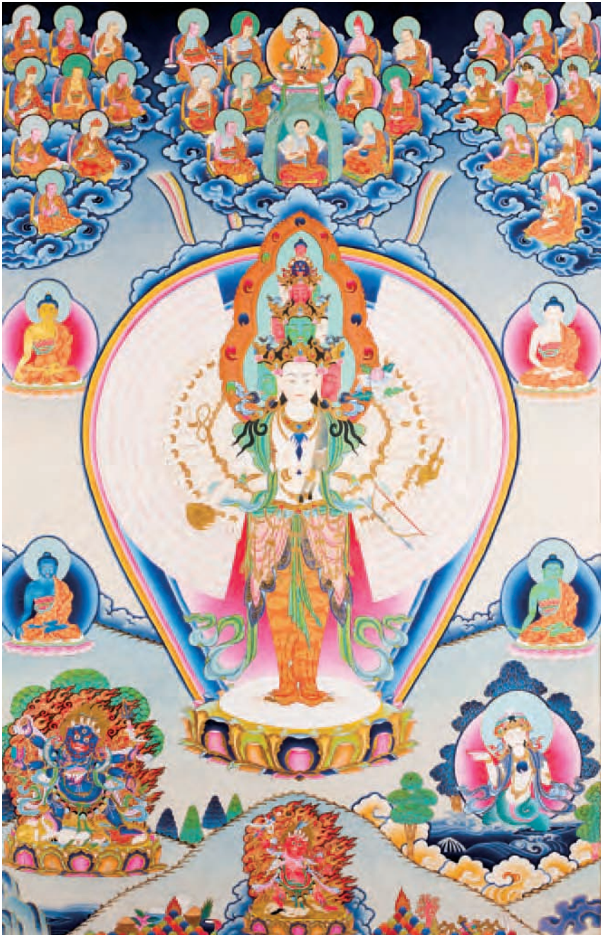
2. Thousand-Armed Chenrezig, thangka painting by disciples of master painter Gega Lama, Nepal