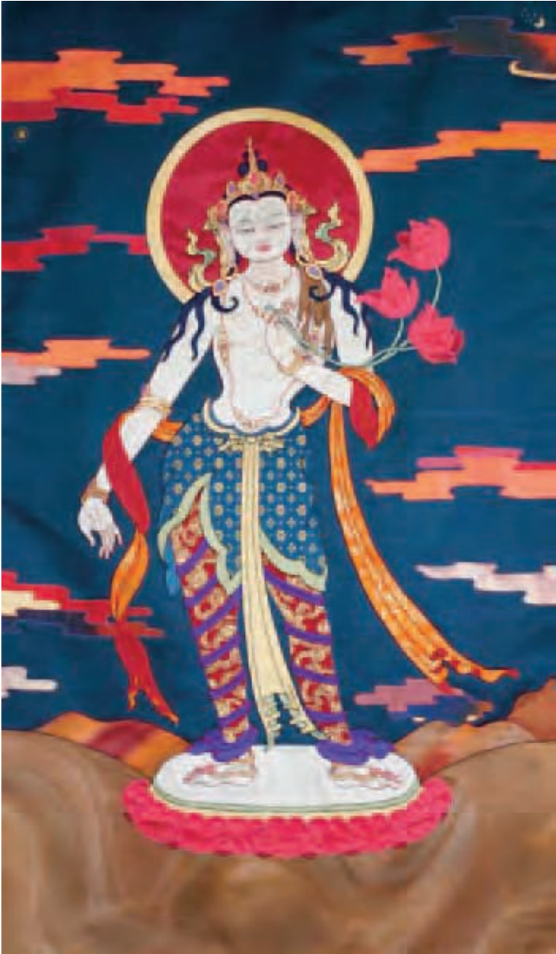
7. Padmapani (Two-Armed Chenrezig): Pieced silk thangka made by Leslie Rinchen-Wongmo, California, www.silkthangka.com