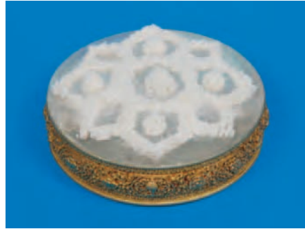
9. Rice Mandala