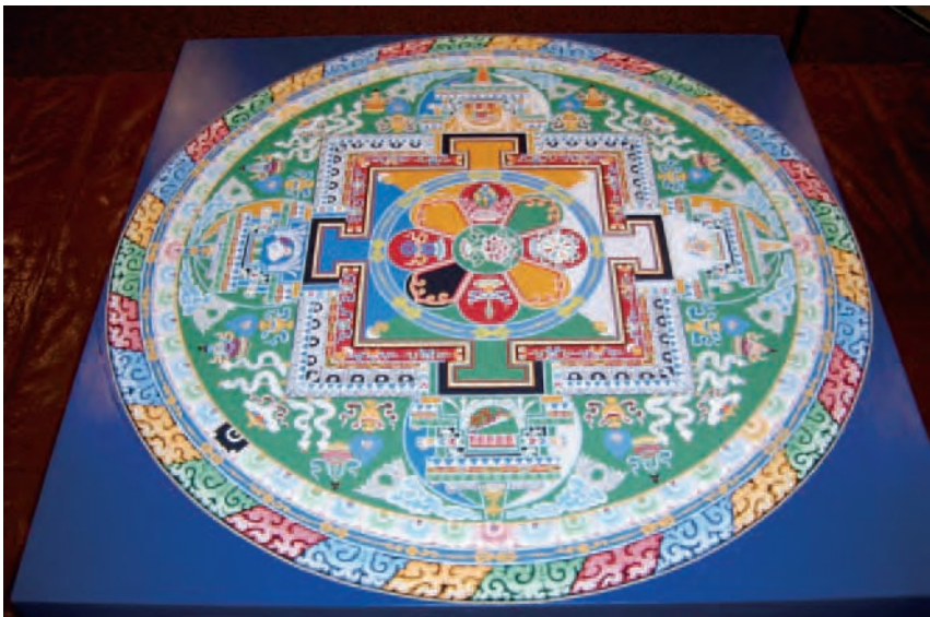
10. Thousand-Armed Chenrezig Sand Mandala