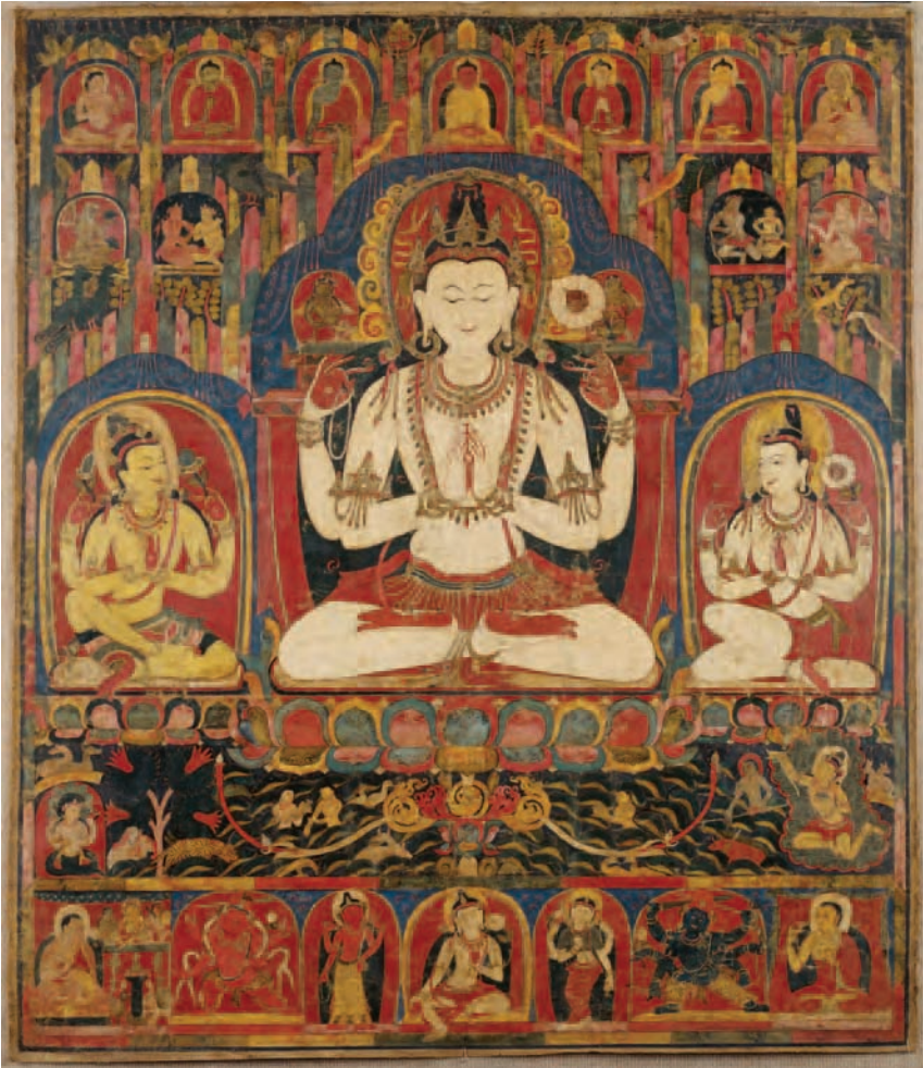
6. Shadakshari Triad and Other Deities (Triple Manifestation of the Six-Syllable Mantra)