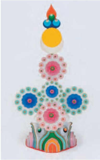
8. Chenrezig Torma