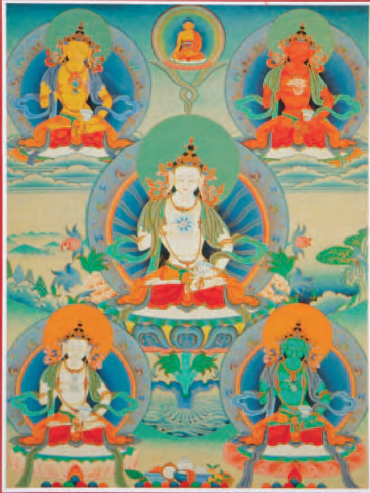
4. Five Dhyani Buddhas, thangka painting by disciples of master painter Gega Lama, Nepal