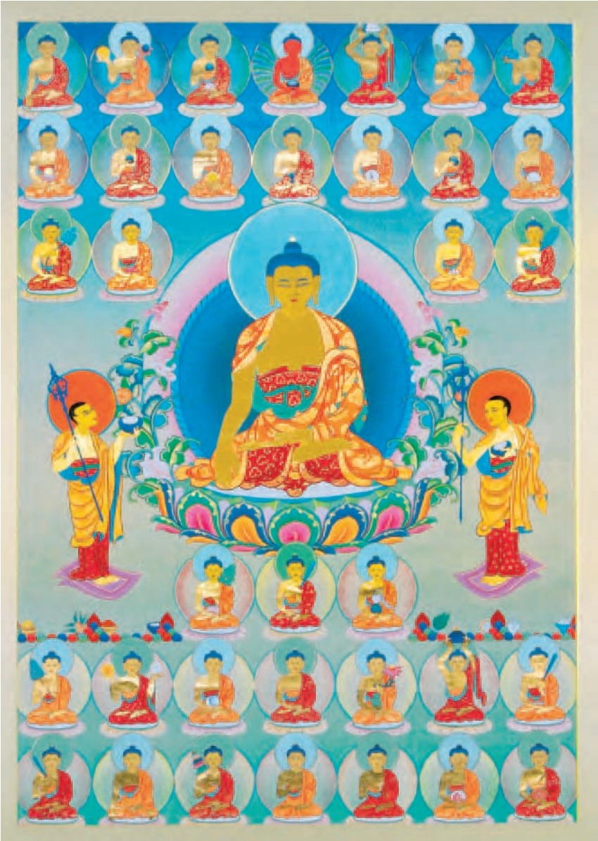
1. Thirty-five Buddhas, thangka painting by disciples of master painter Gega Lama, Nepal