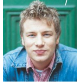
JAMIE OLIVER THE NAKED CHEF 2