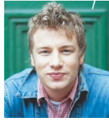
JAMIE OLIVER THE NAKED CHEF 2