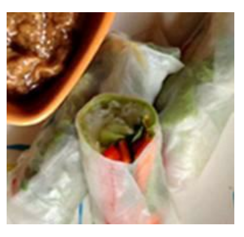
Peanut Sauce Ingredients:

The following recipe yields eight spicy rolls over which your taste buds will celebrate with joy.