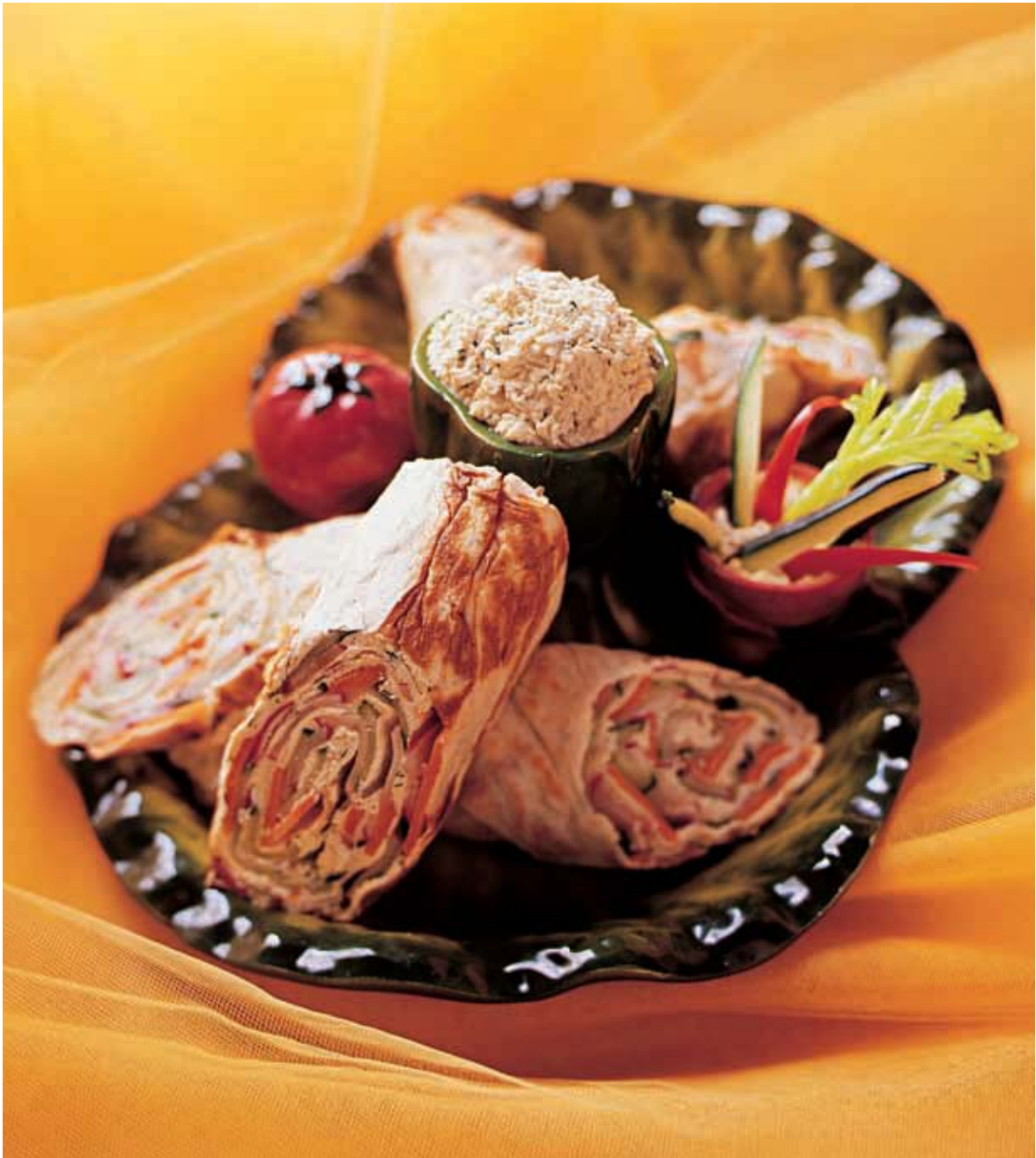
Tofu Boursin (page 154), Tofu Boursin Lavosh (page 154).