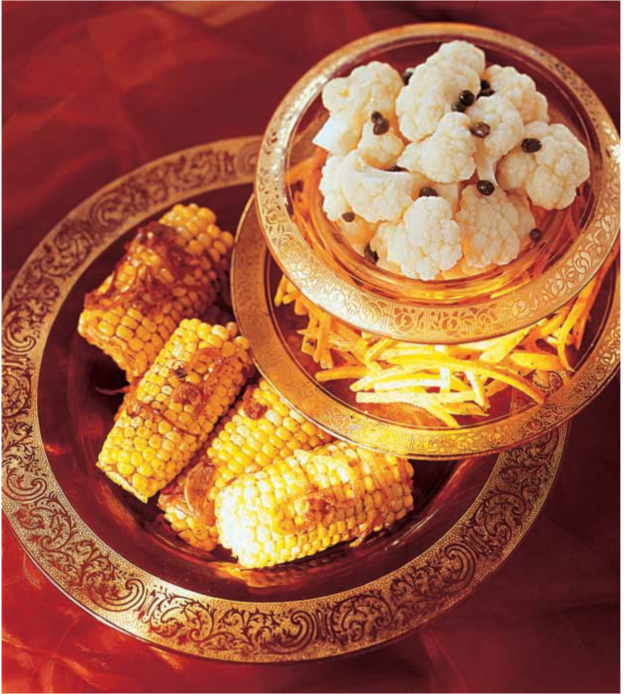
Top right to bottom left: Cauliflower with Capers (page 218), Tunisian Carrot Salad (page 217), Spicy Corn on the Cob (page 219).