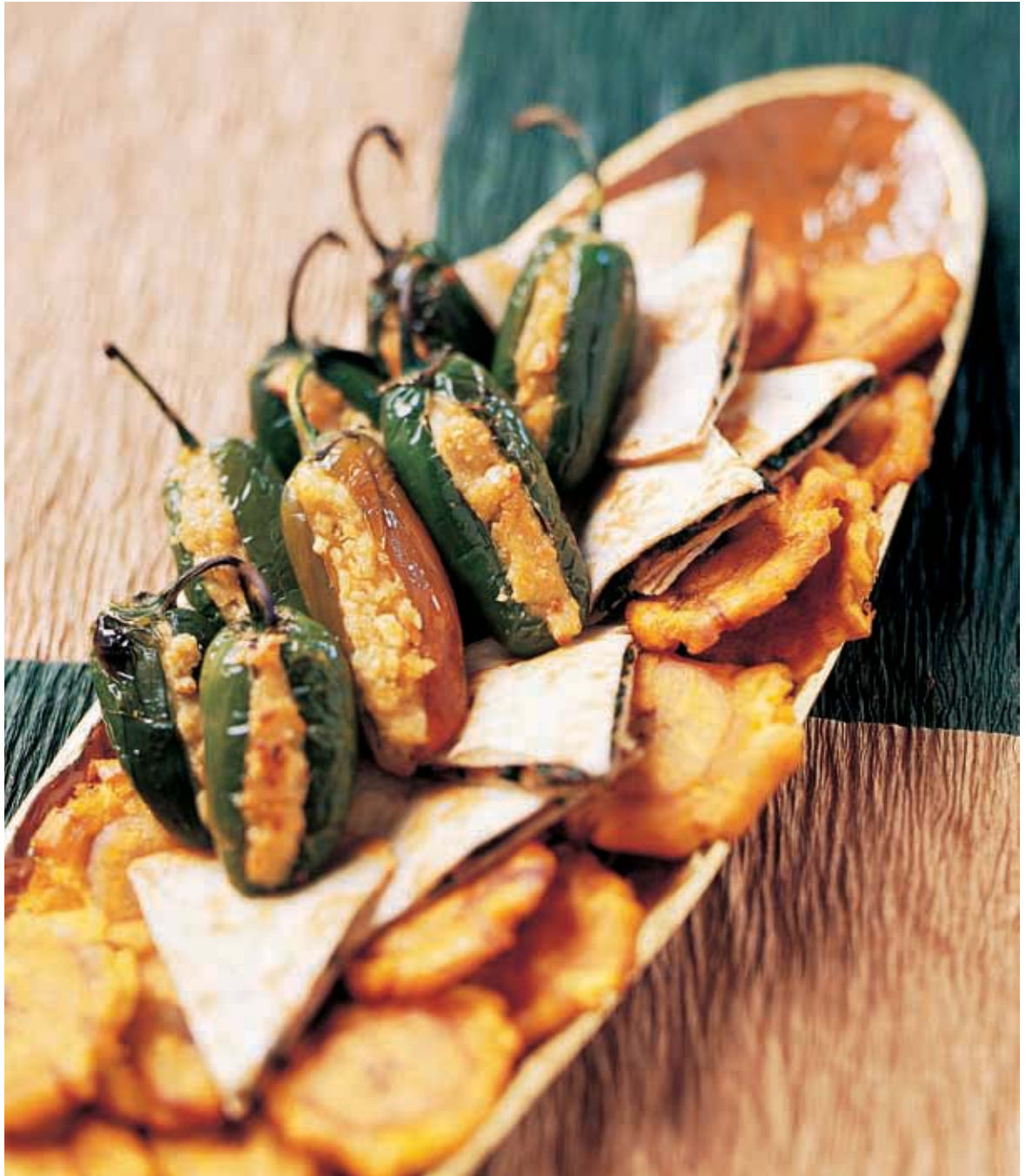
Vegan Chilies Rellenos (page 58), Spinach and Mushroom Quesadillas (page 53), Tostones (page 51).