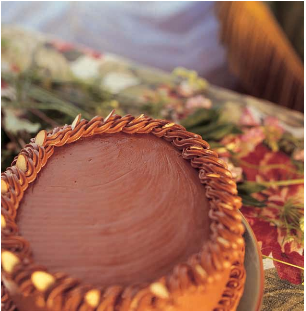
Company Chocolate Cake (page 292) with Chocolate Icing (page 297) and toasted almonds.