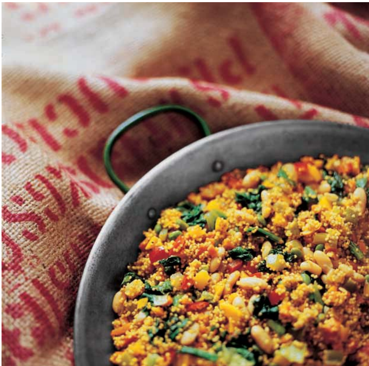
Millet Paella (page 174).