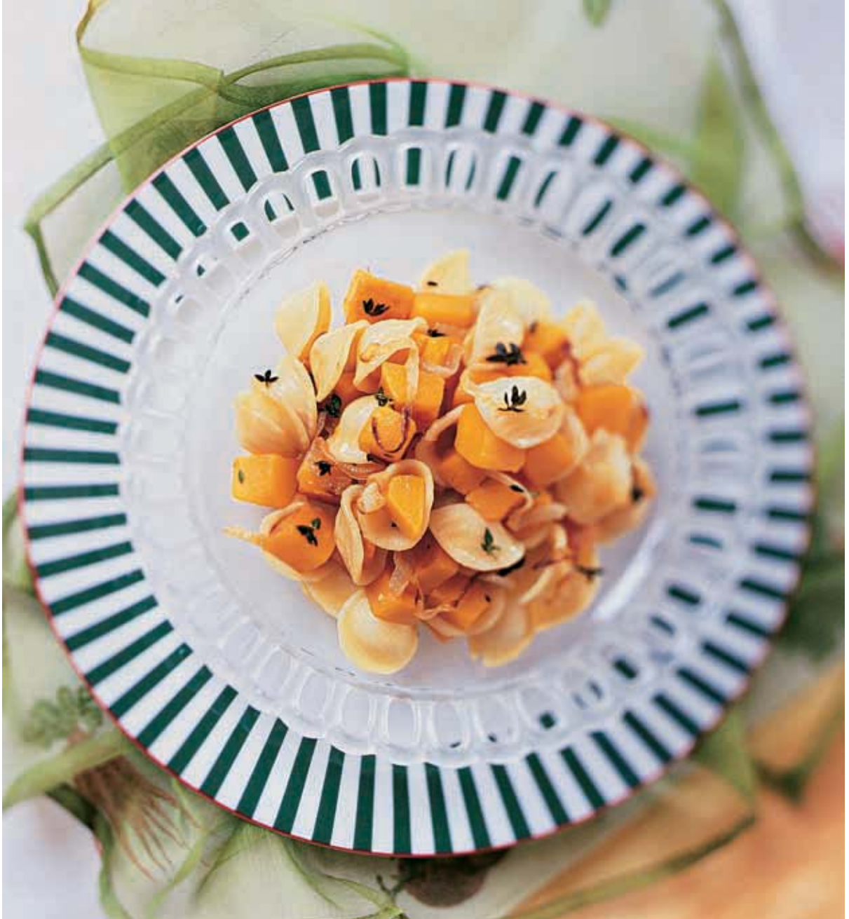
Orrechiette with Butternut Squash and Thyme (page 187).