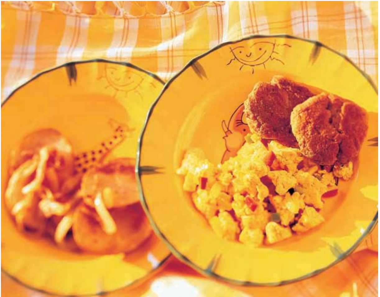
Hash Browns (page 278), Scrambled Tofu (page 275), Country-Style Tempah Sausages (page 277).