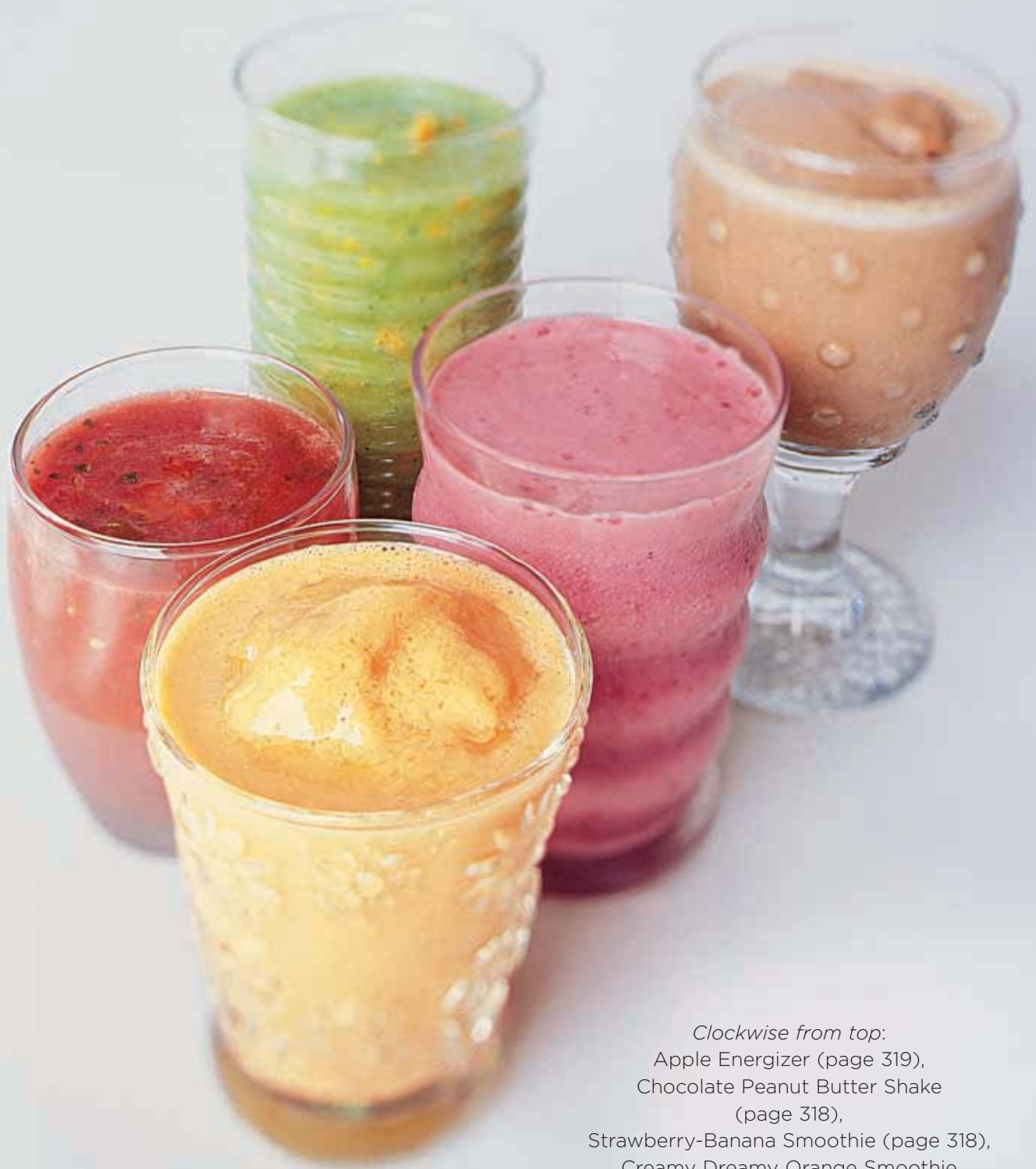
Clockwise from top: Apple Energizer (page 319), Chocolate Peanut Butter Shake (page 318), Strawberry-Banana Smoothie (page 318), Creamy Dreamy Orange Smoothie (page 318), V-5 (page 320).