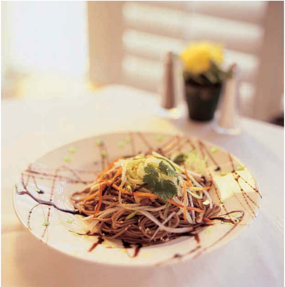
Chilled Soba Noodles on Painted Plates (page 200).