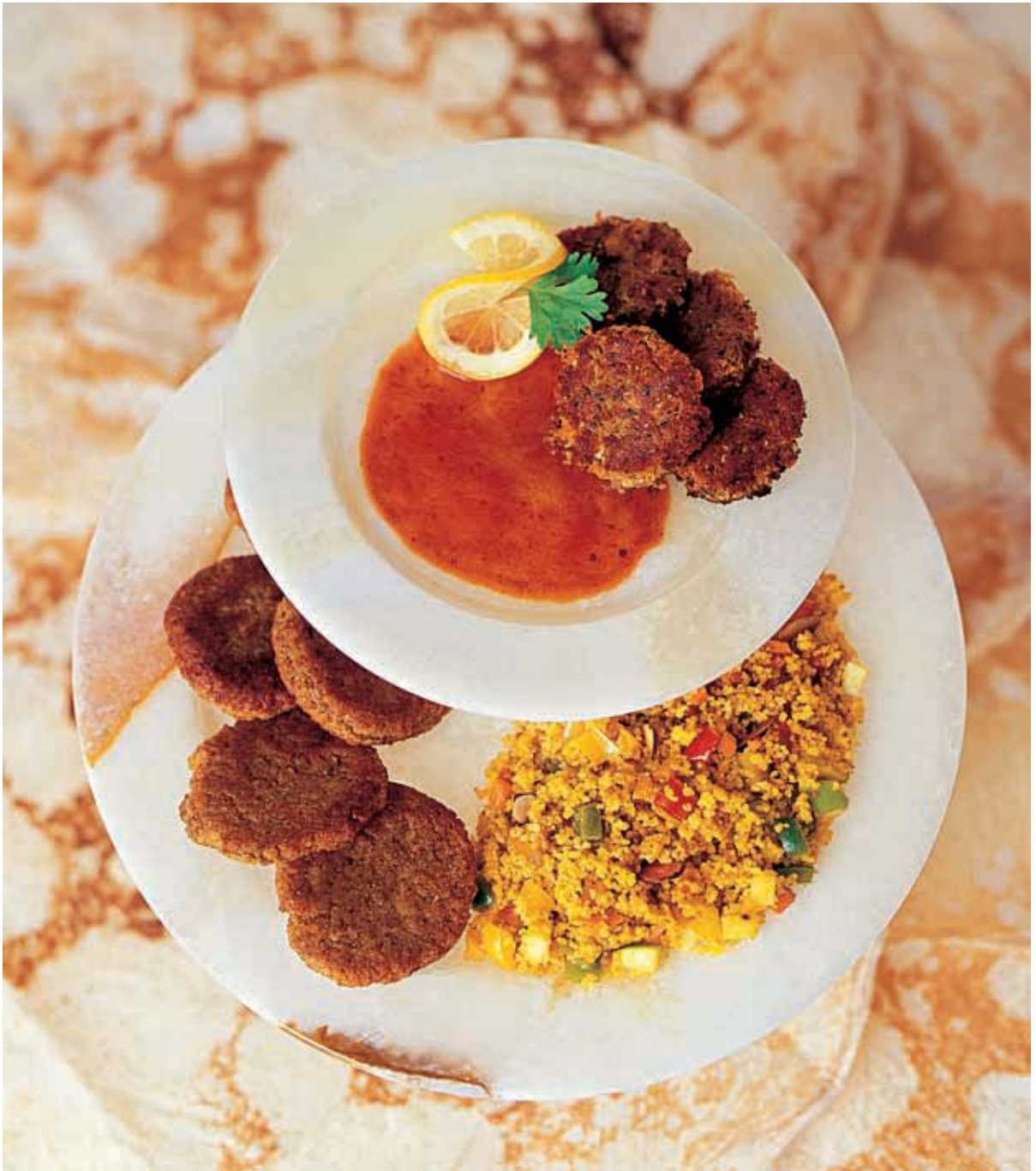
Top plate: Sweet Potato Falafel (page 52), Harissa Dipping Sauce (page 139). Bottom plate: Chickpea Kibbeh (page 171), Curried Couscous (page 196).