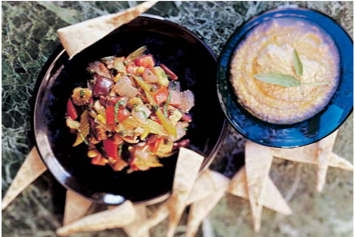
Caponata (page 46), Tuscan White Bean Spread (page 43).