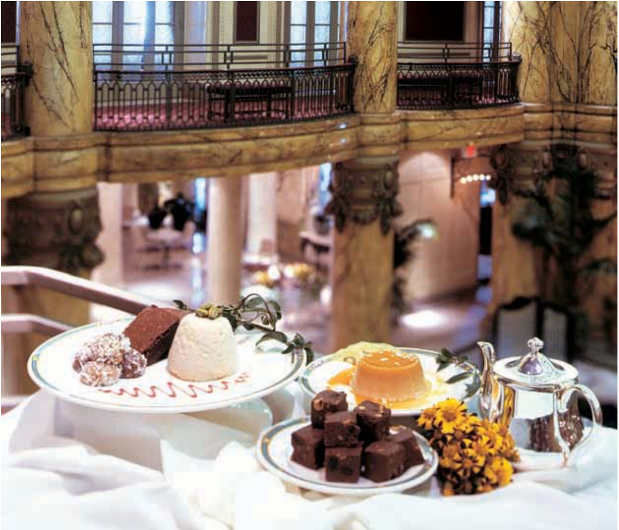
Large plate on left: Peanut Butter Candy (page 303), Chocolate Peanut Butter Candy (page 303), Brownies (page 300), Lebanese Rice Pudding (page 304). Small plate in back: Coconut Flan (page 306). Small plate in front: Chocolate Raisin Fudge (page 302).