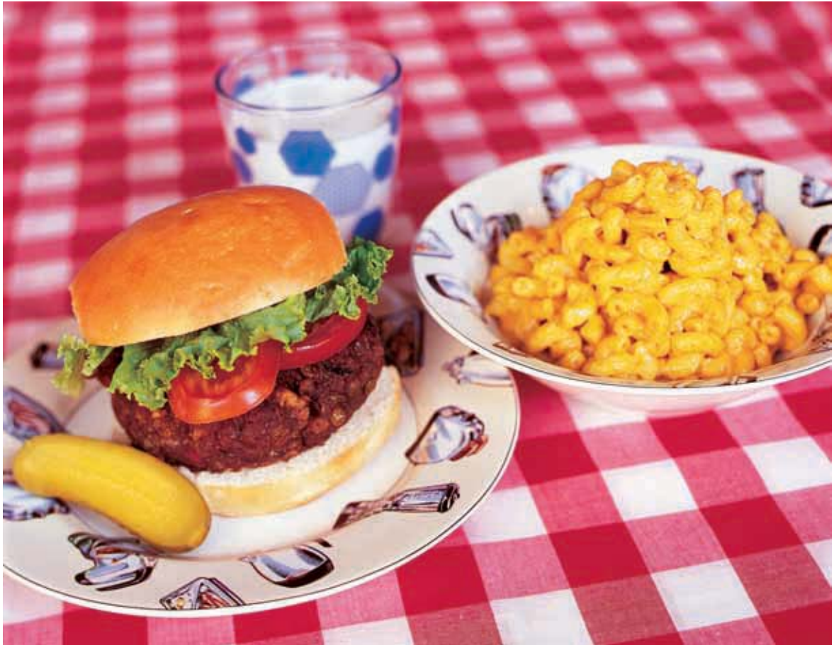
Sun-Dried Tomato and Lentil Burgers (page 155), Macaroni and Cheese (page 193).

Next page, clockwise from top: Corn Chowder (page 81), Spicy Sweet Potato Soup (page 73), Vegetable Soup with Lemon and Dill (page 79).