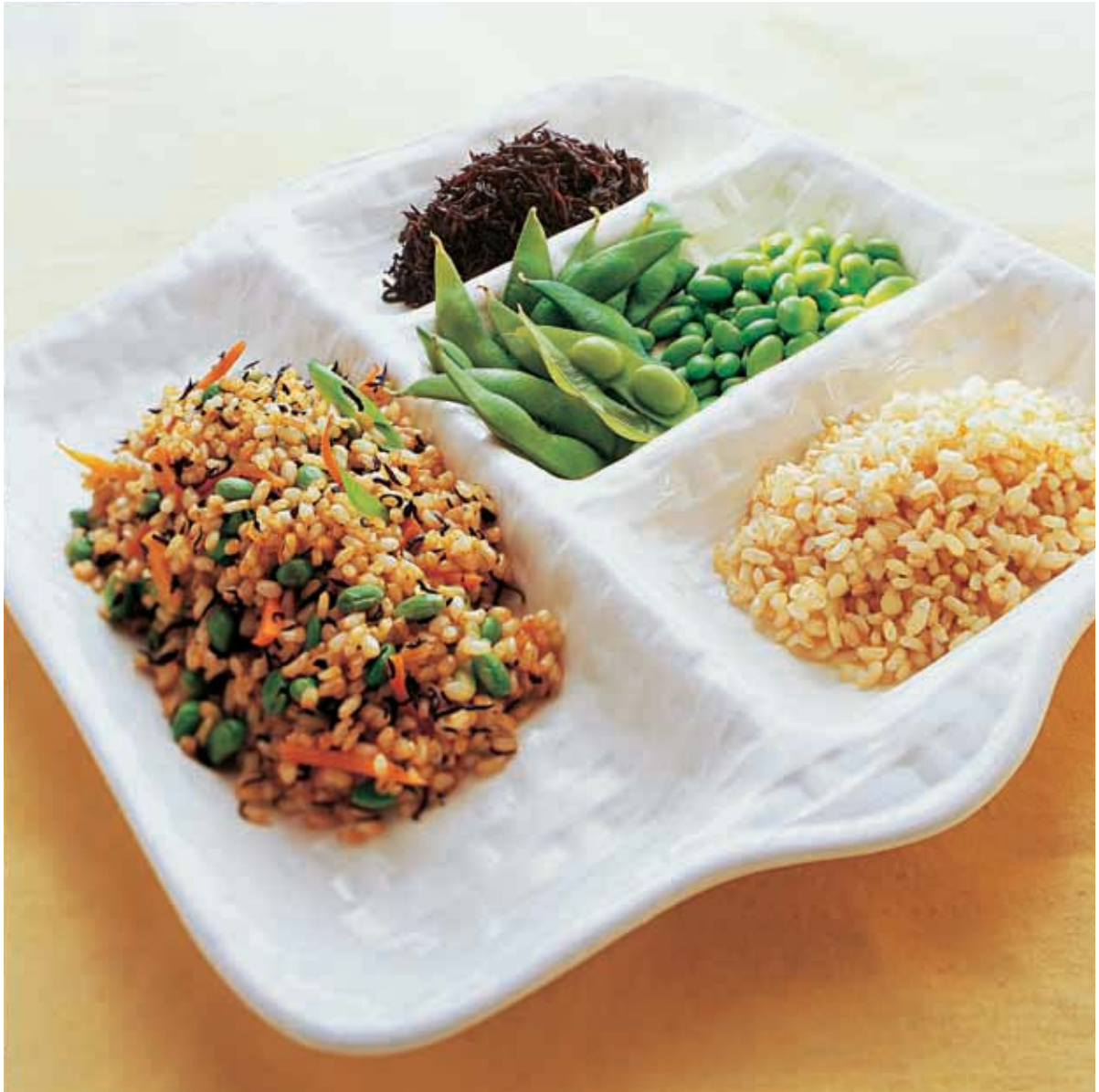
Clockwise from top: Hijiki, edamame in the pod and shelled, brown rice, Edamame with Hijiki and Brown Rice (page 249).