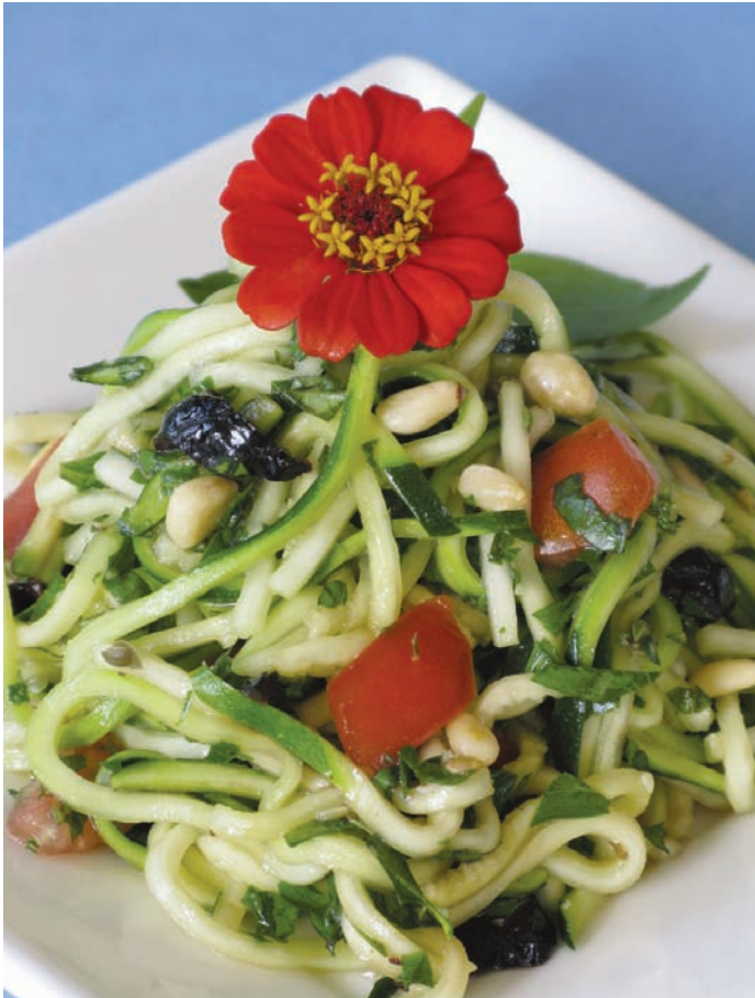
Raw Pasta Puttanesca • page 202