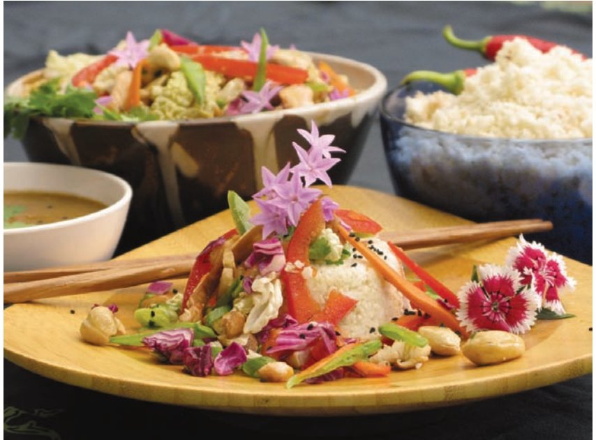
Live Un-Stir-Fry with Cauliflower Rice • page 198