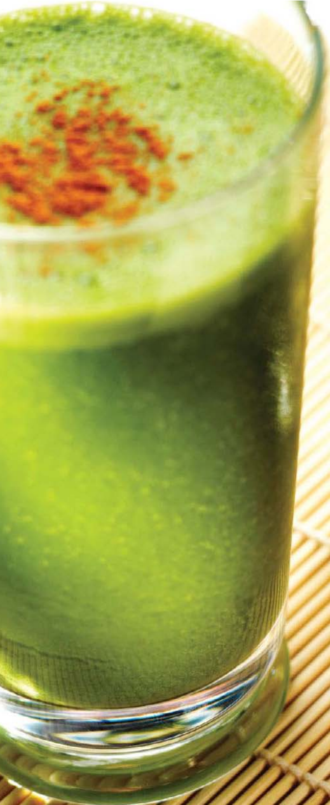
> ZenMatcha Power Shake 158