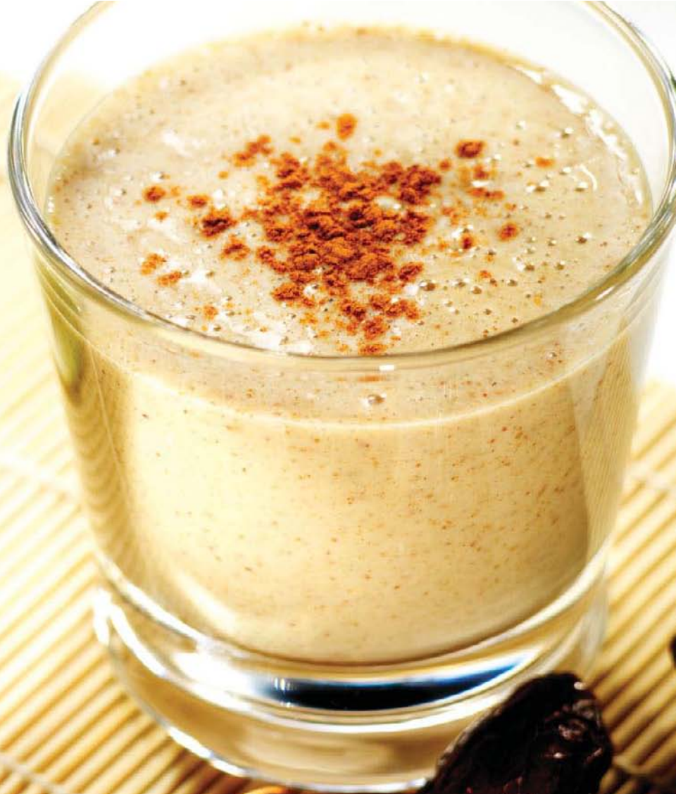
> Date Almond Power Shake 163