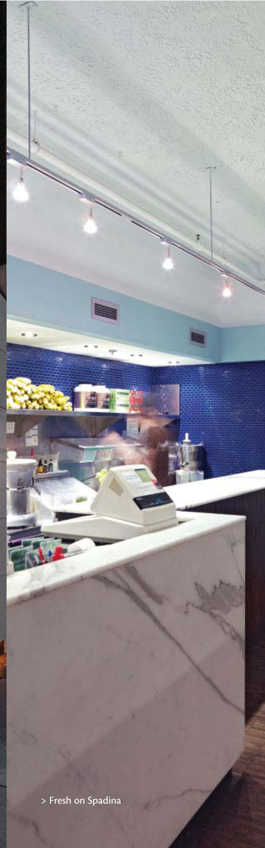
> Fresh on Spadina