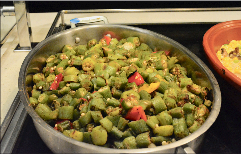
PLATED / PRESENTATION / INGREDIENTS