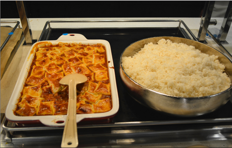
PLATED / PRESENTATION / INGREDIENTS