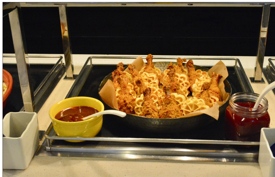
PLATED / PRESENTATION / INGREDIENTS