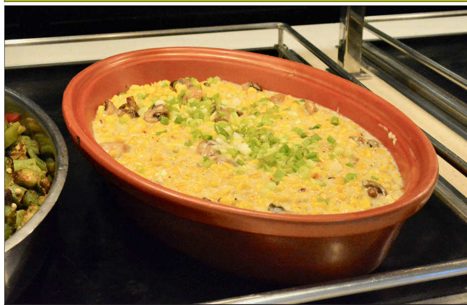
PLATED / PRESENTATION / INGREDIENTS